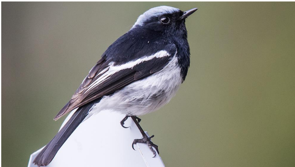
Male Blue-capped redstart

The national park is located just south of Almaty in the Tien Shan Mountains. Most target birds for the area are reachable after an hour in car, and the only road necessary to take is the one from Almaty up to Cosmostation via Big Almaty lake. The spruce forest around our hotel, the Alpen Rose, produced many interesting species. We heard White's thrush from the hotels parking lot every night as well as Boreal owl . A pair of Azure tits where building close to the hotel. In a small stream along the road, we saw a pair of Blue whistling thrush building a nest under a rock in the stream and a Brown dipper pasted by. Everywhere in the spruce forest Hume's leaf and Greenish warblers sang together with Black-throated accentors , Blue-capped and Evermann's redstarts .