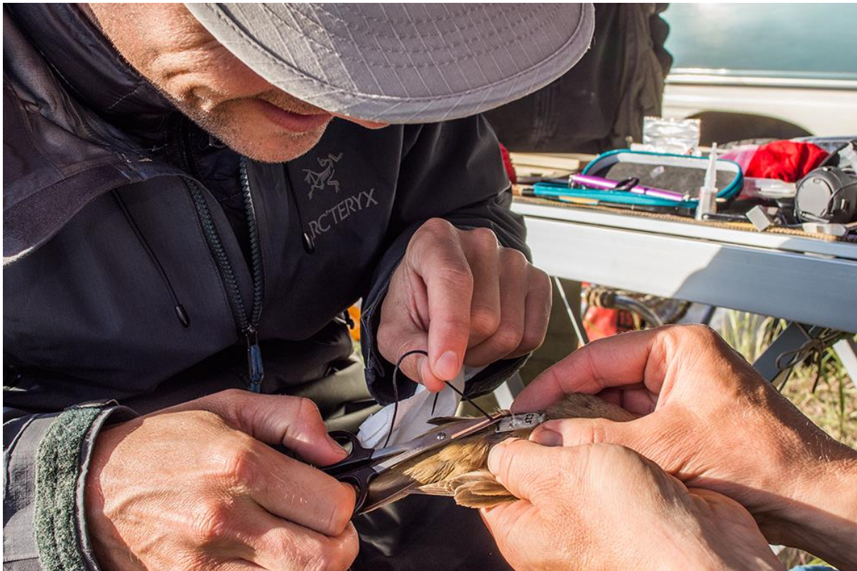
Light logger successfully added to a GRW