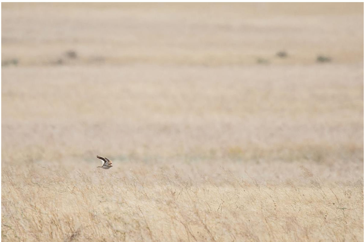
One more picture of the amazing White-winged lark south of Kanshangel