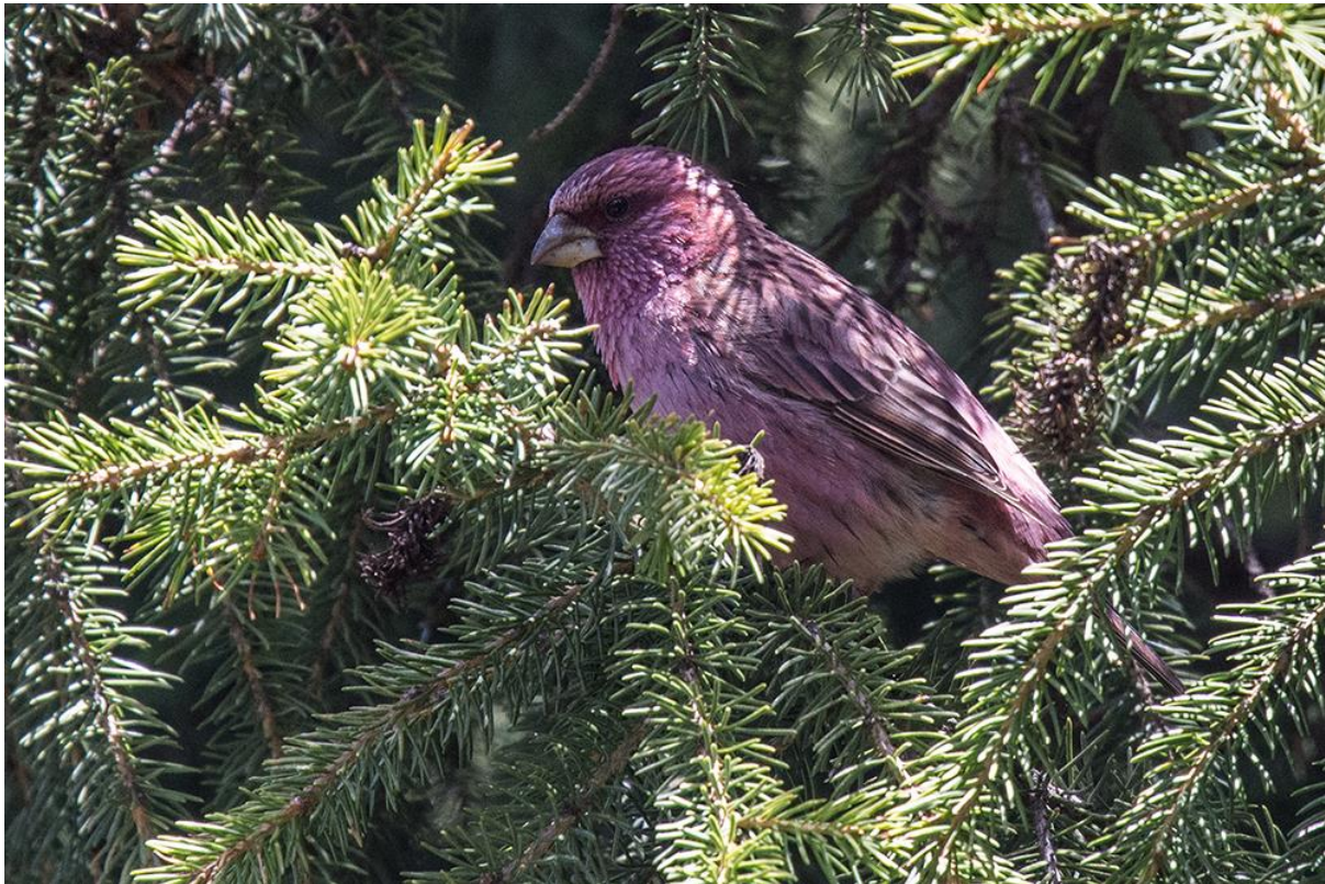
A beautiful male Red-fronted rosefinch in a spruce