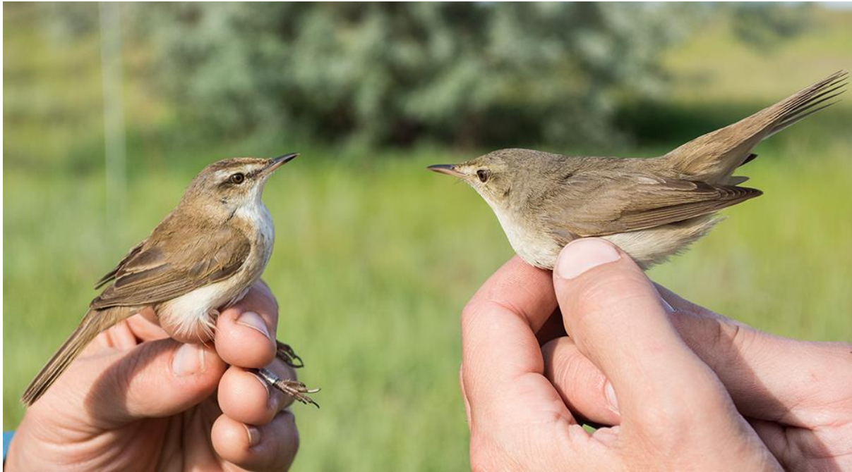
Paddyfield warbler to the left and Blyth's reed warbler to the right

156. Blyth's Reed Warbler Acrocephalus dumetorum Extremely common in reeds at Sorbulak lake system and the species we caught most of. In addition, several were heard in the mountains and Zhel'turanga