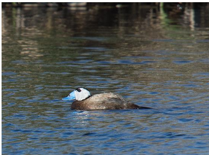
Male White-headed duck