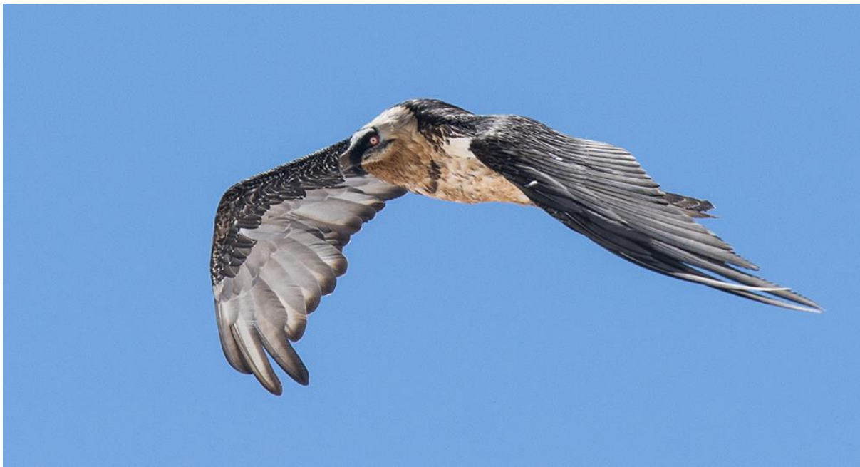
Adult Bearded vulture