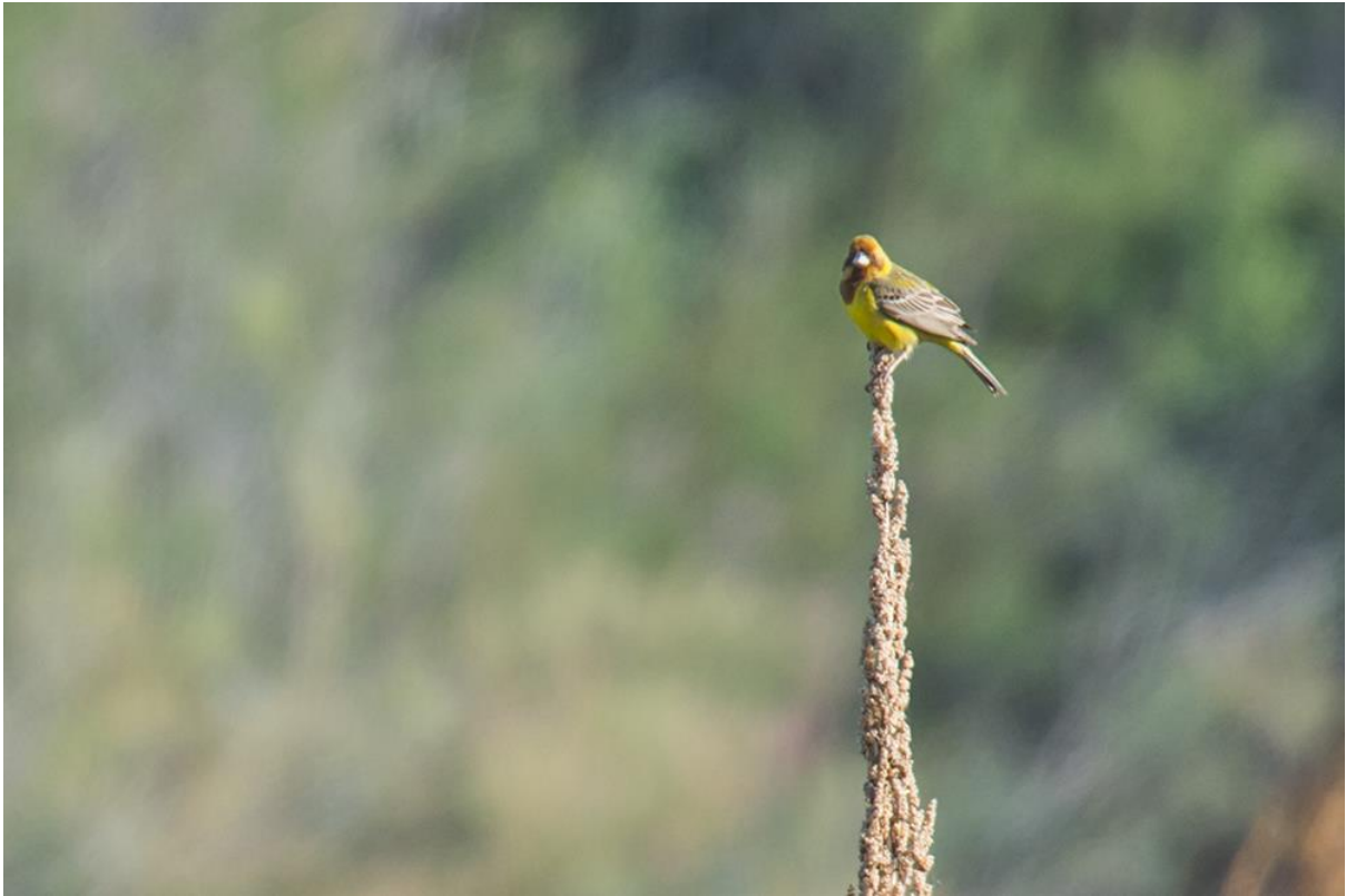
Male Red-headed bunting, a common bird in the semi-desert