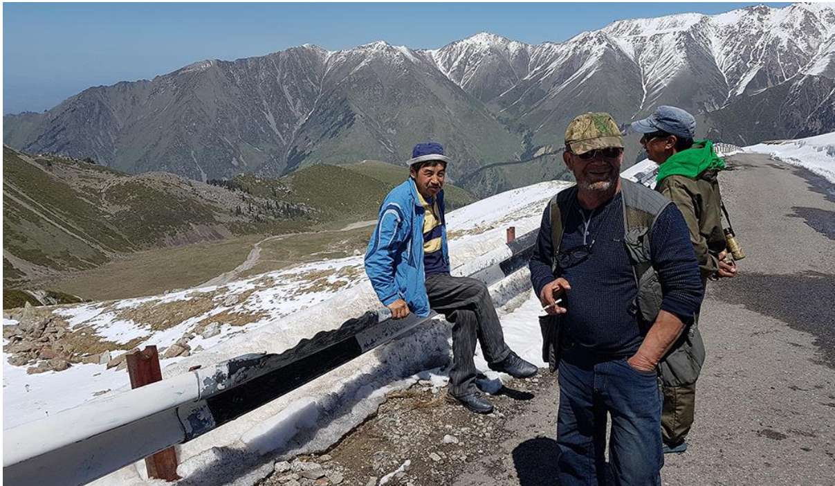
Our Kazaks friends enjoying the view and a pair of Snowcocks

Slowly climbing the road to the Cosmostation, after passing through the passport control, and stopping along the road produced many species including several Snowcocks , Altai and Brown accentors and amazing views of Bearded vulture , Cinereous vulture and Himalayan griffon . At and around the Cosmostation it did not take long to connect with the pair of Güldenstädt's redstarts in the slope adjacent to the station.