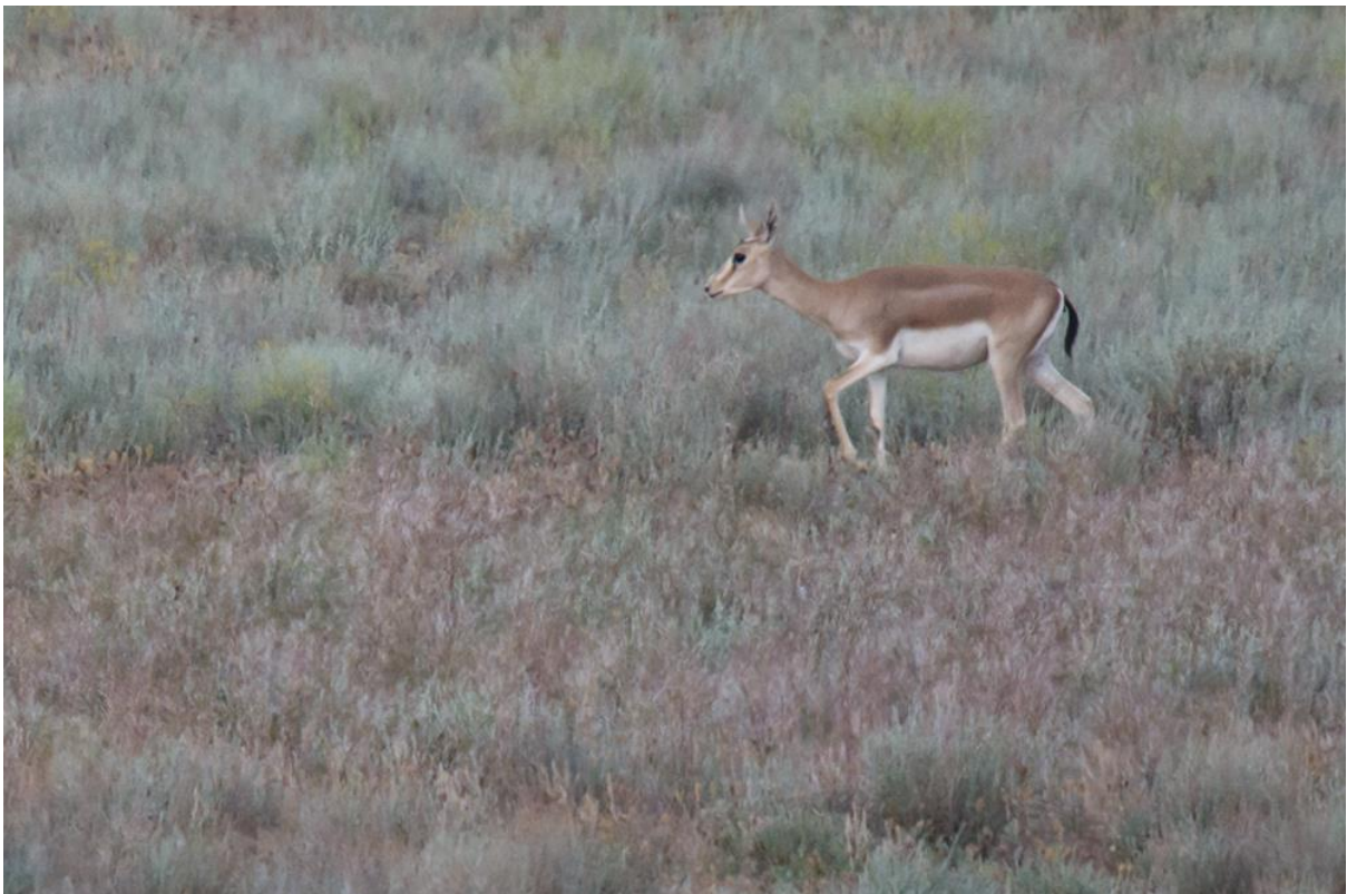
One of many Goitered gazelles grazing NW of Kanshengel before sunrise