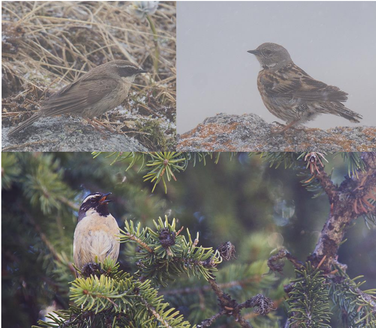
Brown accentor in the top left, Altai accentor in the top right and Black-throated accentor in the bottom image