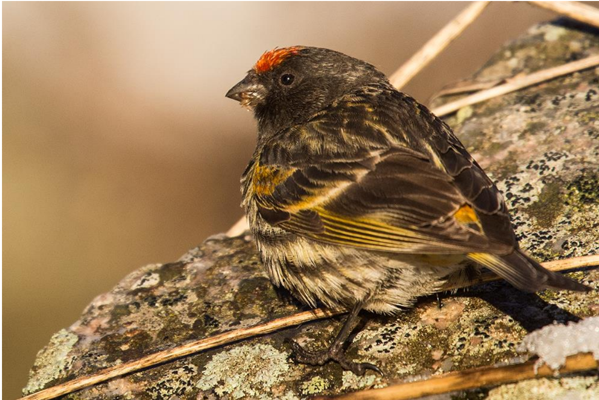
Red-fronted serin with its beak full of seeds