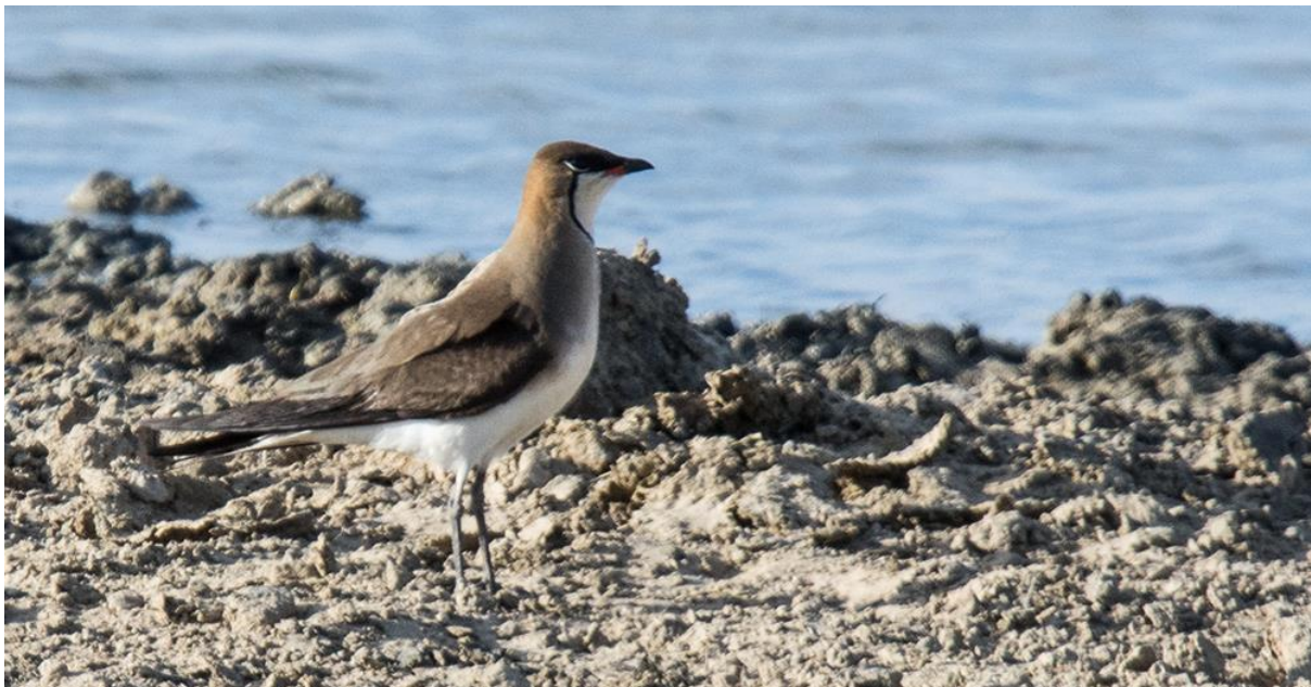
One of two Black-winged pratincoles drinking at the waterhole