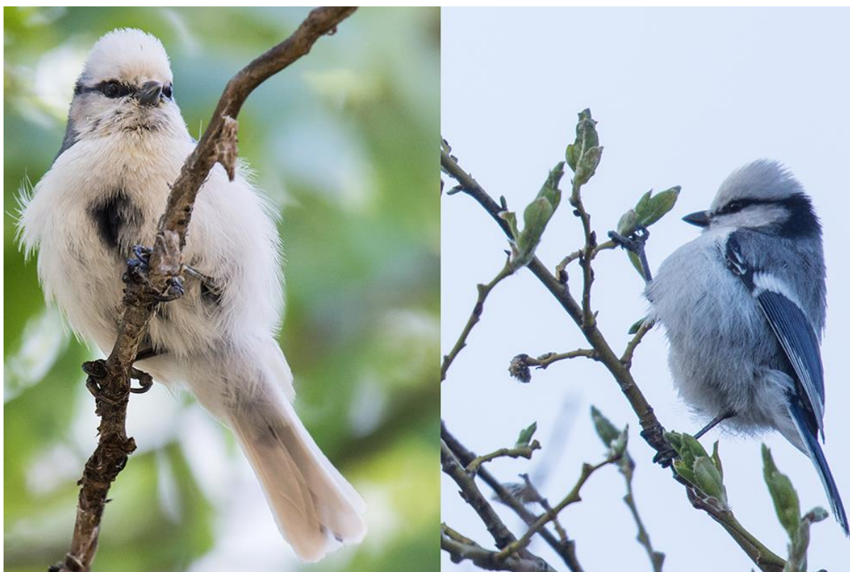
Azure tit ssp koktalensis to the left and ssp tianschanicus to the right