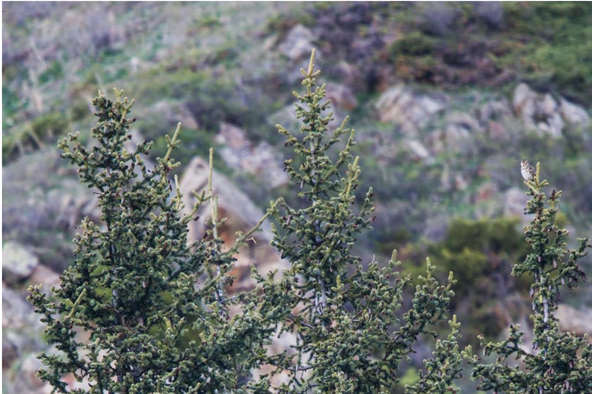
Maybe the best bird of the trip - White's thrush