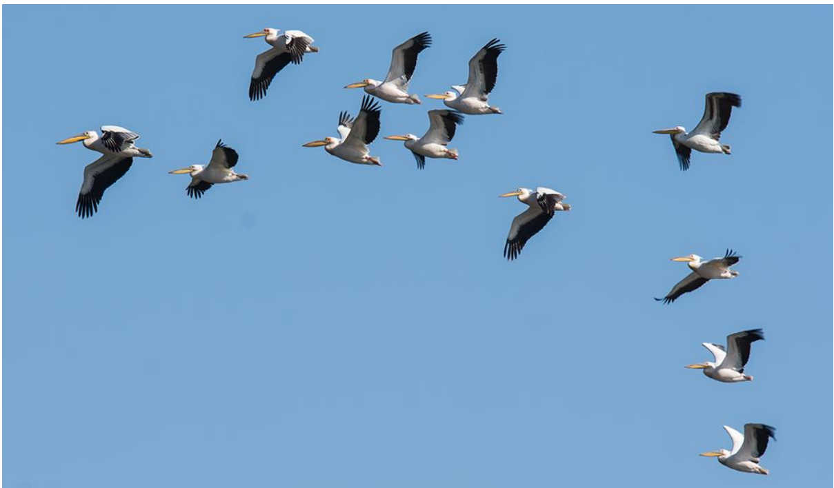
Great white pelicans flying passed our camp at Sorbulak lake system