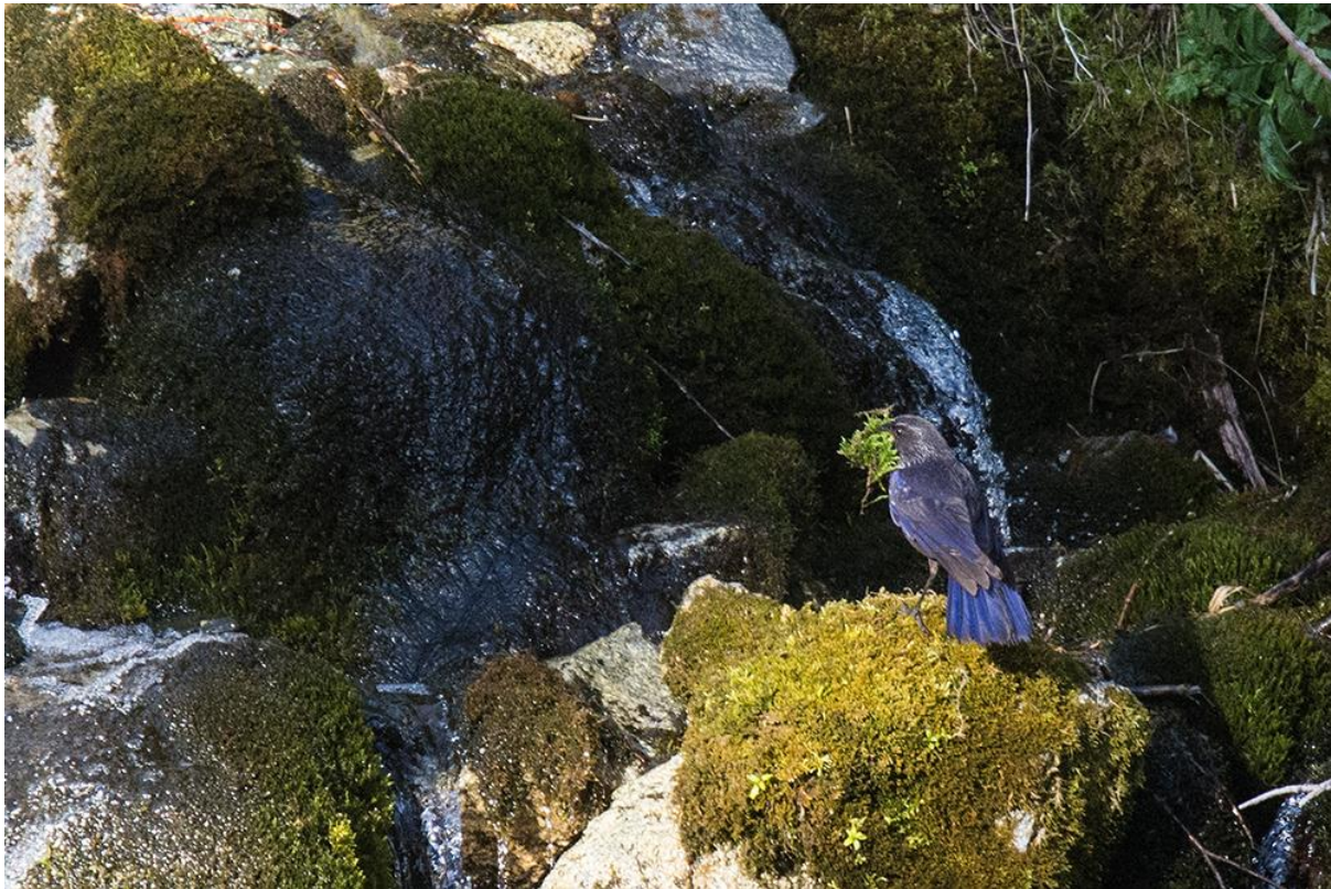
A female Blue whistling thrush with gathered nest material