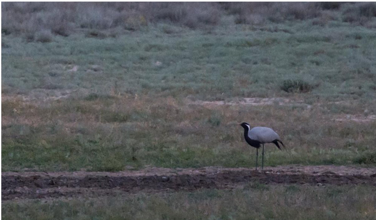
Demoiselle crane drinking at the waterhole