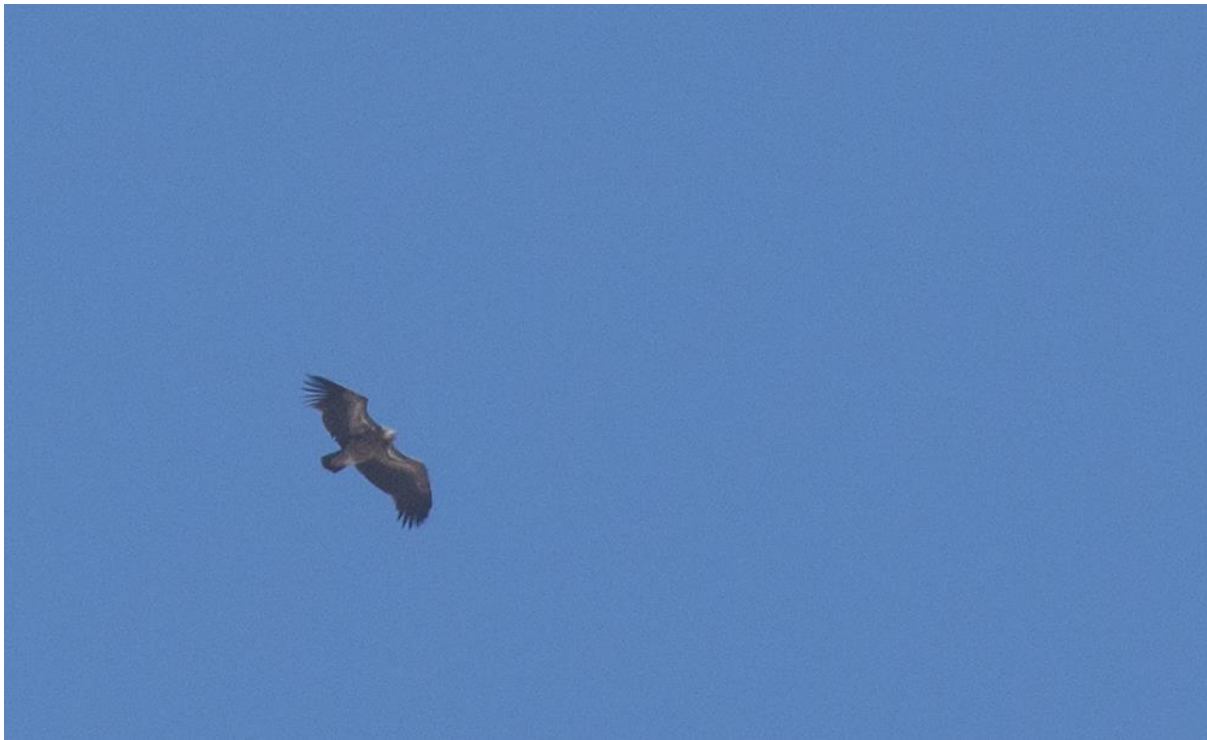
Juvenile Himalayan griffon passing over us

As we enjoyed lunch back at the car, a juvenile Himalayan griffon passed over the lake together with several Cinereous vultures . We walked back down and spent the evening around the hotel.