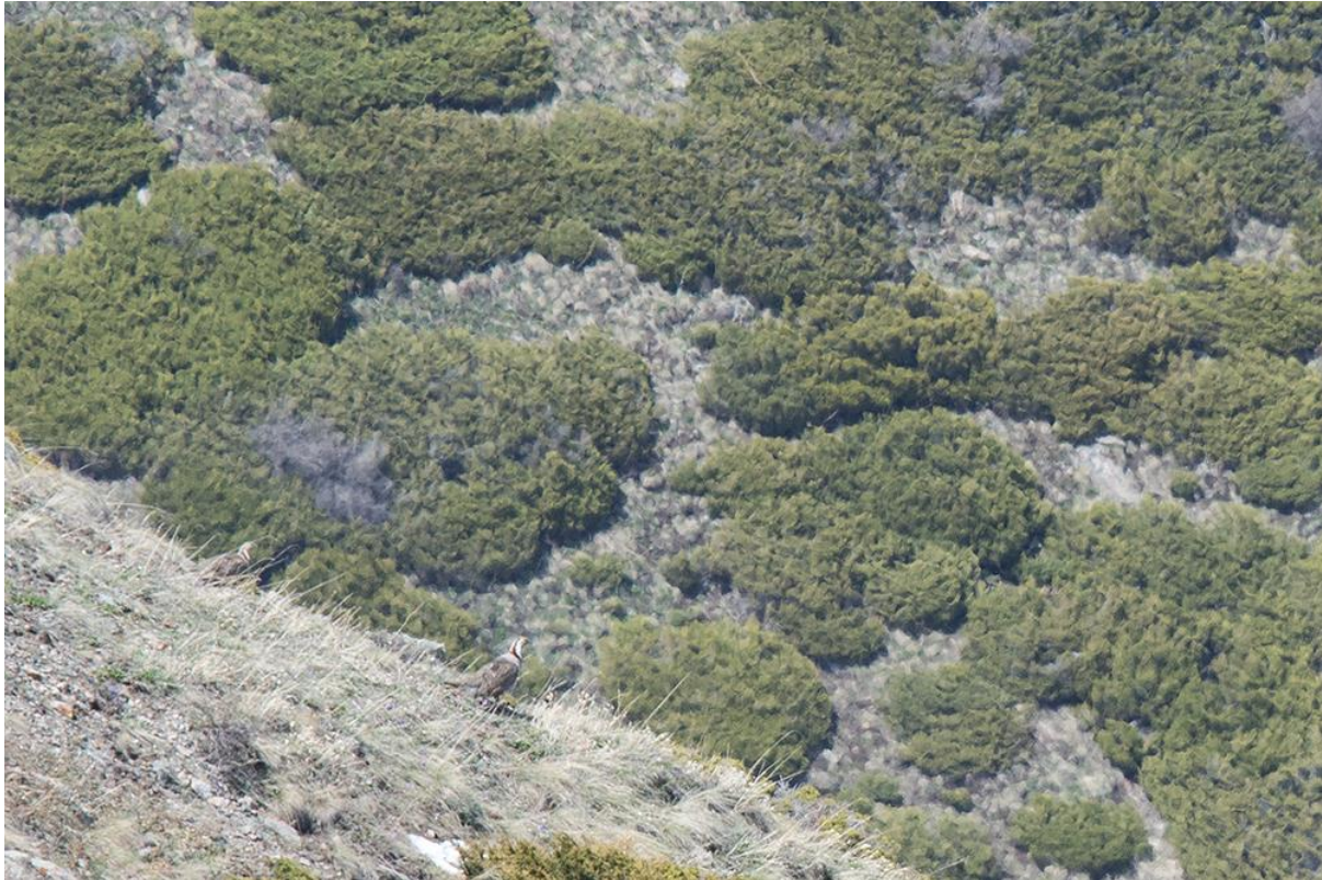
A pair of Himalayan snowcock feeding along a ridge