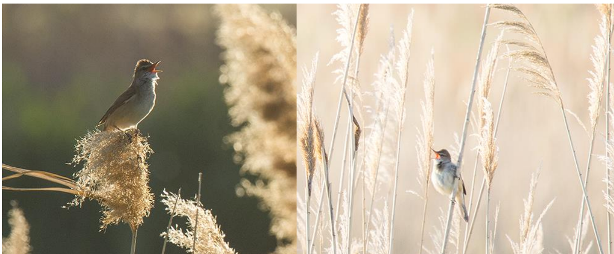
Great reed warbler to the left and Clamorous reed warbler to the right