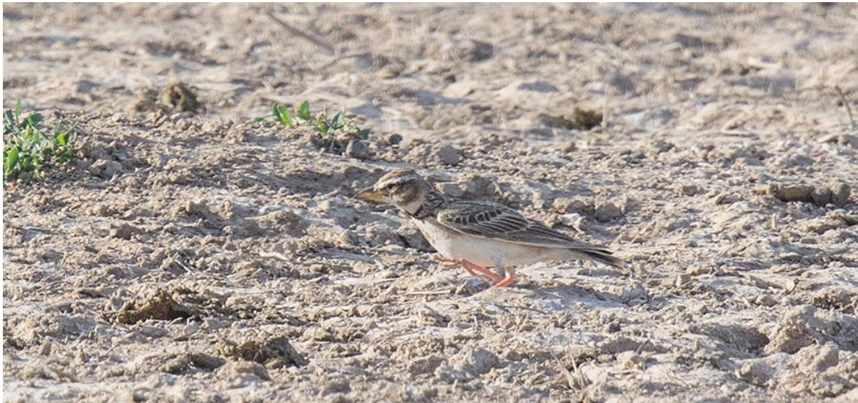
Bimaculated lark was quite common in the area around Kanshengel