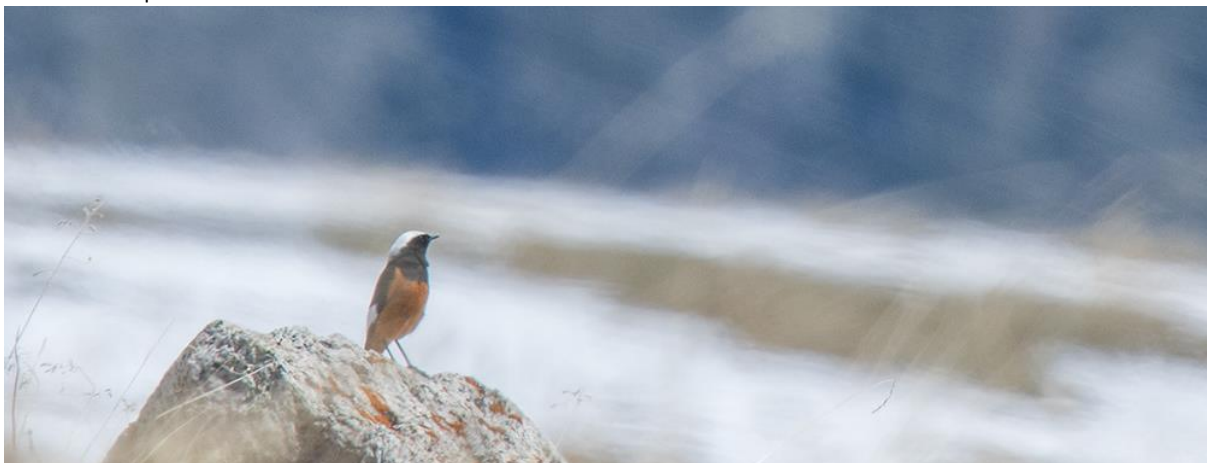
The beautiful male Güldenstädt's redstart at the Cosmostation