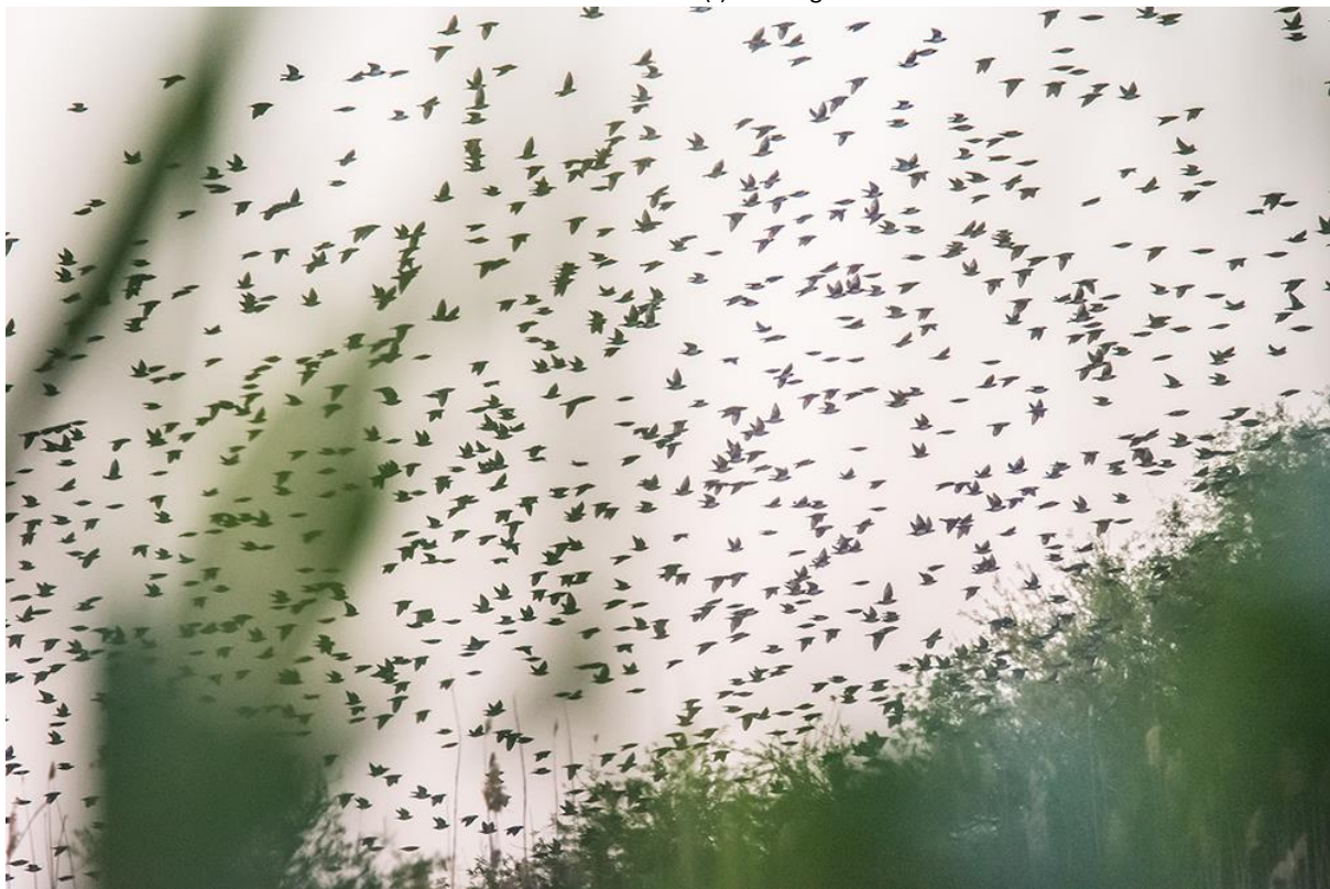
Several tens of thousands of Rosy starlings gather after sunset at Sorbulak lake system