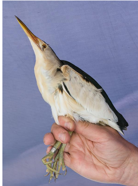
Caught Little bittern