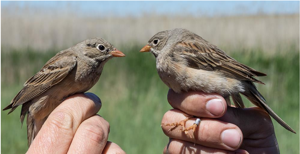
Two young males Grey-necked bunting caught at Sorbulak lake system