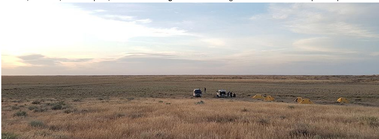
Campsite at Kanshengel

We only had one evening and one morning in this amazing area. We camped by a waterhole just northwest of Kanshengel which produced Steppe and Eastern Imperial Eagles , Montagu's harrier , five lark species, Desert finch and much more. We drove west over the semi-desert in the morning looking for Caspian plover and Macqueen's bustard but failed to find both species. However, we had nice views of Greater sand plover and Pallas's sandgrouse . More research on where exactly the plovers' breed and more time spent along the border between the semi desert and the desert are probably necessary to see these target species. Before we headed north, we drove a few kilometres south of Kanshengel and along the road, we found, to our surprise, several White-winged larks even though a minor sandstorm had picked up.