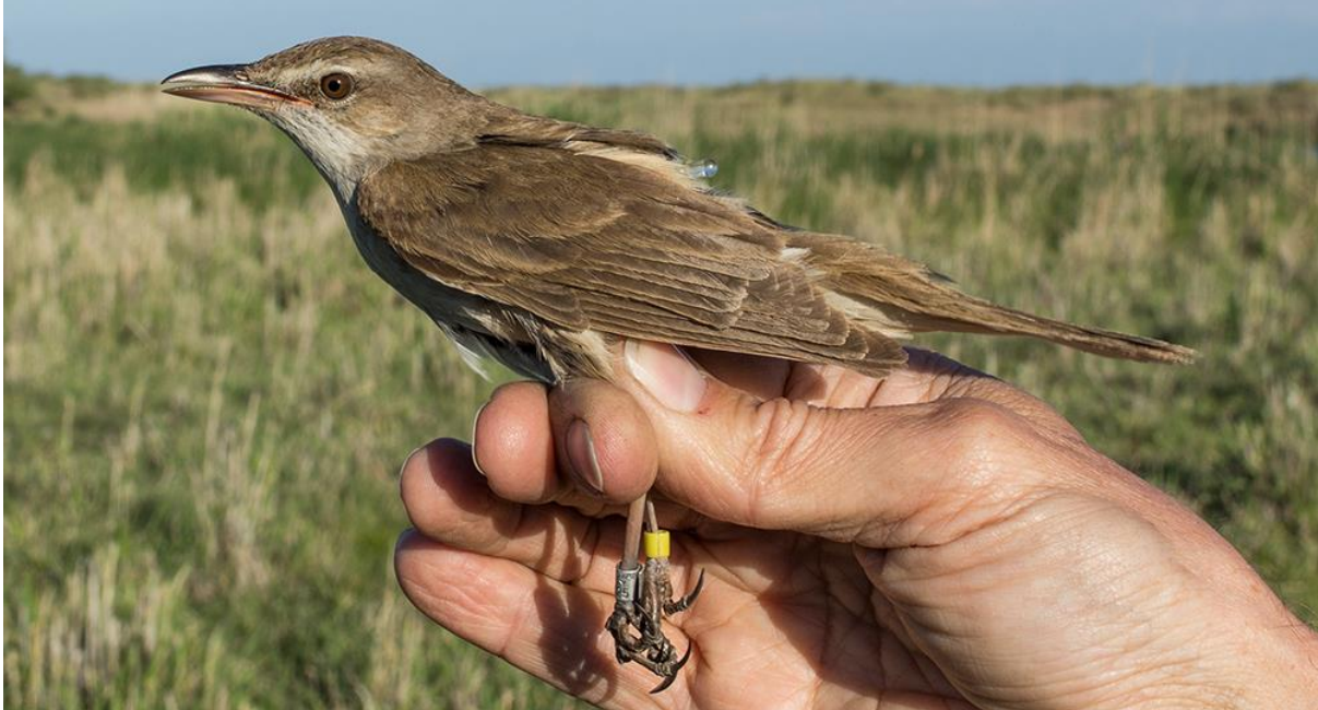
Fieldwork and trapped GRW