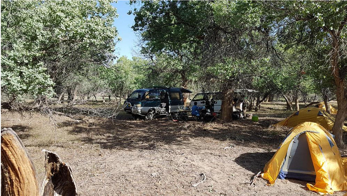
Campsite at Zhel'turanga

Apparently, our guide had not been to the Turanga forest east of Topar for several years and therefore we did not put up camp at the famous forest, which is very close to the small village. We camped further east in a forest not as dense as the famous one according to google earth. However, that did not matter as the forest was very nice also here and we soon found all three target species: White-winged woodpecker , Yellow-eyed pigeon and Saxaul sparrow . Other interesting species we found were Syke's warbler , Common nightingale , European golden oriole , Azure and Turkestan tits and halimodendri-Lesser whitethroat .