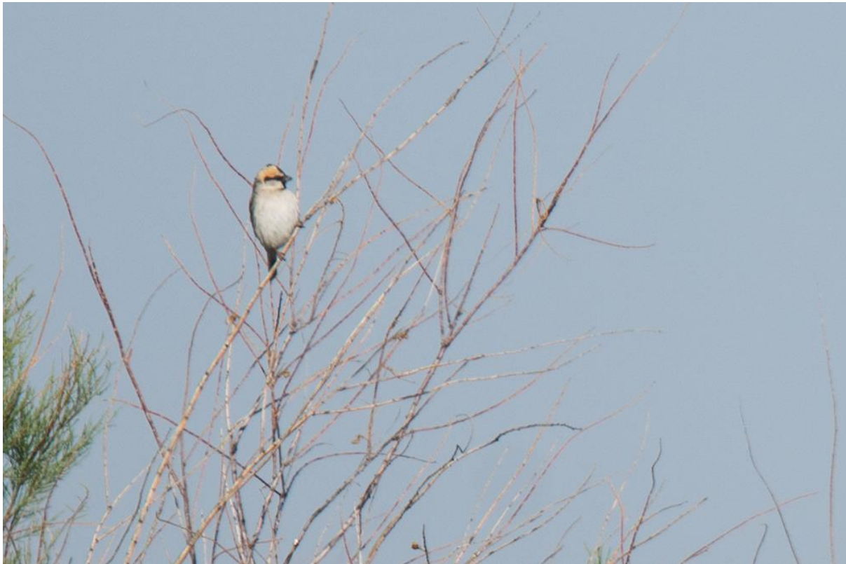
Male Saxaul sparrow outside Zhel'turanga