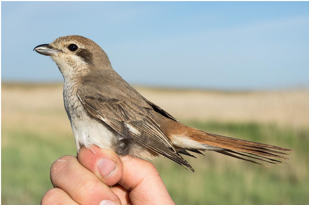
A 2cy male Turkestan shrike was a nice surprise to find in the net

We started early and had a few rounds of intense bird ringing before a storm picked up, rendering fieldwork impossible. Still, we manage to capture several GRWs and CRWs, but no logger birds. We also caught a Turkestan shrike , two Syke's warblers and many other migrating birds in the reed. The storm also made birding difficult, but not impossible. August and Mikkel saw a Griffon vulture and Bengt saw a Bluethroat around the camp.