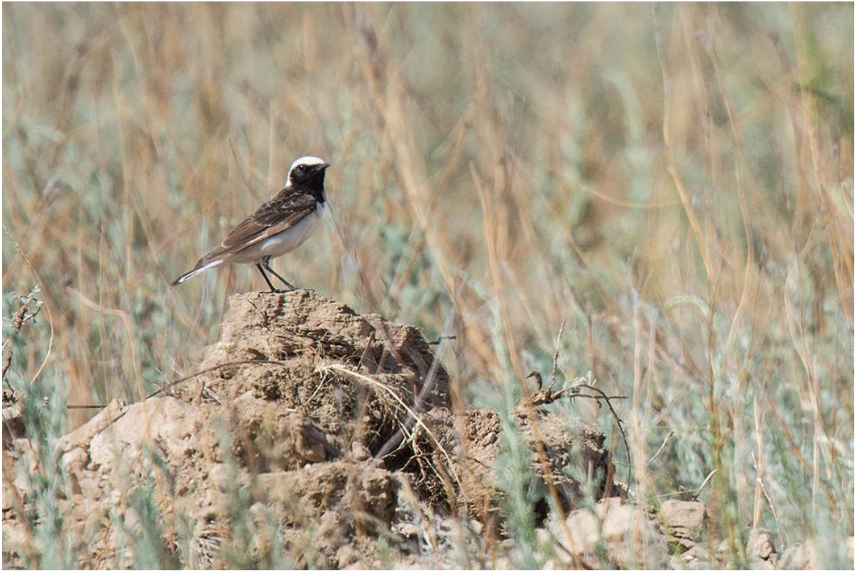
The Pied wheatear is a characteristic bird in the semi-desert