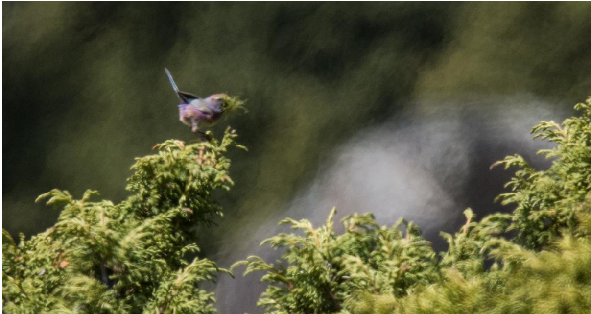
White-browed tit-warbler gathering nest materials