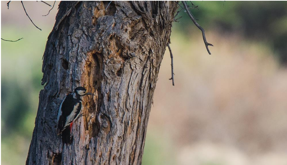
White-winged woodpecker - one of the target species in the Turanga forest