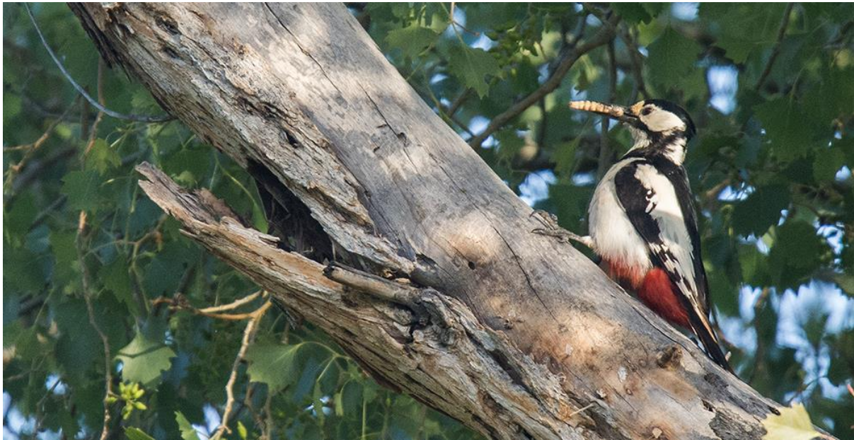
We found several nest of White-winged woodpeckers. Here is one with food for their chicks.