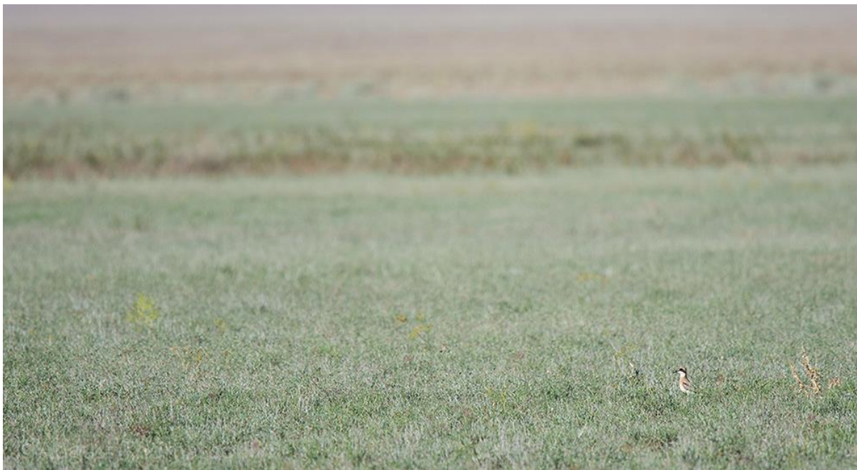
Greater sand plover in its breeding ground