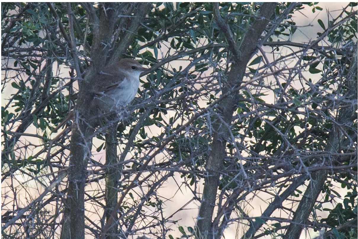
The characteristic subspecies of Common nightingale, ssp golzii, at Zhel'turanga