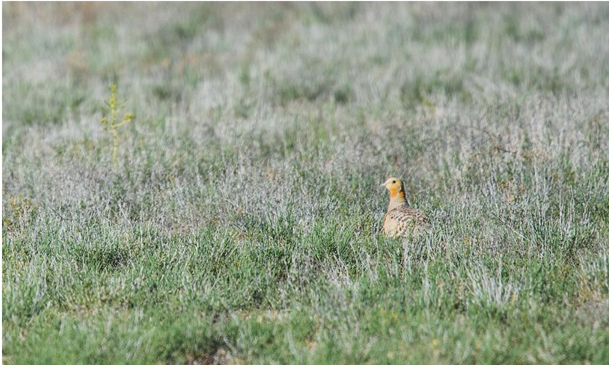
Male Pallas's sandgrouse resting in the semi-desert NW of Kanshengel