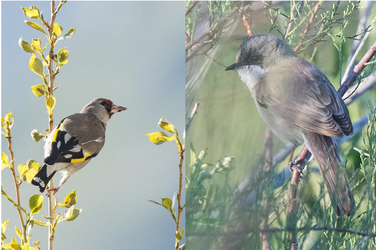
European goldfinch ssp volgensis to the left and Lesser whitethroat ssp halimodendri to the right