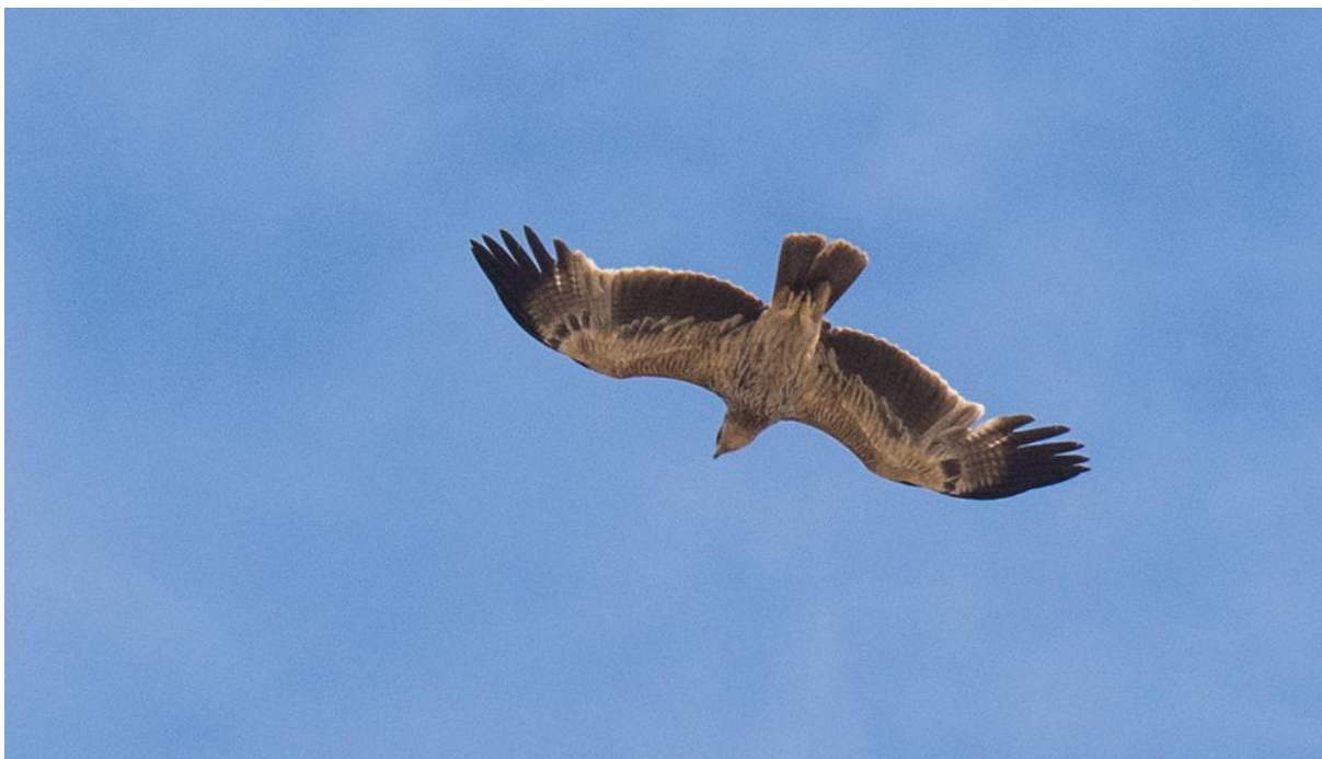
Juvenile Eastern imperial eagle