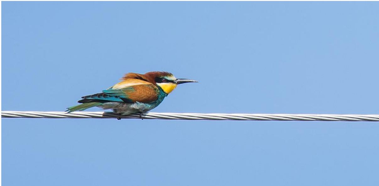
European bee-eater was a common view along the roads around Kanshengel