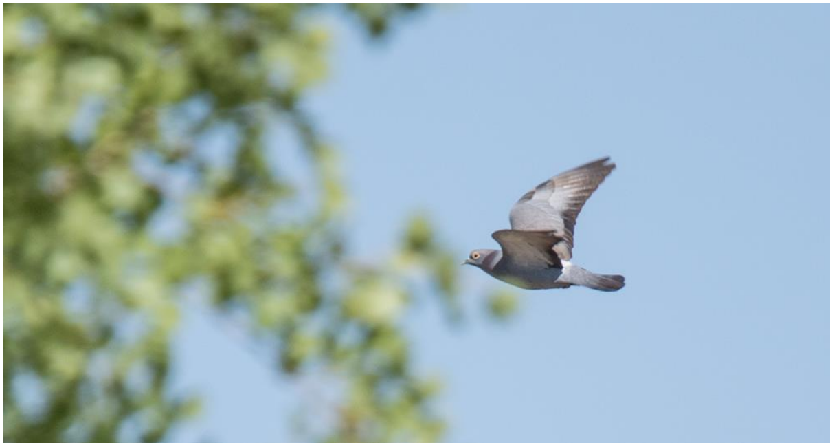
Yellow-eyed pigeon was another target birds at Zhel'turanga

Then we headed north towards Zhel'turanga. As we arrived at Topar, we were running low on diesel and the gasstation was closed due to the storm. Luckily, Almat and Ruchan asked around and found a guy willing to sell us some diesel. Since we lost a lot of time because of this, we had only a few hours of birding in Turanga forest as we arrived. All target species, White-winged woodpecker , Yellow-eyed pigeon and Saxaul sparrow , were easy to find though, and we even got some bonuses such as Pallid and Eurasian scops owl calling in the night.