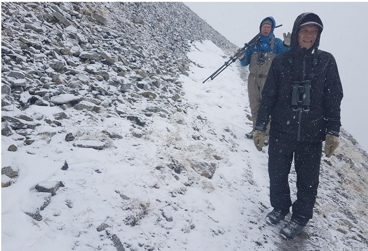
Birding in bad weather

We lost one day of fieldwork to bad weather. Storm winds and rain/hale showers almost the entire day. The extra day we unwillingly spent in the mountains, we experienced fog and heavy snowfall and on our only day in the Kanshengel-area a minor sandstorm picked up during the day.