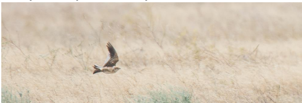
White-winged lark – one of the highlights of the trip