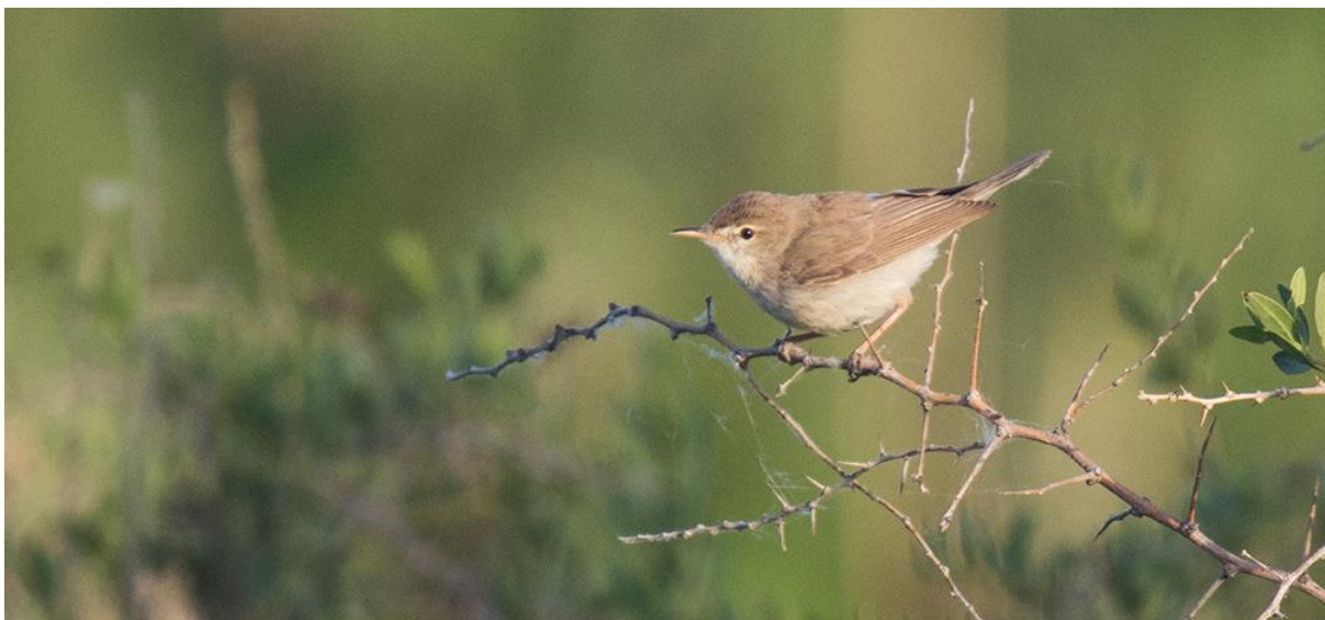
Syke's warbler was common around Zhel'turanga

158. Sykes's Warbler Iduna rama Two caught at Sorbulak lake system on the 23 rd . Common around Zhel'turanga.