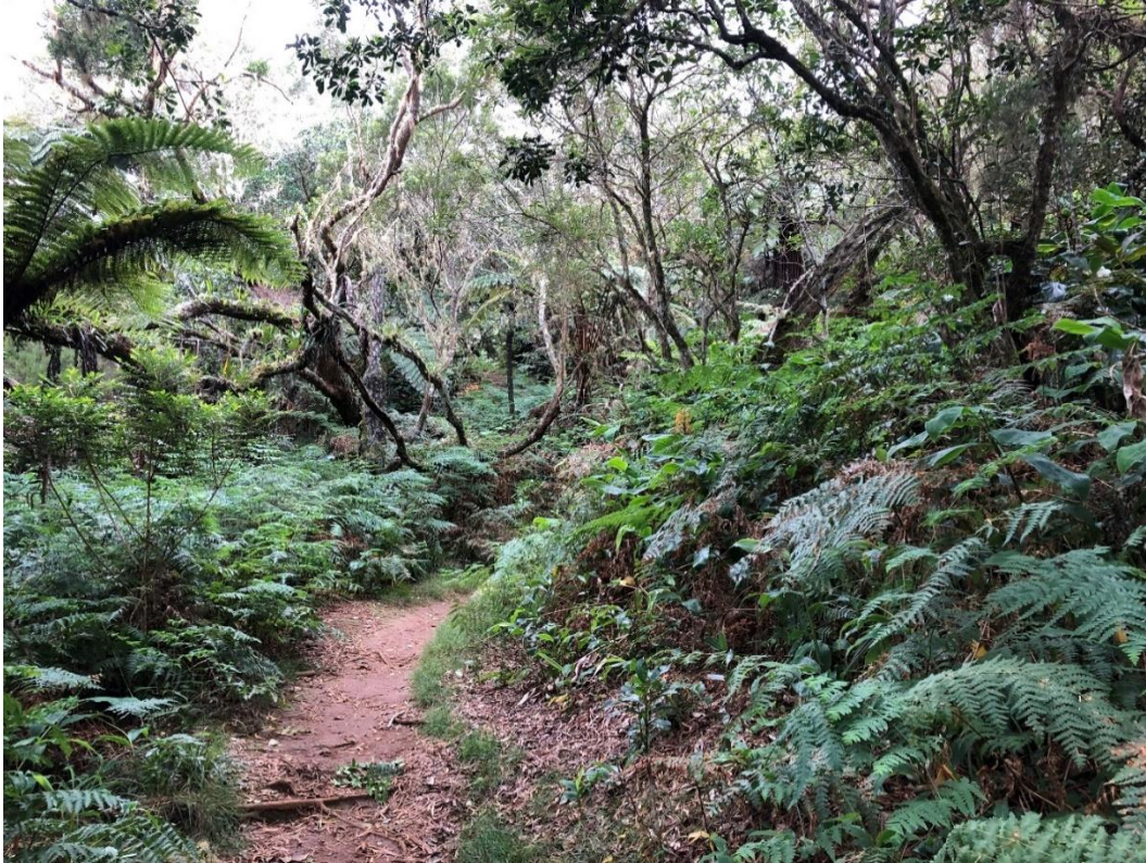
Habitat along the trail at La Roche Ecrite

The afternoon was spent on the beach – with the scope at hand – and besides large numbers of Brown Noddies also some Sooty Terns , a single Masked Booby and several Wedge-tailed Shearwaters flew by. On top of the introduced species already seen on Réunion, also a Scaly-breasted Munia and some Yellow-eyed Canaries were added to the list.