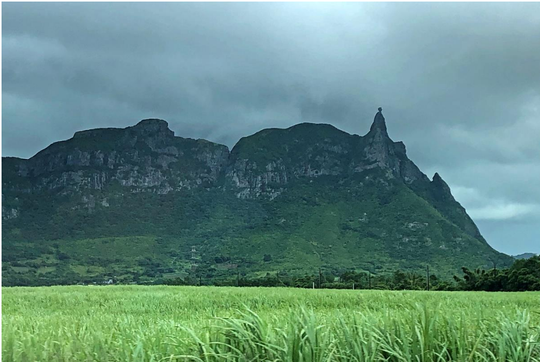
The Moka Range mountains in Mauritius

inside and outside the open cages. I continued the trail up to the radio tower and just after turning back, a nice male Mauritius Fody was singing and eventually also showed well.