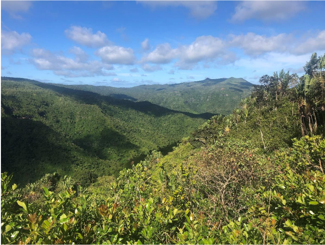
View at the Black River Gorges National Park

After returning to the entrance at Le Petrin we made short visits to the Bassin Blanc as well as the Savanne Trail without any further additions to the list. Thereafter we had a very nice late lunch at the Bois Cheri tea plantation and we also visited the area of Grand Bassin where the preparations for the yearly pilgrimage in early March when up to 400 000 Hindu devotees visit the holy lake was ongoing. Grand Bassin is a good site for Mascarene Martin and we found at least 35 birds sitting on the wires in the temple area.