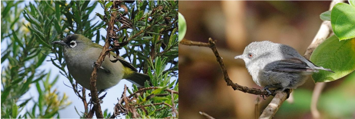
Réunion Olive White-eye and Réunion Gray White-eye at the Diana Dea Lodge

After a late lunch and some rest, I took an afternoon walk along the entrance road to the lodge which was very productive with numerous Réunion Olive White-eyes , a few Réunion Gray White-eyes , Réunion Bulbul as well as Mascarene Swiftlet , Mascarene Martin and Mascarene Paradise-flycatcher . In the evening we had an excellent dinner at the lodge. A very nice start!