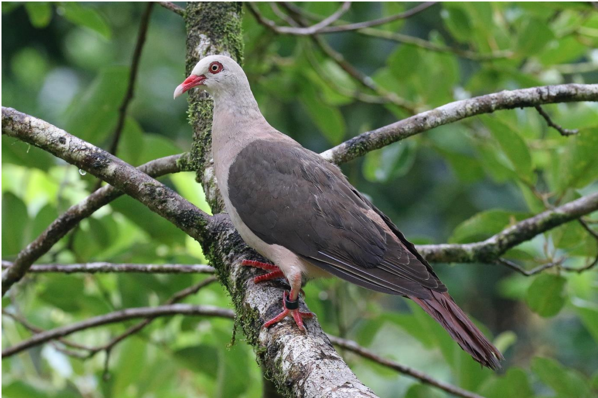
Pink Pigeon, Savanne Trail, Black River Gorges National Park, Mauritius