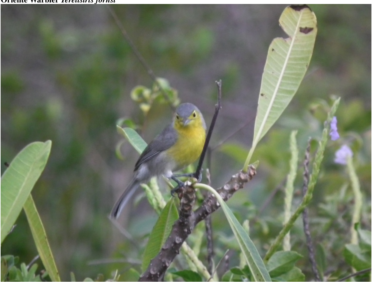
1 on Cayo Paredón Grande, and 2 at Vereda Oeste, Cayo Coco. Endemic to Cuba.