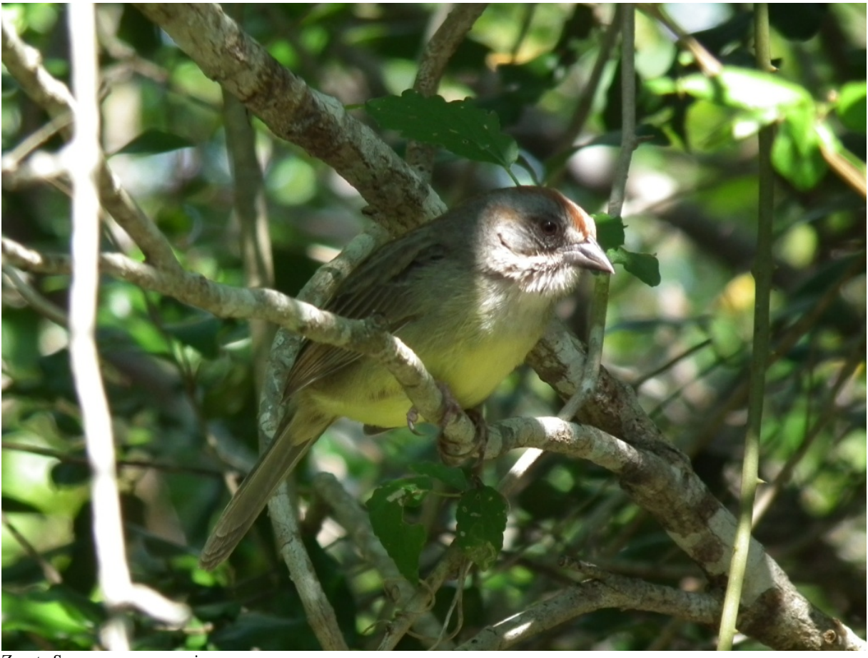
Zapata Sparrow, ssp varonai