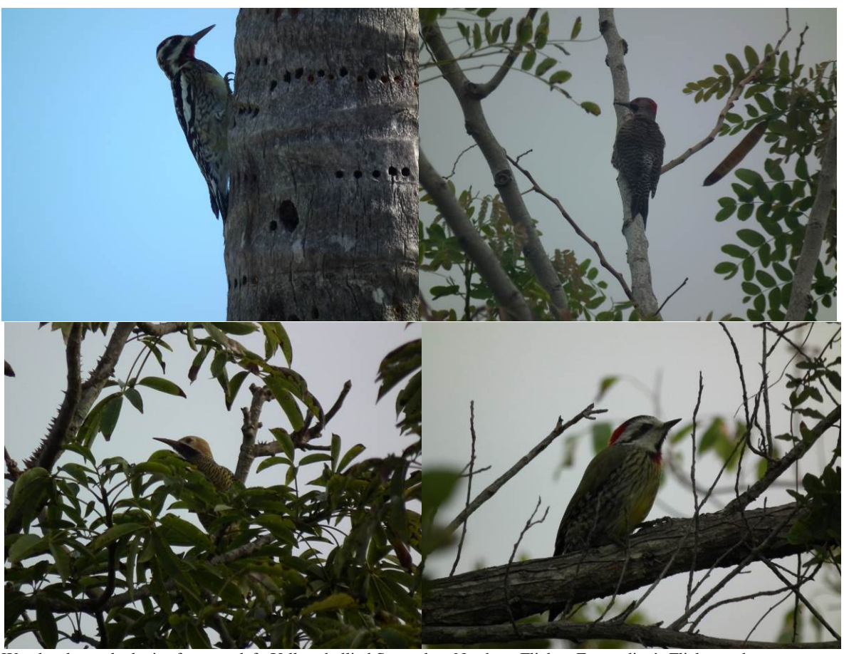
Woodpeckers, clockwise from top left: Yellow-bellied Sapsucker, Northern Flicker, Fernandina's Flicker and Cuban Green Woodpecker.