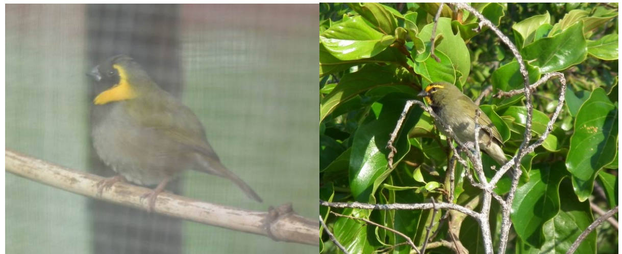
Cuban Grassquit in captivity. Photographed in Varadero.