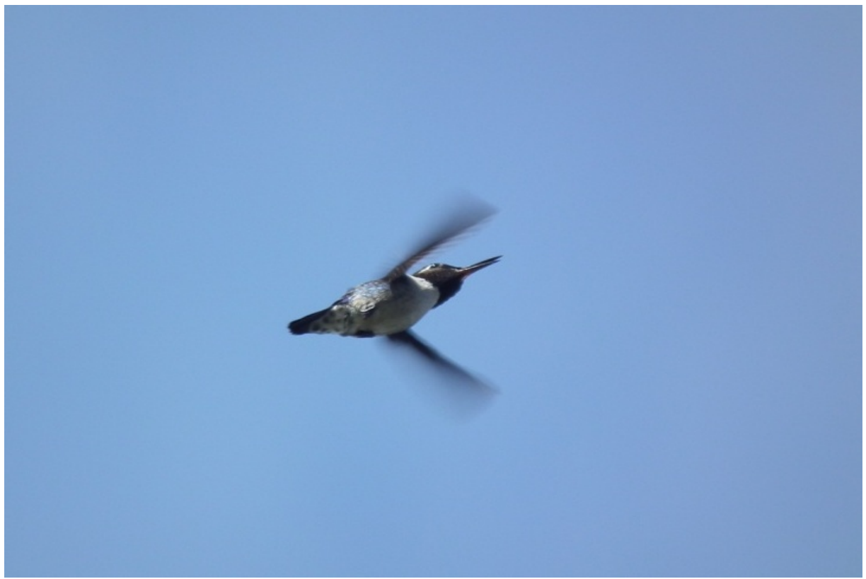
Male Bee Humingbird in display flight.