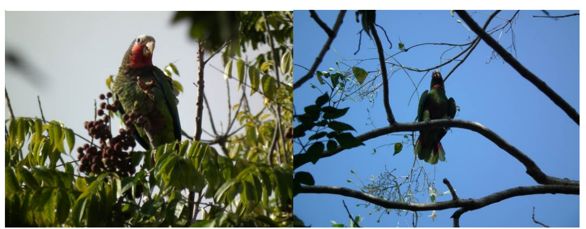
Cuban, or Rose-throated, Amazon, left nominate leucocephala , and caymanensis to the right. On the latter, the rose-red of cheeks and throat are separated from each other.