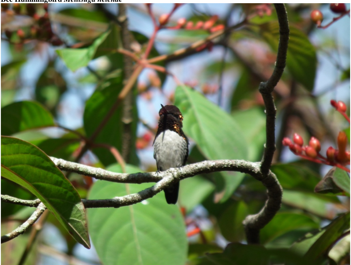
A pair of this much-desired Cuban endemic seen in Pálpite, the male being extremely busy displaying.