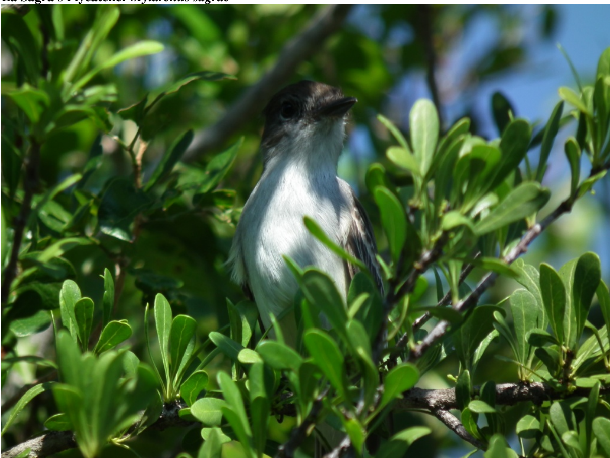
Cuba: 1 at Vereda Oeste, Cayo Coco, 1 at PN Viñales, 1 at Finca San Vicente and 1 at La Turba. Ssp: nominate sagrae . The species is restricted to northern Bahamas, Cuba and Cayman Islands.