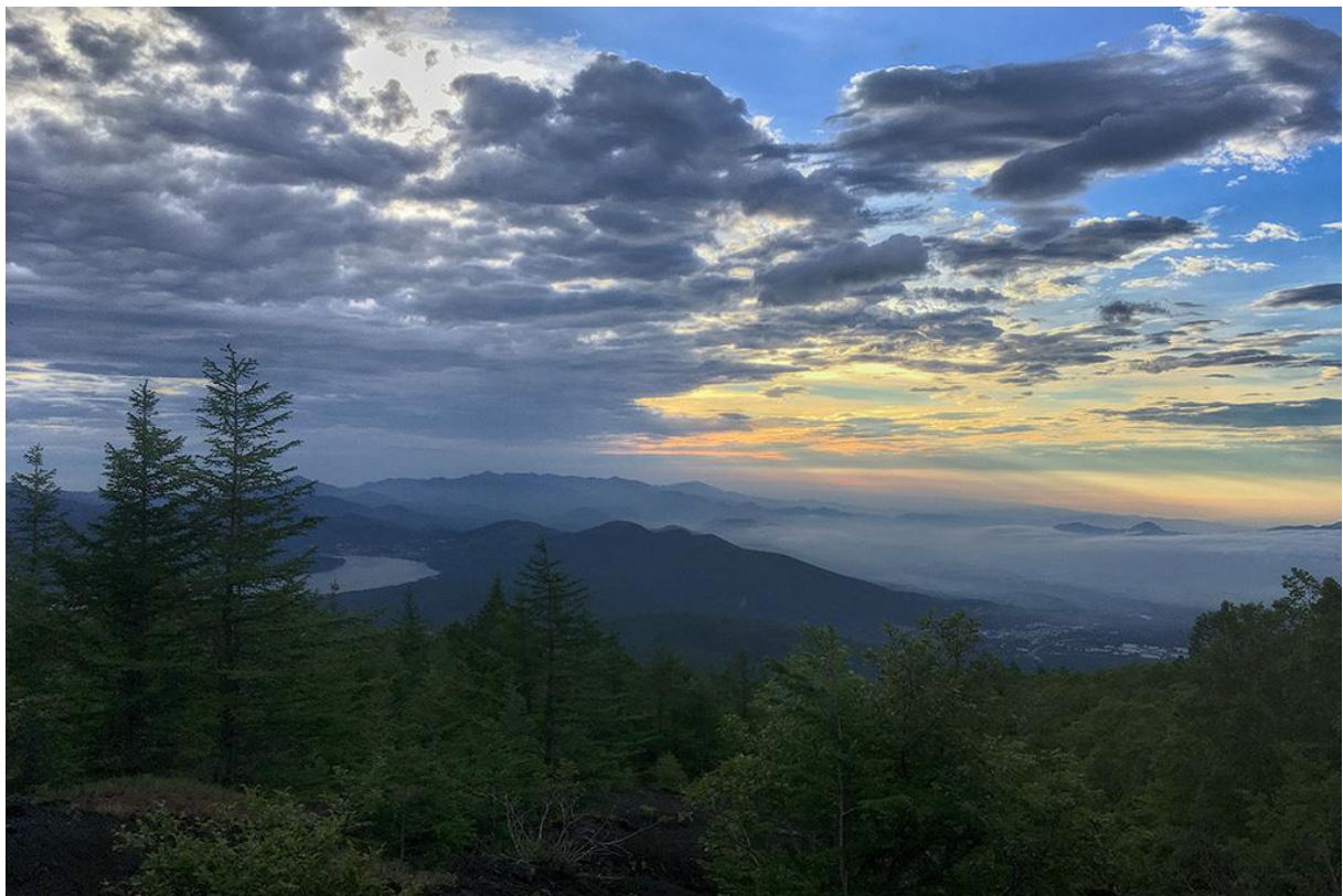
View from Mount Fuji in the early morning

Having missed the Grey Bunting due to bad weather at Shiretoko pass it was a kind of surprise to find at least four birds singing along the road from Karuizawa to Mount Shirane . We made a stop where the habitat seemed suitable and there they were – coniferous/mixed forest with dwarf bamboo undergrowth. The approximate coordinates are 36°34'47.24"N, 138°31'35.21"E. There were also two Lesser Cuckoos in the same area.