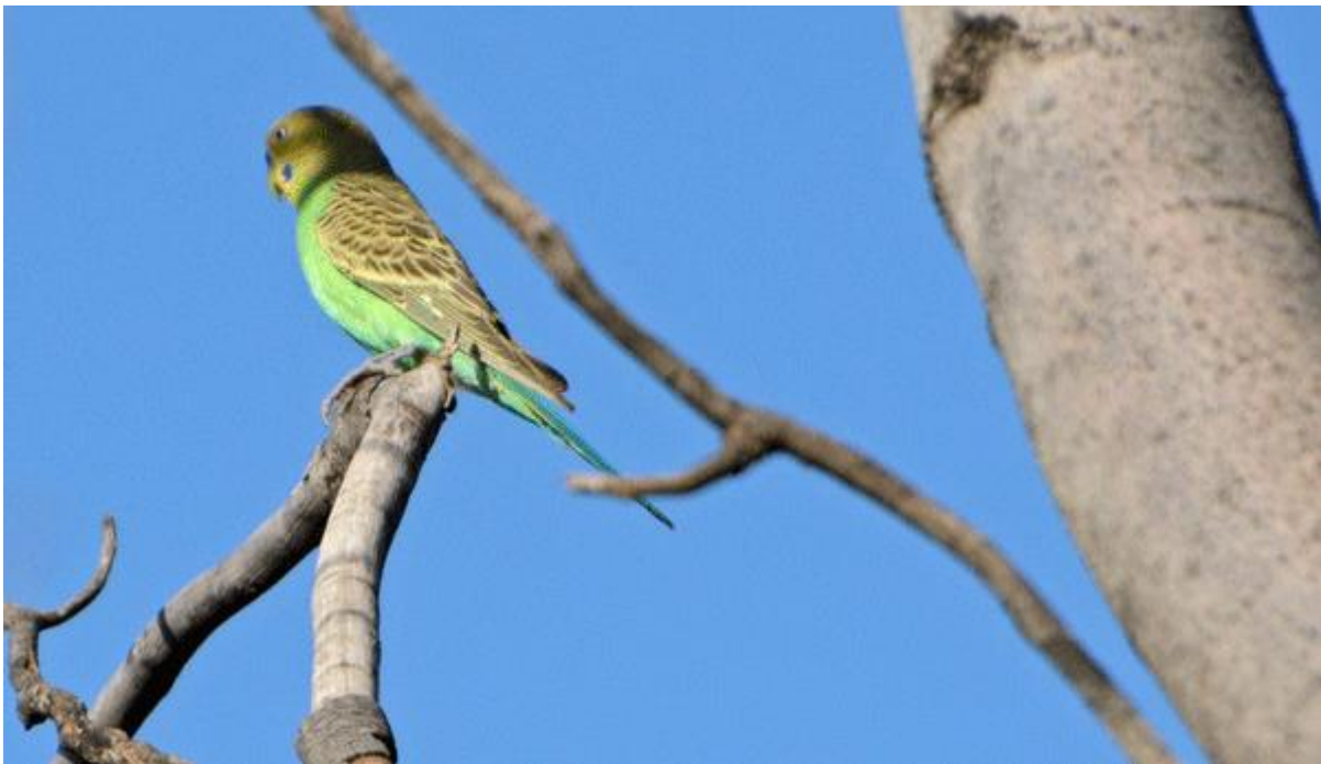
Not the best photo of a "Budgie", but a real one.....and one of our first.

Purple-crowned Lorikeet ( Glossopsitta porphyrocephala )