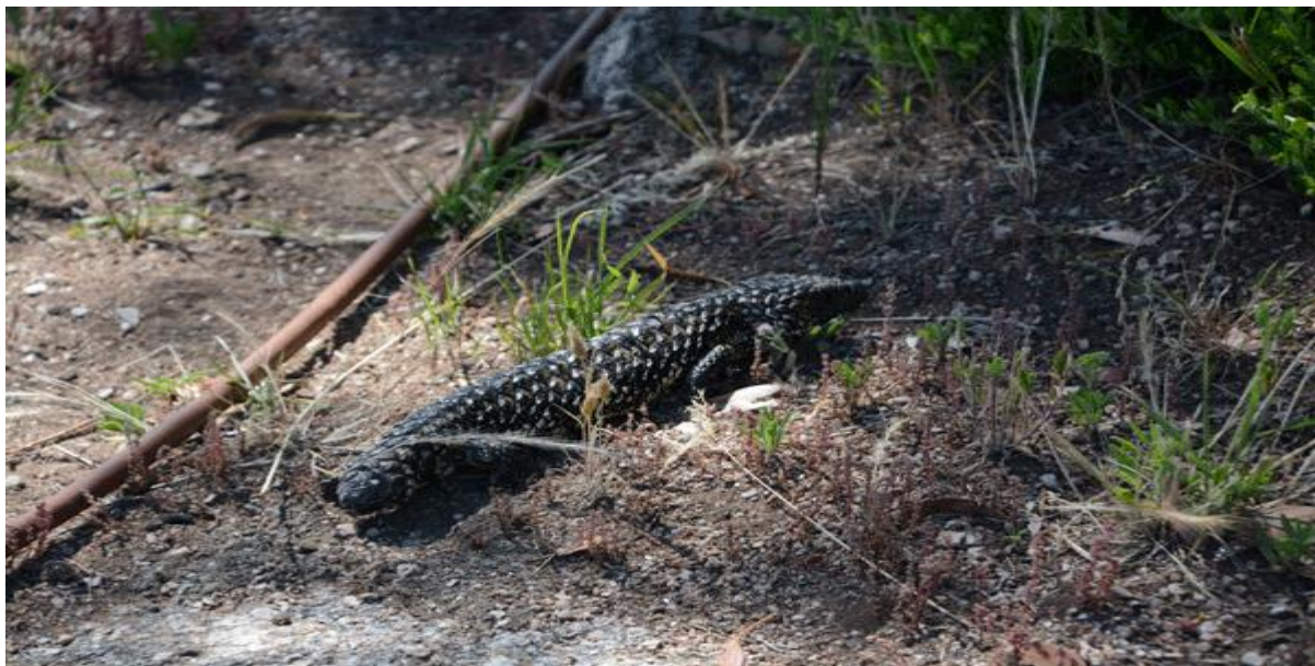
Blue-tongued Skink ( Tiliqua rugosa )

15/11. Another sleep in morning because of a travelling day. Around lunch time we flew to Adelaide, where we picked up a rental car and drove to Victor Harbor for the night. This was a short drive of around 80 km. We had a nice and relaxing evening walk over the bridge to Granite Island a former whale station. Today's attraction is a breeding colony of Little Penguin. There are guided walks to the colony but one is not allowed to go there alone.