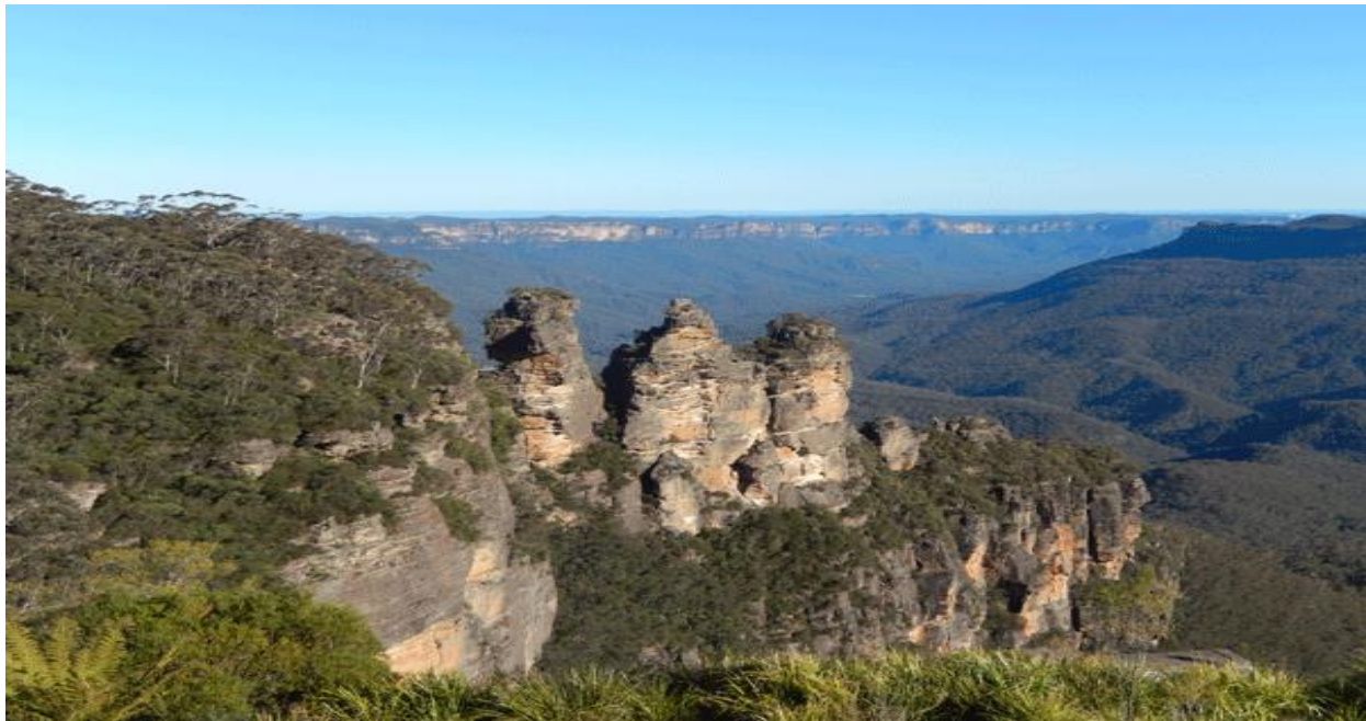
Three Sisters, Katoomba

As the hotel is situated in the town center there was no birding to be done near, not more than those birds seen in small parks and local gardens. Check their website for further info. www.thecarrington.com.au