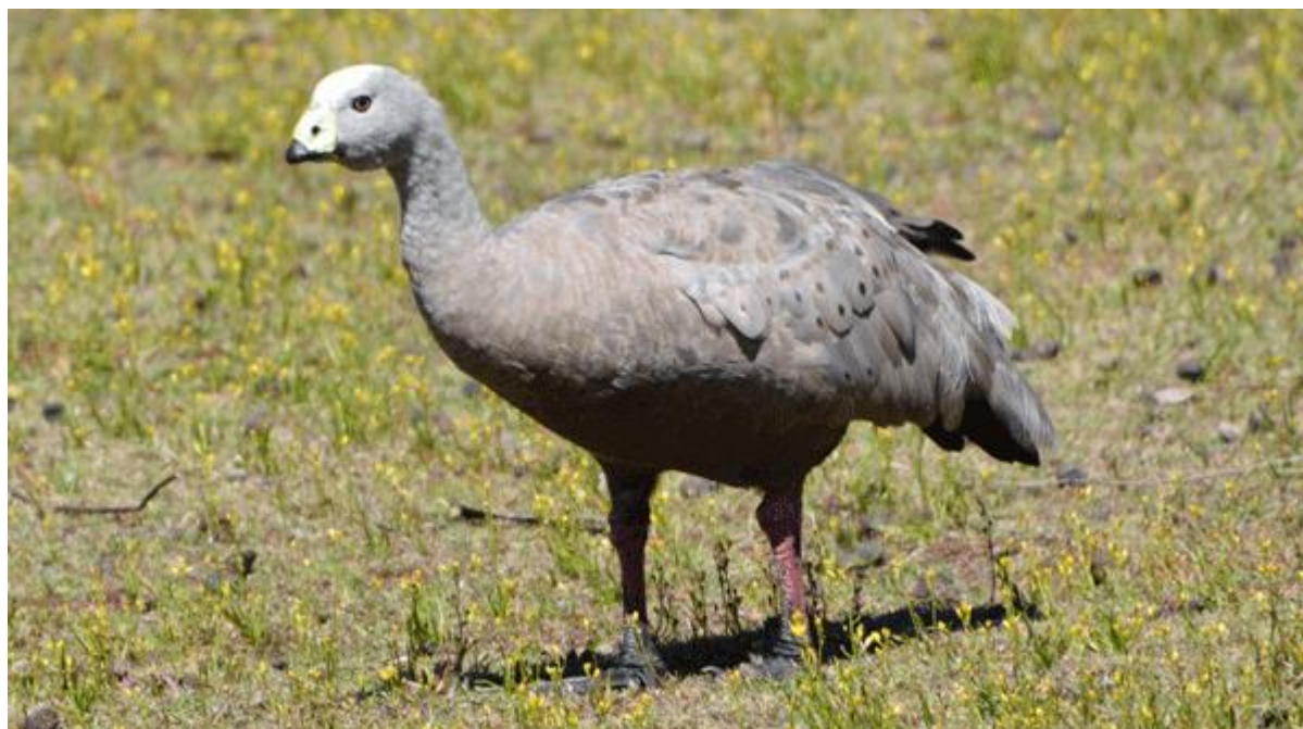
Cape barren Goose

SA: 90 KIWR 16/11 and 25 Flinders Chase N.P. 17/11.