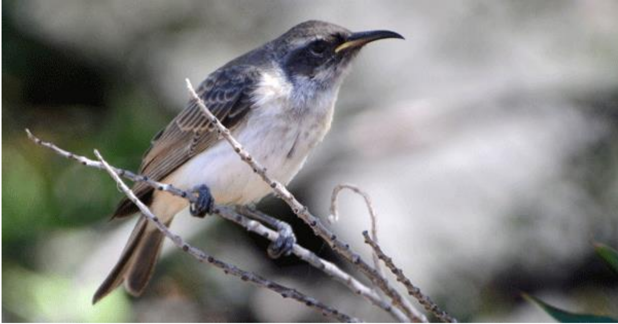
Young Black Honeyeater

NT: up to 5 seen outside the hotel entrance Yulara 12-13/11.