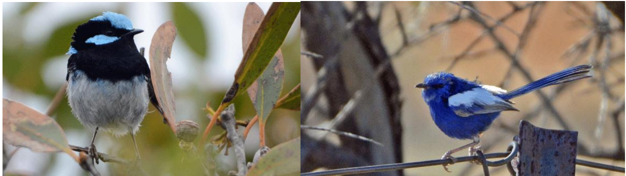
Suberb and White-winged Fairywren

NT: 1 female with 5-6 juvenile birds Uluru 12/11 and a family group, incl adult male, of 6-7 birds Kunoth Well 14/11.