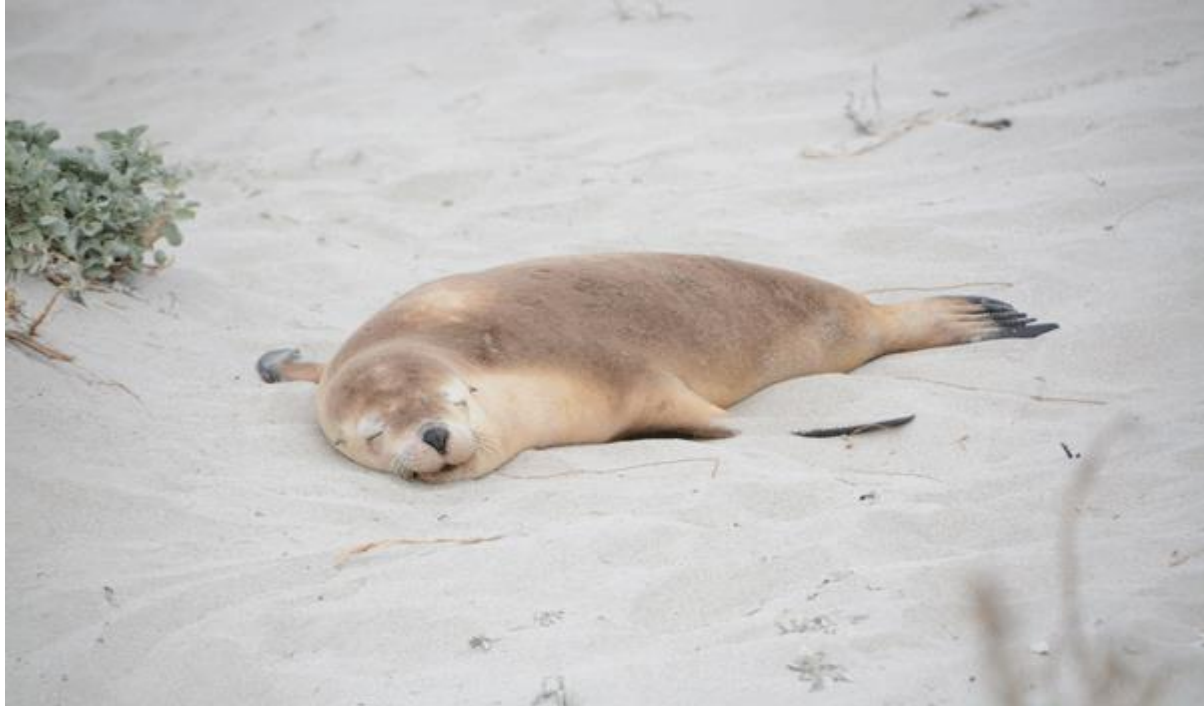
A happy Sea Lion pup.

Australian Sea Lion ( Neophoca cinerea ) 80 Seal Bay, Kangaroo Island, SA 18/11.