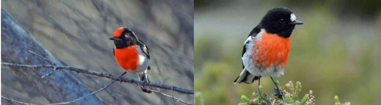
Red-capped and Scarlet Robin