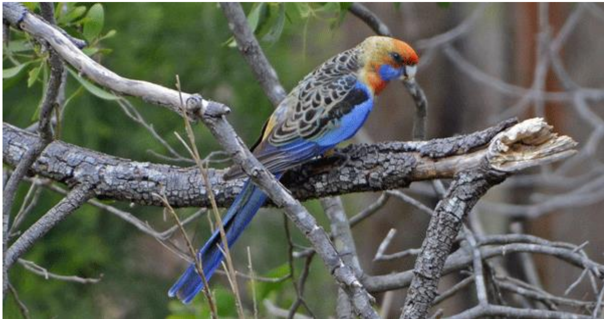
Crimson "Adelaide" Rosella.

The birds around Adelaide is often called "Adelaide Rosella". Looking really different from the "normal" Crimson Rosella.