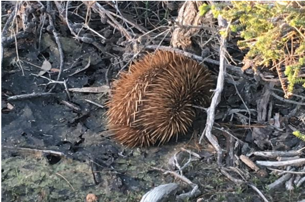
Short-beaked Echidna, trying to hide from the photographer.

18/11. Another sleep in morning. After breakfast we made a day trip, first to Seal Bay where we looked at the Sea Lion colony, saw our first black tiger snake (warning signs for those reptiles at the info Centre). Then we tried to visit Murray Lagoon, but the whole place was flooded. Visited also both Hanson and Vivonne Bay. Hanson Bay advertised for Koala sightings, and yes we did find half a dozen. Here we also found our first perched Purple-crowned Lorikeets. We also stopped at a small pond at the Kingscote/Seal Bay Crossing where we, among more frequent seen species, found a small party of Musk Duck, a Royal Spoonbill and a family party of Black-fronted Dotterel. Drove back to the lodge well in time for dinner and ended the day with a sunset walk along the main road. We found a Short-beaked Echidna and two good flocks of Purple-crowned Lorikeet.