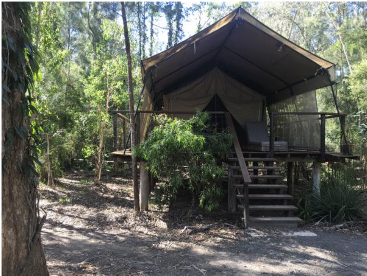
Comfortable tenting at Paperbark Camp.

3/11. The morning walk was along the entrance road, quite a lot of birds. The rest of the day was then spent in Booderee N.P where we visited a number of places, including the botanical garden and Cape St George Lighthouse.