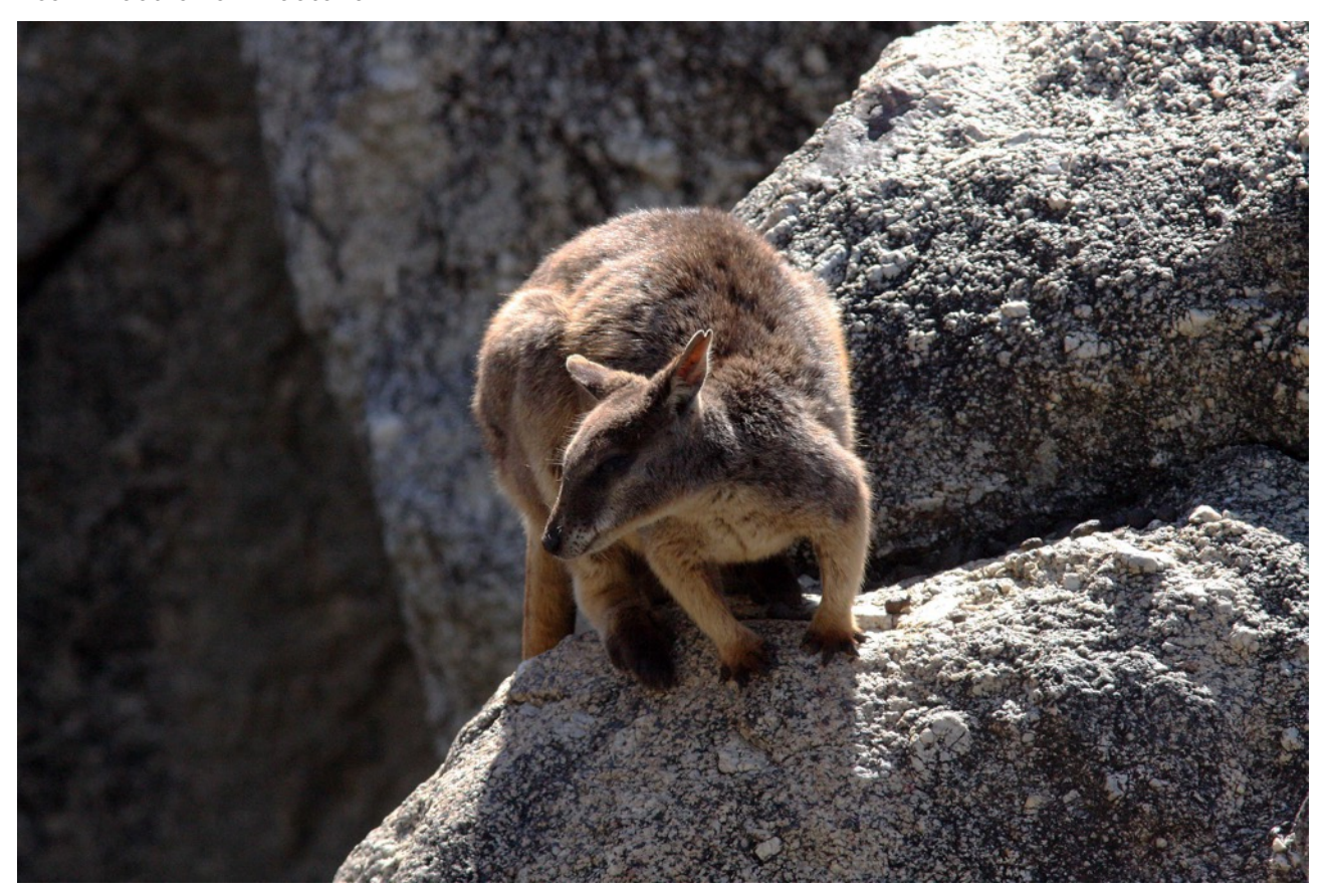
Mareeba Rock Wallaby, Granite Gorge Nature Park

Granite Gorge Nature Park is close to Mareeba. It is a small area, well-known for the Mareeba Rock Wallabies , but also pretty good from a birder's point of view. This was the only place where I saw Squatter Pigeon , and the only place apart from Mary Farms where I saw Australian Bustard .