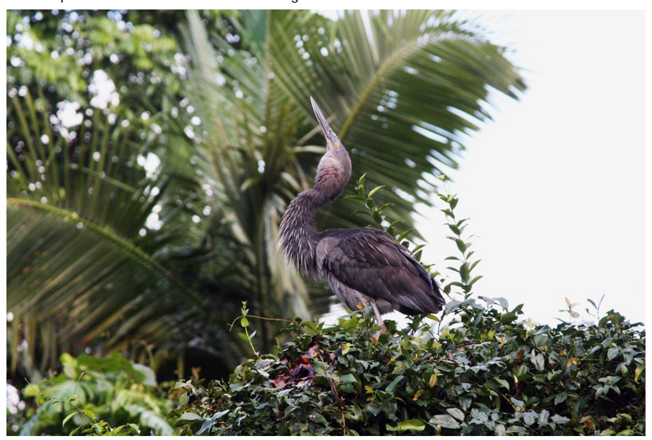
Great-billed Heron, Daintree River

tourists and birding was very slow. I walked Jindalba-, Marrdja- and Dubuji Boardwalks, the most interesting sighting being a Noisy Pitta at Jindalba Boardwalk. If you decide to skip the Cape Tribulation area, which I recommend, one day in Daintree Village with a boat trip on Daintree River will be enough.