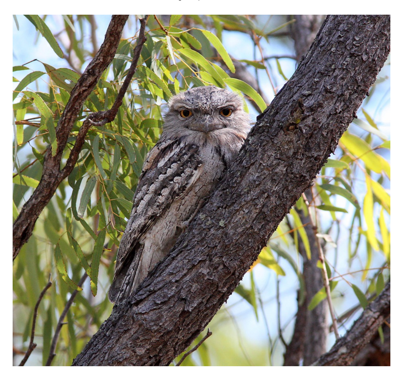
Tawny Frogmouth, Mt Carbine Campground

corrugated and I did not want to take any risks with my rental car, why I unfortunately never had the chance to secure the target species at this site.