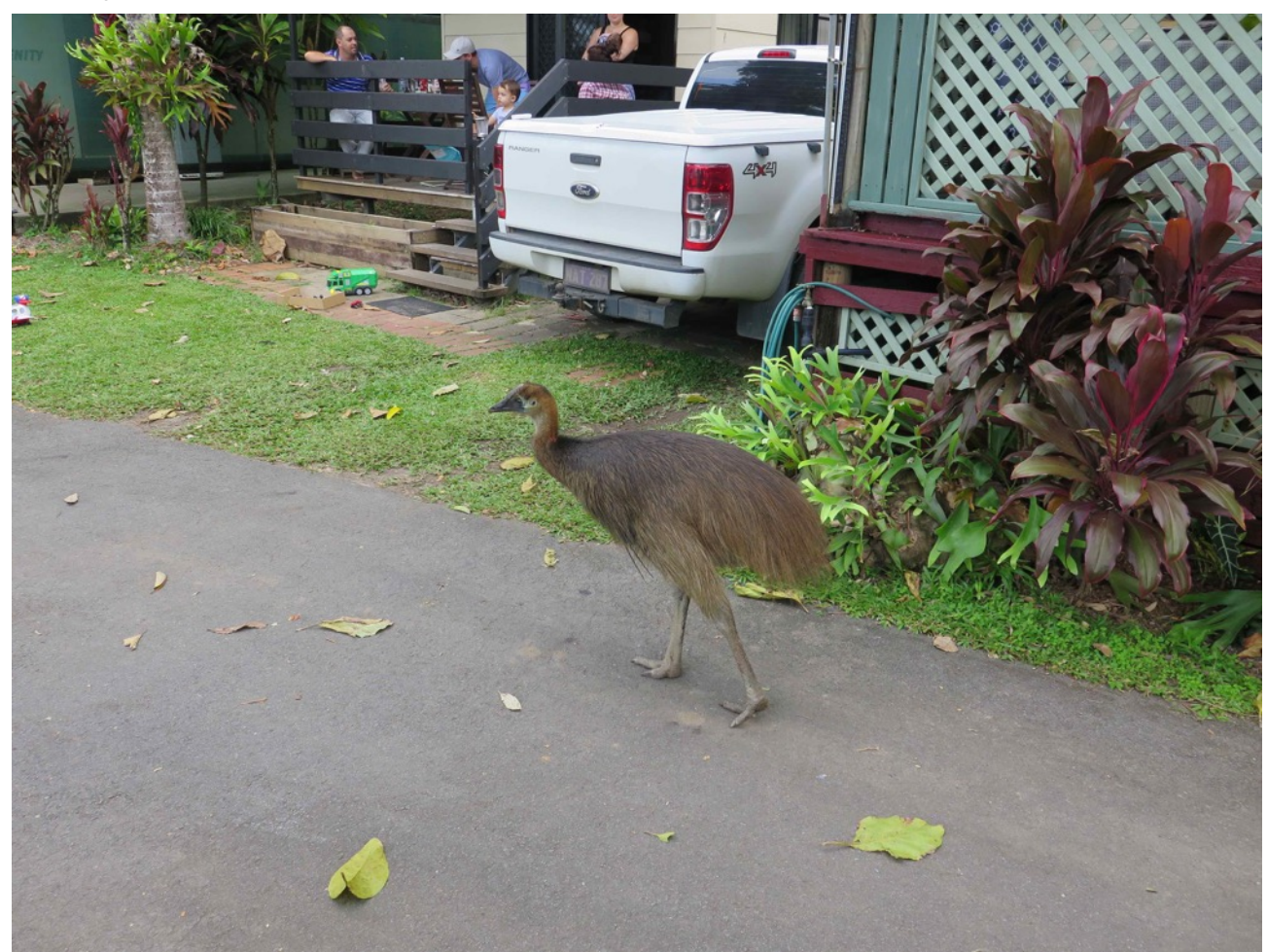
Southern Cassowary, Etty Bay

Etty Bay is visited by birders from all over the world for one reason - it is probably the best place to see Southern Cassowary in Australia. They are usually found around the small camping area, on the beach or along the last stretch of the road to the bay. It did not take me many minutes after arrival to find a 1cy bird. I also scanned the sea from the bay, which produced two Australasian Gannets .