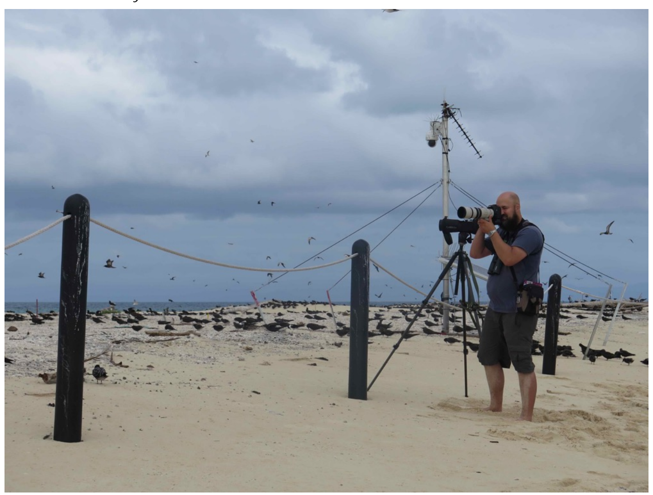
Michaelmas Cay - a birder's heaven!

I visited Michaelmas Cay and Hastings Reef with Seastar Cruises. I decided to focus on birding while on Michaelmas Cay and snorkeling at Hastings Reef. This was a good decision as there were almost no birds at the reef, but plenty to see below the surface. It was an almost "divine" experience to stand on the sand beach on Michaelmas Cay. Birds were everywhere around, and photo opportunities incredibly good. I spent almost an hour there watching Great Frigatebird , Brown Booby , Brown Noddy and Black-naped- , Greater Crested- and Sooty Tern .