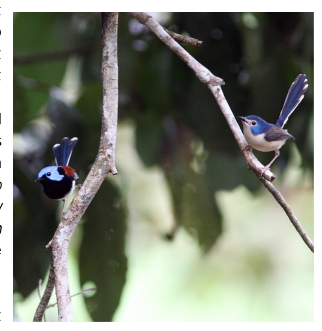
Lovely Fairywren, Stewart Creek Road