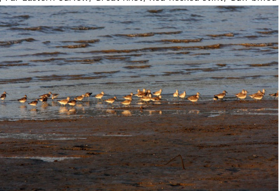
Great Knot, Cairns Esplanade

species seen there were Little Kingfisher, Raja Shelduck, Rose-crowned Fruit Dove, Double-eyed Fig Parrot and Metallic Starling.