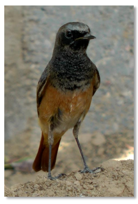
109 Northern Wheatear Oenanthe oenanthe 1 Mudayy 27.2.