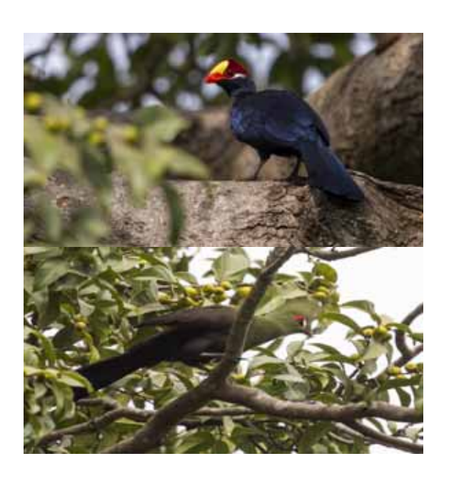
Violet and Green Turaco in the Abuko nature Reserve.

In the other end of the reserve there are Animal Orpahneges with Hyenas, Baboons and big turtles. There is also a small photo hide with a small pool. We had to ask if they could open it for us and it they want 100 dahlasis (20 SEK) for access it. It was very good with a lot of small birds like Red-billed Firefinch, Bronze Mannakin, Sunbirds and Weavers.