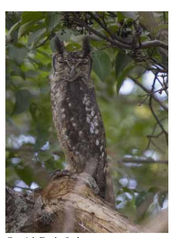
Grayish Eagle Owl