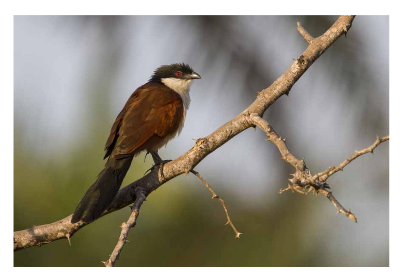
A Senegal Coucal along the Casino Cycle Track.