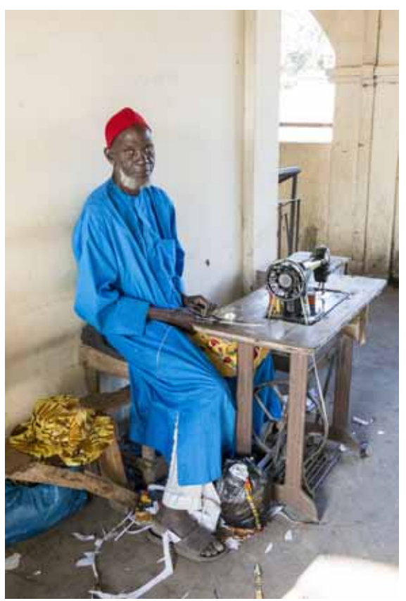
A tailor at Albert Market.