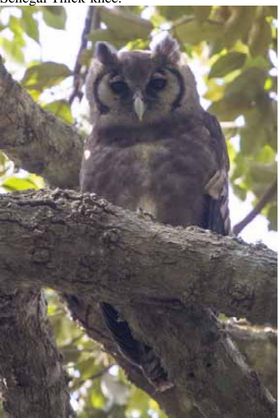
Verreaux's Eagle Owl

edge of the forest where there was a white Senegal Thick-knee.