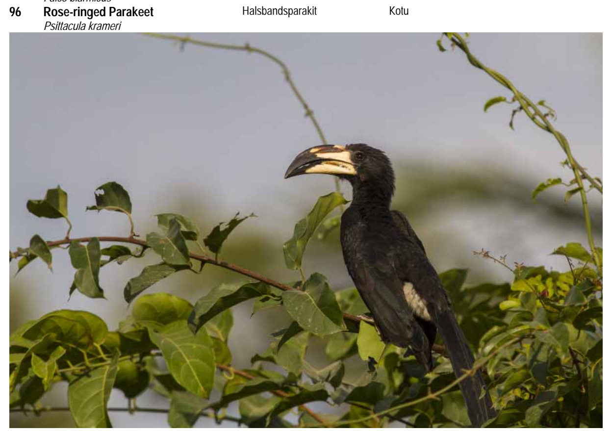
African Pied Hornbill