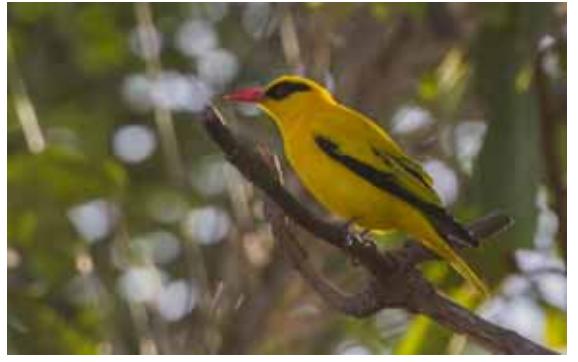
African Golden Oriole