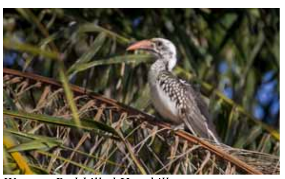
Western Red-billed Hornbill

On the way back from Tujering we made a short stop at Tanji Beach primarily to look for pelicans. There were a group of Pink-backed Pelicans but we also some Royal Terns together with a large group of Caspian Terns.