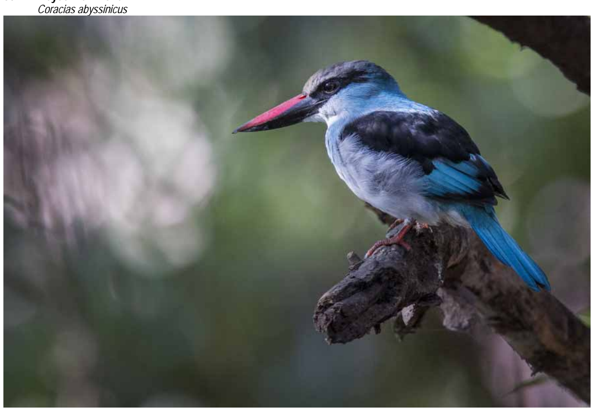
Blue breasted Kingsfisher