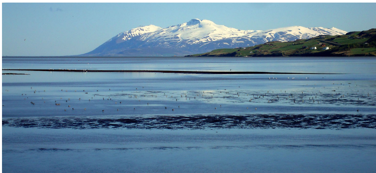
Feeding shorebirds dotted out in a bay at Akureyri.