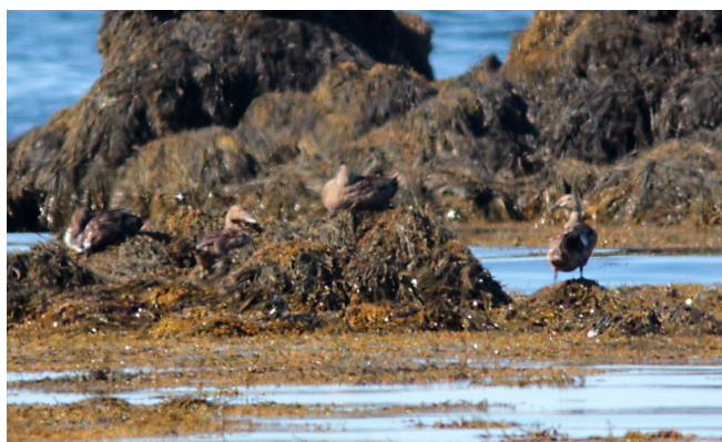
'Queen' Eider (right) at Bredvik on S Snæfellsnes.