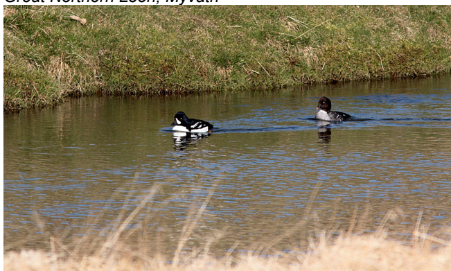
Barrow's Goldeneye, easy to spot at Laxá