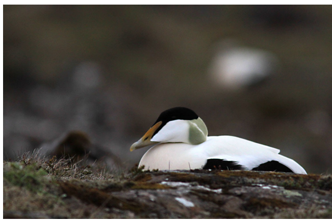
'Borealis'-Eider in a breeding colony south of Sandgerdi, note prominent forehead and yellow base to bill.