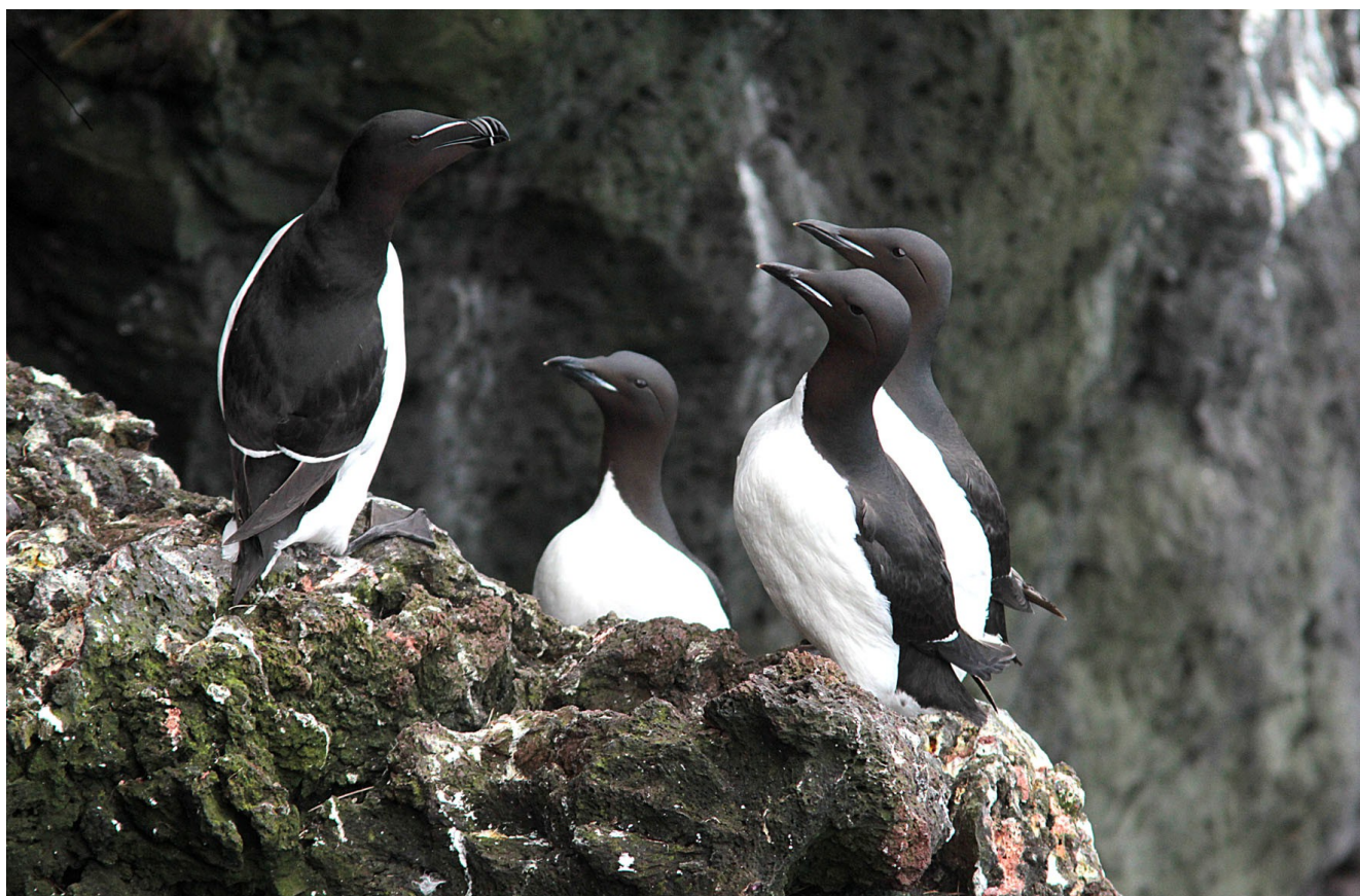
Razorbill and Thick-billed Murres at Svörtuloft, Snæfellsnes.