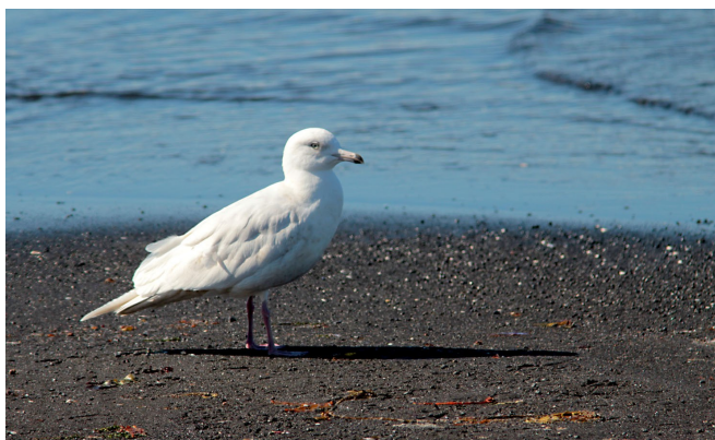
Iceland Gull probable 3cy (e.g. yellow iris), Húsavík