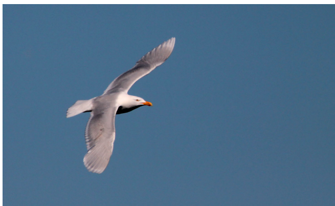
Adult Glaucous Gull, Snæfellsnes