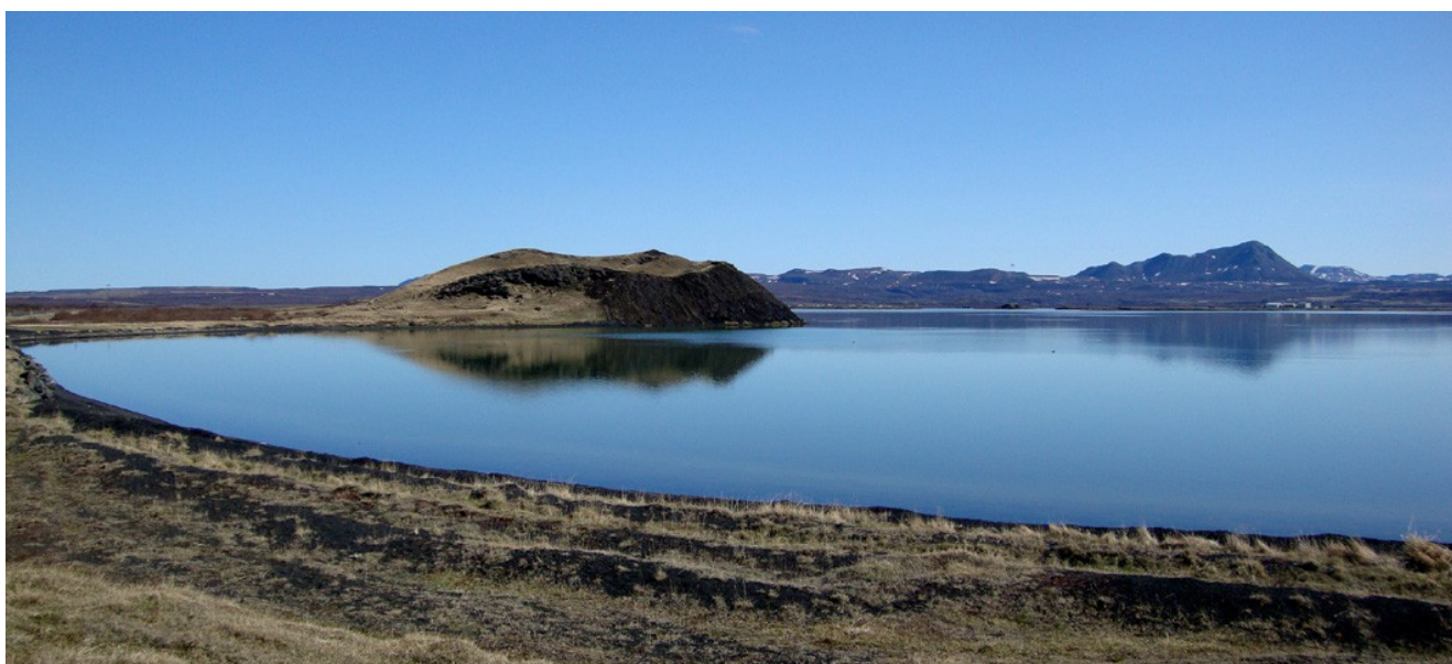
Mývatn in a perfect setting. Warm, calm and sunny.