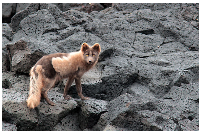
Firstly unaware of my presence this Arctic Fox, just about to loose its winter fur, walked just pass me at Öndverðarnes.

Rare news at Facebook: https://www.facebook.com/birdingiceland