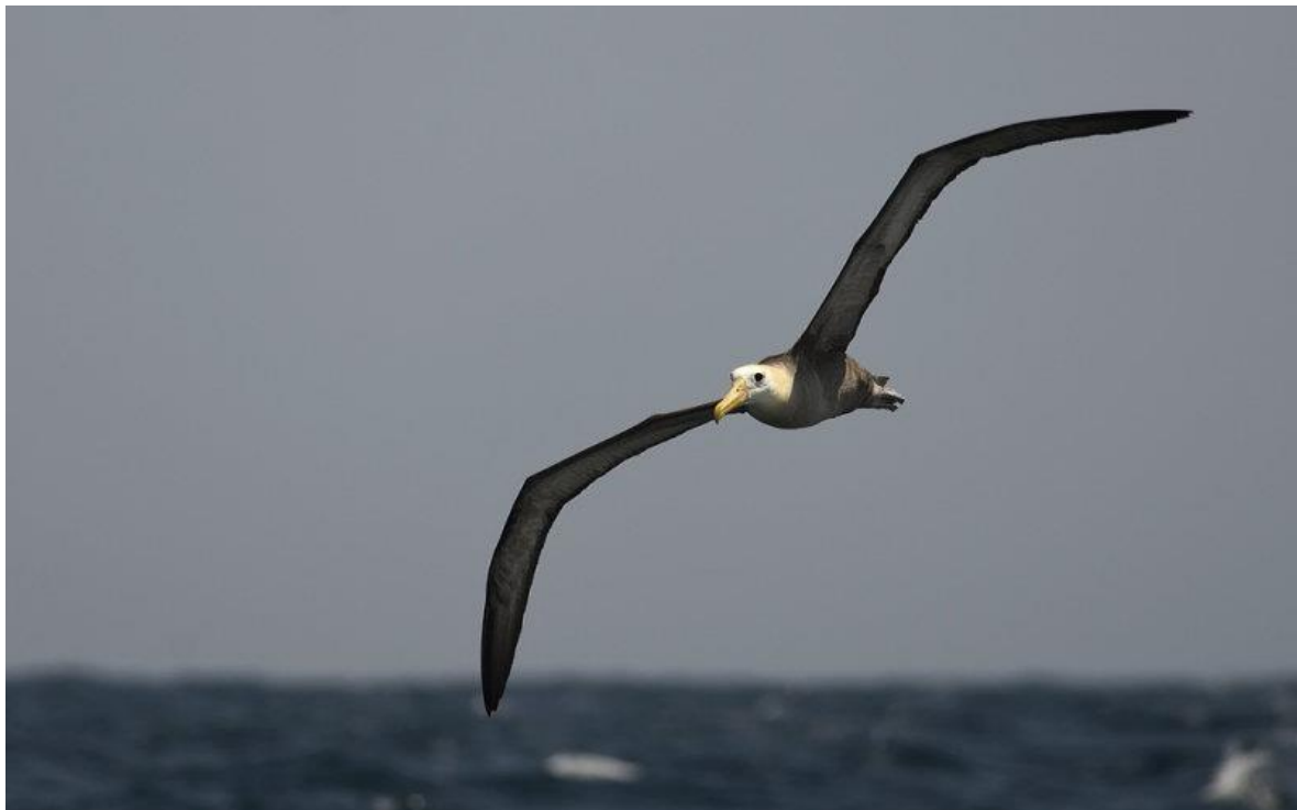
Waved Albatross Phoebastria irrorata