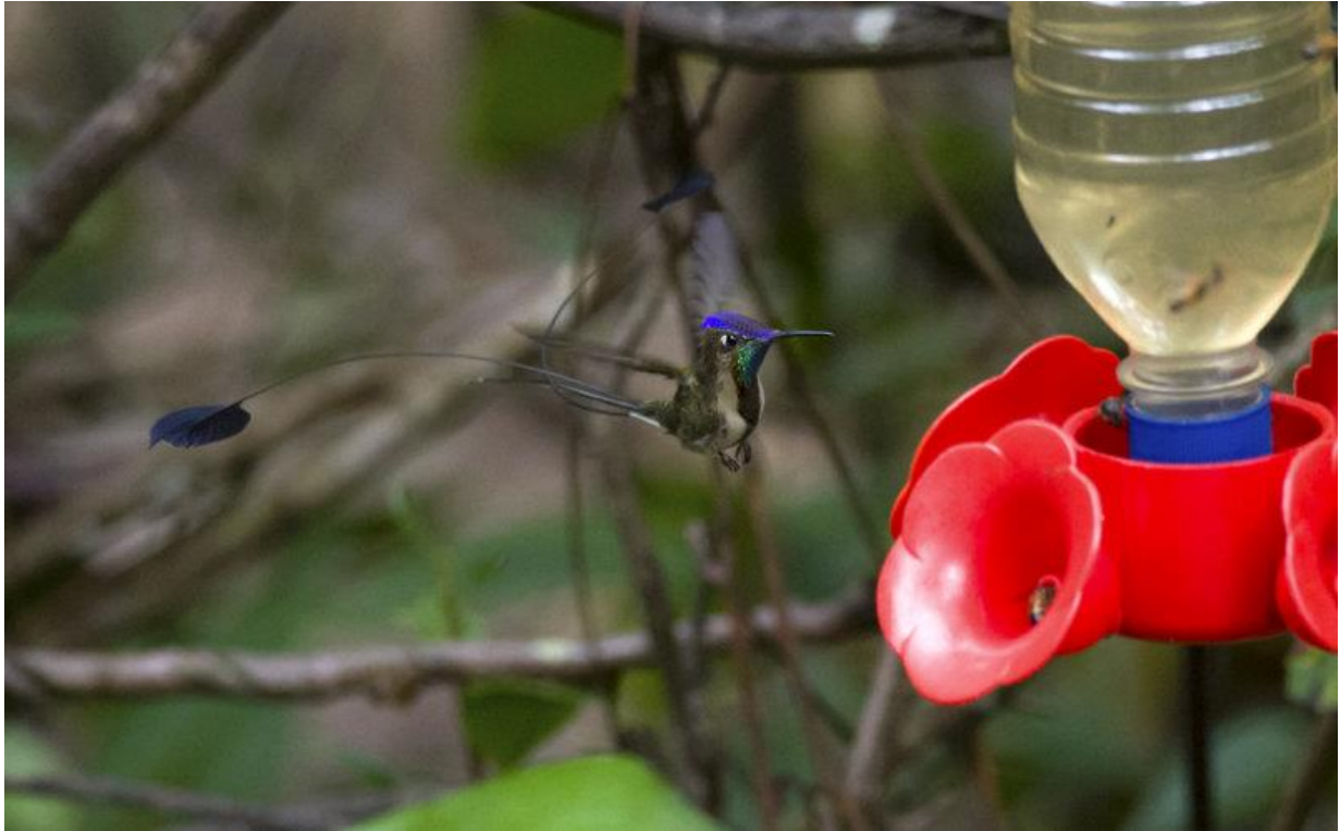
Marvellous Spatuletail Loddigesia mirabilis