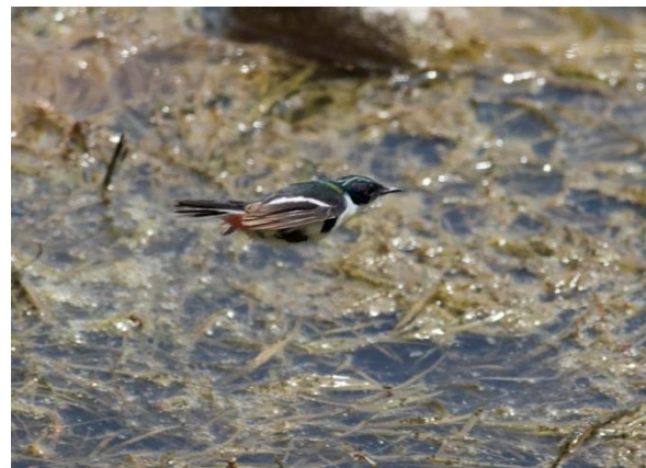
Many-colored Rush Tyrant Tachuris rubrigastra