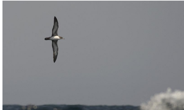
Pink-footed Shearwater Puffinus creatopus