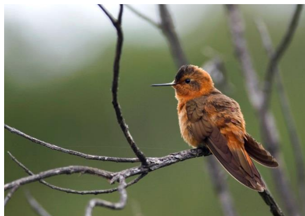
Shining Sunbeam Aglaeactis cupripennis

From Celendín to Balsas we birded along the road. We stopped at a few places in the morning (closer to Celendín) and then birded our way down to Balsas which is in the Marañón valley. The habitat was progressively drier the closer to Balsas we came. This is because the west slope of the valley sees very little rain. Never the less it produced some nice birds like Bare-faced Ground Dove, Black-necked