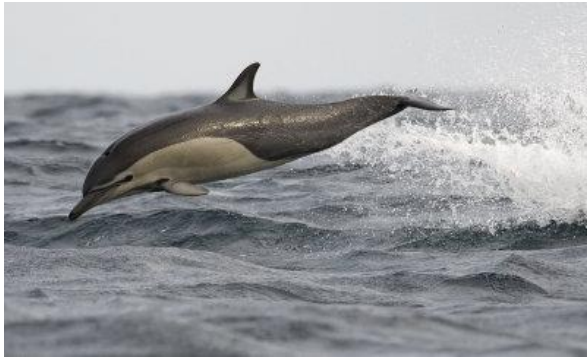
Short-beaked Common Dolphin Delphinus delphis