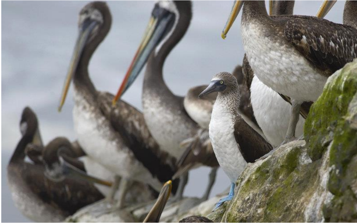
Blue-footed Booby Sula nebouxii and Peruvian Pelican Pelecanus thagus