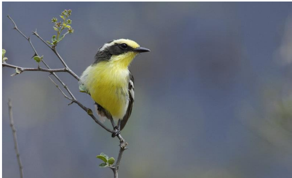
Tumbes Tyrant Tumbezia salvini

Quebrada Frejolillo near Limon is the(?) best place to see White-winged Guan in the wild. We spent half a day here and saw 4 guans. The ravine (quebrada) and the road leading to it also holds a number of other hard to find species like Pale-browed Tinamou, Red-masked Parakeet (only seen here), Peruvian Screech-Owl, Tumbes Hummingbird, Elegant Crescentchest, Grey-breasted Flycatcher, White-headed Brush Finch and the endemic Tumbes Tyrant.