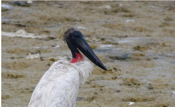
Jabiru Jabiru mycteria

We stayed about 15 km south of Máncora in a small village called Organos. A few kilometers north along the road there was a good birding spot just where a small stream crosses the road. To the cagrín of Anders a Jabiru was seen here. Well out of its normal range. Other birds along the road were Coastal Miner (endemic), Parrot-billed Seedeater and Short-tailed Field Tyrant.