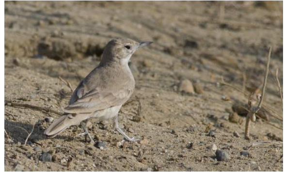
Coastal Miner Geositta peruviana