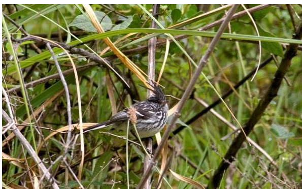
Black-crested Tit-Tyrant Anairetes nigrocristatus

In Cajamarca we stayed at Hotel Hazienda Yanamarca , a very nice hotel a few kilometres south of the city. In the evening we heard Koepcke's Screech-Owl here.