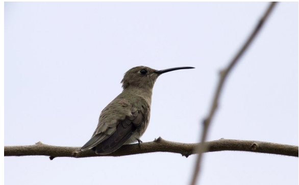
Tumbes Hummingbird Leucippus baeri