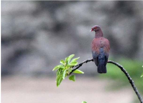
Marañon (Peruvian) Pigeon Patagioenas oenops