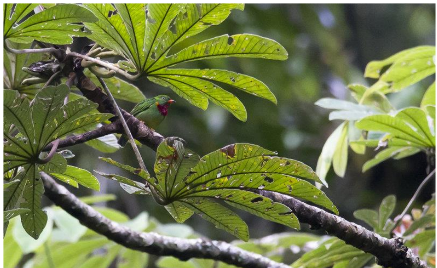
Fiery-throated Fruiteater Pipreola chlorolepidota

We followed the road about 2 kilometres south to a place called Ruminyaco. Here we walked a trail to the right of the road. Still some good habitat around here. Golden-collared Toucanet, Lettered Aracari and Stripe-chested Antwren among others.