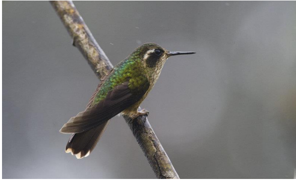
Speckled Hummingbird Adelomyia melanogenys