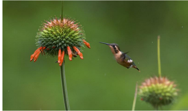
Little Woodstar Chaetocercus bombus

Along the road from Pedro Ruíz to Jaén we were lucky to see Fasciated Tiger Heron. In a tree were 2 Bat Falcons perched. Fairly close to Pedro Ruiz was an area with seemingly very nice moist forest habitat. This area is well worth exploring. We only stopped for a short time and saw e.g. Blue-black Grosbeak. Closer to Jaén in drier habitat we found Little Inca Finch and Red Pileated Finch.