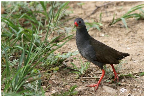
Paint-billed Crake Neocrex erythrops

South of the city the habitat is a bit drier. We stopped at about 5 km south and managed to find the endemic Chinchipe Spinetail, Tawny-crowned Pygmy Tyrant and Little Inca Finch.