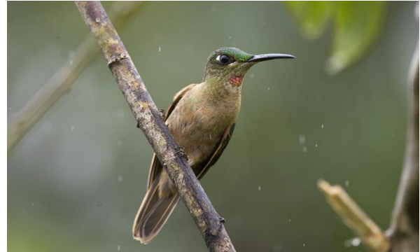
Fawn-breasted Brilliant Heliodoxa rubinoides

The second day we stayed in the reserve. The morning was spent on "Monkey Trail". Here we had birds like the endemics Lulu's Tody-Flycatcher and Rusty-tinged Antpitta. Around the lodge we had a few Yellow-scarfed Tanager (endemic), Amethyst-throated Sunangel, Andean Tyrant and Rufous-capped Thornbill.