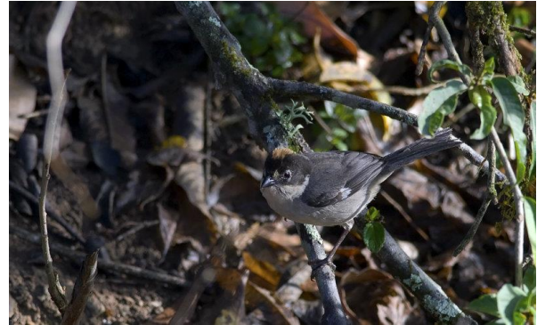
White-winged Brush Finch Atlapetes leucopterus