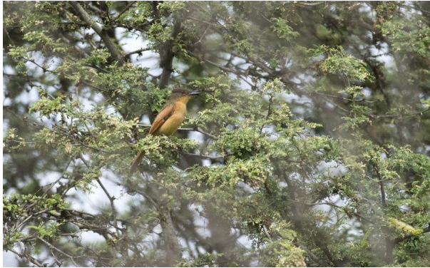
Rufous Flycatcher Myiarchus semirufus

Flycatcher (endemic) and Tumbes Swallow of which we saw all. There is also a possibility to see Black-faced Ibis in this area but we missed it.