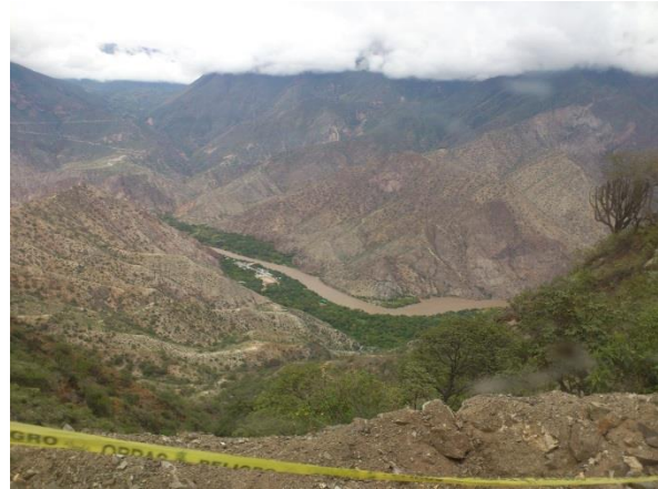
View of Balsas

The main target in Balsas is the rare (BirdLife estimates a population between 350-1500 individuals) Yellow-faced Parrotlet. Which we all eventually managed to see well. An Andean Gull flew by the river and we also saw a few Marañon Pigeon. Further east towards Abra Barro Negro we stopped and found the Marañon Crescentchest.