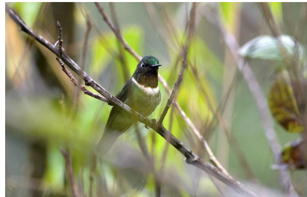
Amethyst-throated Sunangel Heliangelus amethysticollis

In the evening we birded down along "Owlet Trail" in hope for the elusive owlet. The weather improved a little bit and our hope increased. Along the trail and waiting for the dark we found Ochre-fronted Antpitta (endemic), White-backed Fire-eye and tawny-bellied Hermit. From dusk we waited for what seemed forever. Suddenly a faint hoot far away. We followed the track without lights and with all the raining the last days it was more of a stream than an actual trail. Eventually we came closer and we could all hear the hoot of the LONG-WHISKERED OWLET. We tried hard but could not locate the bird. Happy, wet and tired we walked back to the lodge and a well-deserved dinner.