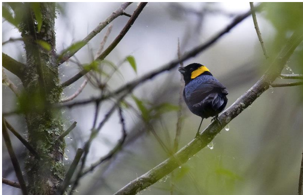
Yellow-scarfed Tanager Iridosornis reinhardti

The second day we stayed in the reserve. The morning was spent on "Monkey Trail". Here we had birds like the endemics Lulu's Tody-Flycatcher and Rusty-tinged Antpitta. Around the lodge we had a few Yellow-scarfed Tanager (endemic), Amethyst-throated Sunangel, Andean Tyrant and Rufous-capped Thornbill.