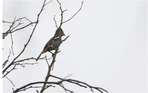
Peruvian Plantcutter Phytotoma raimondii