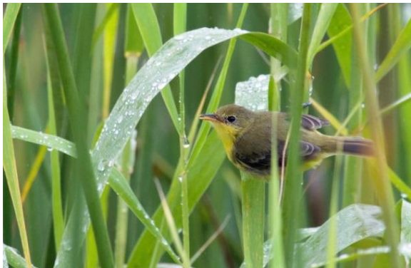
Subtropical Doradito Pseudocolopteryx acutipennis

In Pomacochas we stayed three nights at Las Brisas. The town is over-seeing the lake with the same name. At the pier there is a reed which holds Plumbeous Rail and Subtropical Doradito. In the surrounding grassland we found Puna Snipe, Andean Lapwing and Grassland Yellow Finch.