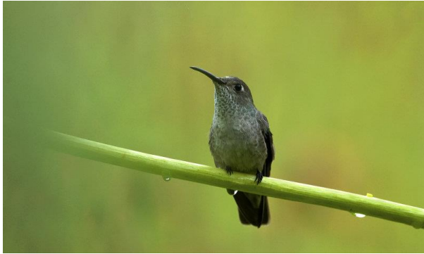
Spot-throated Hummingbird Leucippus taczanowskii

Along the road from Leymebamba to Pedro Ruiz we stopped at a couple of fields with orange flowers. Both places had hundreds of hummingbirds. Species included White-bellied and Spot-throated (endemic) Hummingbird, Little and Spot-throated Woodstar and the very common Sparkling Violetear.