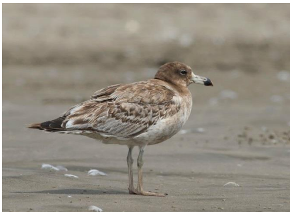
Band-tailed Gull Larus belcheri

Further south in Puerto Etén birding from the pier is recommended. A lot of sea birds can be seen here. Yet further south a breeding colony of Blue-footed and Peruvian Booby and Peruvian Pelican can be found at Punto Etén. Here is also a breeding station for Humboldt Penguin, not tickable unfortunately.