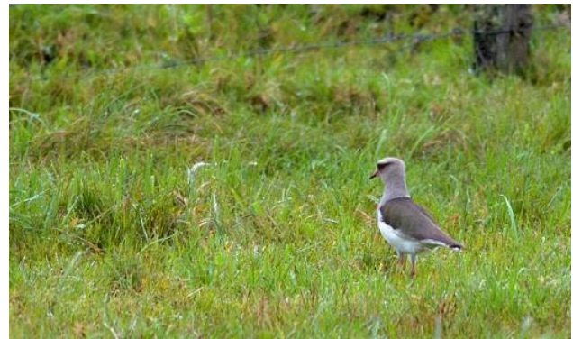
Andean Lapwing Vanellus resplendens

Close to Pedro Ruíz we passed a place where there seemed to be a salt lick, 100's of Scarlet-fronted Parakeet and Scaly-naped Amazon were flying around here. Going from Pedro Ruíz to Pomacochas you pass by Huembo Interpretation centre which is managed by ECOAN . They have hummingbird feeders which holds a lot of hummingbirds. During our short stay we saw 10 species including the very rare and local Marvellous Spatuletail (endemic). Other species seen included Purple-throated Sunangel, Little Woodstar, Violet-fronted Brilliant and White-bellied Hummingbird.