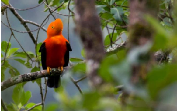
Andean Cock-of-the-rock Rupicola peruvianus

Further down (east) we stopped where the road crosses a small river. This place is called Aguas Verdes and here we saw Yellow-crested Tanager and Striolated Puffbird.