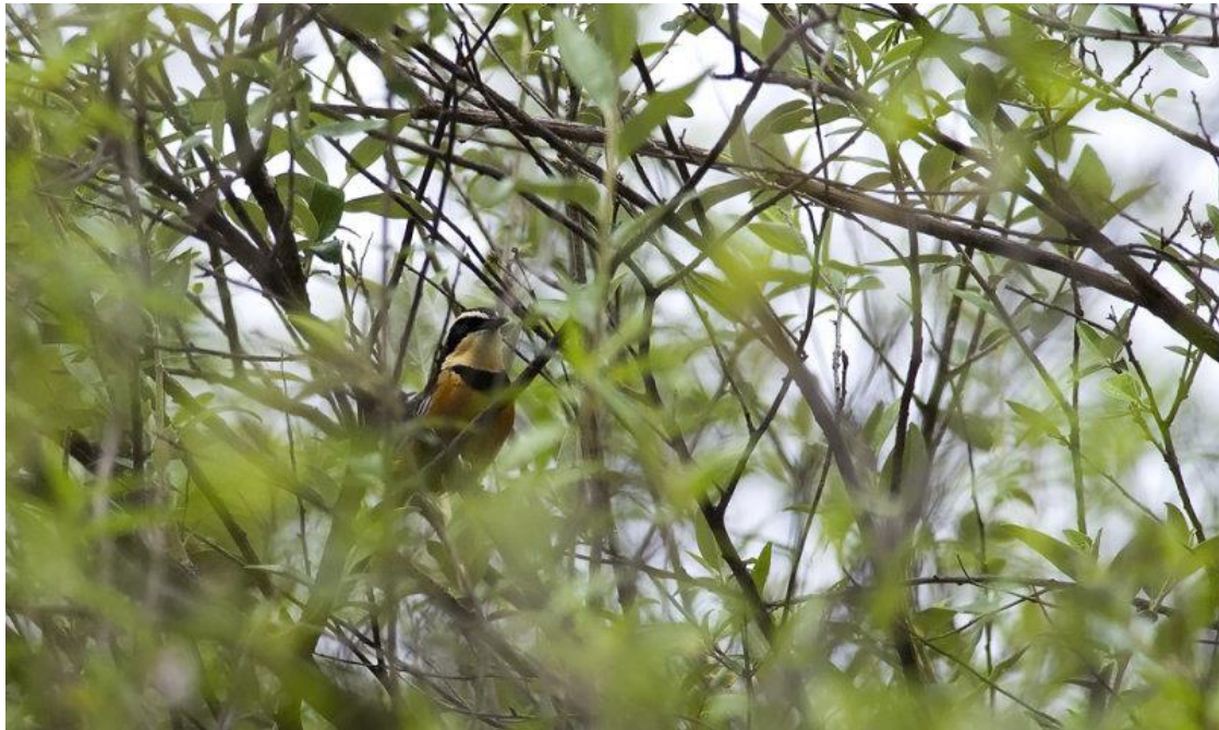
Marañon Crescentchest Melanopareia maranonica

The main target in Balsas is the rare (BirdLife estimates a population between 350-1500 individuals) Yellow-faced Parrotlet. Which we all eventually managed to see well. An Andean Gull flew by the river and we also saw a few Marañon Pigeon. Further east towards Abra Barro Negro we stopped and found the Marañon Crescentchest.