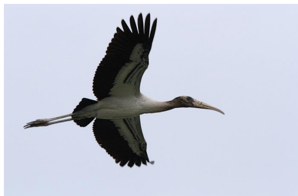
Wood Stork Mycteria americana

About 50 km north of Jaén past the small town of Chirinos you can still find some nice forested areas. E.g. we found White-winged Brush Finch of the distinct subspecies paynteri , Red-billed Parrot and Chestnut-bellied Thrush. We also heard Scaled and Plain-backed Antpitta.