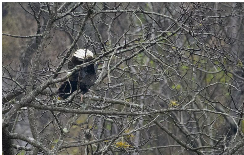
White-winged Guan Penelope albipennis