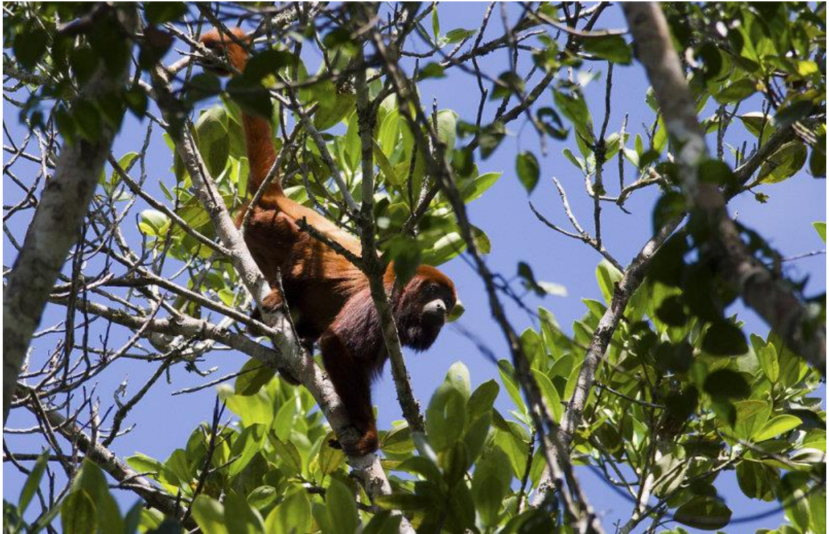
Venezuelan Red Howler Alouatta seniculus