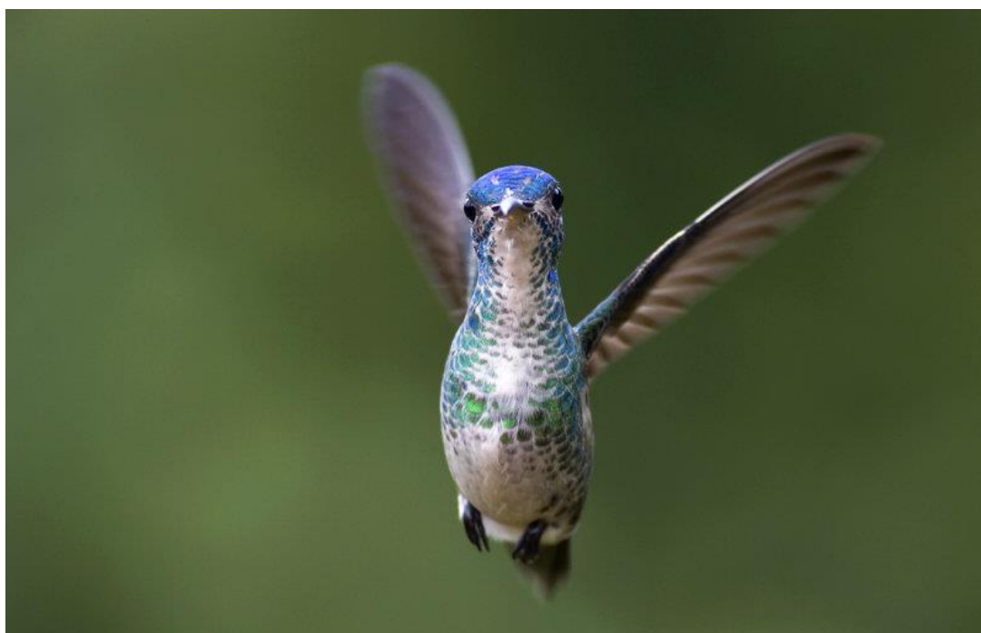
Golden-tailed Sapphire Chrysuronia oenone

Front page: Great-billed Hermit Phaethornis malaris