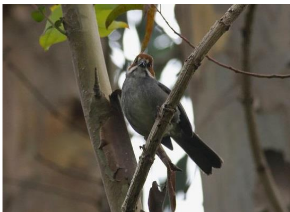
Rufous-eared Brush Finch Atlapetes rufigenis

We birded a few places along the road. First from Cajamarca to Celendín we stopped at La Encañada. The best birds but certainly not the only ones was Shining Sunbeam, Sword-billed Hummingbird (the only one seen on this trip), Giant Hummingbird, Black-tailed Trainbearer. We also heard (saw?) Rufous Antpitta of the cajamarcae-subspecies. We also saw the endemic Rufous-eared Brush Finch. Band-tailed Sierra Finch and Mountain Caracara were both seen along the road towards Celendín.