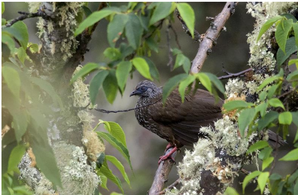
Andean Guan Penelope montagnii