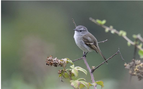
Tumbesian Tyrannulet Phaeomyias tumbesana

While in this area we stayed at El Remanzo lodge in Olmos. Stellan managed to see his bird no. 3000 a very beautiful Plumbeous-backed Thrush. This was of course celebrated with sparkling wine!