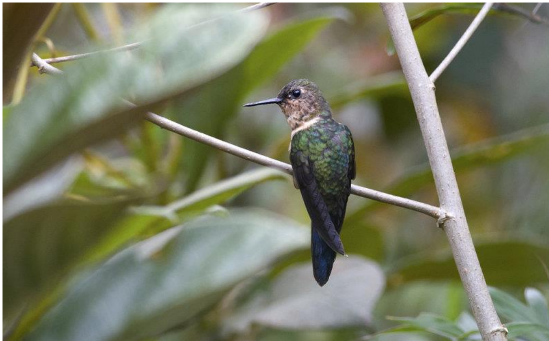
Royal Sunangel Heliangelus regalis