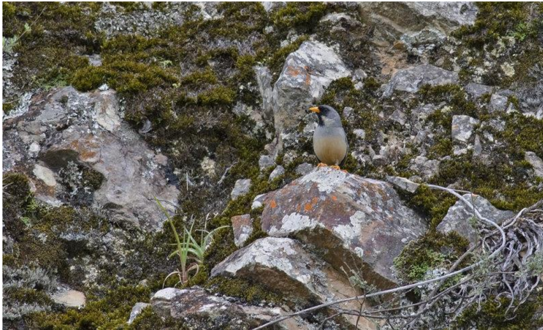
Buff-bridled Inca Finch Incaspiza laeta

but unfortunately we missed it. We did however have a few good birds like Buff-bridled Inca Finch and White-winged Black Tyrant. Black-necked Woodpecker is also possible here. Along the road from Cajamarca to San Marcos is a small lake called Laguna Suyuscocha. Here we found the only Andean Coot that we saw during our trip and White-tailed Shrike-Tyrant was also present here.