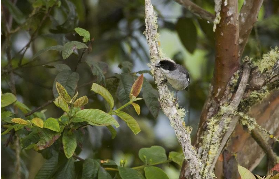
White-winged (Paynter's) Brush Finch Atlapetes leucopterus ssp. paynteri

On the evening of January 2 nd Anders 40 th birthday was celebrated with cake (Peruvian style) and Pisco!