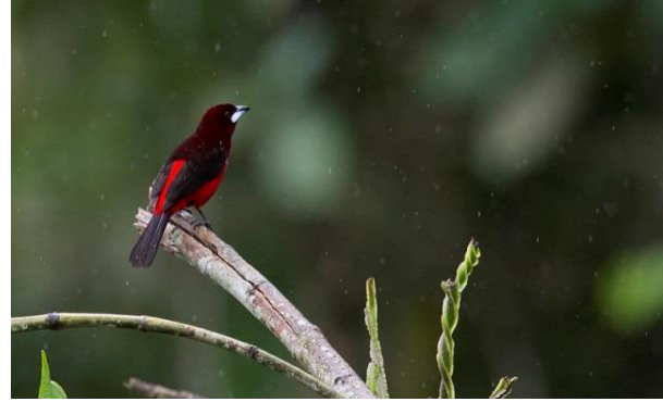
Huallaga Tanager Ramphocelus melanogaster