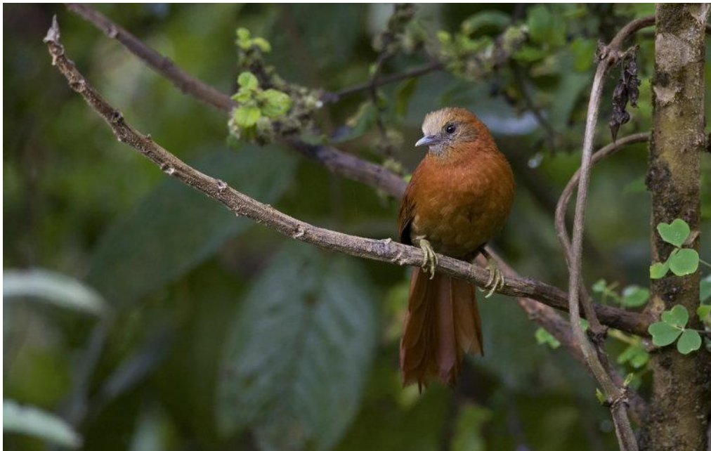
Russet-mantled Softtail Thripophaga berlepschi

We birded a few places along the road but the real reward is when you get to and around the pass. The habitat is humid montane forest. Unfortunately for us it was very foggy when we were here but we still had some good birding. We found birds like the endemics Coppery Metaltail and Russet-mantled Softtail. Other birds included Andean Guan, White-throated Quail-Dove and hummers like Purple-throated Sunangel, Glowing Puffleg and some of us also saw a Coppery-naped Puffleg (endemic).