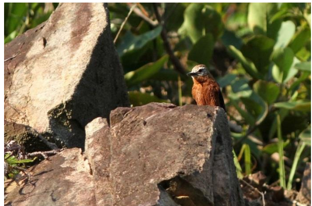
Cliff Flycatcher Hirundinea ferruginea

Continuing further beyond the tunnel going downhill again we eventually came to a place (about 750 masl) where they have hummingbird feeders. We had Koepcke's Hermit (endemic), Grey-breasted Sabrewing, Green Hermit, Gould's Jewelfront and Black-eared Fairy at the feeders. The surrounding habitat is of course also good with Golden-headed and Fiery-capped Manakin and more.