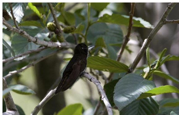
Black Metaltail Metallura phoebe

Further up-stream in the upper section of the canyon we found birds like Mountain Caracara, Andean Hillstar and Mourning Sierra Finch.