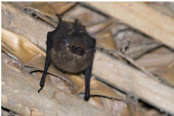
Lesser Sac-winged bat Saccopteryx leptura