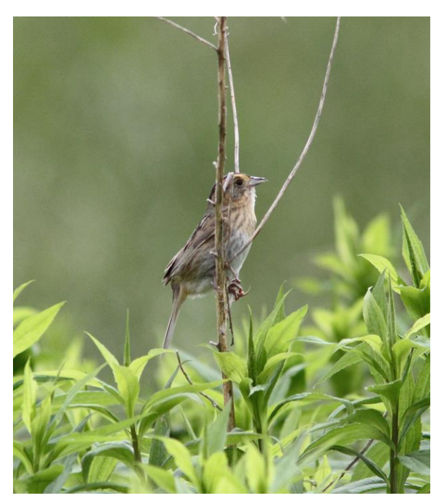
Nelson's Sparrow, Belleisle Marsh

This site is situated approximately 13 kms northeast of Annapolis Royal. Just west of the church in Belleisle there is a gravel road leading south to the marsh. It is possible to drive down this gravel road and park at a designated parking area, before entering the marsh area on foot. The most interesting species we saw here were Nelson's Sparrow, Bobolink, Wood Duck, Turkey Vulture, Sora and Common Nighthawk .