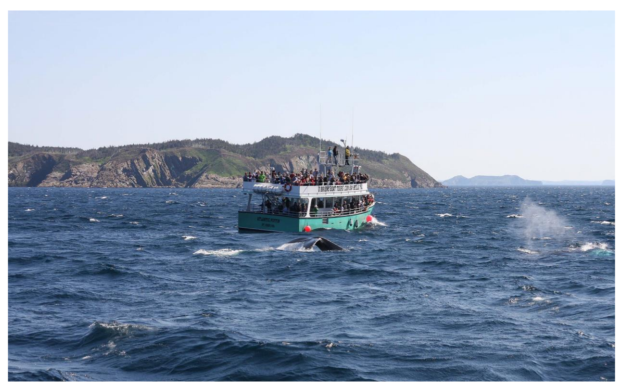
Whale-watching, Witless Bay, Newfoundland

preordered, which we had not been informed about. Furthermore, not even water was served free of charge. Apart from the cost for flights, other major expenses were car rental, ferries and the whale-watching tour. We rented a car via Holiday Autos to be picked up and returned at Halifax Stanfield International Airport. It cost us 4736 SEK for the thirteen days we rented it. Petrol for the entire trip was 420 CAD. We took two ferries during the trip, the first one the long trip from North Sydney to Argentia, which cost us 647 CAD, including a 4-Berth Cabin, and the second one the shorter trip from Port-aux-Basques to North Sydney, which cost us 127 CAD. We had planned to do two whale-watching tours, one on Newfoundland, and one in Nova Scotia (Mariner Cruises, Brier Island). The last one was unfortunately cancelled due to foggy weather conditions. The one on Newfoundland, out on Witless Bay from Bay Bulls, with Gatherall's, was excellent, and well worth the 63,50 CAD pp it cost.