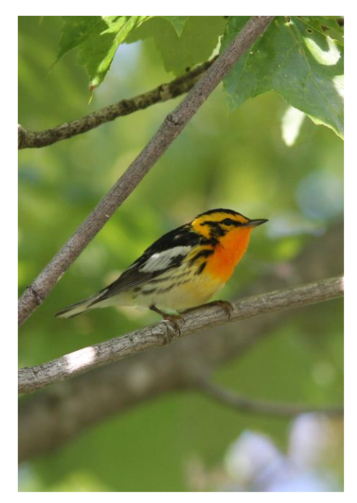
Blackburnian Warbler, Bay Road Valley