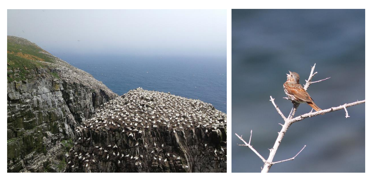
Cape St. Mary's: Northern Gannet colony and Fox Sparrow

This is a must site, both for the birds and the scenery. Among the breeding species encountered here were Black-legged Kittiwake , Thick-billed Murre , Black Guillemot , Razorbill , Great Cormorant , American Pipit and Horned Lark .