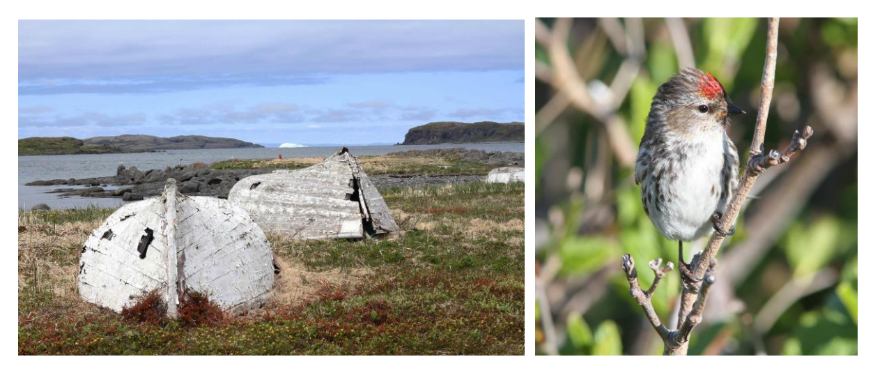
L'Anse aux Meadows

Apart from being an interesting historic site situated at a stunningly beautiful place, it was only here that we encountered Black Scoter , Common Redpoll and White-crowned Sparrow . It is also supposed to be good for Gray-cheeked Thrush , although we never saw any.