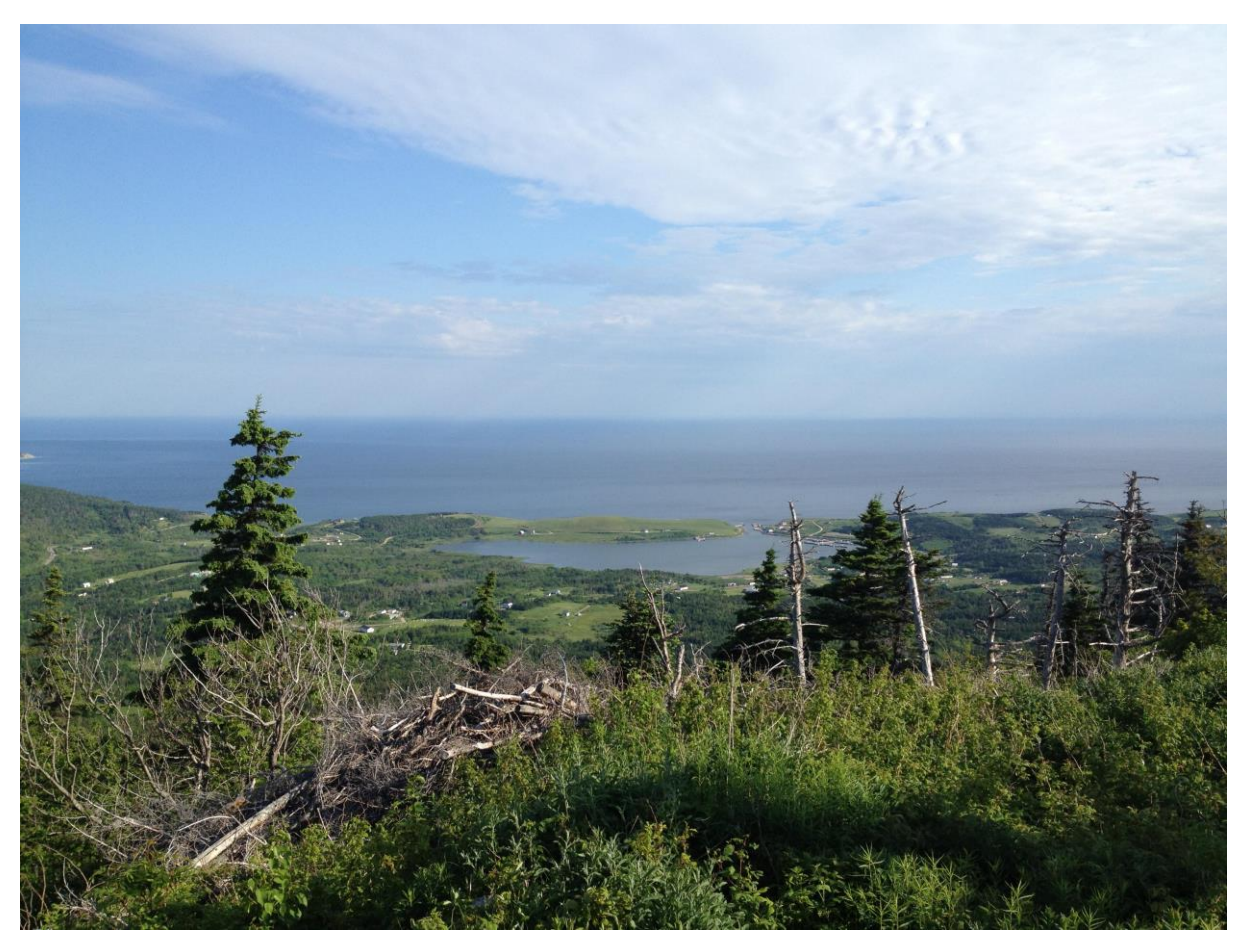
Tower Road, Cape Breton Island