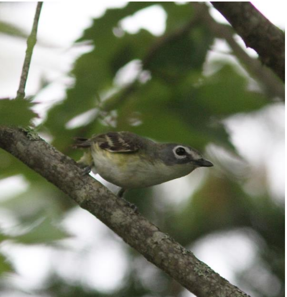
Blue-headed Vireo, Port Joli