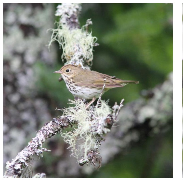
Ovenbird, Jerry Lawrence PP

This site is also known as Lewis Lake Provincial Park and is situated approximately 28 kms west of Halifax. We mainly visited the site as it was a convenient short stop on our way to the airport. The most interesting species we saw here were Black-throated Blue - and Chestnut-sided Warbler and Ovenbird .