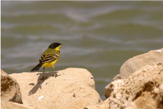
Western Yellow Wagtail (ssp. feldegg), KM20 23.3