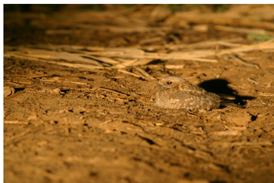
Nubian Nightjar, Ne'ot Hakikar 27.3.