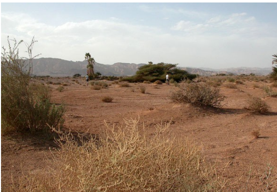
Yotvata, fruitless search for Arabian Warbler 24.3.