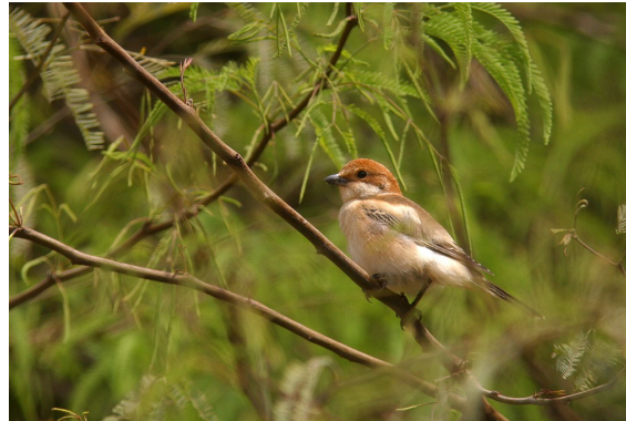
Woodchat Shrike, abberant possibly 2cy-individual, Ofira Park 29.3.