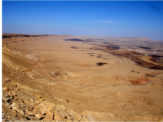
Negev Desert, close to Mitzpe Ramon 26.3.