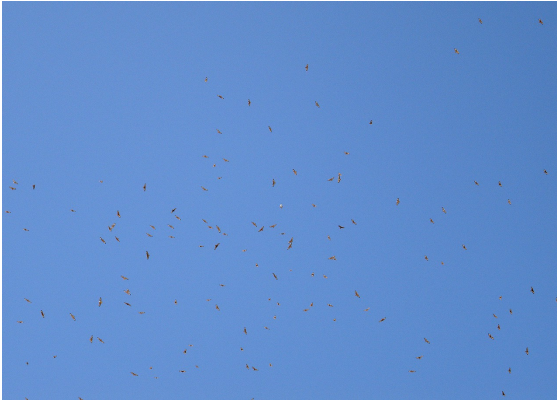
Good movements of raptors, Eilat 24.3.