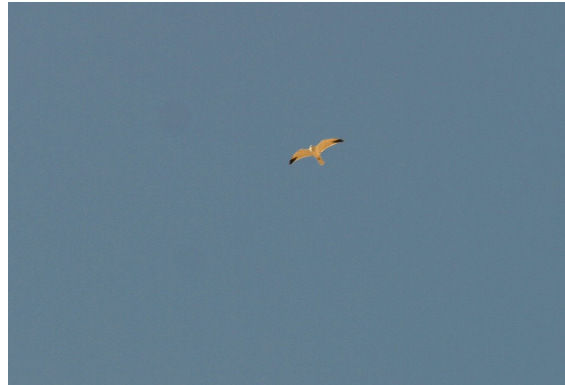
The ghost, Pallid Harrier, Eilat 24.3.