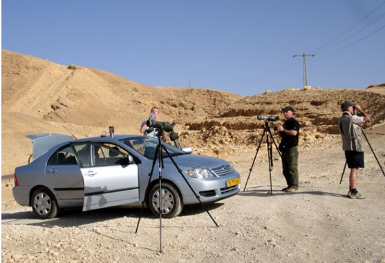
Eilat, high mountain raptor watch 24.3.