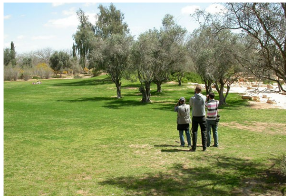
Good views of Syrian Serin at Ben Gurion's grave, Sede Boker 25.3.