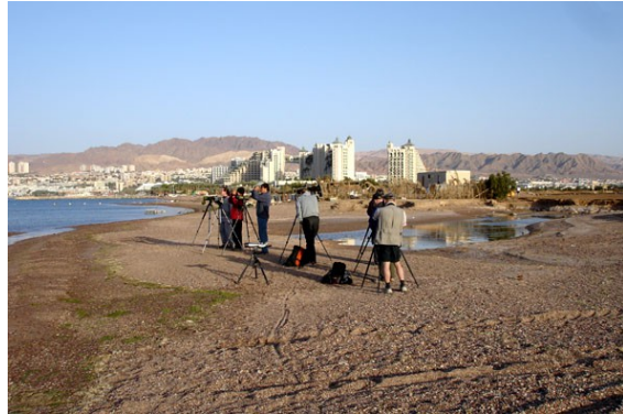
North Beach, morning migration 24.3.