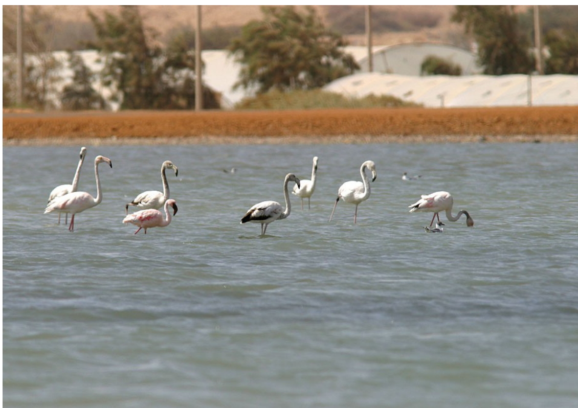
Lesser Flamingo at KM20, 23.3.

The last day of our trip was spent around Eilat. At North Beach very quiet migration and also few migrants in the southern date plantations. At KM20 we found two Collared Pratincoles . And more than 200 Slender-billed Gulls . After returning the car at 09.30 we spent the last two hours in Ofira Park. A beautiful male Collared Flycatcher was the last trip-tick that was added to our list. When waiting for our transport to the airport we noted good raptor migration just above the hotel grounds and soon we found a Short-toed Snake Eagle , this was a nice ending to the trip, and a final proof of what a tremendous birding place Eilat is.