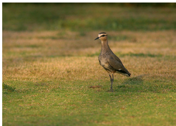
Sociable Lapwing, Kibbutz Lotan 26.3