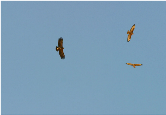
Lesser Spotted Eagle and two "Steppe" Buzzards, Eilat 24.3.