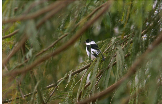
Collared Flycatcher, Ofira Park 29.3.