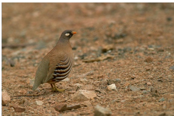
Sand Partridge, Eilat Mountains 28.3