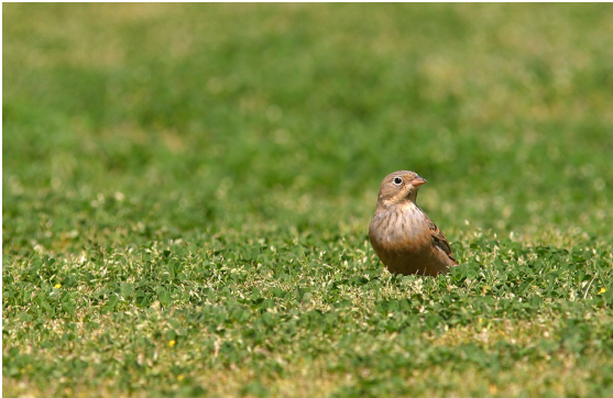
Cretzschmar's Bunting, female, Ben Gurion's grave 25.3.