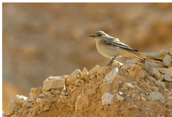
Syrian Serin, Ben Gurion's grave, Sede Boker 25.3 Hooded Wheatear, female, Mt Yoash, Eilat 26.3