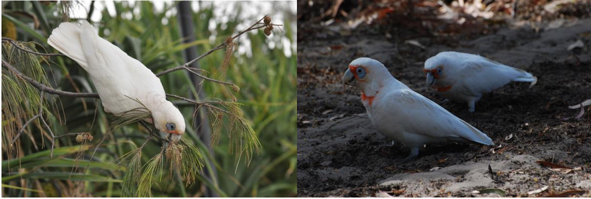
Little and Long-billed Corella