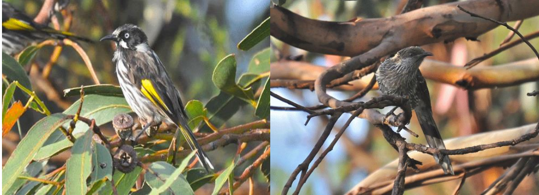
New Holland Honeyeater

10 Lamington N.P 5/2, 3-4 Wild Dog Creek, Apollo Bay 16-18/2 and common Halls Gap, Grampians 21/2.