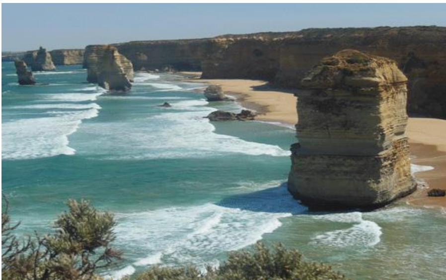
Twelve Apostles, a famous landmark along the Great Ocean Road.

Fantastic scenery, we visited the place in the middle of the day with +40 degrees. Behind the small café there is a waste water pool where we had our first Australian Crake and also an Australian Grebe.