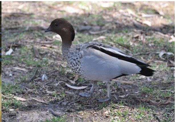
Maned Duck, male