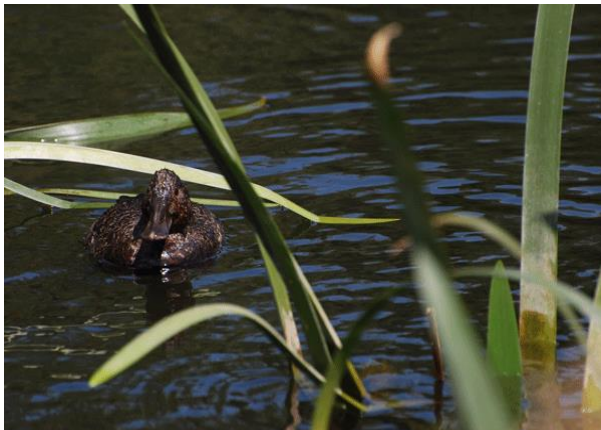
Musk duck, female

4 (1 male+3 female) Triabunna Wetland 14/2, 1 female Apollo Bay 19/2, 1 female Port Fairy 19-20/2, 3 Tower Hill State Reserve 19/2, 1 female Lake Fyans, Pomonal 21/2 and 2 female Lake Wendouree, Ballarat 22/2.