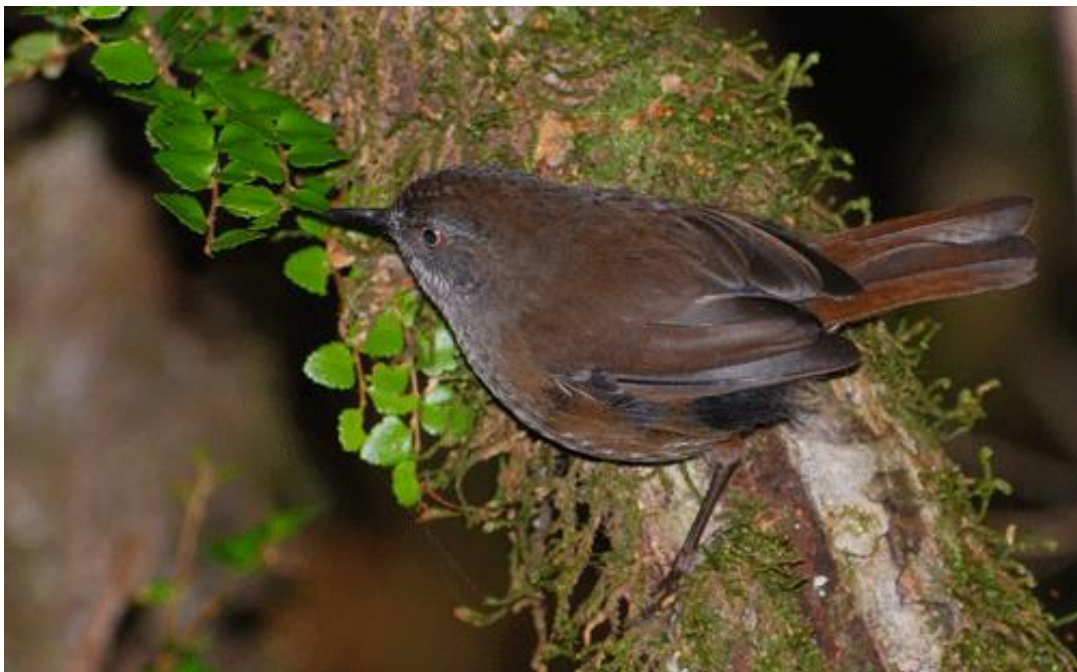
Scrubtit, one of Tasmania's twelve endemic species.

This mountainous area is maybe most famous for its scenery and hiking tracks, but also for a fair chance to see some of the Tasmanian endemics, like Scrubtit, Tasmanian Scrubwren and Tasmanian Thornbill. There are also a lot of mammals around and the only Platybus of the trip lived in the pond behind our cabin. The tracks around was well marked and maintained. Some of them are really worth the walk just for the nature and scenery. An hour night safari trip helped us to sort out the wallabies. The second night we walked along the main road by ourselves equipped with a torch each and we sure did see loads of mammals.