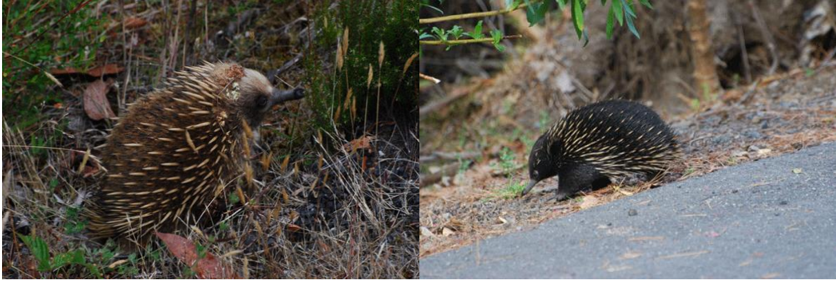
Short-beaked Echidna, Tasmanian and mainland forms.