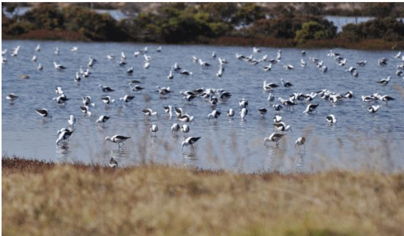
Some of the Banded Stilts at point Henry Saltwork.

The very last birding was done here because it is a relatively high chance of seeing Banded Stilt and Red-necked Avocet. A little challenging place though one have to realize that it's along a road with heavy traffic, there are not many places to pull over the car and get out of it safely. The area is also fenced off even though we found a part where the barbed wire was possible to climb over. The area is quite huge, the ponds are many and a lot of them seemed to be pretty bird less.