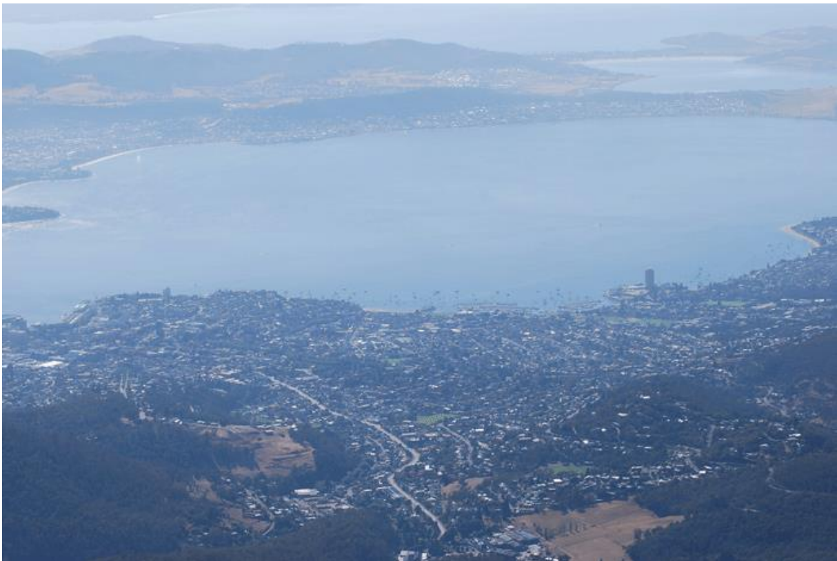
Hobart, seen from Mt Wellington.

15/2. Woke up to a beautiful day, no wind and a clear blue sky. After breakfast we drove up to the lookout at the top of Mount Wellington. Did some birding on our way down. After lunch we went to Peter Murrell Reserve again and on our way back to the hotel we drove from Kingston into town via the "old" way.