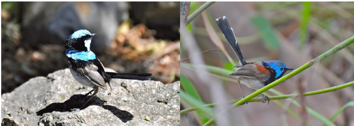
Superb and Variegated Fairywren