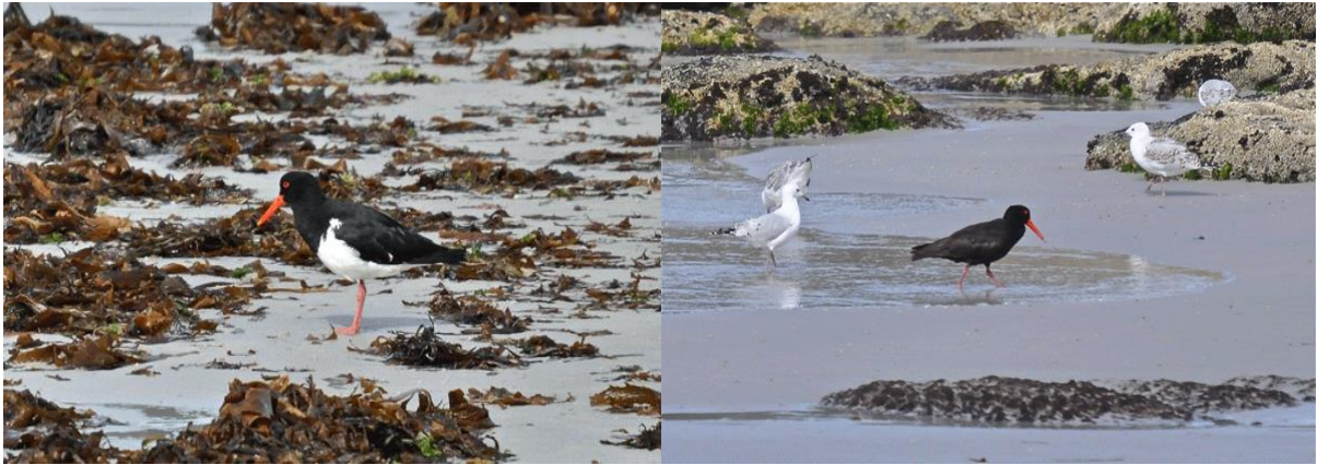
Pied and Sooty Oystercatcher (and some Silver Gulls)

4 Bicheno 11/2, 3 Freycinet N.P 13/2, 2 Bicheno 13/2 and 2 Port Fairy 20/2.