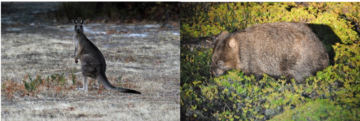
Eastern Grey Kangaroo

9 (incl 1 young) Pepper's Lodge, Cradle Mountain N.P 10/2 and 3 Freycinet N.P 11/2.