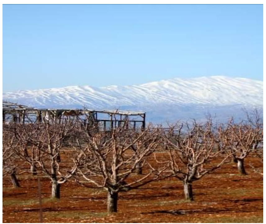
Landscape of Bloudan slopes. Beyond the snowy mountains is Lebanon.

For further information regarding birdwatching in Syria, check out Tomas Haraldsson's webpage: <u>www.tomasharaldsson.se</u>