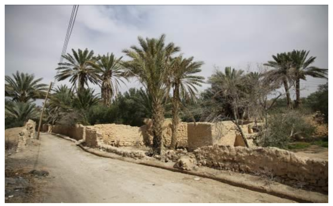
Olive groves in the outskirts of Palmyra that covers a very large area .Many Chiffchaffs, songthrushes and chaffinches.

We got back to Palmyra in time for lunch. Afterwards we headed straight back in the olive groves again where we spent the remainder of the afternoon.