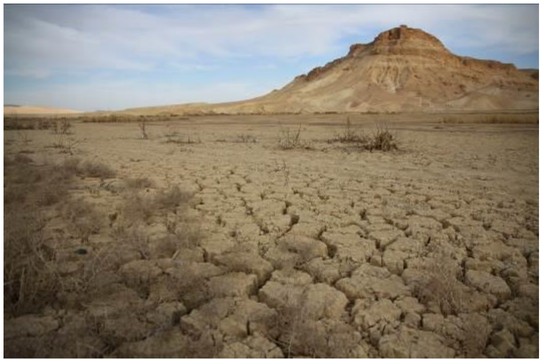
White-valley dam or Wadi Abied, unfortunatelly it had been a very dry winter...

We then headed off to the "White-valley dam" (in arabic called Wadi Abied) although the taxidriver who spoke good English told us that the wadi was completely dried out.