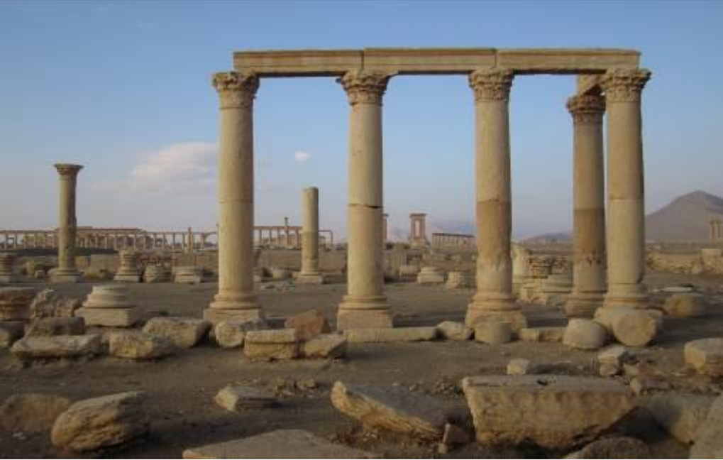
Back in Palmyra.

birds looking for a rest. Although today the farms where quite empty. In the evening we took yet another trip to Wadi Abied and hoped for some luck and maybe see the Bald Ibises passing towards their roosting sites. No such luck but a Lesser Spotted Eagle was new for the trip.