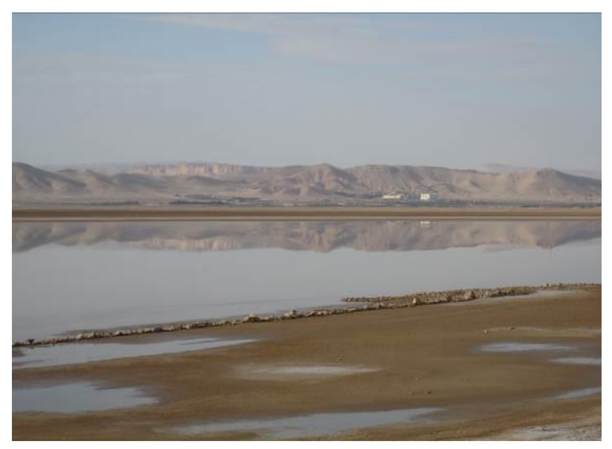
Sabkkath al Moh.