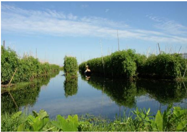
Floating Tomato garden.

The ethnic Inthana fishermen have a very strange way of paddling their canoes, standing up, with the oar placed around their leg. As the lake is very shallow and in places full of sea-weeds etc, they need to stand up to see where to go when they propell the canoe forward. (we got stuck a few times) Some of the fish caught here caters to the aquarium trade with beautiful, endemic, Sawbwa Barbs, Crossbanded Dwarf & Lake Inle Damio.