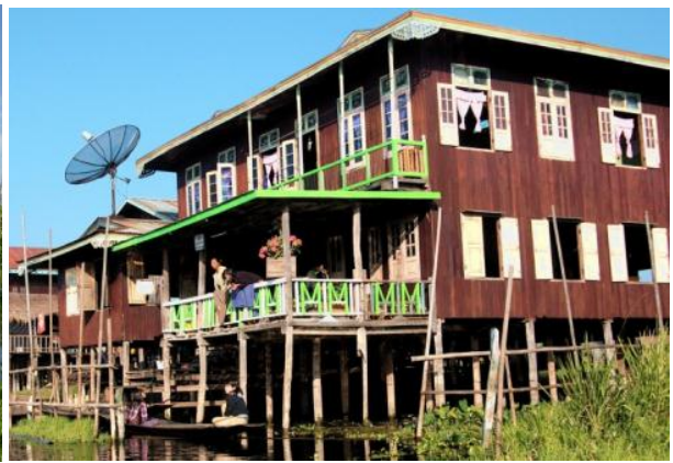
Houses have to be built on stilts, as water levels seasonally change 1½-2½ meter in the lake.

After our stay in the Shan mountains, we caught a flight to Bagan –with a quick stop in Mandalay first - (the airlines have two prices, one for nationals, one for visitors. We paid about $100/domestic flight.) After some problems with the room booking - the guesthouse we had booked were full, in spite of having confirmed our booking – Bagan was so different from peacefull Inle and Kalaw. Here the almighty $$$ ruled, the more of them, the merrier. I think this is what democrocy means to many here...freedom choose...to get rich – quickly - at any means...and to get this “freedom of choice” from the “inventors themselves” ...who are the only one who can afford, or posses the $ to pay the price for this “democracy... by turning their