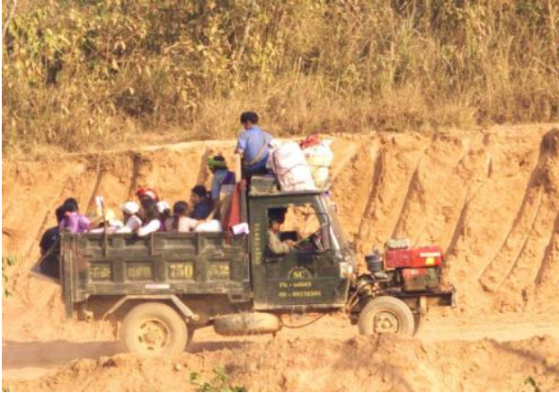
The ancient Kobe 2-stroke engine is used for a lot of things...pumping water, plowing rice-fields...or like on the photo...just put it on the body of an ol'orry.