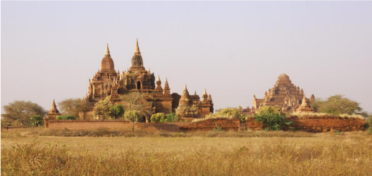
One of thousands of Temples in Bagan. Most of them are almost one thousand years old.

The journey to Myanmar proved to be a bit of a nightmare to organize. Since there are restrictions on transferring money to the country, it is difficult to book hotels or domestic flights (be prepared for flight-schedules that may change at a moment notice) The Burmese tour-operators I contacted seemed to be both very expensive and a bit unreliable (they gave me wrong info about flights f.ex.)