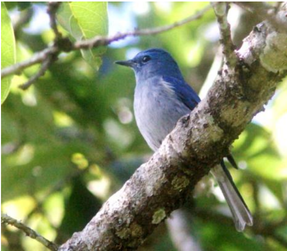
Pale Blue Flycatcher