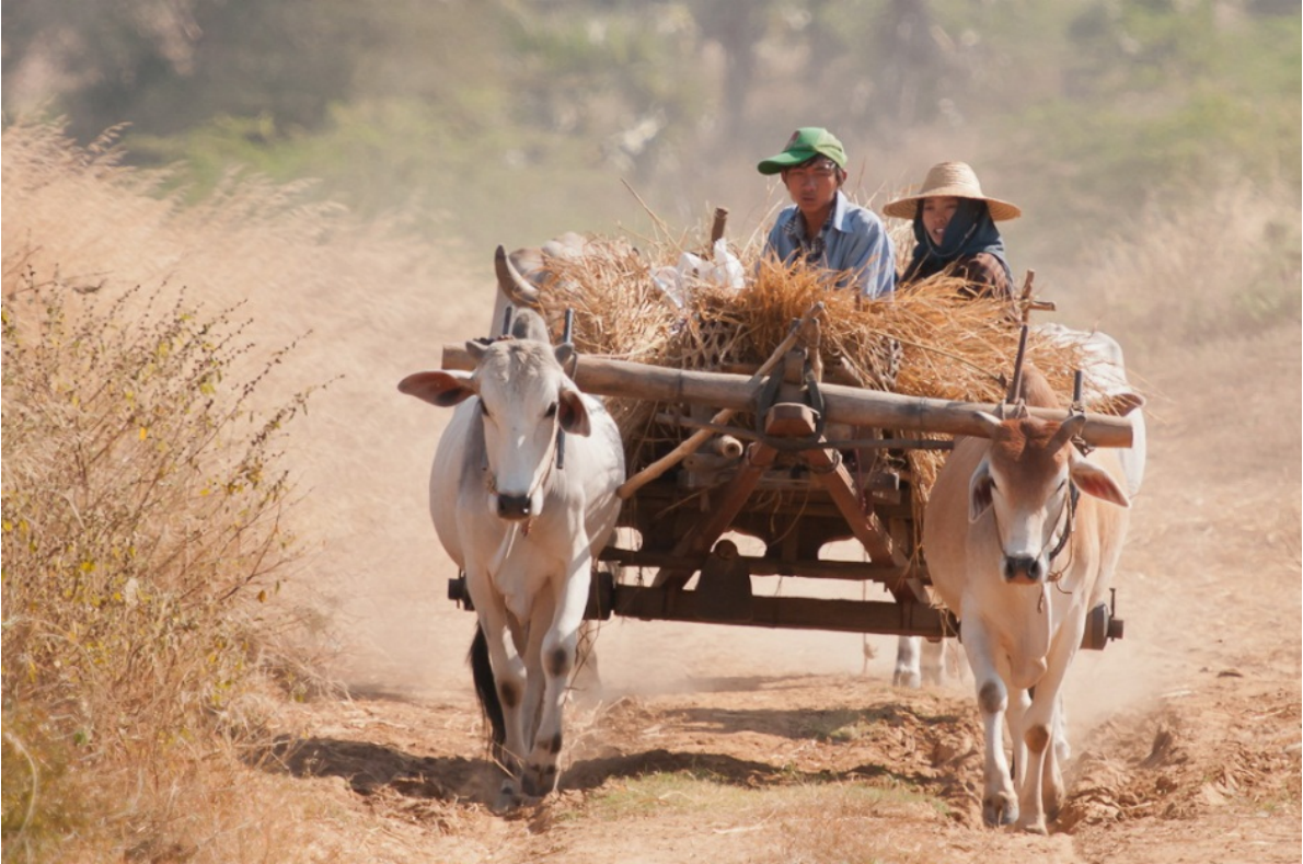
Horse & Ox carts are still very common way of transport in Myanmar.