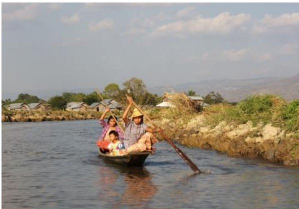
Life is simple around the lake, Myanmar's second biggest. It is very shallow, not much deeper than a few meters during rainy season...down to less than ½ meter during dry season

Other birds we saw during our visit here were; 15 Ruddy Shelducks, 2-300 Indian Spotted Ducks, 1 Northern Showler, 5 Northern Pintails, 50 Garganeys, 5 Common Pochards & 15 Ferruginous Ducks just outside the birdsanctuary. Among the reeds & FLOATING Vegetable cultivation (they are planted on top of floating islands made up of vegetable-waist, hay & lake-mud. Tomatoes and other vegetables are grown in the lake this way) we saw 2 Gray-headed Swamphens (all these splits make me cracy!), and, what I could determine,... 2 Jacksnipes?, 4 Fork-tailed Swifts cooki, 2 Pied Kingfishers, 3 Brown Prinias, 4 Collared Mynas, 5 Baya-weavers & 3 Jerdon's Bushchat. In the sky above us soared 30 Openbilled Storks, 5 March-Harriers, 5 Himalayan Buzzards, 3 Black Kites & 5 Black-shouldered Kites.