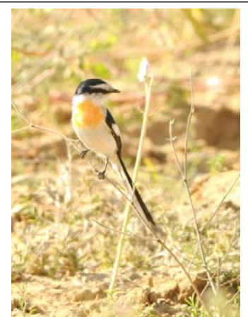
Jerdon's Minivet

Black-throated Tit.....Common in Kalaw (I leave specifics to hair-splitters) Parus major-minor cinerereus .....4-5 in Kalaw. (I leave specifics to hair-splitters)