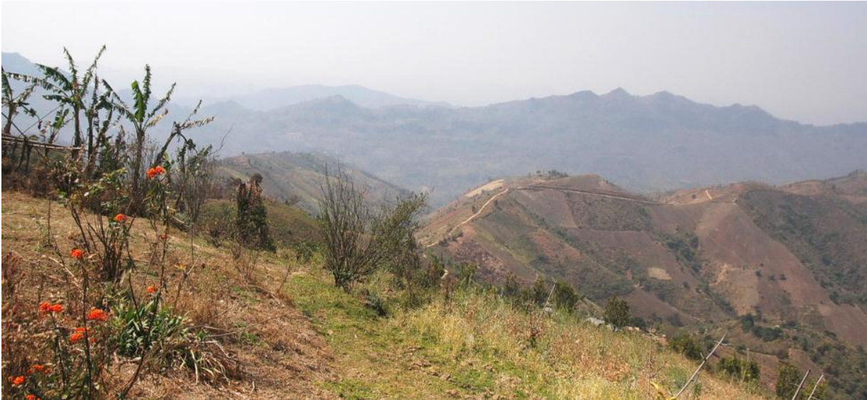
The Shan State hill country outside Kalaw.

It is not the ideal to spend such a short time on these locations...both Kalaw and Bagan could easily merit another day each...but since we planned to travel on to Sabah/Borneo after the visit here, we could only spend 6 days in Myanmar.