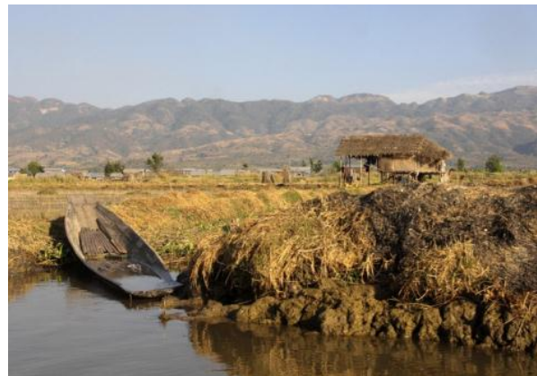
Since the introduction of the floating vegetable plantations in the beginning of 1960's the size of the lake has decreased substantially. Many fishermen are forced to leave their homes.