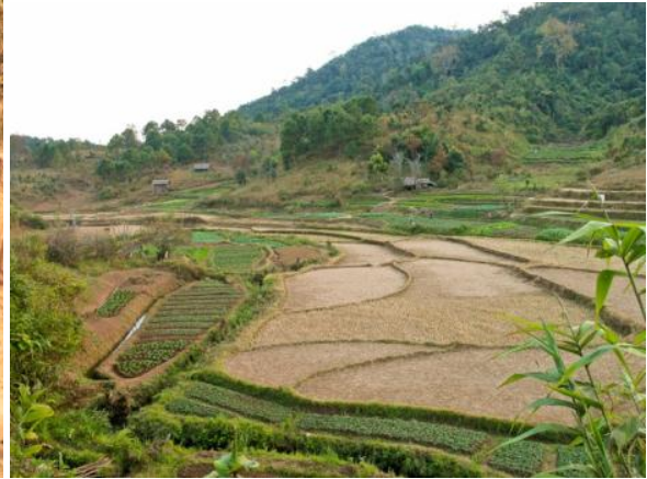
A typical, small scale, valleybottom mix of rice & vegetable cultivation. It was here we found the Black-tailed Crake.

Other birds we saw during our visit here were; 15 Ruddy Shelducks, 2-300 Indian Spotted Ducks, 1 Northern Showler, 5 Northern Pintails, 50 Garganeys, 5 Common Pochards & 15 Ferruginous Ducks just outside the birdsanctuary. Among the reeds & FLOATING Vegetable cultivation (they are planted on top of floating islands made up of vegetable-waist, hay & lake-mud. Tomatoes and other vegetables are grown in the lake this way) we saw 2 Gray-headed Swamphens (all these splits make me cracy!), and, what I could determine,... 2 Jacksnipes?, 4 Fork-tailed Swifts cooki, 2 Pied Kingfishers, 3 Brown Prinias, 4 Collared Mynas, 5 Baya-weavers & 3 Jerdon's Bushchat. In the sky above us soared 30 Openbilled Storks, 5 March-Harriers, 5 Himalayan Buzzards, 3 Black Kites & 5 Black-shouldered Kites.