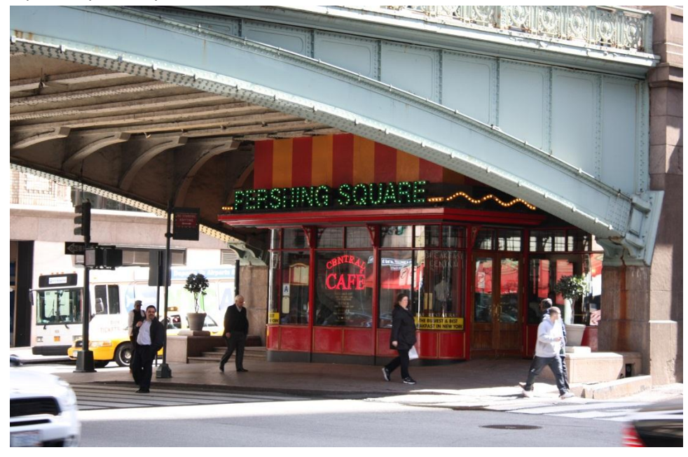
Square - probably one of the finest establishments in New York!

And that was about it for the birding, a species account appears below. I cannot begin to describe how much I enjoyed New York as a fantastically vibrant city. This was an excellent few days away for an important anniversary with 17 lifers thrown in. It is quite rare for me to want to return to cities but this is one that I will return to, preferably with a fellow birder at peak migration!