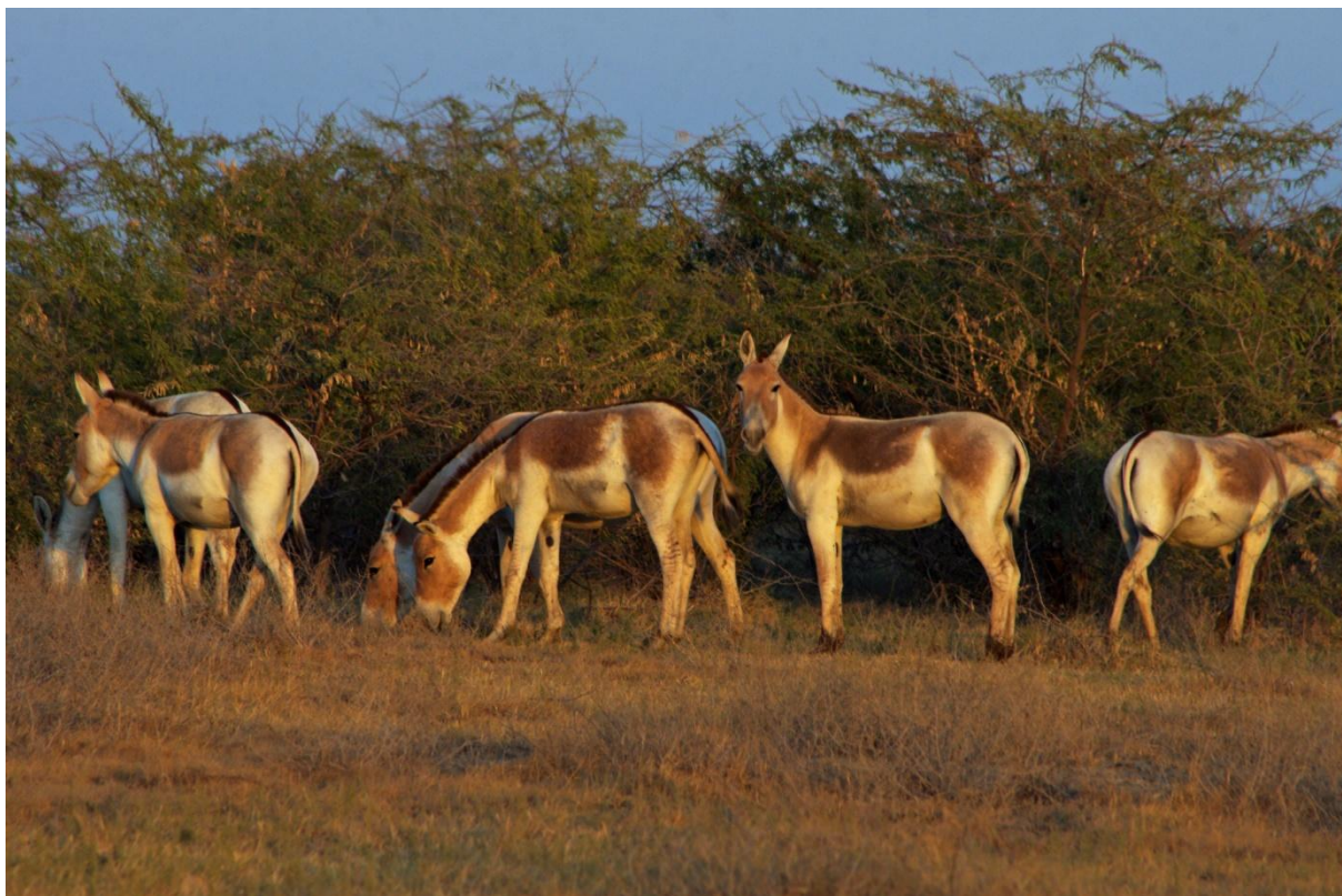
Khur, Asiatic Wild Ass (Equus hemionus)

Asiatic Lion (Panthera leo persica): 4 Gir NP