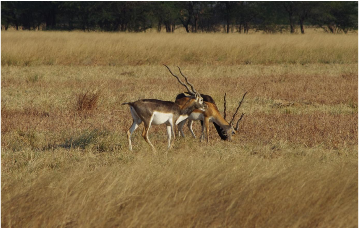
Blackbuck (Antelope cervicapra)