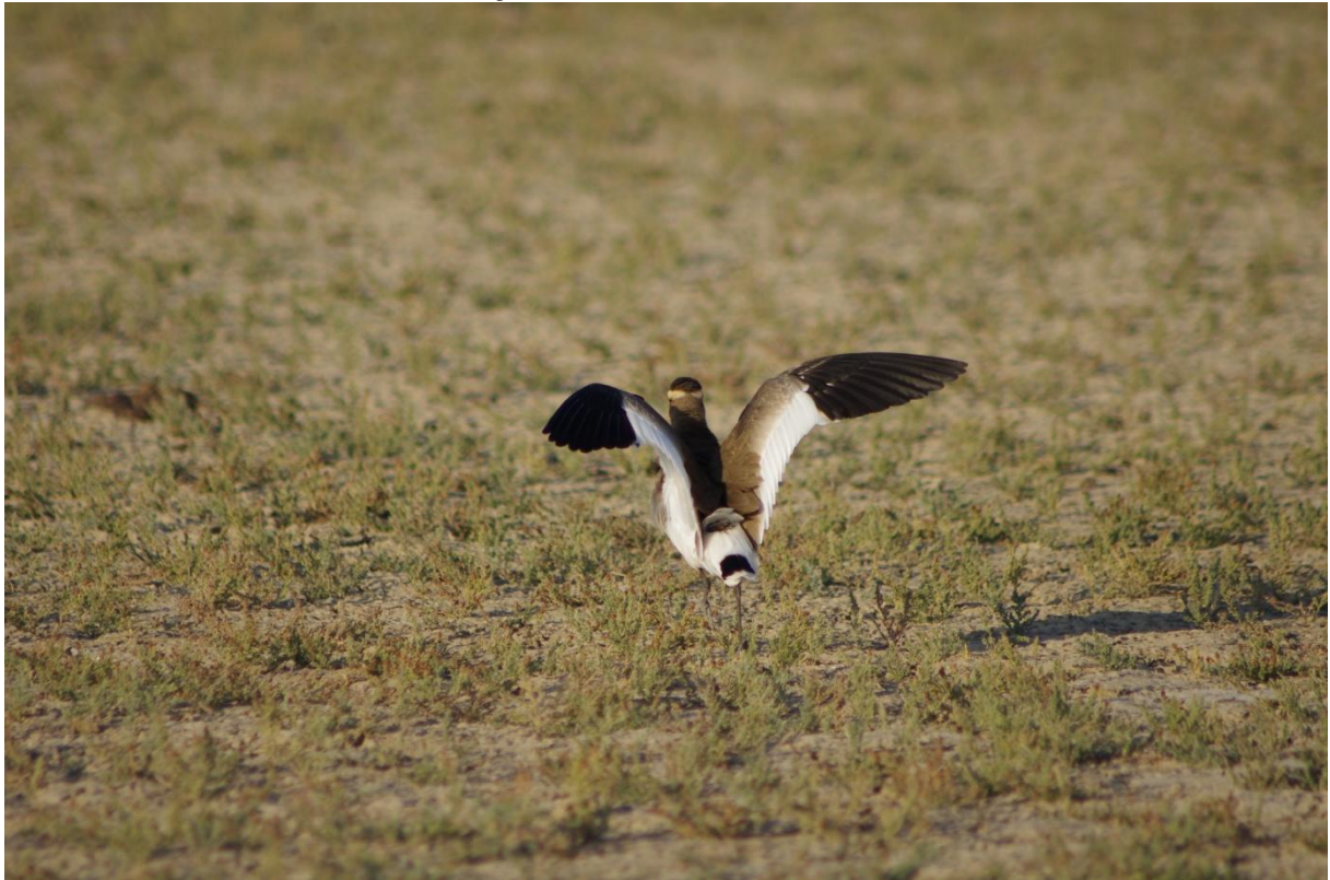
Sociable Lapwing (Vanellus gregarius)

Ruff: 2 Gir, 5 Rajkot, 90 LRK Ruddy Turnstone: 10 coast, Mandvi Thick-knee (Burhinus indicus): 2 Gir Great Thick-knee: 12 coast, Mandvi Eurasian Oystercatcher: 15 Mandvi Black-winged Stilt: daily, 5-200 Pied Avocet: 2 Chari Dhand, GRK 350 Lake Navatalav, LRK