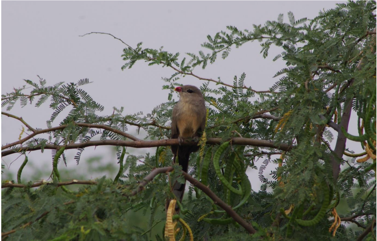
Sirkeer Malkoha (Phaenicophaeus leschenaultii)