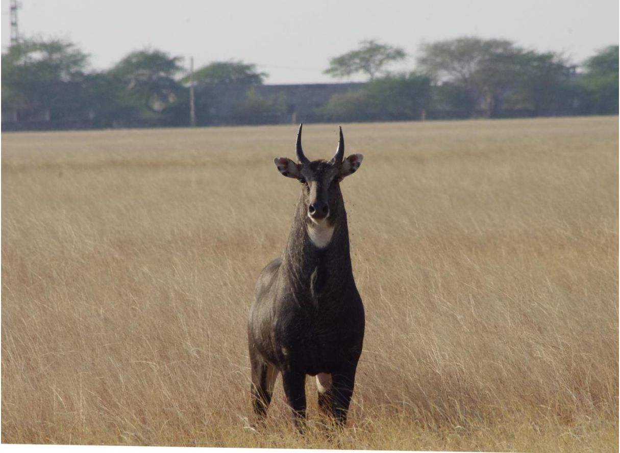
Nilgai Boselaphus tragocamelus)