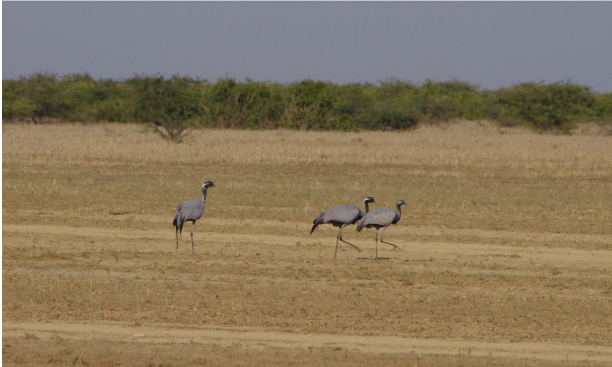
Demoiselle Crane (Grus Virgo)

Common Crane: seen-heard almost daily, most 15000, Banni Grasslands GK White-breasted Waterhen: 1 at the river, the Camp, Gir Purple Swampphen: 15, Lion safari camp, Gir; 75 Chari Dhand, GK