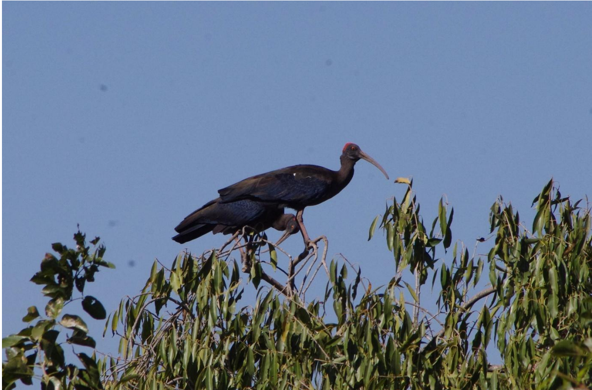
Red-naped Ibis (Pseudibis papillosa)

Eurasian Golden Oriole: 1 Rann Riders camp, Dasada (KLN)