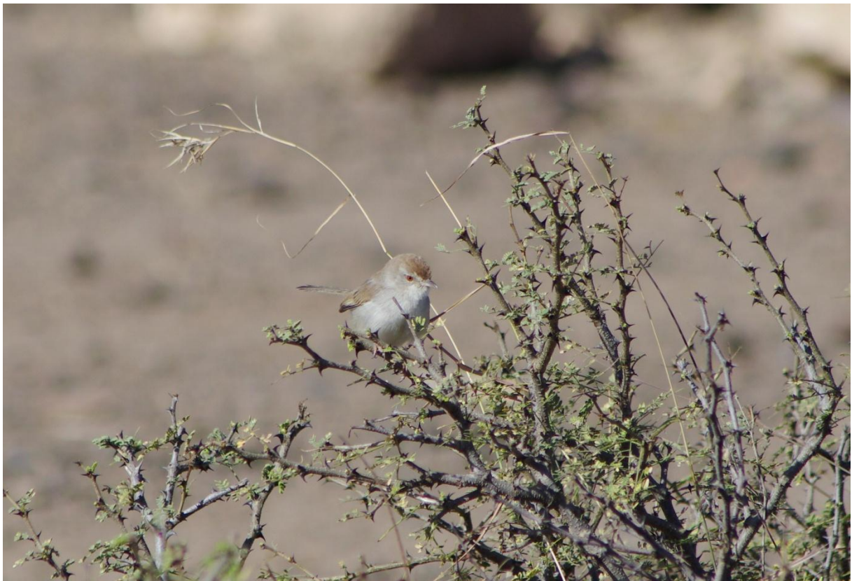
Rufous-fronted Prinia (Prinia buchanani)

Grey Hypocolius : 4-5, thorn scrub, Banni grasslands Rufous-fronted Prinia : 8 GRK (thorn forest) Grey-breasted Prinia : 1 Vel; 5 GRK Plain Prinia : 1 Vel; 12 GRK Jungle Prinia : 50 Gir Ashy Prinia : enstaka Gir+GRK Oriental White-eye : 25 Gir, 1 GRK