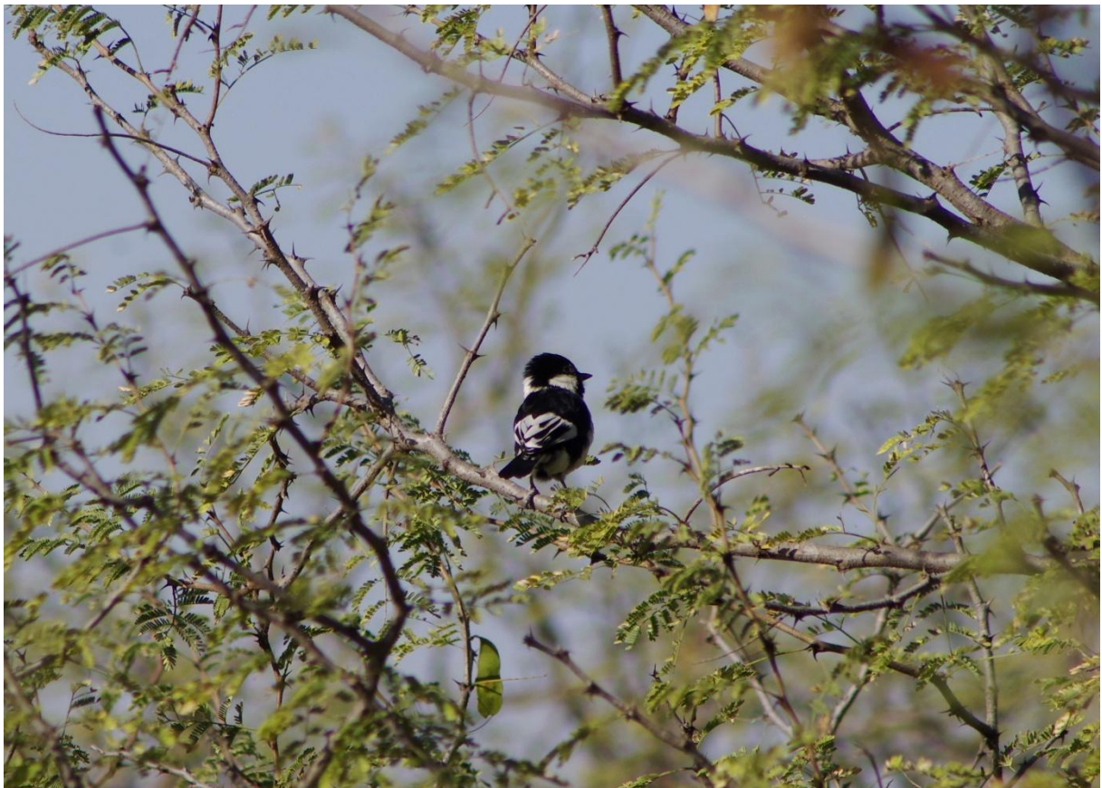
White-naped Tit (Parus nuchalis)

Black Redstart: 4 seen in different places Stoliczka's (White-browed) Bushchat: 1 female Banni Grasslands, GRK Siberian Stonechat: daily, 2-40 Pied Bushchat: 1 LRK Brown Rockchat: 2-3 at temple, rocky hills, GRK Variable Wheatear: 1 Rajkot; 25 LRK; 20 GRK Desert Wheatear: 40 Banni Grasslands GRK; 15 LRK Isabelline Wheatear: 5 GRK; 7 LRK Rufous-tailed Wheatear: 6 GRK Brahminy Starling: about 30 Gir; 2 LRK Rosy Starling: almost daily; some days 500 Common Myna: at habitation, 10-50/day Bank Myna: Ahmedabad 5; Rajkot-Bhuj 30; Mandvi 5 White-naped (White-winged) Tit: 3 Chaduva thorn forest Great Tit: 3 Gir