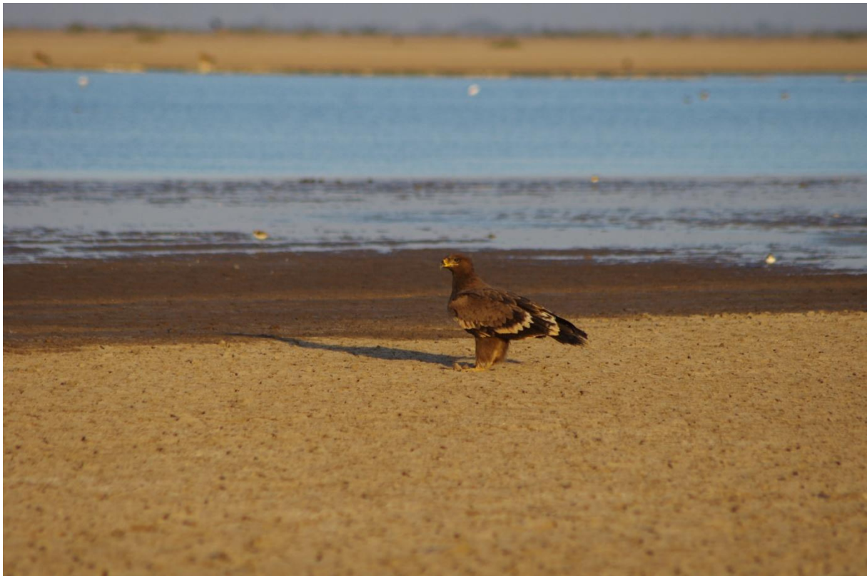
Steppe Eagle (Aquila nipalensis)

White-eyed Buzzard: 2, 20 km s-e Dasada Common Buzzard: 1 LRK Long-legged Buzzard: 1 Vel; 3 LRK Greater Spotted Eagle: 2 GRK; 1 LRK Tawny Eagle: 1-3 at Gir, LRK, GRK