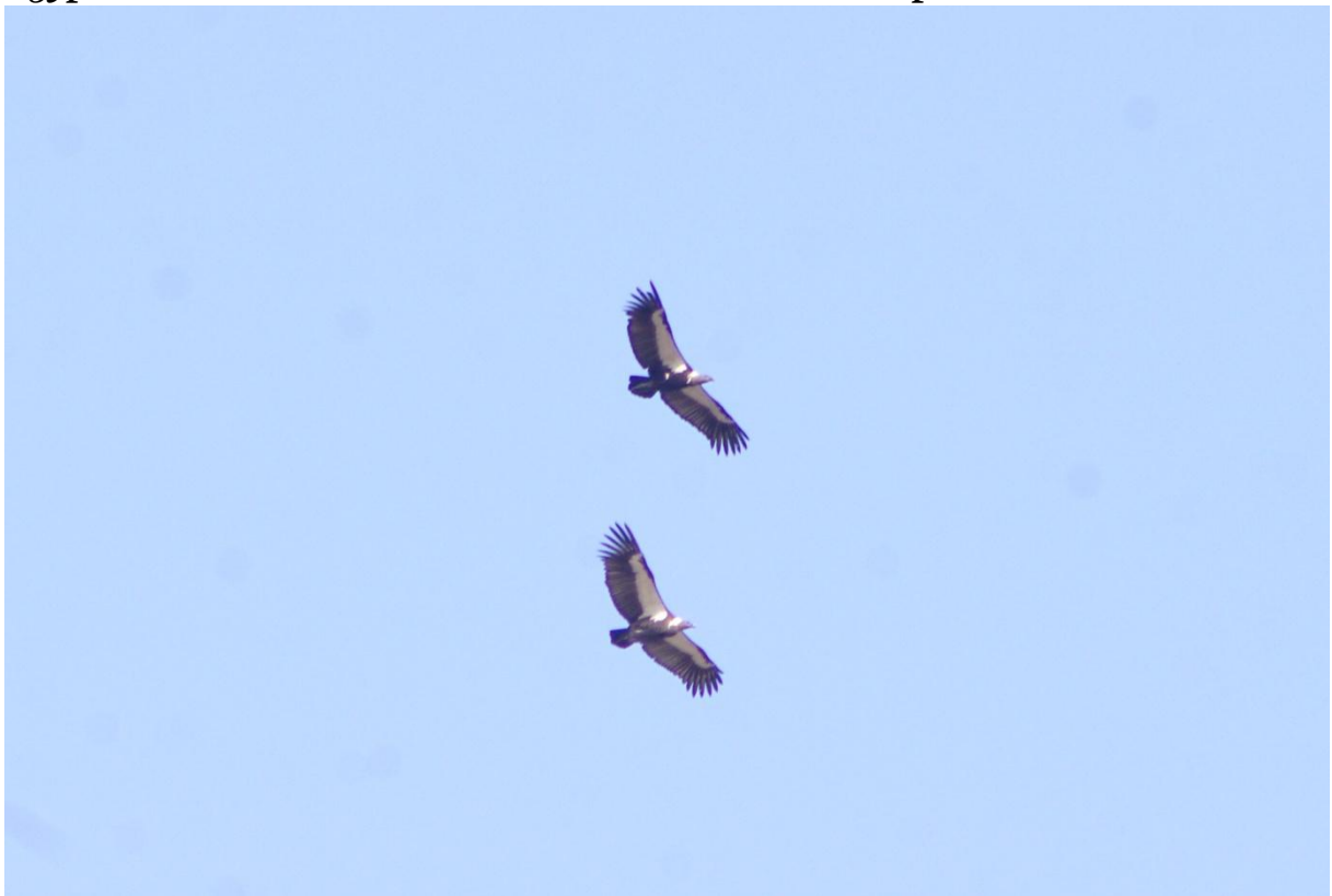
White-rumped Vulture (Gyps bengalensis)

Osprey: 2 at "Crocodile Pond", Gir NP Black Kite: common near/in towns Black-shouldered Kite: daily 1-10 Brahminy Kite: 1 Gir NP, 1 juv Mandvi Egyptian Vulture: 2, 25 km s-o Dasada, 25 rubbish heap, w Ahmedabad