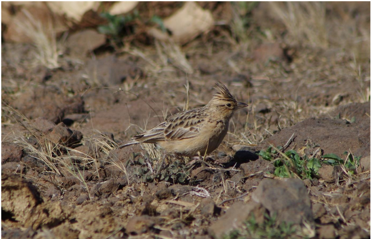
Sykes's Lark (Galerida deva)

Rufous-tailed Lark : 26 Vel+Gir; 12 GRK; 2 LRK Greater Short-toed Lark : impressive masses, open areas, 50-3000/day Crested Lark : 14 GRK; 8 LRK Sykes's (Tawny) Lark : 6 Vel; 8 Banni Grasslands, GRK