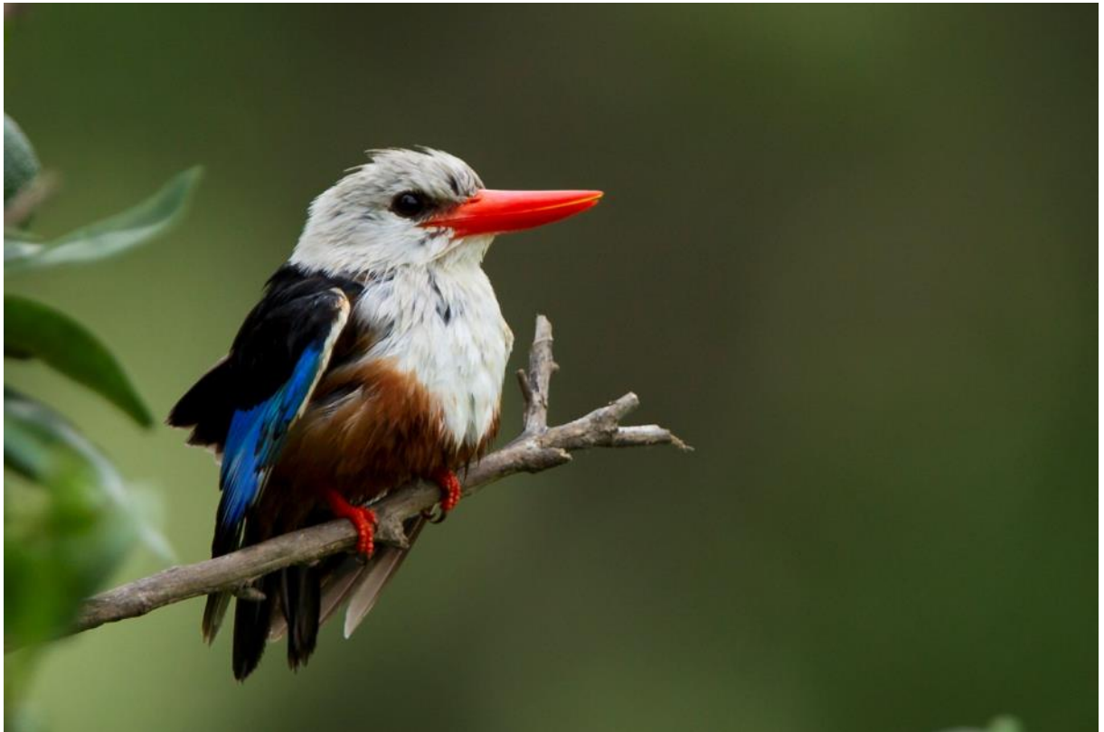
Grey-headed Kingfisher, Banana de Ribeira Montanha, Santiago