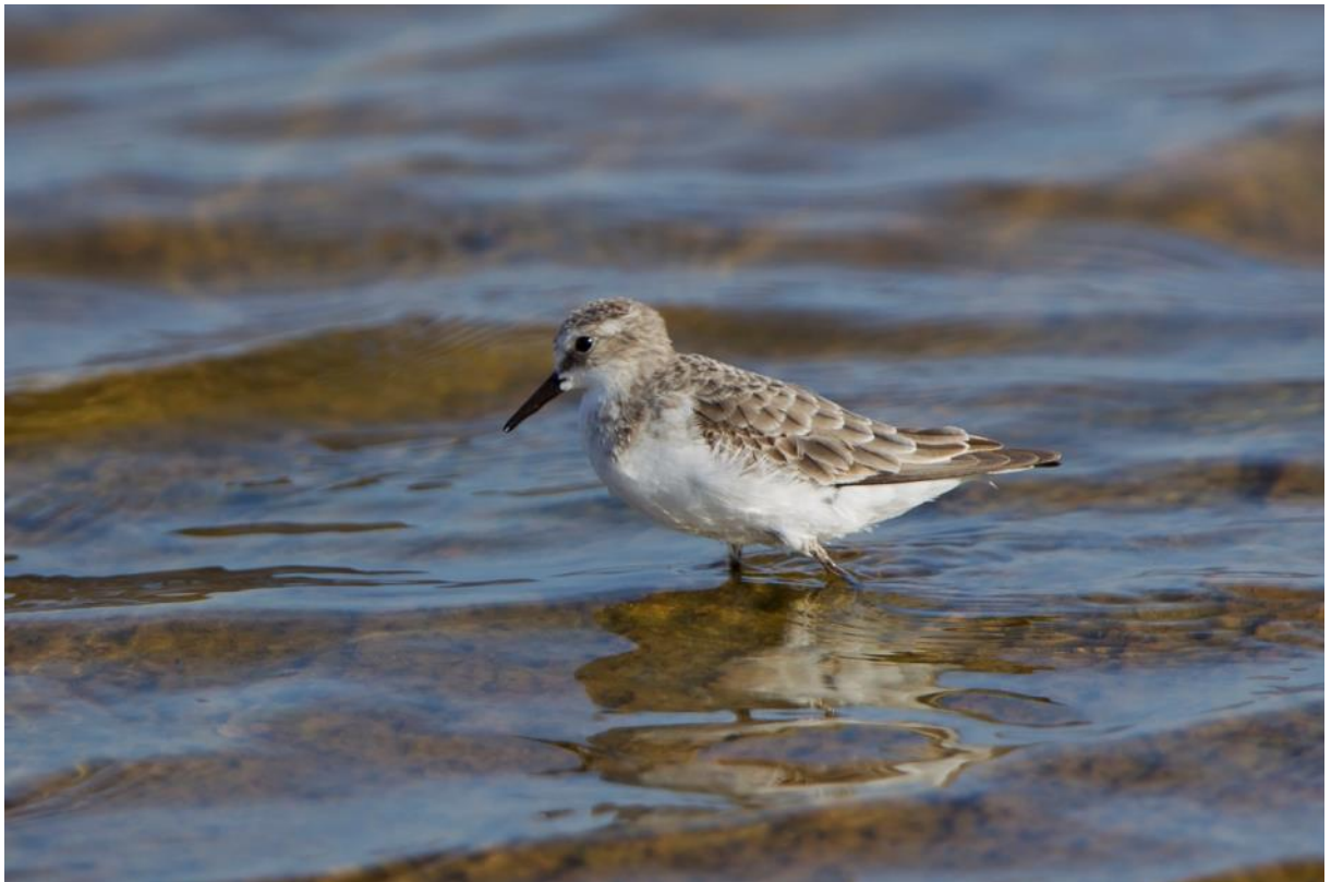
Little Stint, Salinas de Santa Maria, Sal