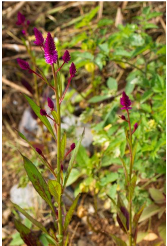
Água dos Patos, São Nicolau