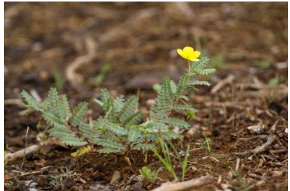
Ribeira da Madama, Sal