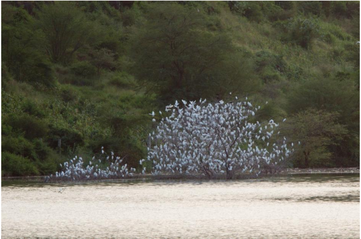
Cattle Egret, Barragem de Poilão, Santiago

17 Barragem de Poilão, Santiago 6-11, 10 Ribeira da Barca, Santiago 6-11, 1500 minimum. Staying the night in two trees. Fr NO Barragem de Poilão, Santiago 7-11, 50 São Nicolau airport 8-11, 12 Tarrafal de São Nicolau 8-11, 4 Raso 9-11, 5 Ribeira da Madama, Sal 11-11, 12 Ribeira da Madama, Sal 11-11, 30 São Nicolau airport 10-11, 15 Salinas de Santa Maria, Sal 11-11, 1 Ribeira da Madama, Sal 12-11, 15 Sal Rei, Boa Vista 12-11, 300 Lagoa de Rabil, Boa Vista 12-11, 20 Sal Rei, Boa Vista-Curral Velho, Boa Vista 13-11, 2 Curral Velho, Boa Vista 13-11, 450 Farol Dona Maria Pia, Santiago 14-11