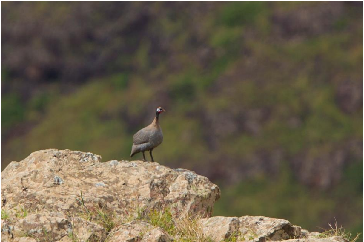
Helmeted Guineafowl, Morro Vermelho, São Nicolau