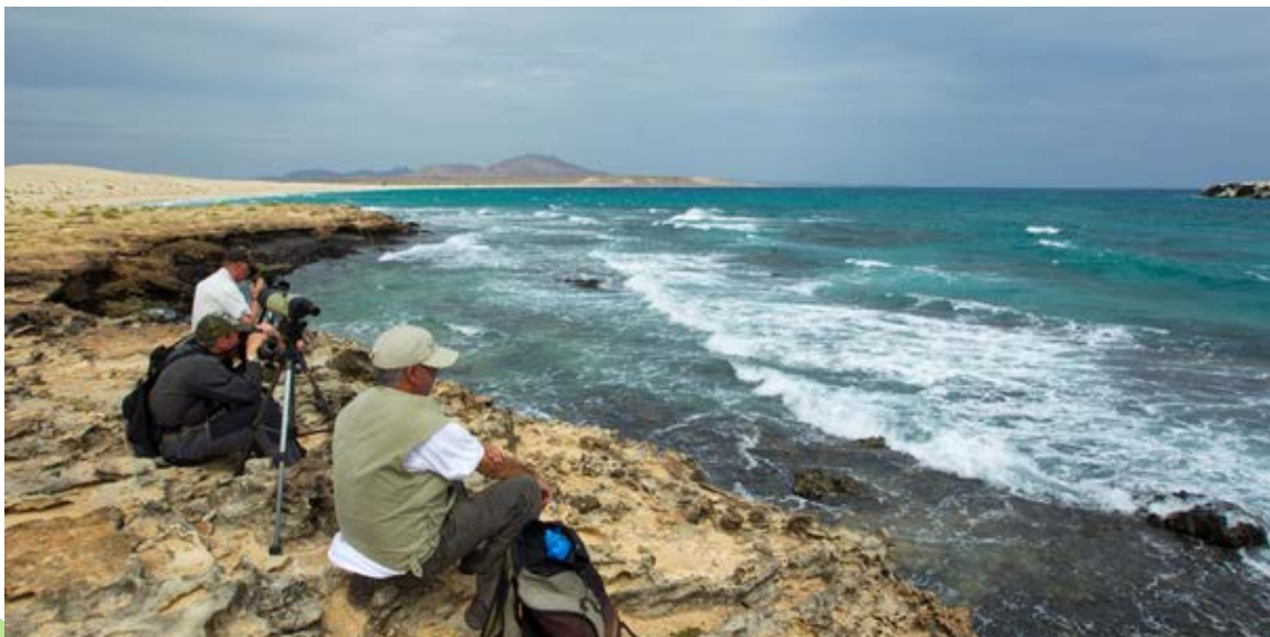
Curral Velho, Boa Vista. Islet with Magnificent Friagtebird to the right