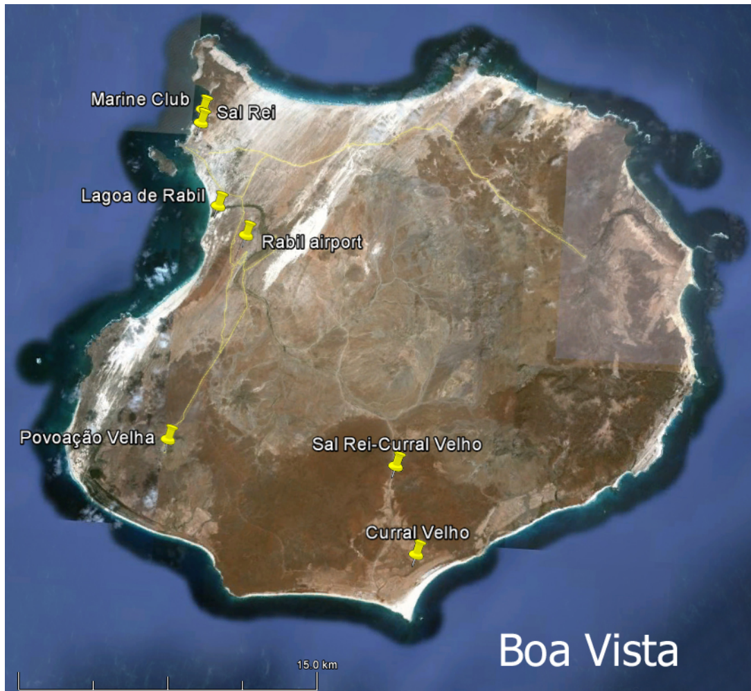
Visited localities on Boa Vista

Early in the morning a few of us were out again at Ribeira da Madama, Sal to photo-document the Eurasian Coot, before we should leave for Sal. The flight from Sal to Boa Vista took 15 minutes. On Boa Vista we stayed at the Marine Club, Boa Vista (16.190541, -22.914345) in Sal Rei, Boa Vista, the best hotel on the trip. Luckily a good wader lagoon (16.184300, -22.914815) was situated next to the hotel. After some wader-watching we took inland searching for Egyptian Vulture at Povoação Velha, Boa Vista, but with negative result. Maybe the species already is extinct from Cape Verde. We ended up at Rabil lagoon where we documented a grey-rumped Little Tern.