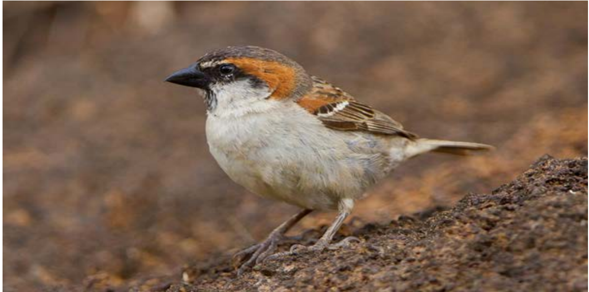
Cape Verde Sparrow, Morro Vermelho, São Nicolau

10 Serra de Malagueta, Santiago 6-11, 4 Jardim Botânico de São Jorge dos Órgãos, Santiago 6-11, 2 Barragem de Poilão, Santiago 6-11, 10 Tarrafal, Santiago 7-11, 5 Praia, Santiago 7-11, 15 Praia cliffs, Santiago 7-11, 4 São Nicolau airport 8-11, 5 Barril, São Nicolau 8-11, 5 Ponta da Travuz, São Nicolau 9-11, 50 flew out to our boat, very intrepid Raso 9-11, 10 Morro Vermelho, São Nicolau 10-11, 1 Salinas de Pedra de Lume, Sal 11-11, 10 Sal Rei, Boa Vista 12-11, 5 Lagoa de Rabil, Boa Vista 12-11, 10 Sal Rei, Boa Vista 13-11, 15 Sal Rei, Boa Vista-Curral Velho, Boa Vista 13-11, 25 Sal Rei, Boa Vista 14-11, 10 Marine Club, Boa Vista 14-11