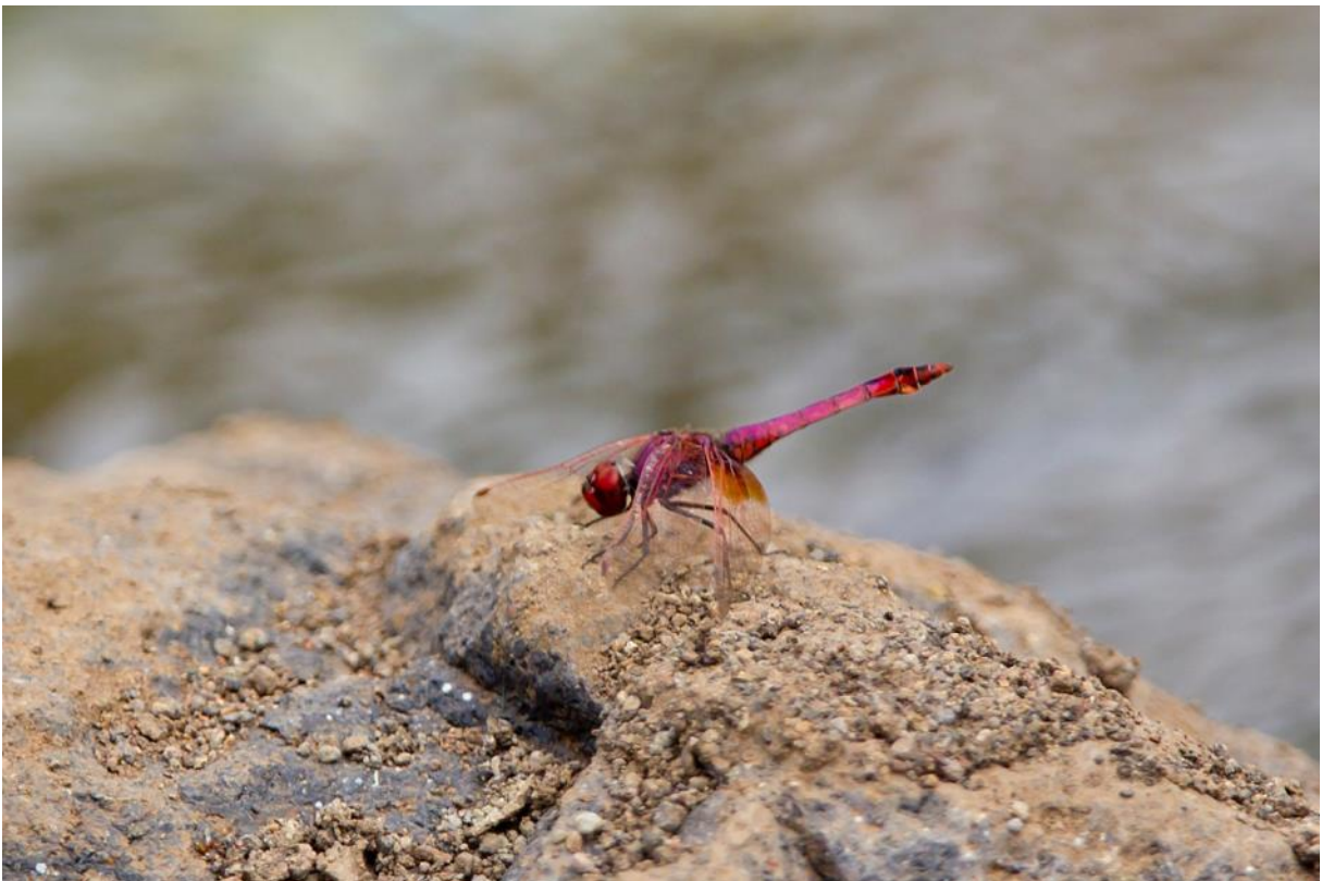
Violet Dropwing, Banana de Ribeira Montanha, Santiago

1 imago/adult Banana de Ribeira Montanha, Santiago 6-11