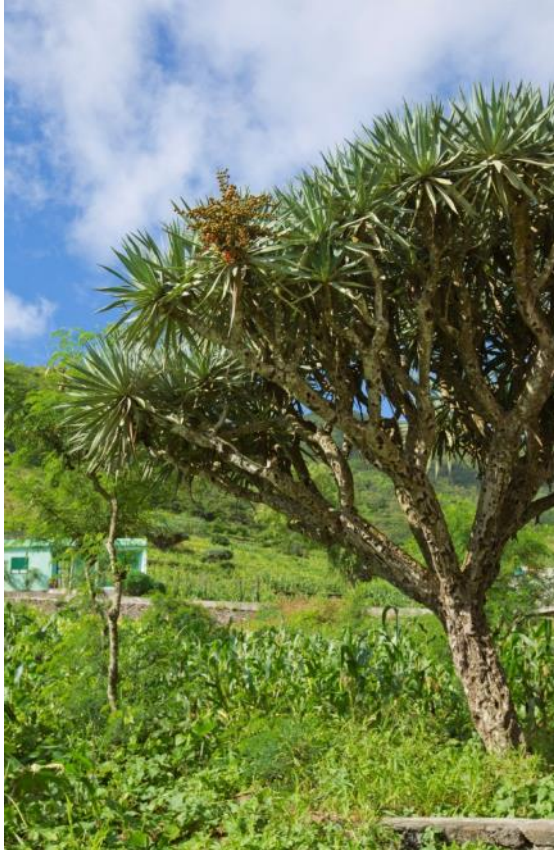
Parque Natural de Monte Gordo, São Nicolau