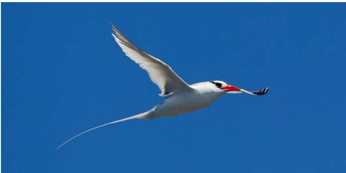
Red-billed Tropicbird, Raso