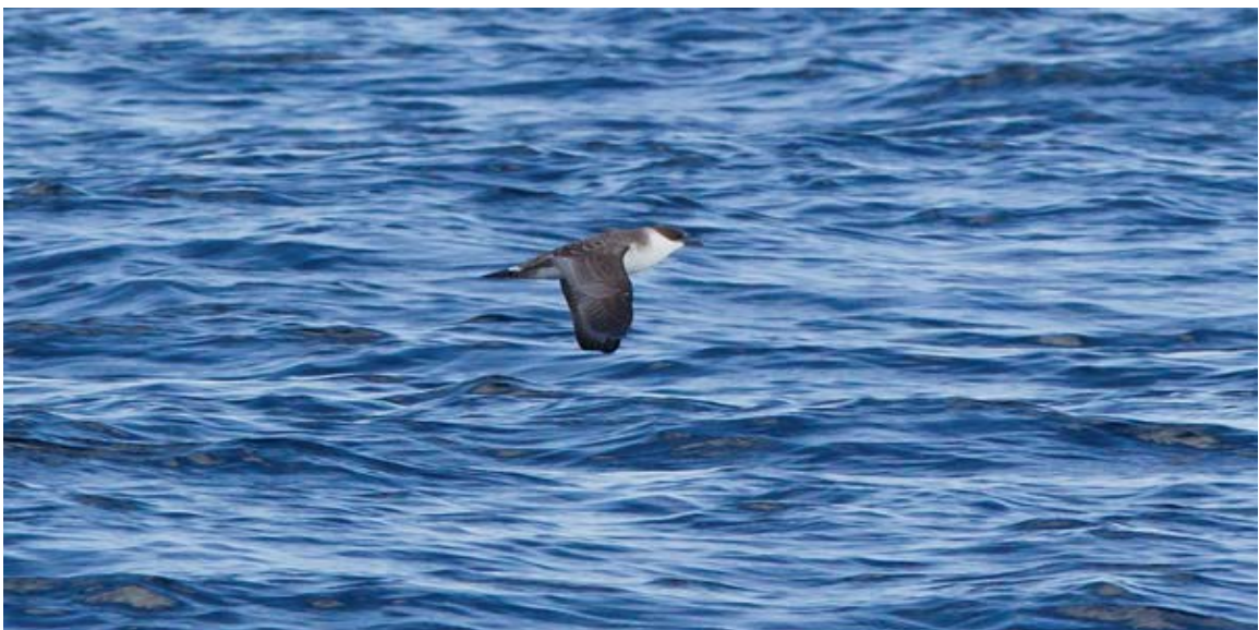
Greater Shearwater, Raso