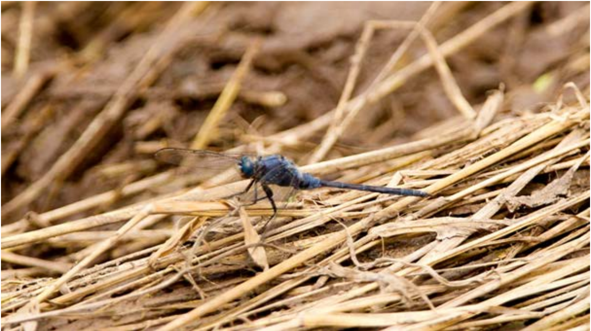
Long Skimmer, Banana de Ribeira Montanha, Santiago

1 imago/adult Banana de Ribeira Montanha, Santiago 6-11