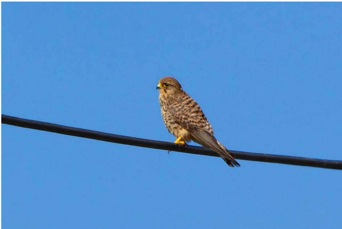
Lesser Cape Verde Kestrel, Morro Vermelho, São Nicolau