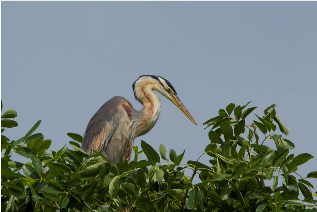
Ad Bourne's Heron Banana de Ribeira Montanha, Santiago

1 2c sitting on a grassy hill Serra de Malagueta, Santiago 6-11, 6 ad + 5 1st cy Banana de Ribeira Montanha, Santiago 6-11, 2 1c Barragem de Poilão, Santiago 6-11, 4 Barragem de Poilão, Santiago 7-11, 1 adult flying by Rui Vaz, Santiago 7-11