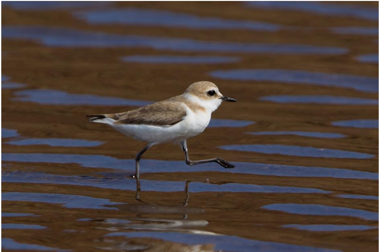
Kentish Plover, Salinas de Pedra de Lume, Sal