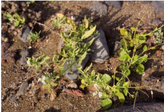
Barril, São Nicolau