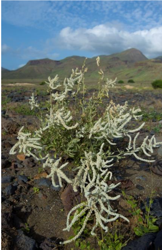
Barril, São Nicolau