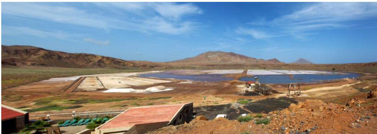
Salinas de Pedra de Lume, Sal. 180°-panorama