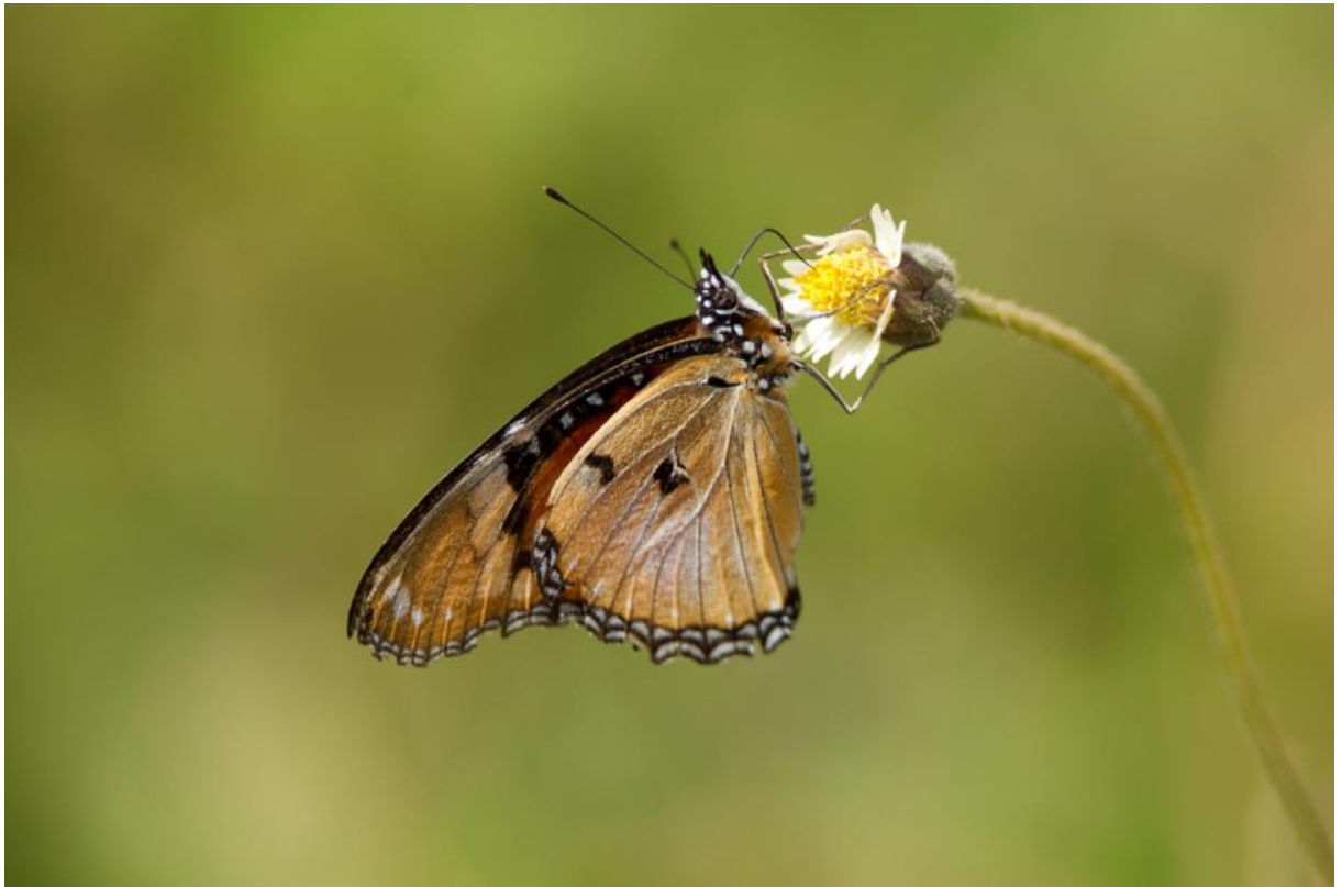
Danaid Eggfly, Praia cliffs, Santiago