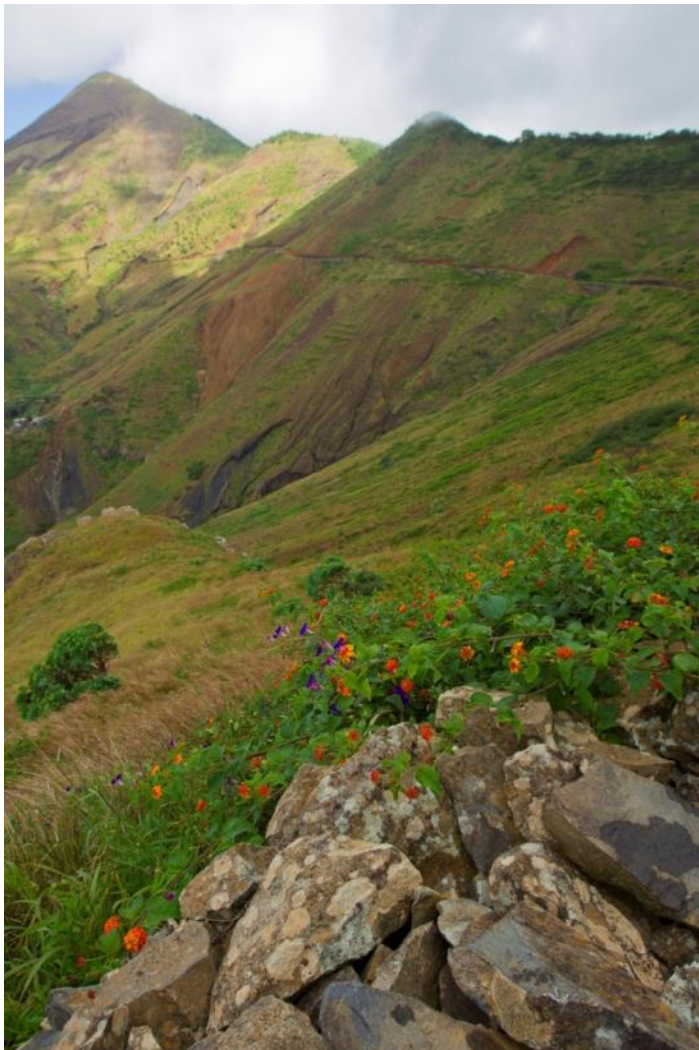
Chada de Caldeira, São Nicolau