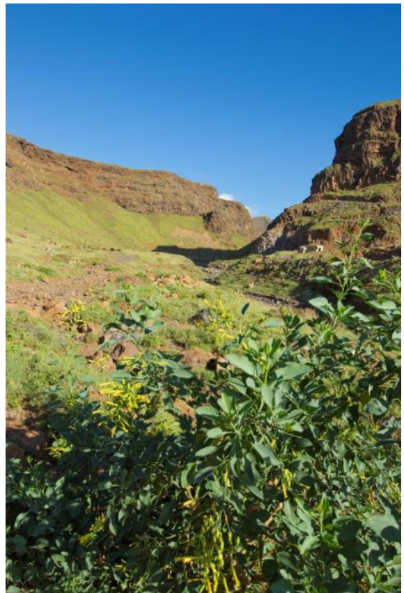
Ribeira do Palhal, São Nicolau