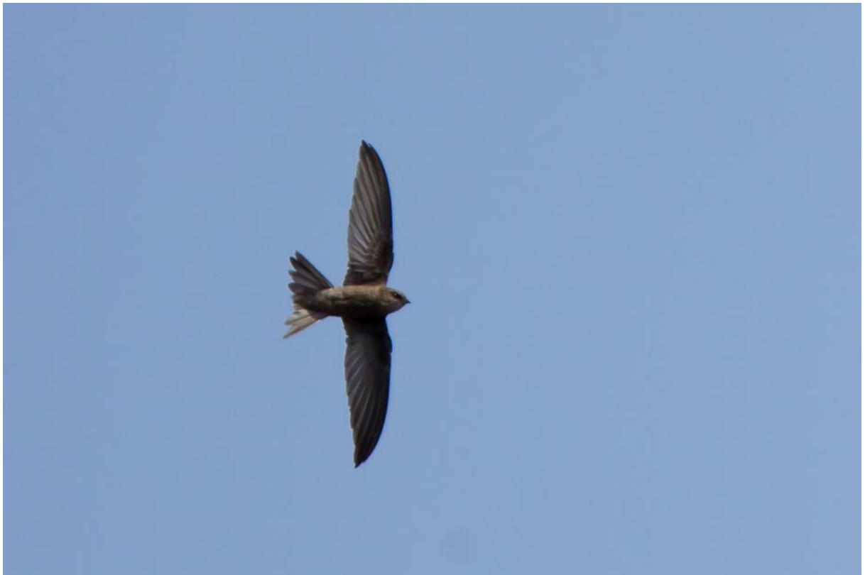
Alexander's Swift, Praia cliffs, Santiago