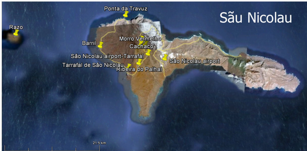
Visited localities on São Nicolau

Transportation to São Nicolau with a stopover on Sal. From the very small airport on São Nicolau we eventually got our rental car and could drive to the small village Tarrafal de São Nicolau on the western side. Along the road we got Helmeted Guineafowl. We started with sea-watching from the lighthouse Barril, São Nicolau. We had a group of Cream-coloured Coursers and at least five Cape Verde Petrels among the Cape Verde Shearwaters during the beautiful sunset over the small island of Razo out in the west.