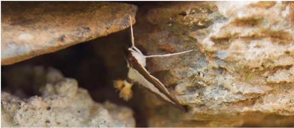
Cucumber Moth, Morro Vermelho, São Nicolau