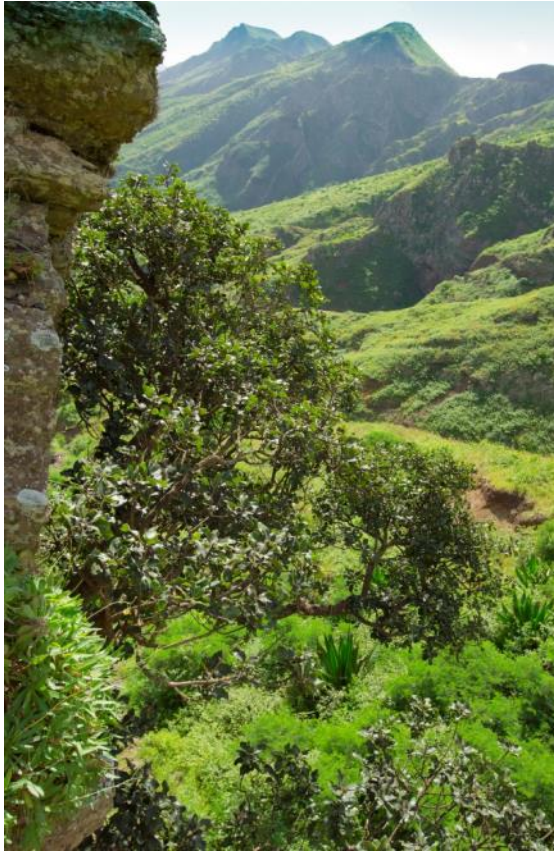
Cachaço, São Nicolau