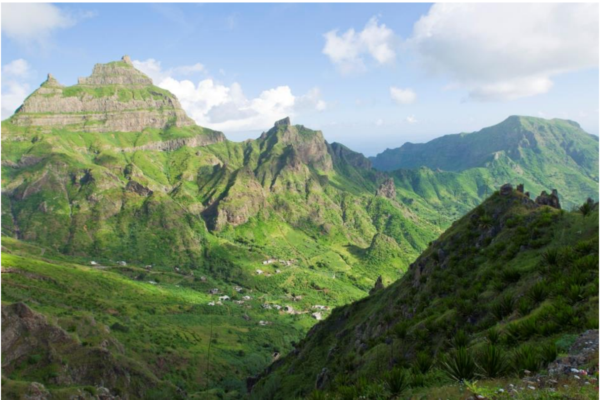
Água dos Patos, São Nicolau