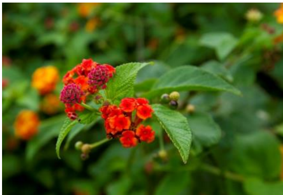
Morro Vermelho, São Nicolau