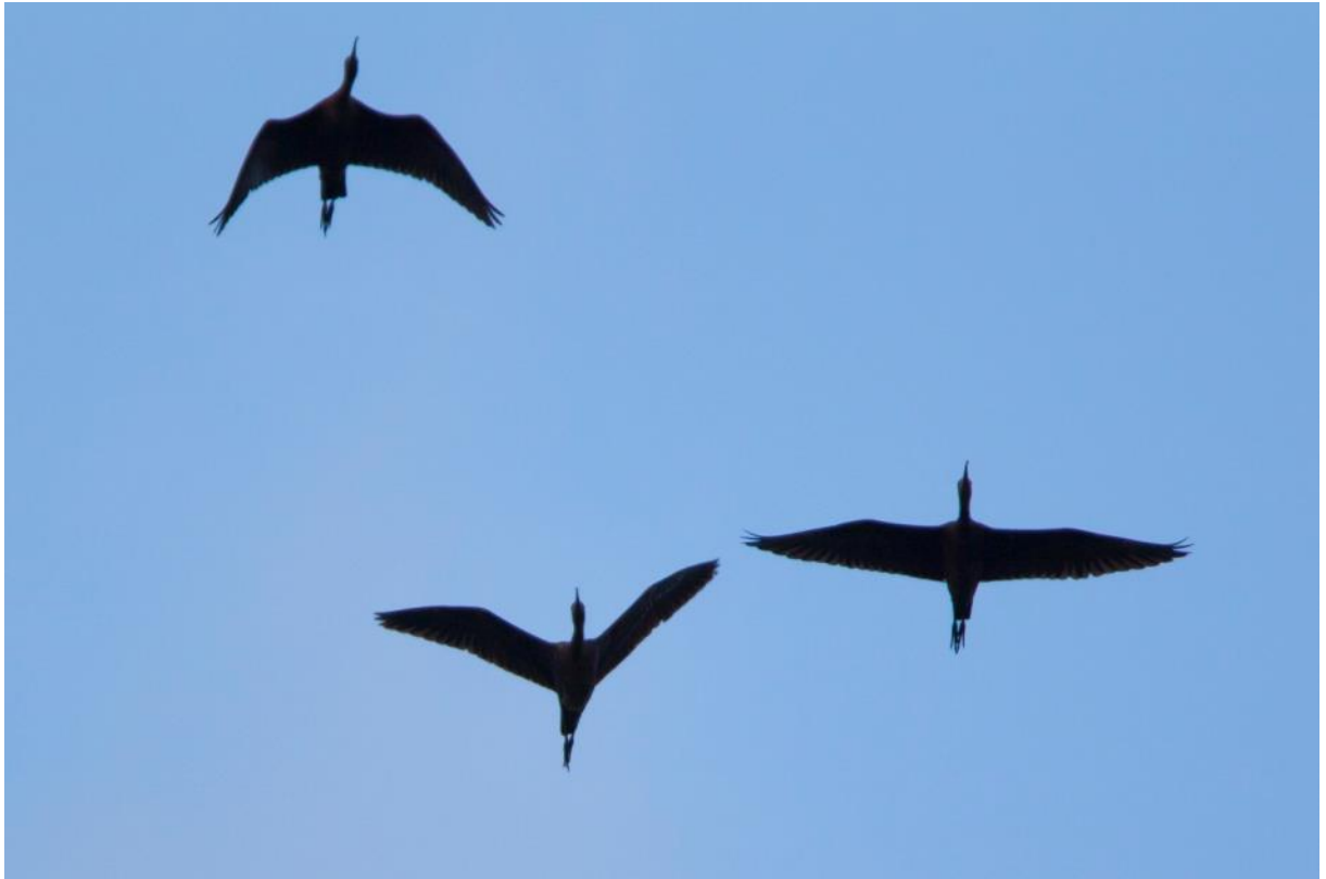
Glossy Ibis, Barragem de Poilão, Santiago