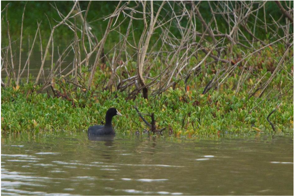
Eurasian Coot, Ribeira da Madama, Sal

1 adult Kap Verde! Ribeira da Madama, Sal 11-11, 1 adult Ribeira da Madama, Sal 12-11 The first record on Cape Verde ever!