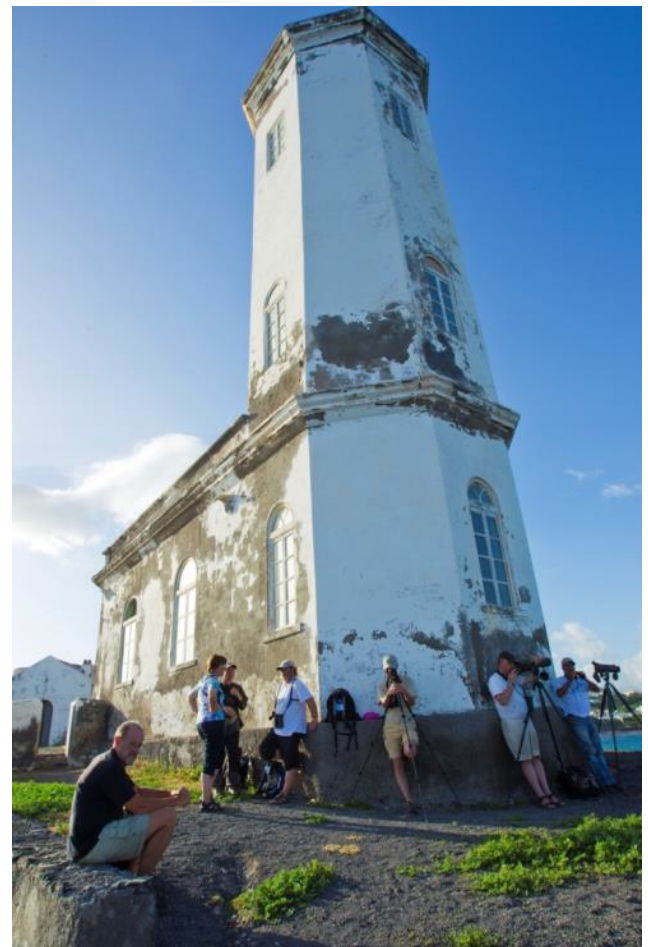
Farol Dona Maria Pia, Praia, Santiago