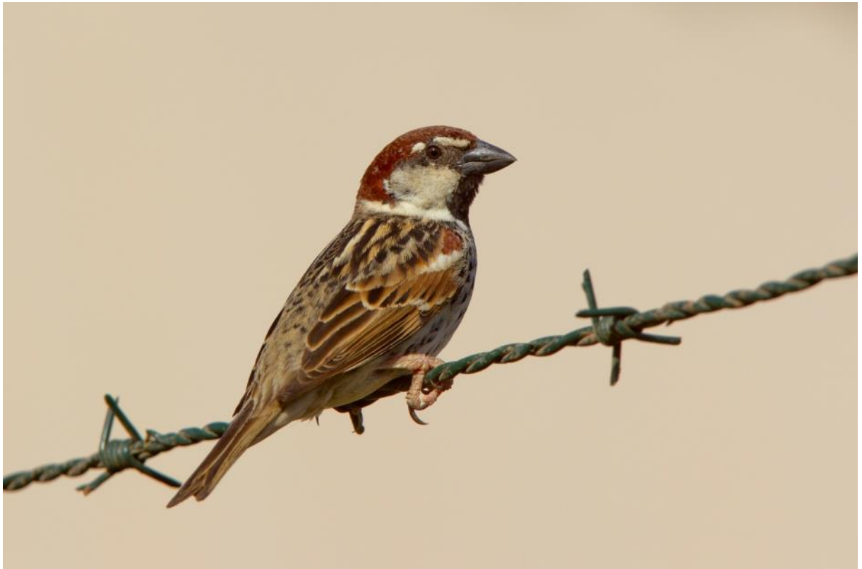
Spanish Sparrow, São Nicolau airport