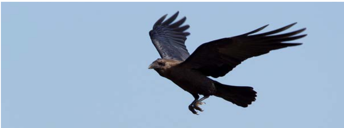
Brown-necked Raven, Barril, São Nicolau