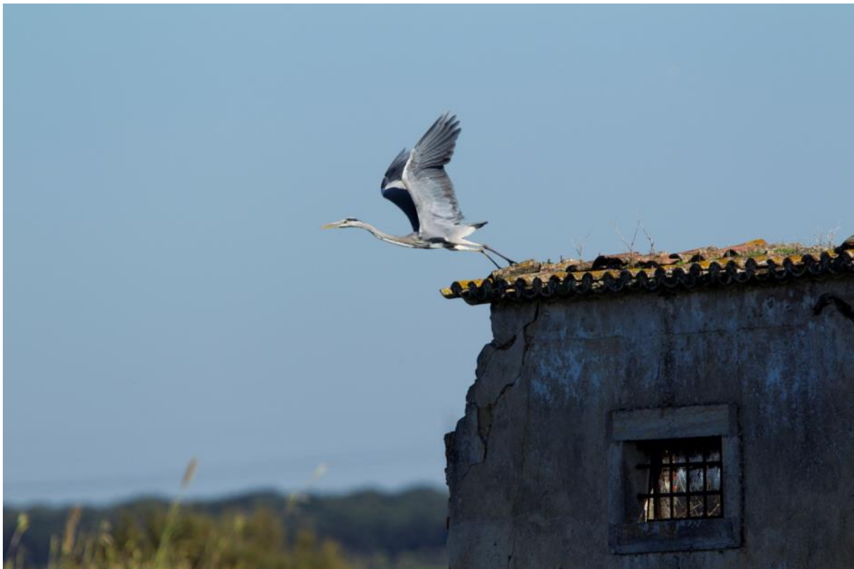
Grey Heron, Alcochete, Lisbon, Portugal