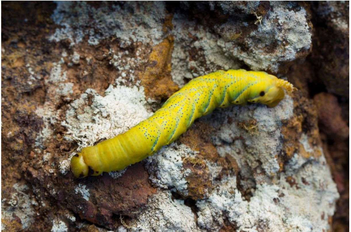
Death's-head Hawk-moth, Agua dos Patos, São Nicolau