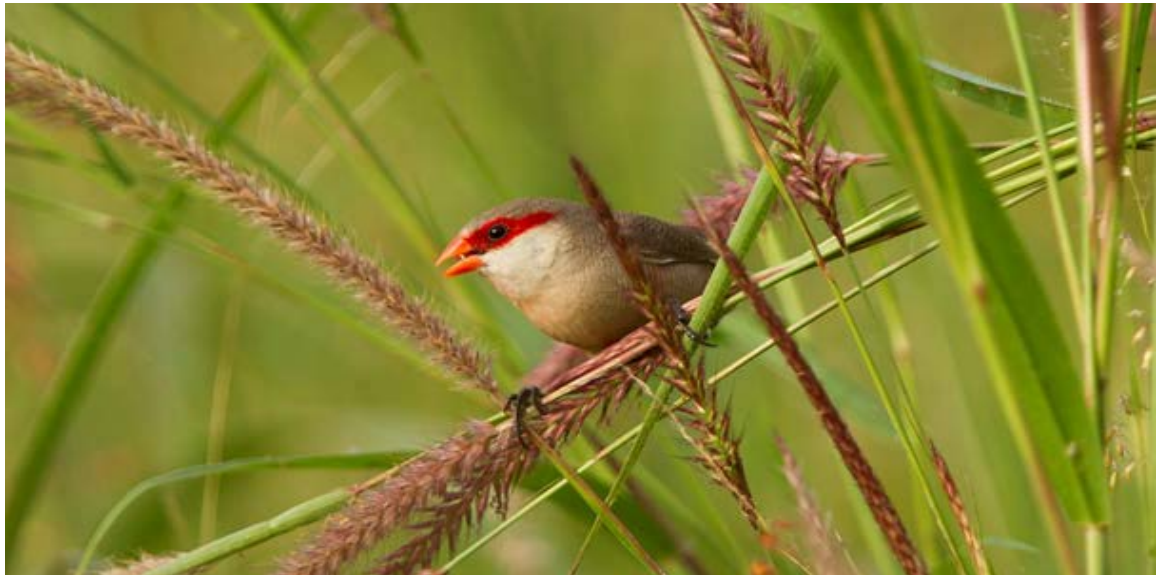
Common Waxbill, Barragem de Poilão, Santiago

10 Banana de Ribeira Montanha, Santiago 6-11, 15 Barragem de Poilão, Santiago 6-11, 10 Barragem de Poilão, Santiago 7-11