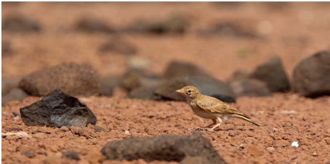
Bar-tailed Lark, Salinas de Pedra de Lume, Sal