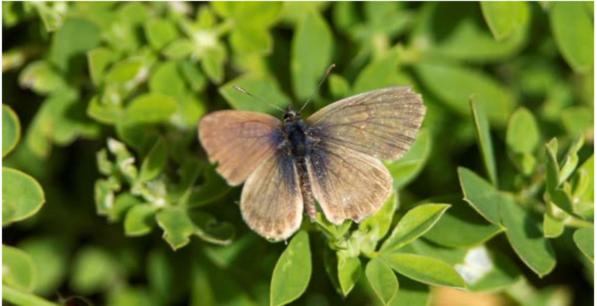
Long-tailed Blue, Agua dos Patos, São Nicolau , São Nicolau