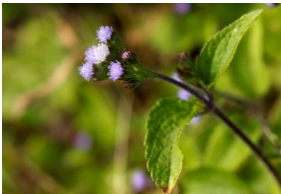
Água dos Patos, São Nicolau