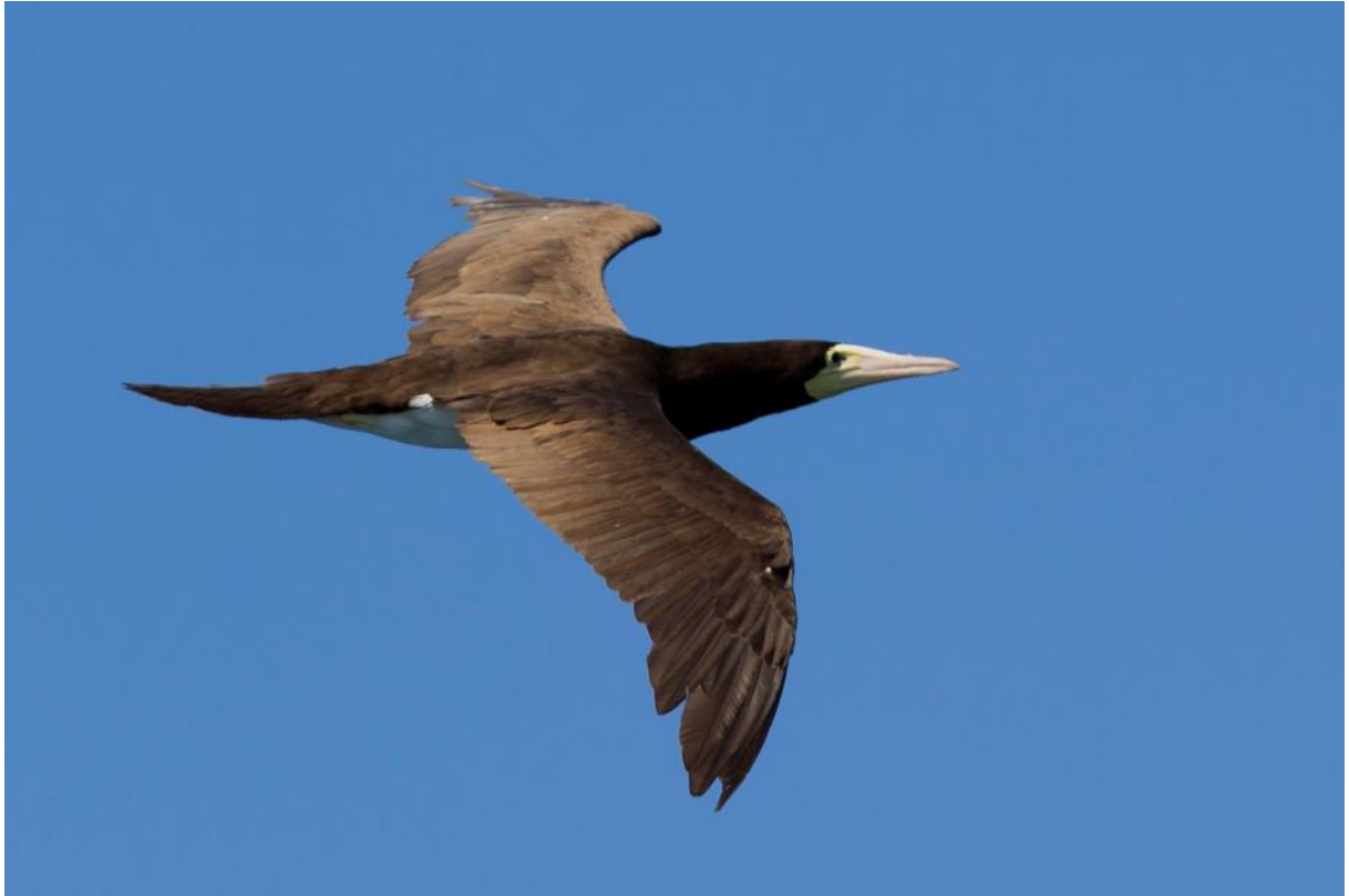
Brown Booby, Raso