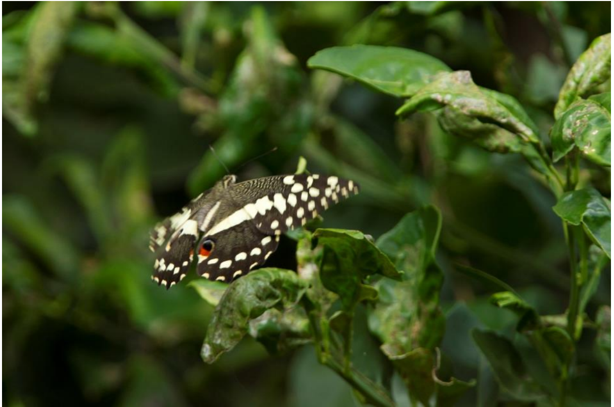
Citrus Swallowtail, Banana de Ribeira Montanha, Santiago