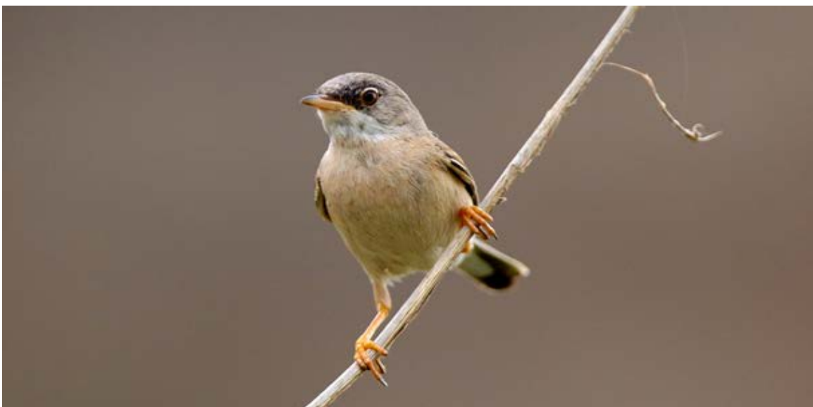
Spectacled Warbler, Povoação Velha, Boa Vista