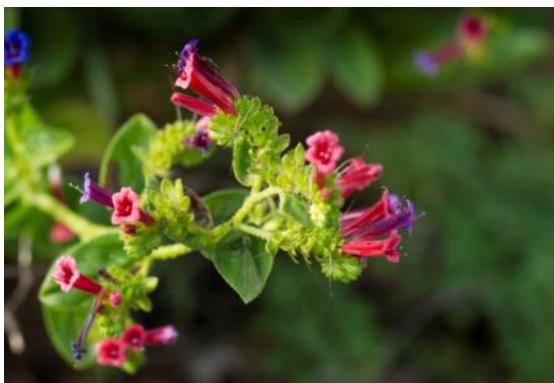
Água dos Patos, São Nicolau