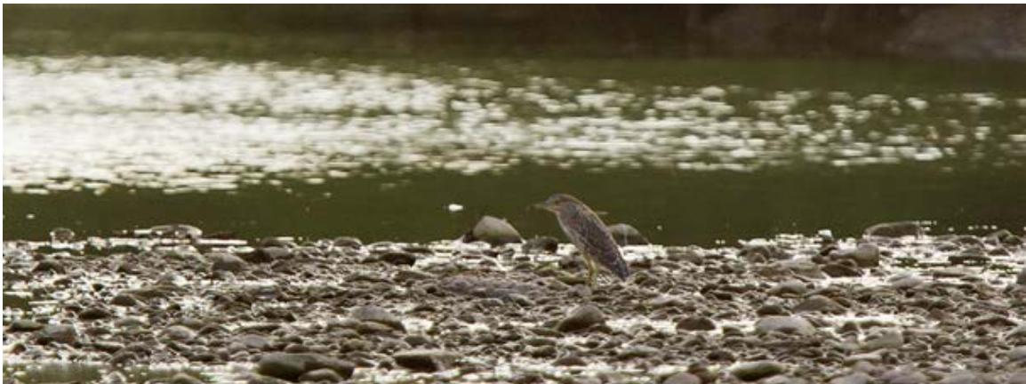
Juv Black-crowned Night Heron, Lagoa de Pedra Badejo, Santiago