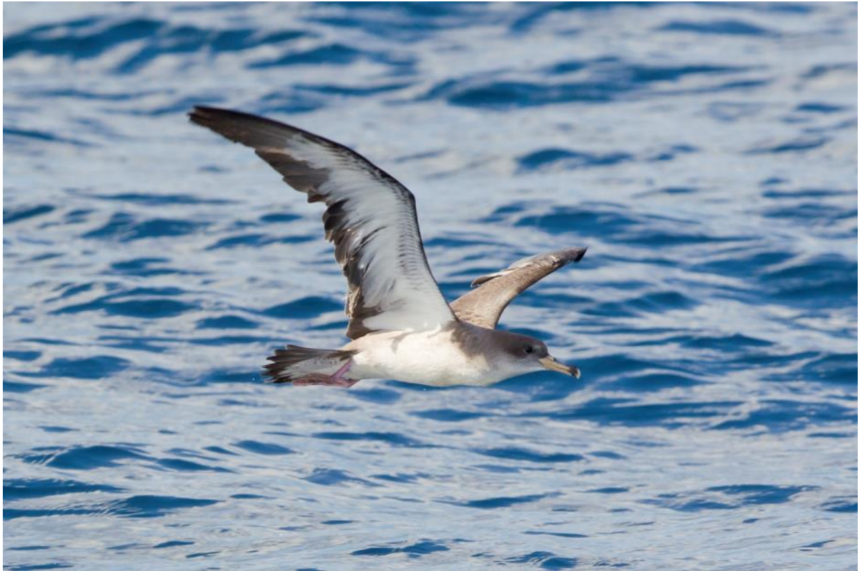
Cory's Shearwater, Raso