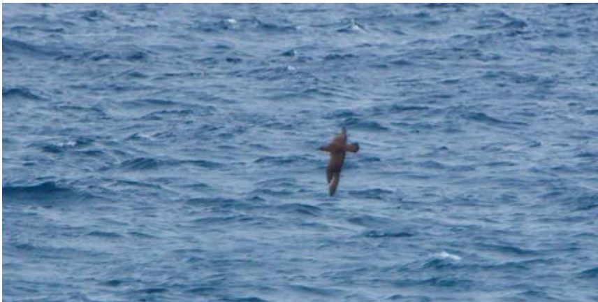
Great Skua, Curral Velho, Boa Vista