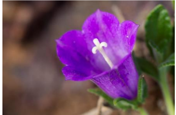
Água dos Patos, São Nicolau