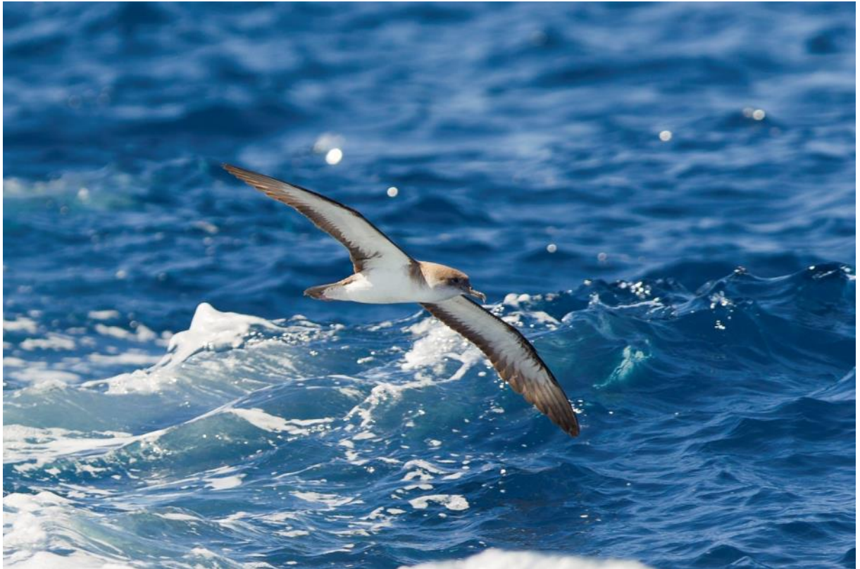
Cape Verde Shearwater, Raso