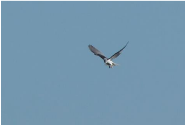
Black-shouldered Kite, Alcochete, Portugal