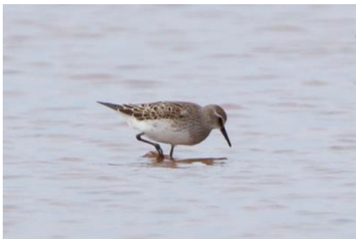
White-rumped Sandpiper, Sal Rei, Boa Vista