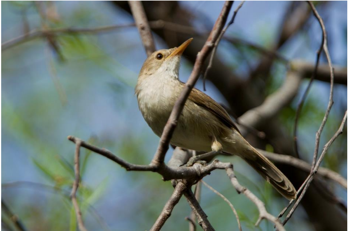
Cape Verde Swamp-Warbler, Jardim Botânico de São Jorge dos Órgão, Santiago