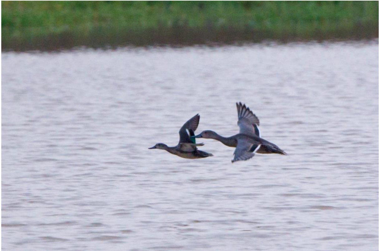
Common Teal and Northern Pintail, Ribeira da Madama, Sal