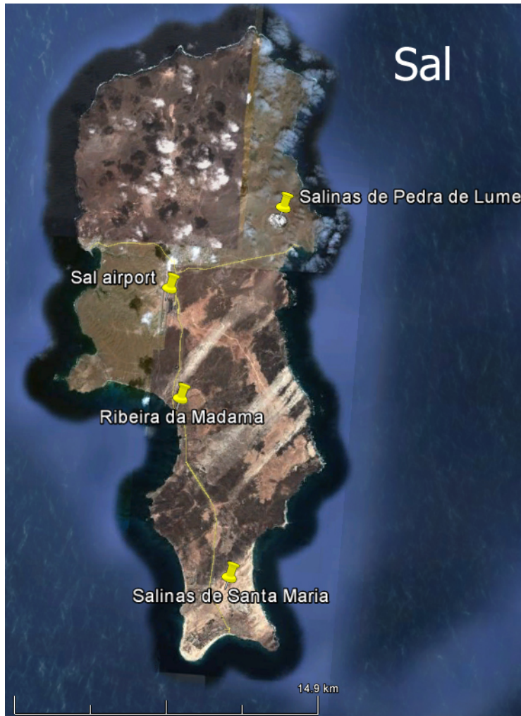
Visited localities on Sal

Birding on the central parts of São Nicolau in the morning. Some interesting butterflies, e.g. a larvae of Death's-head Hawk-moth and possibly the first record of Black-Bordered Babul Blue on São Nicolau. We also had Helmeted Guineafowl and Lesser Cape Verde Kestrel. The last subspecies treated as a full species by some authorities. In the evening we made a short flight to Sal where we stayed at Hotel Central in Espargos.