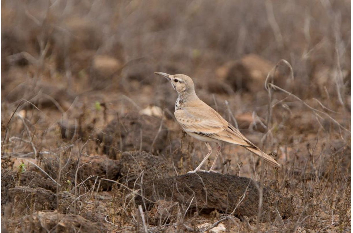
Greater Hoopoe Lark, Povoação Velha, Boa Vista