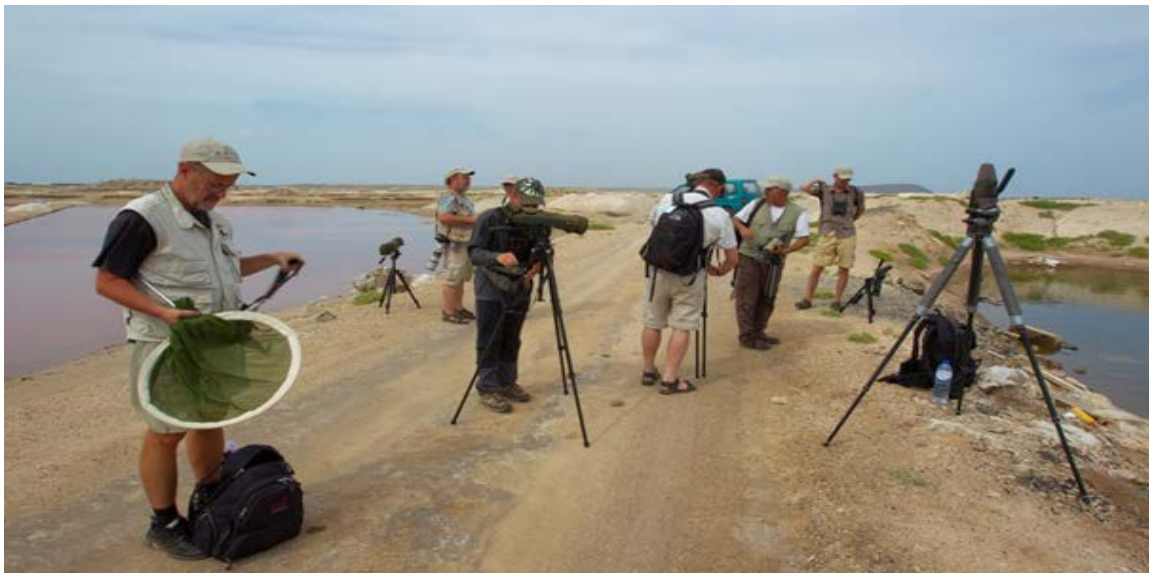
Salinas Santa Maria, Sal