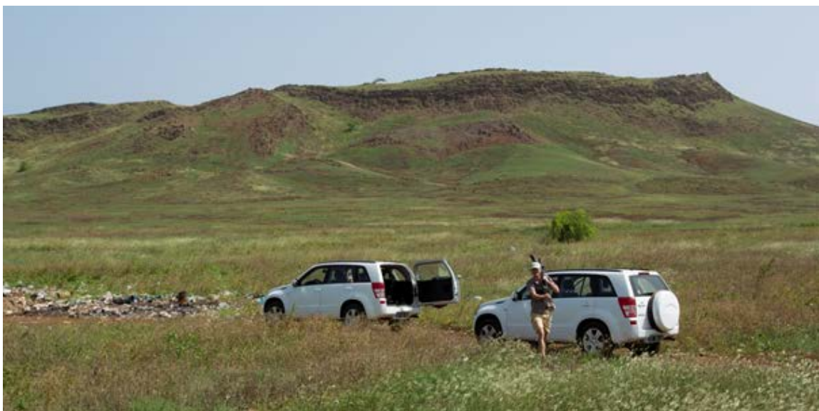
Praia airport, Santiago.

Cattle Egret 1500 Black-crowned Night Heron 1 Squacco Heron 5 Little Egret 20 Bourne's Heron 4 Glossy Ibis 4 Grey Heron 6 Eurasian Spoonbill 10 Common Moorhen 5 Spectacled Warbler 1 Common Waxbill 10