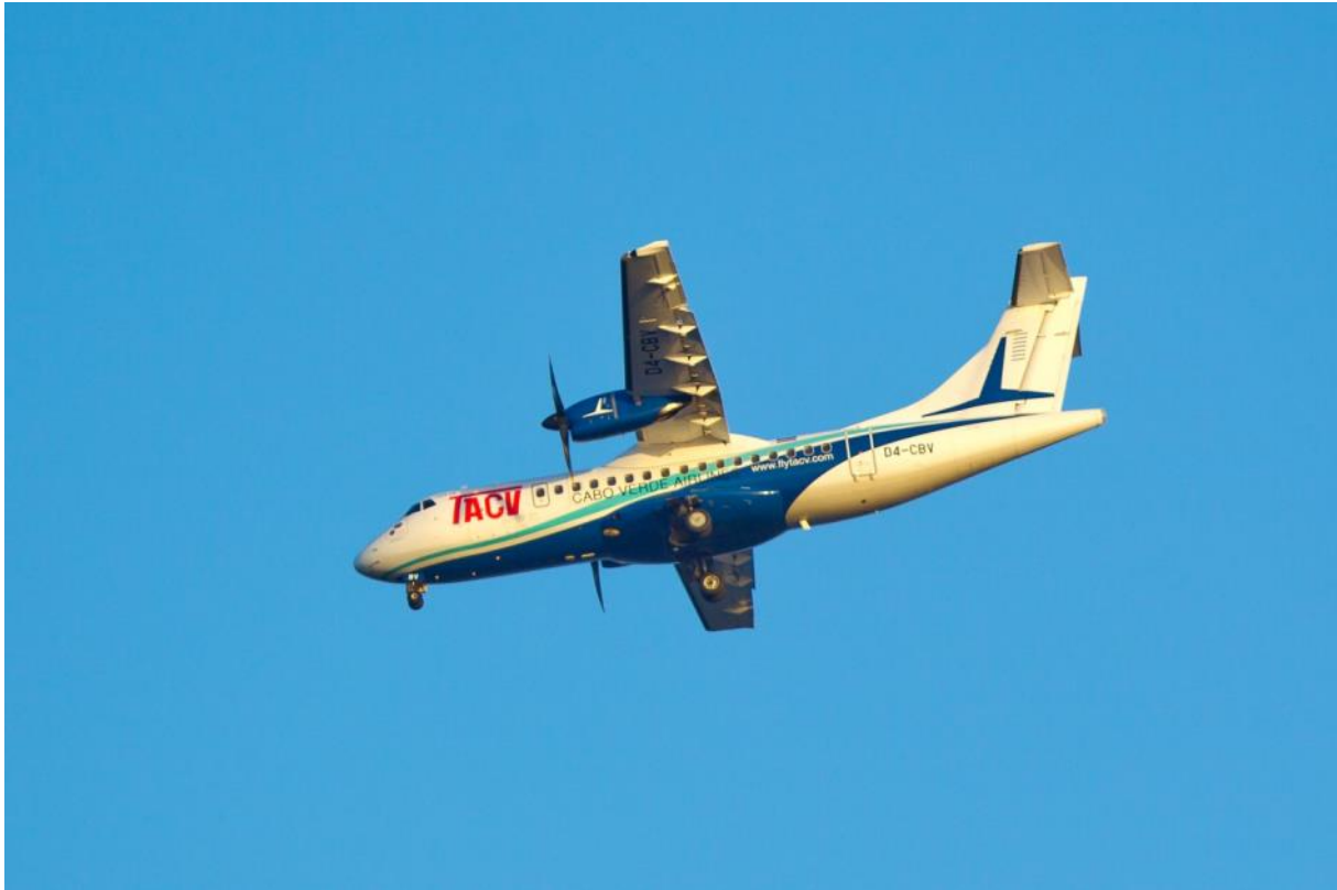
Cabo Verde Airlines, the aircraft carrying us between the islands