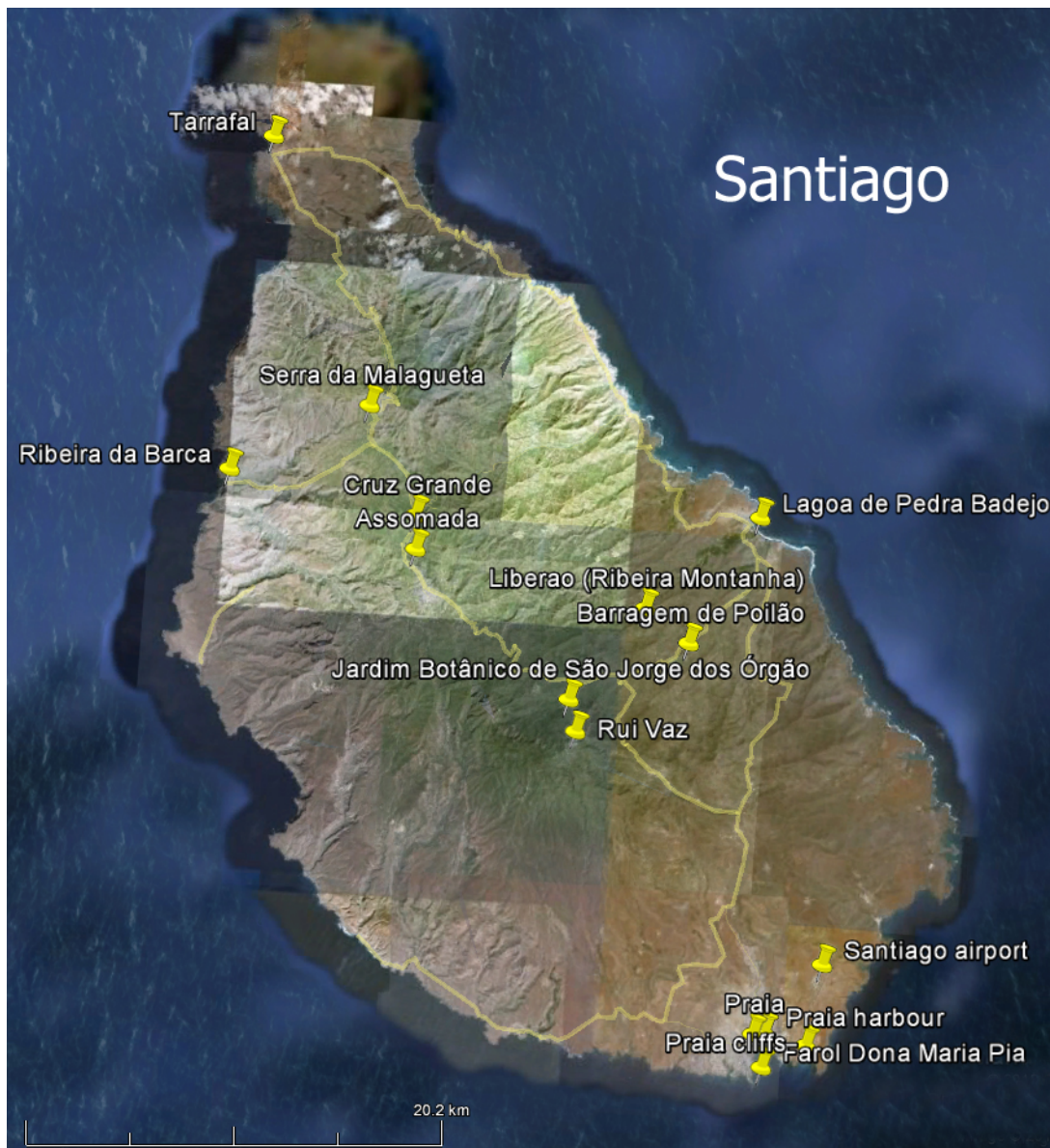
Visited localities on Santiago.