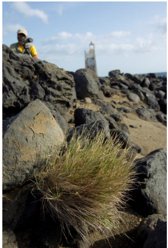
Barril, São Nicolau