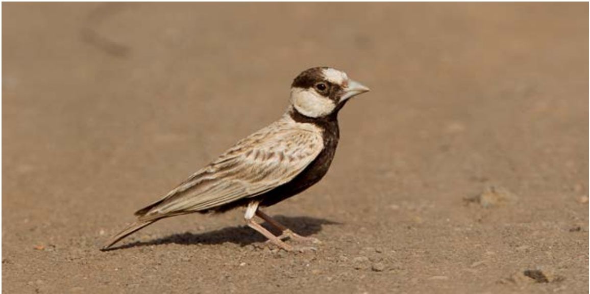
Black-crowned Sparrow Lark, Tarrafal, Santiago