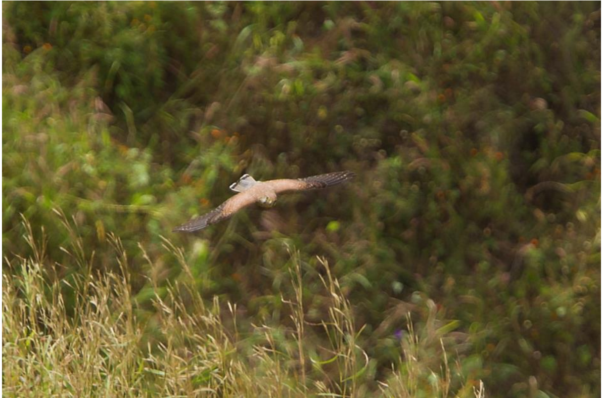
Greater Cape Verde Kestrel, Malageta, Santiago

3 Tarrafal, Santiago 6-11, 6 Serra de Malagueta, Santiago 6-11, 2 Banana de Ribeira Montanha, Santiago 6-11, 2 Jardim Botânico de São Jorge dos Órgão, Santiago 6-11, 2 Barragem de Poilão, Santiago 6-11, 3 Assomada, Santiago 7-11, 2 Rui Vaz, Santiago 7-11, 1 Ribeira da Madama, Sal 12-11, 1 Sal Rei, Boa Vista 12-11, 1 Povoação Velha, Boa Vista 12-11, 1 Sal Rei, Boa Vista-Curral Velho, Boa Vista 13-11, 1 Curral Velho, Boa Vista 13-11, 4 Rabil airport, Boa Vista 14-11, 1 Sal Rei, Boa Vista 14-11