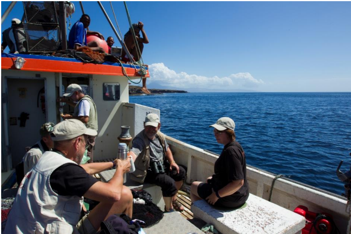
Raso. São Nicolau in distant background.