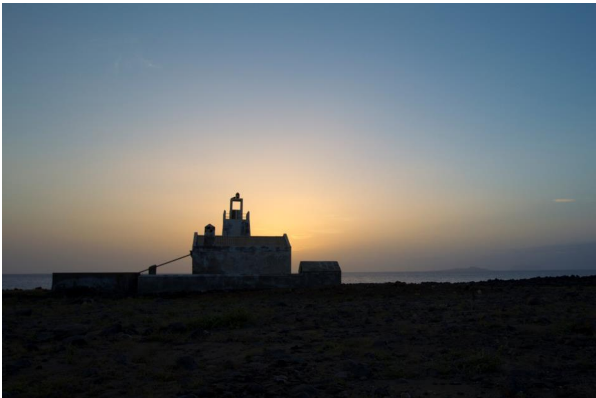
Barril lighthouse, São Nicolau. Raso island in background.