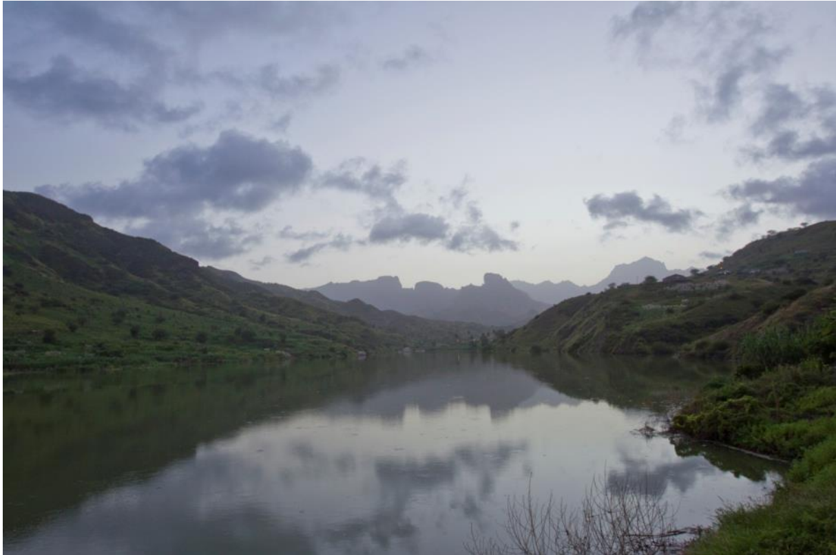
Barragem de Poilão, Santiago