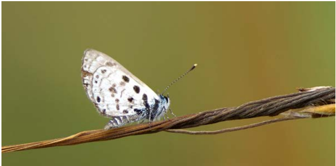
Black-Bordered Babul Blue, Agua dos Patos, São Nicolau