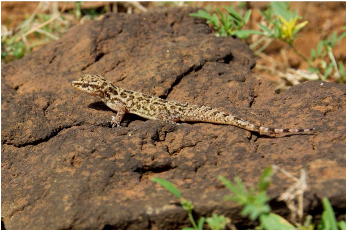
Brook's House Gecko, Praia airport, Santiago

2 Praia airport, Santiago 7-11. Introduced