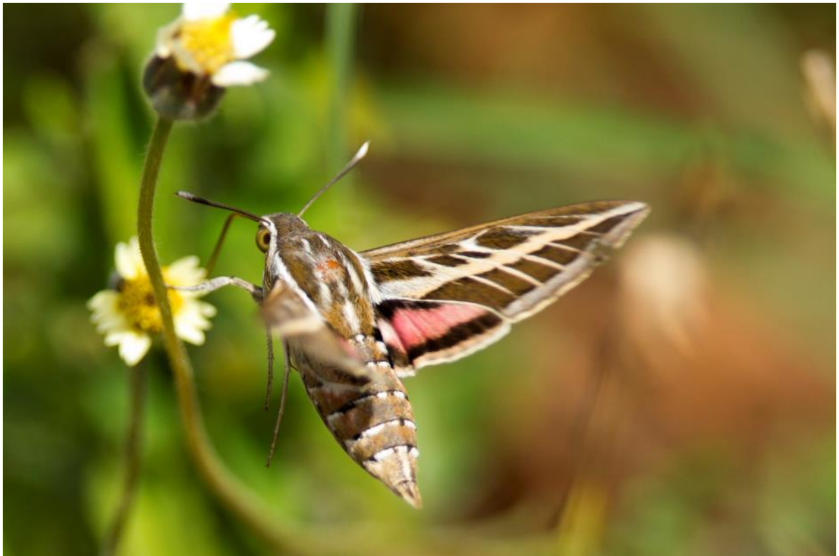
Striped Hawk-moth, Praia cliffs, Santiago