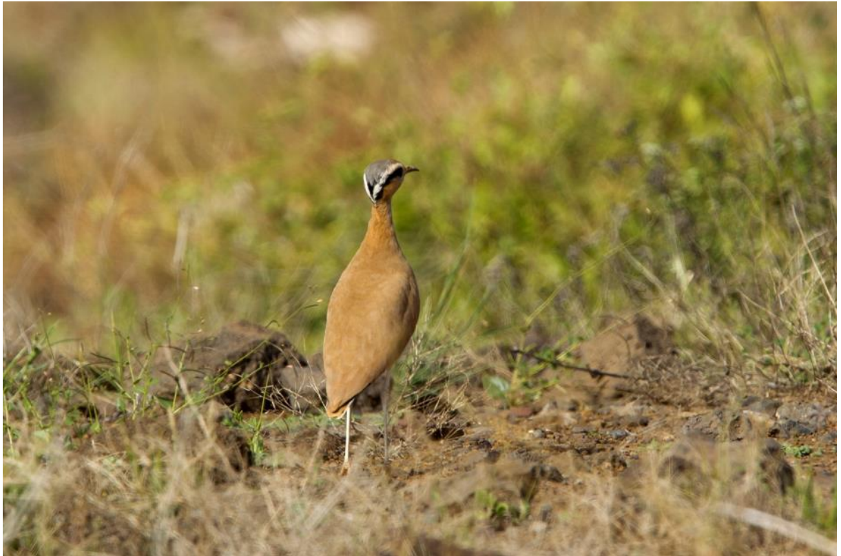
Cream-coloured Cursor, Barril, São Nicolau