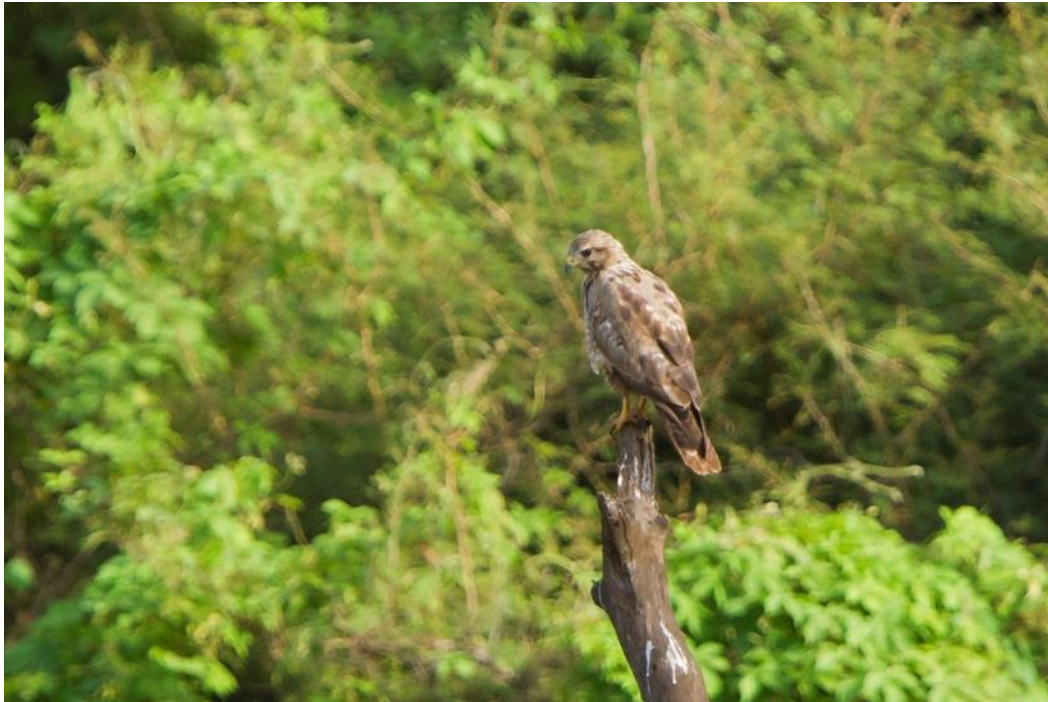
Cape Verde Buzzard, S Barragem de Poilão, Santiago