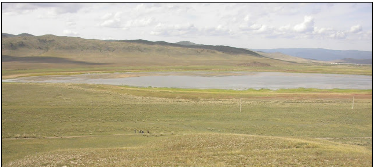
The camp site next to the salt lake south of Orongoy.

Aug 30 th . Arrival Ulan-Ude. Transport to and birding around salt lakes with reed-beds in Orongoy . Night in tents. Locustella warblers and waders.