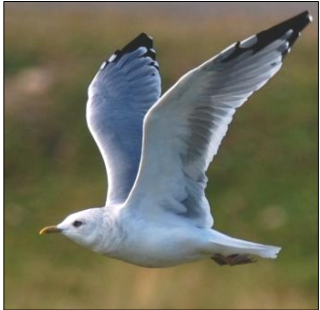
Common gull, Larus canus heinei, Posolskoe

Common Gull , Larus canus heinei . Only a few noted around Orongoy and Beloozersk. Then common at all places visited along Lake Baikal. Adults differed from race canus (not seen during the trip) in having strikingly yellow legs and bill. A majority, if not all, of the adult birds also had light grey irises, reminding of Ring-billed Gull, L. delawarensis . Only a few 2cy birds were seen but some (if not all?) had an interrupted black tail-band similar to Ring-billed Gull. Moreover, the black markings on the head and neck seemed to be coarser than in the corresponding canus plumage. In all, the taxon appeared larger and heavier than canus , resembling Ring-billed Gull in many aspects!