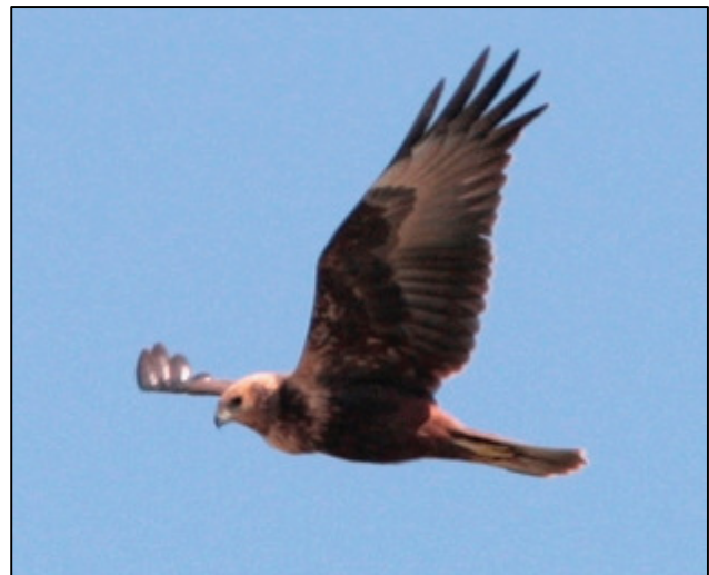
Immature male (left) and 1cy Eastern marsh harrier, Circus spilonotus, Posolsoke.