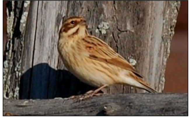
Reed buntings, Emberiza schoeniclus, Posolskoe

Lapland Longspur , Calcarius lapponicus . 2 in Posolskoe and a flock of 11 along the shore in Kultuk.