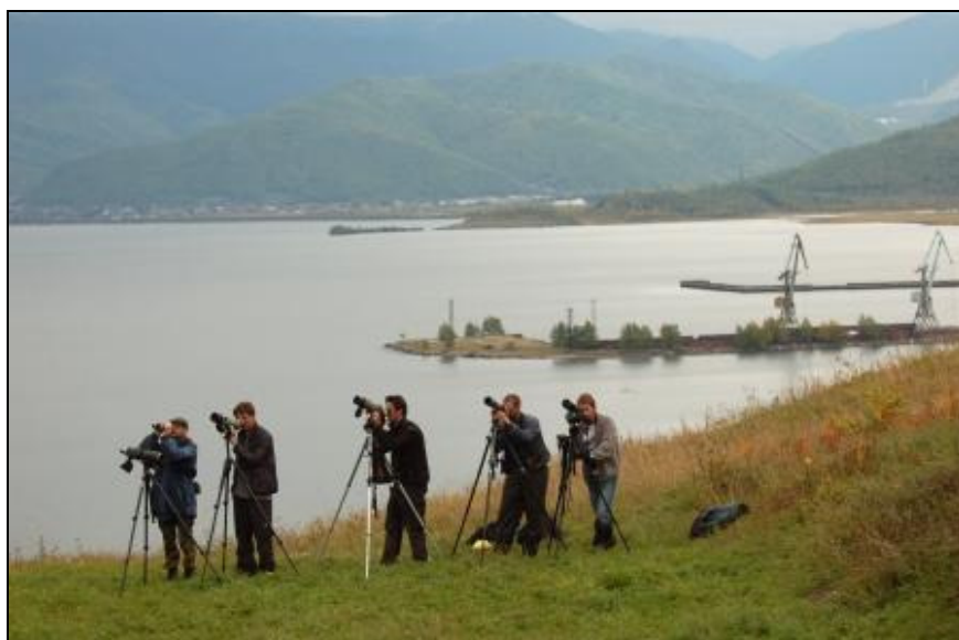
Watching raptor migration in Kultuk.