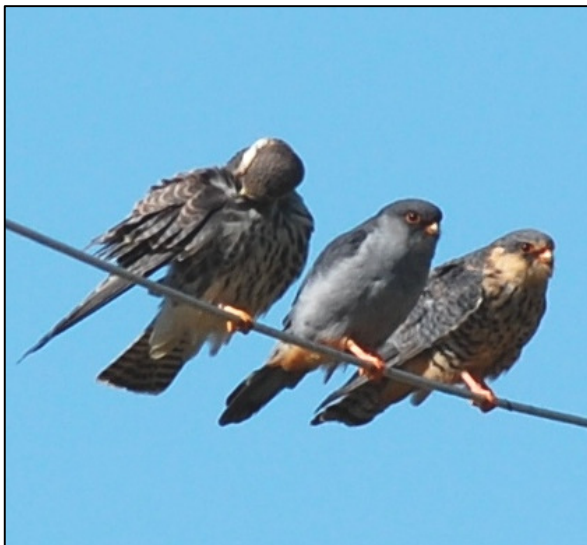
1cy, adult male and female Amur falcon, Enhore.

Amur Falcon, Falco amurensis . Some 75 birds in total; 1 near Talgoy south of Ulan-Ude, 2 Orongoy lake, 18 together on wires close to Ubukun south of Ulan-Ude, more than 50 together in Enhore, these larger congregations possibly gathering for migration, and a few en route from the bus on the way back to the Selenga delta. Fairly even distribution between age and sex.