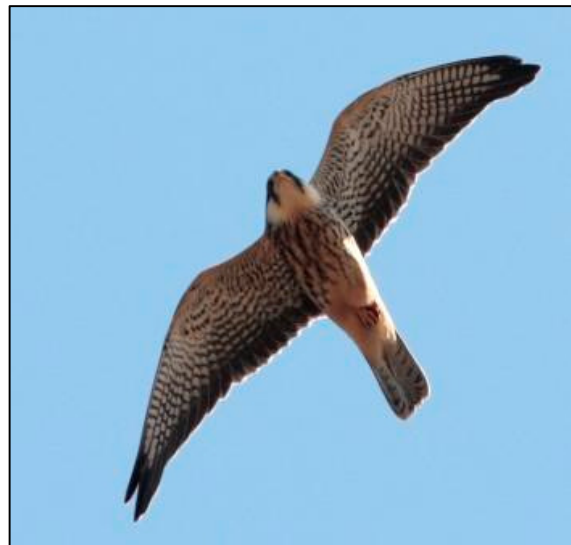
1cy Amur falcon, Ulan-Ude.

Hobby, Falco subbuteo . 1 Orongoy lake, 2-4 daily in Beloozersk, 1 Alimasovo, 3-4 all days in Posolskoe and a family group of 4-5 birds in Kultuk gave an estimated total of 20-25 birds, mostly adults.