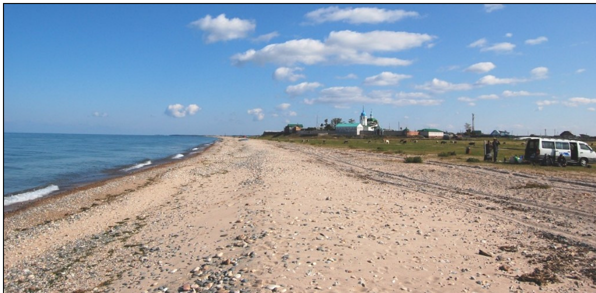
Posolskoe, Lake Baikal.