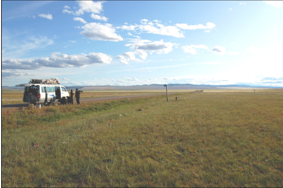
Flat tire close to Beloozersk.

Sept 1 st . Birding Beloozersk , a village close to the Mongolian border surrounded by steppe. Superb accommodation in the school residential. Birding in village gardens, steppe and the two salt lakes on the outskirts of the village. Good numbers of warblers, buntings, ducks, stints and raptors.