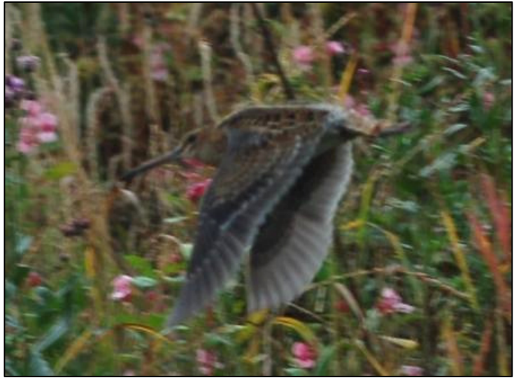
Pintail/Swinhoe's snipe (G. megala/stenura), Kultuk.

Gallinago stenura/megala . In total an estimated 20-25 flushed birds, with a similar distribution during the trip as the previous species, were either of these two species. Some sources claim that most megala leave the Baikal area already in August and that most birds encountered in September are stenura . However, several of our birds were silent and largish birds suggesting megala and we never really figured out what we actually saw. We made quite an effort in trying to solve this