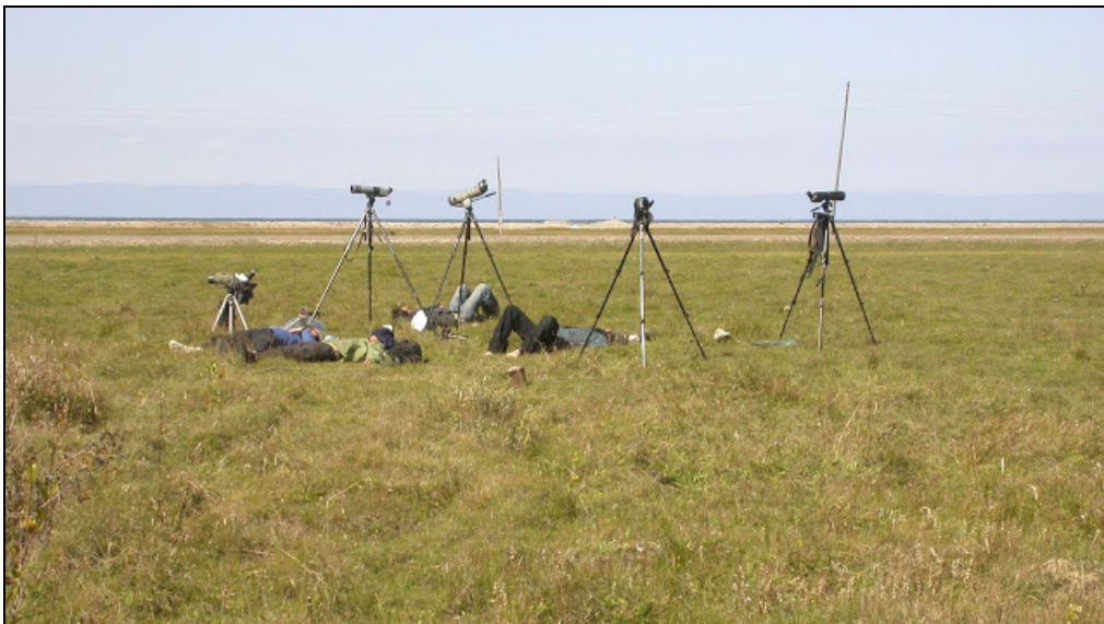
Exhausted birders in Posolskoe.

Buryatia and Lake Baikal has many biotopes in a restricted area and has a lot to offer birdwatchers. The area has experienced a renaissance among birdwatchers during the last decade. For this trip the aim was to get experience from plumages of vagrants that might turn up in Western Europe during autumn. Passerines were of main interest and tour dates were chosen to encounter as interesting species as possible.