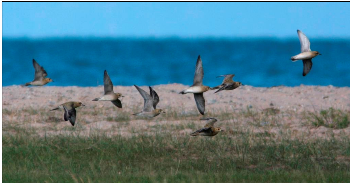
Pacific golden plovers, Pluvialis fulva. Posolskoe.

Grey Plover, Pluvialis squatarola . One adult Alimasovo, 3-4 daily in Posolskoe and a younger bird in Kultuk.