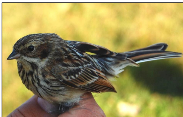
1cy Pallas's reed buntings Emberiza pallasi , Posolskoe