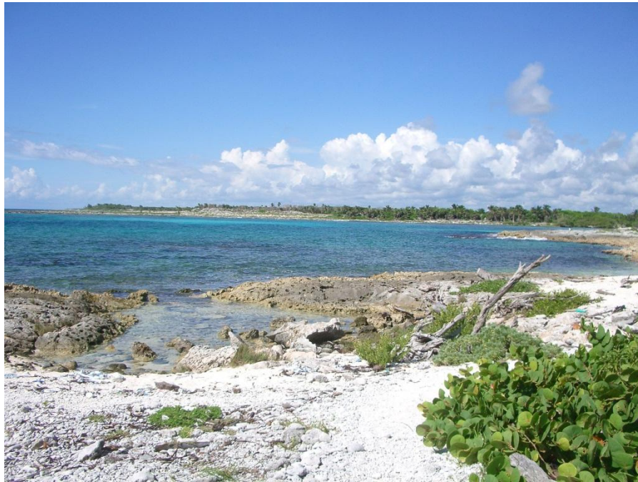
Bay to the south

through eco park or zoo taking up the space behind the beach. This was also a good area free from disturbance with good (abandoned) roads to walk around.