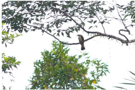
Mindanao Tarictic Hornbill