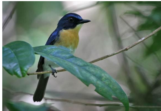
Palawan Blue Flycatcher