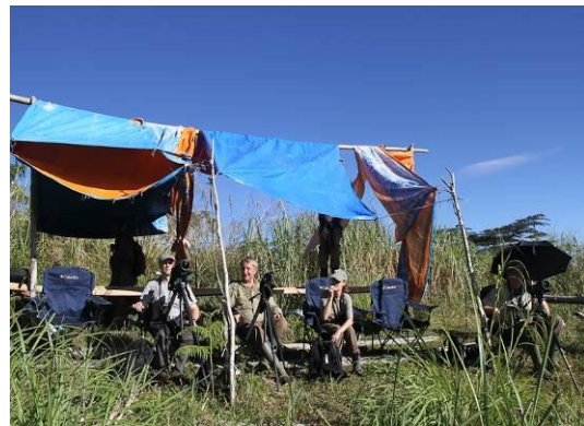
© Roger Holmberg, Looking for the Philippine Eagle

We continued the trail further up and we now walked in a forest rather than a cultivated area like before. In this forest we had several new species like McGregor's Cuckoo-shrike, Rufous-headed Tailorbird, Apo Myna, Olive-backed Flowerpecker, Buzzing Flowerpecker, Black-masked White-eye and Cinnamon Ibon. When we reached the proper elevation it did not take long before we first heard and then managed to see a male Apo Sunbird in the open, sitting in a treetop in the sunshine. Fantastic to see the eagle and the sunbird during the same day! On the way down to camp we managed to see a couple of White-cheeked Bullfinch from close distance and also Grey-hooded Sunbird and Fire-breasted Flowerpecker.