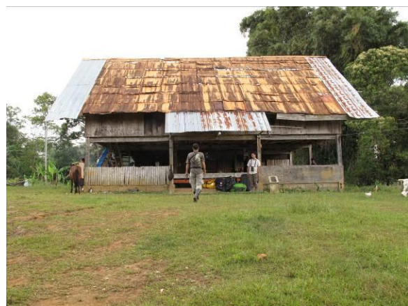
© Fredrik Rudzki, Del Monte Lodge