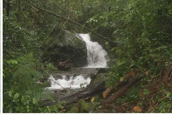
© Roger Holmberg, Sawa camp washing facility