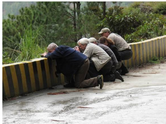
© Fredrik Rudzki, Photographing the Redstart