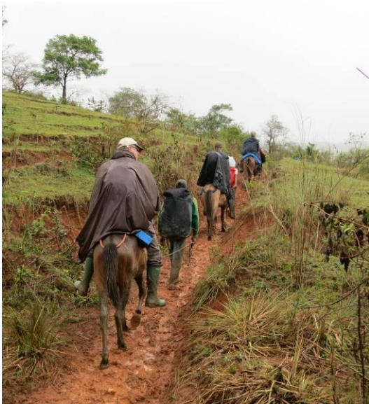
Three hour horse-ride

smokers, and it was quite amazing that they managed to keep up the high tempo they had leading us to Sawa.