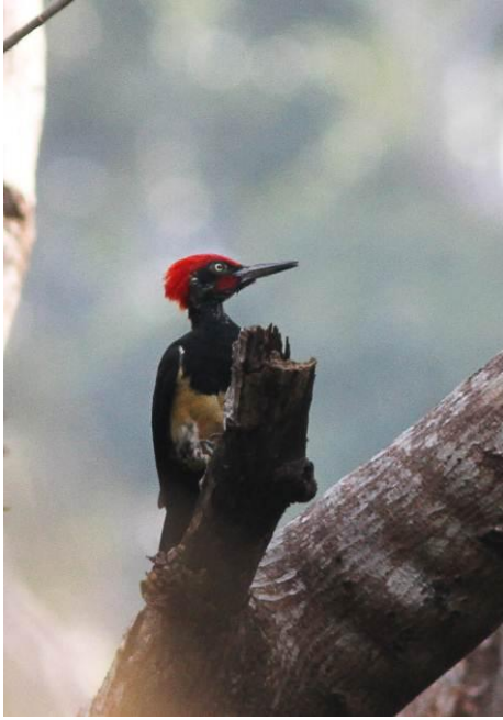
© Roger Holmberg, White bellied Woodpecker