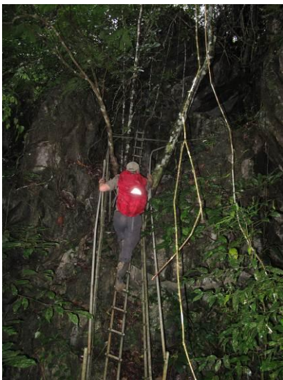
Reaching the platform