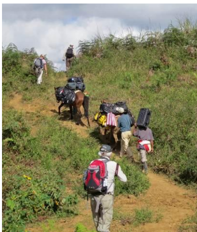
Walk to the lodge