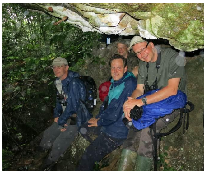
Taking cover for the rain

Back at our mini-bus we took farewell of Oking, Jake and the dog and started our trip back to Cebu City. Due to the raining the dirt road was very slippery and we all had to get out of the mini-bus and push it up along the steep road. Oking was very helpful and followed our way up with his motorcycle until he saw that we were ok and headed back home again. We reached our nice hotel at 17.00 p.m., had a nice dinner and an early evening