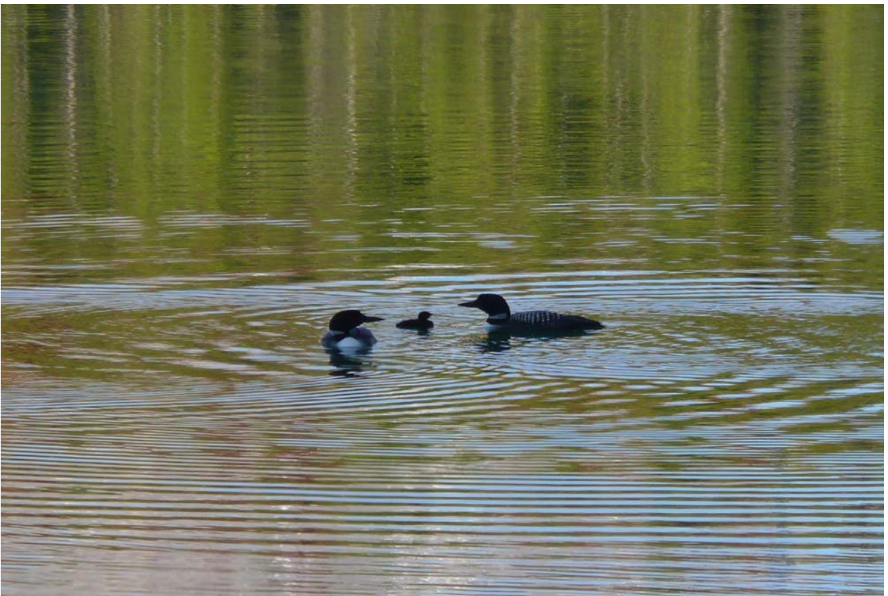
Fig. 9. A family of Northern Divers , along the Icefields Parkway.