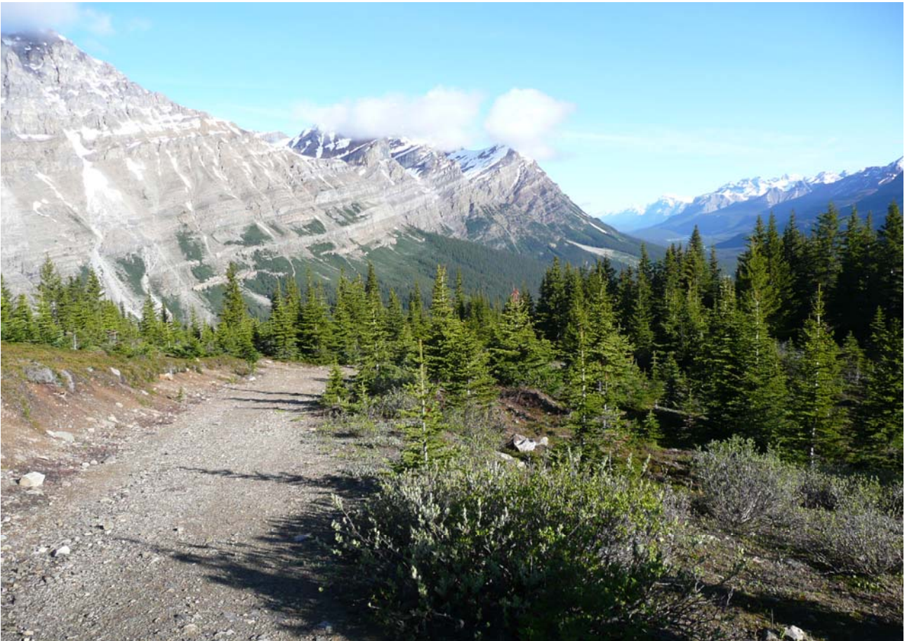
Fig. 4. The Bow Summit track, close to tree-line.