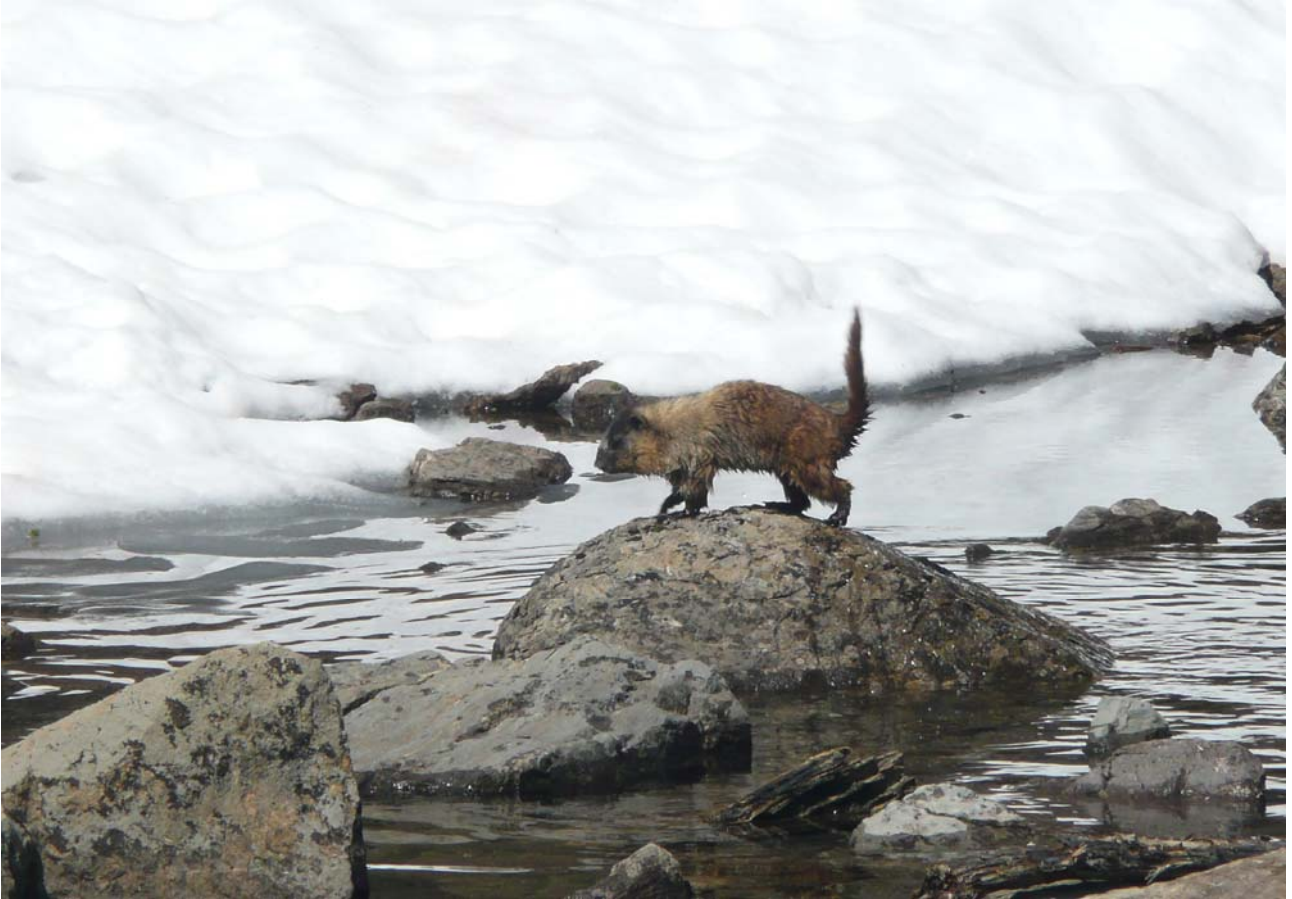
Fig. 7. A Hoary Marmot on a rock, after a dip in icy snowline waters.