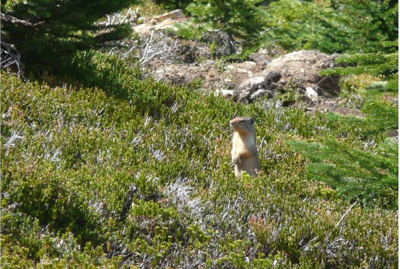
Fig. 8. Columbian Ground-Squirrels inhabit the tree-line at Bow Summit.