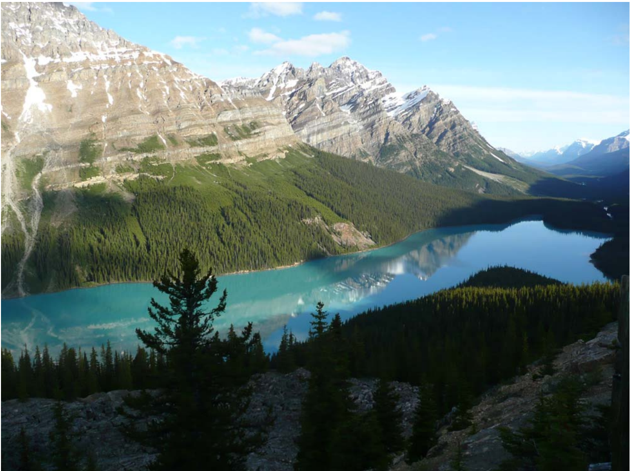
Fig. 1. Morning at Peyto Lake – an archetypal view of Canadian Rockies.