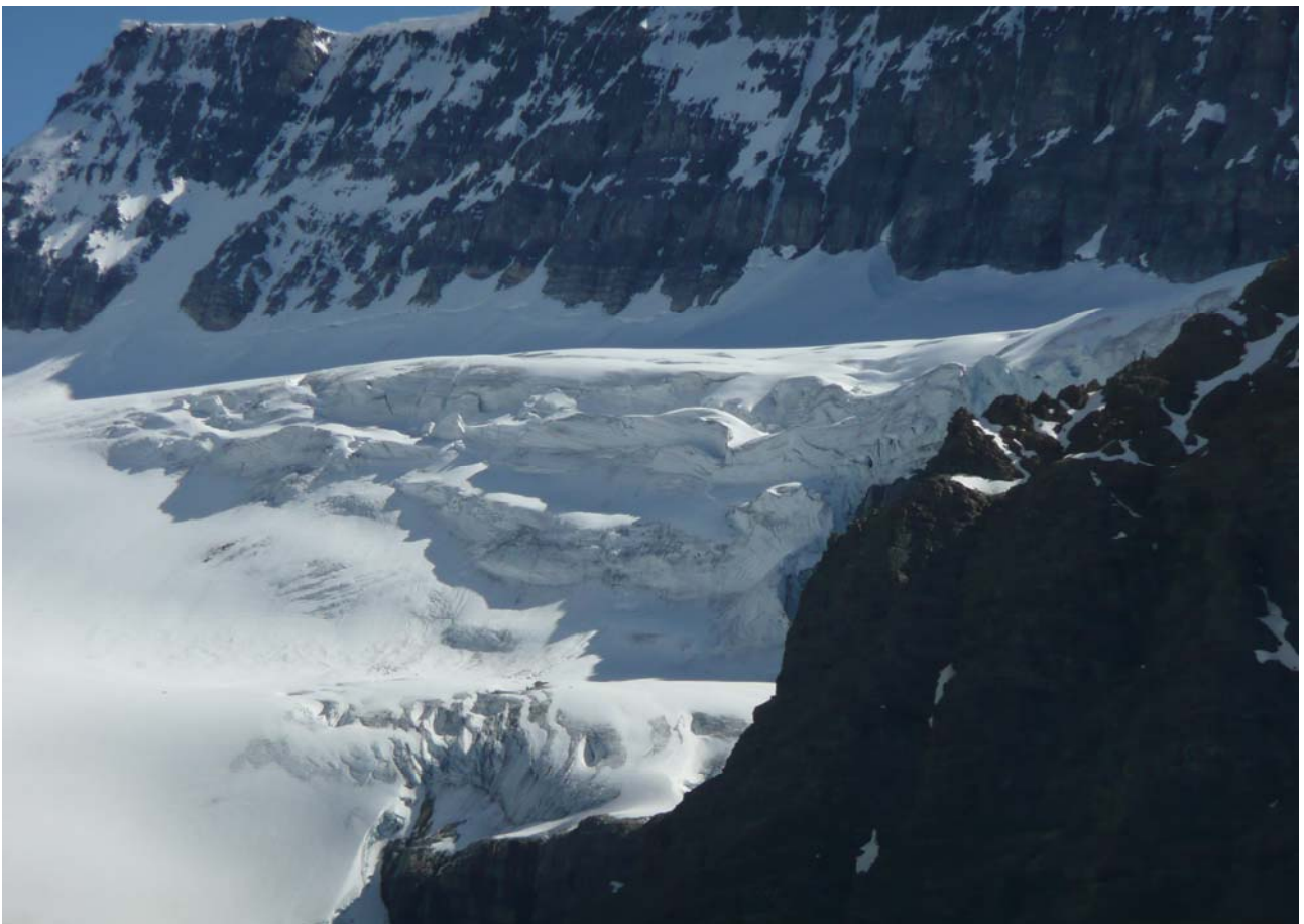
Fig. 2. One of the glaciers along the Icefields Parkway, Banff National Park.

A group of female Bighorn Sheep was seen close to Deadman's Flats, right by the Highway 1, grazing on green roadside grass. Great scenery!