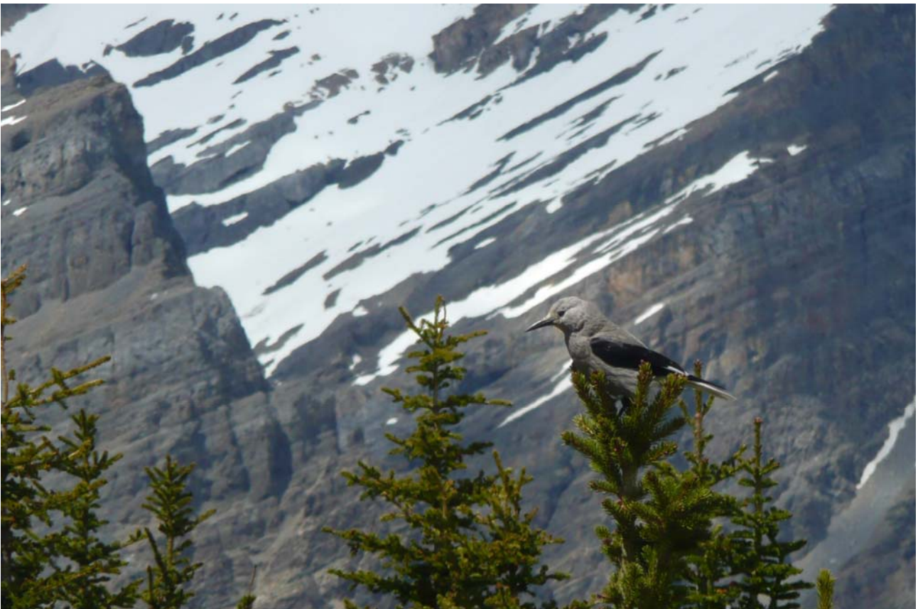
Fig.5. A Clark's Nutcracker, one of the common species at Bow Summit.