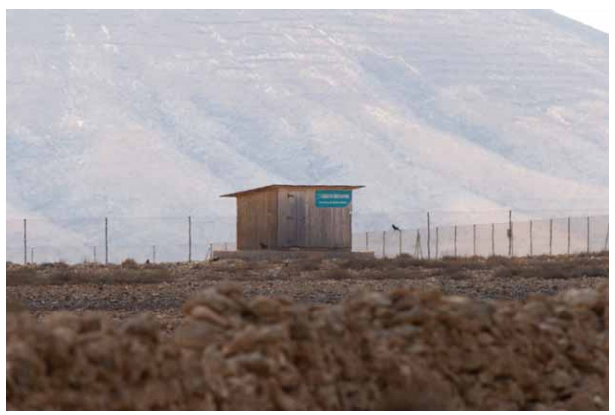
Tiscamanite vulture feeding station. No further than this!