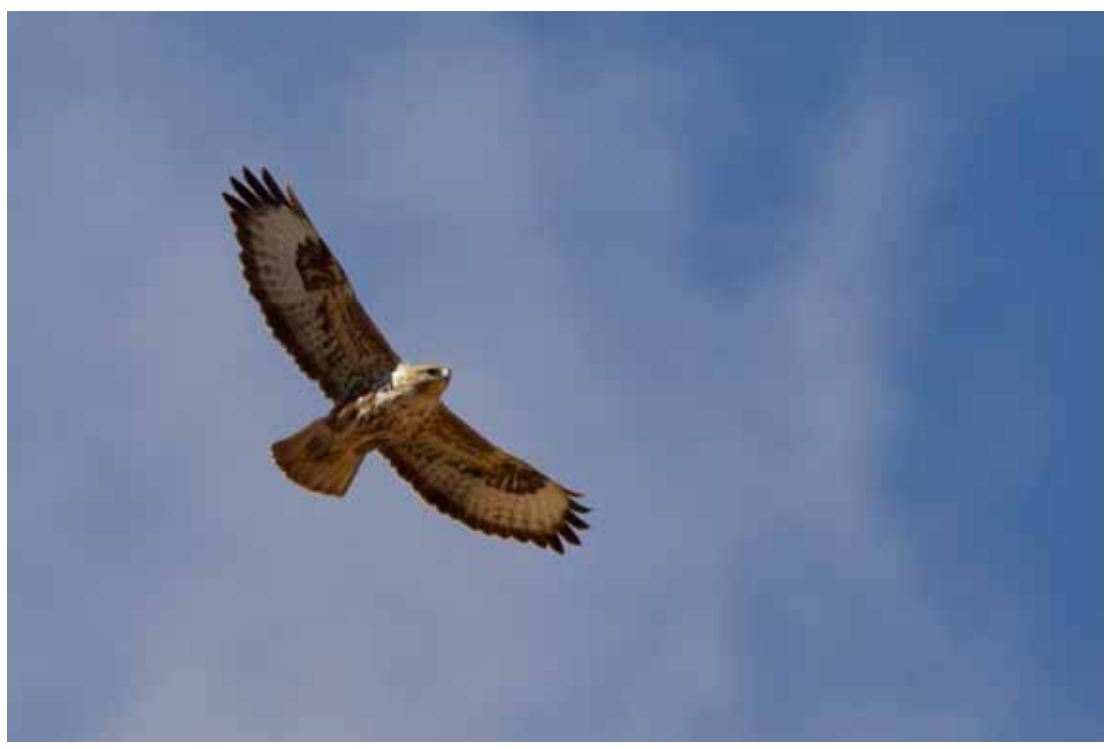
Canarian Common Buzzard, Barranco de Rio Cabras 24-2.

East Canarian Common Kestrel (Falco tinnunculus dacotiae) (7 rec., 11 ind.) 1 male Salinas del Carmen 21-2, 1 Lajita 21-2, 2 Viewpoint Las Penitas 22-2, 1 Los Molinos reservoir 22-2, 4 Barranco de Rio Cabras 24-2, 1 male Rosa del Taro dam 25-2, 1 Tindaya 26-2