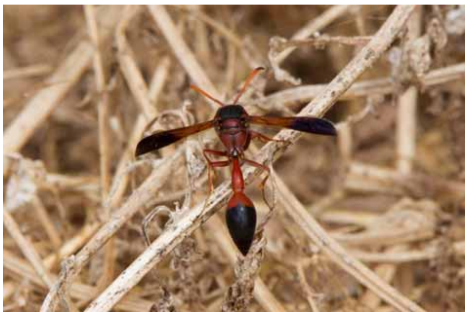
Delta dimidatipenne, Barranco de la Torre 21-2.

6. Leafcutter bee (Megachile sicula) (1 rec., 10 ind.) 10 12:20-13:20 Punta de Paso Chico 26-2.