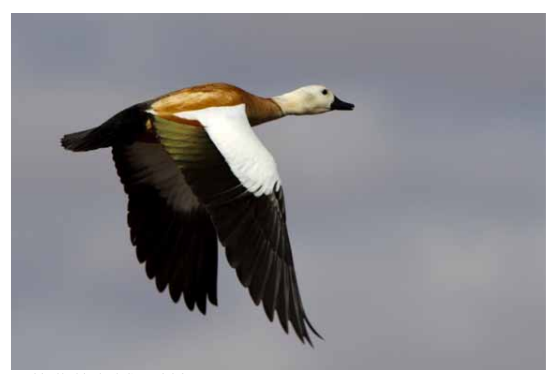
Ruddy Shelduck, Salinas del Carmen 21-2.

Unexpectedly common and seen in most places. By far the most at Los Molinos reservoir. The numbers at this locality, I guess, are very high. According to Clarke (2006) the first record on the Canaries was as late as in April 1994 (a female at Catalina de Garcia reservoir). In 1999 a maximum count was up to six pairs. A marked increase was in 2004 when 47 were recorded in Los Molinos reservoir. The expansion appears to have continued.