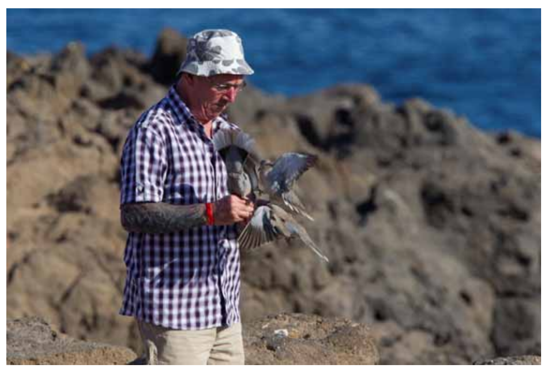
Eurasian Collared Dove, Costa Calma seapoint 25-2.