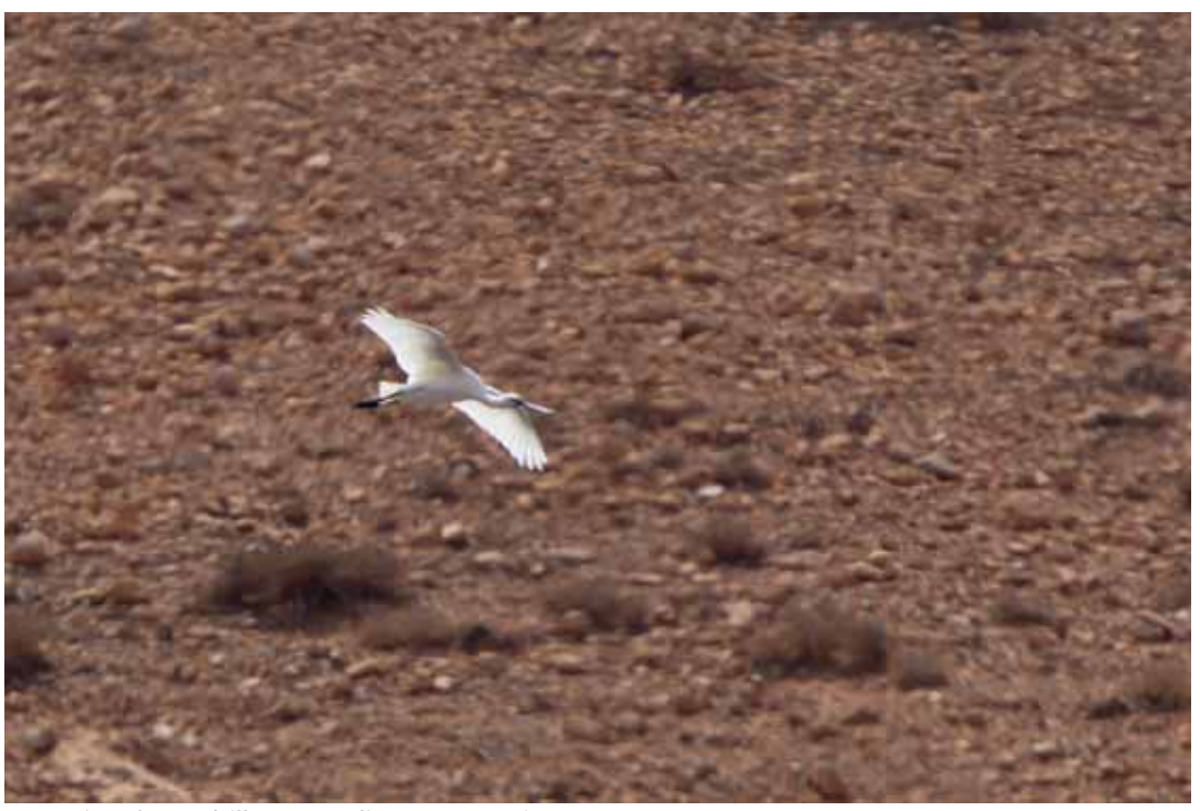
Eurasian Spoonbill, Los Molinos reservoir 23-2.