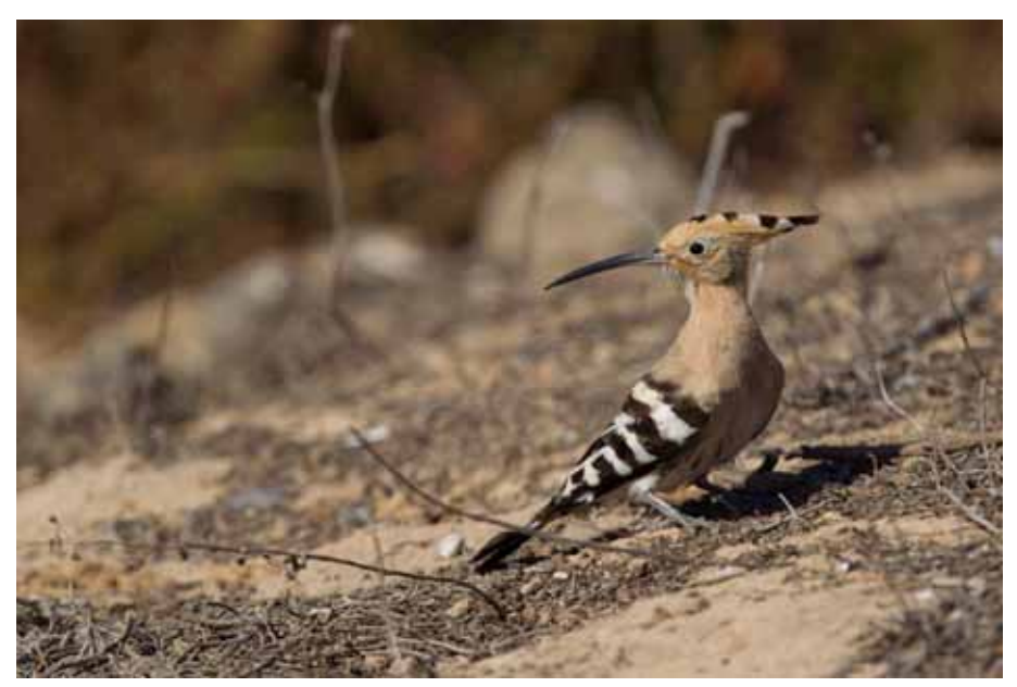
Eurasian Hoopoe, Corralejo 25-2.

56. Eurasian Hoopoe ( Upupa epops ) (6 rec., 10 ind.) 1 Barranco de la Torre 21-2, 2 Tindaya 22-2, 2 Barranco de Rio Cabras 24-2, 3 Singing Aqua Verdes 26-2, 1 Tindaya 26-2, 1 El Cotillo 26-2 Breeding resident on all islands, but far more frequent on eastern islands (Clarke 2006).