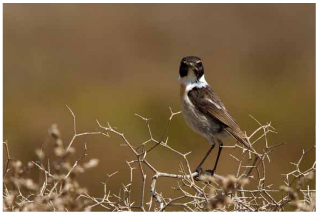
Male Canary Islands Stonechat, Barranco de la Torre 21-2.