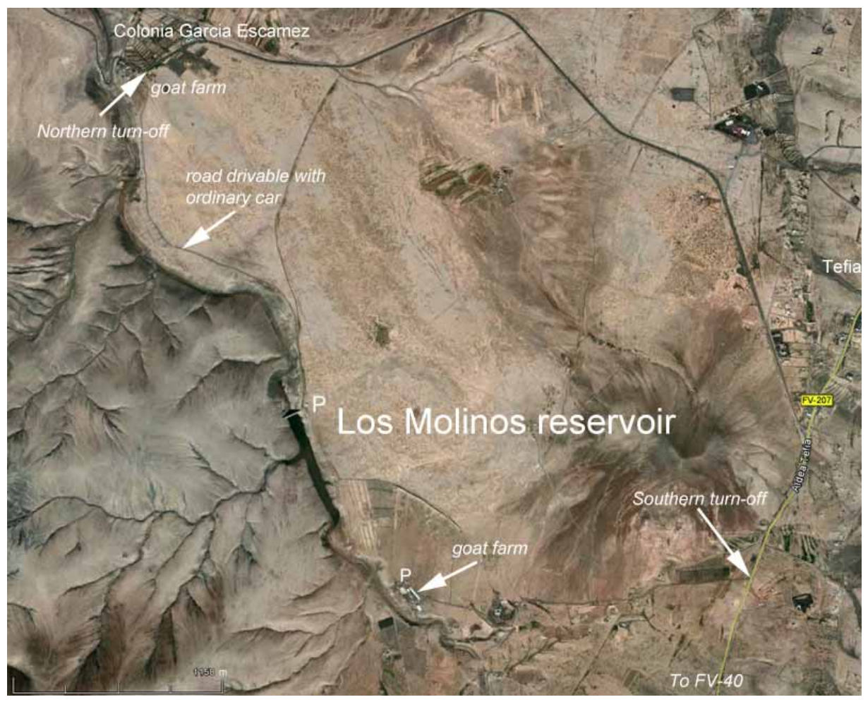
Other birders had Hourbara Bustard about 200 m ESE "z" in Escamez at dusk.