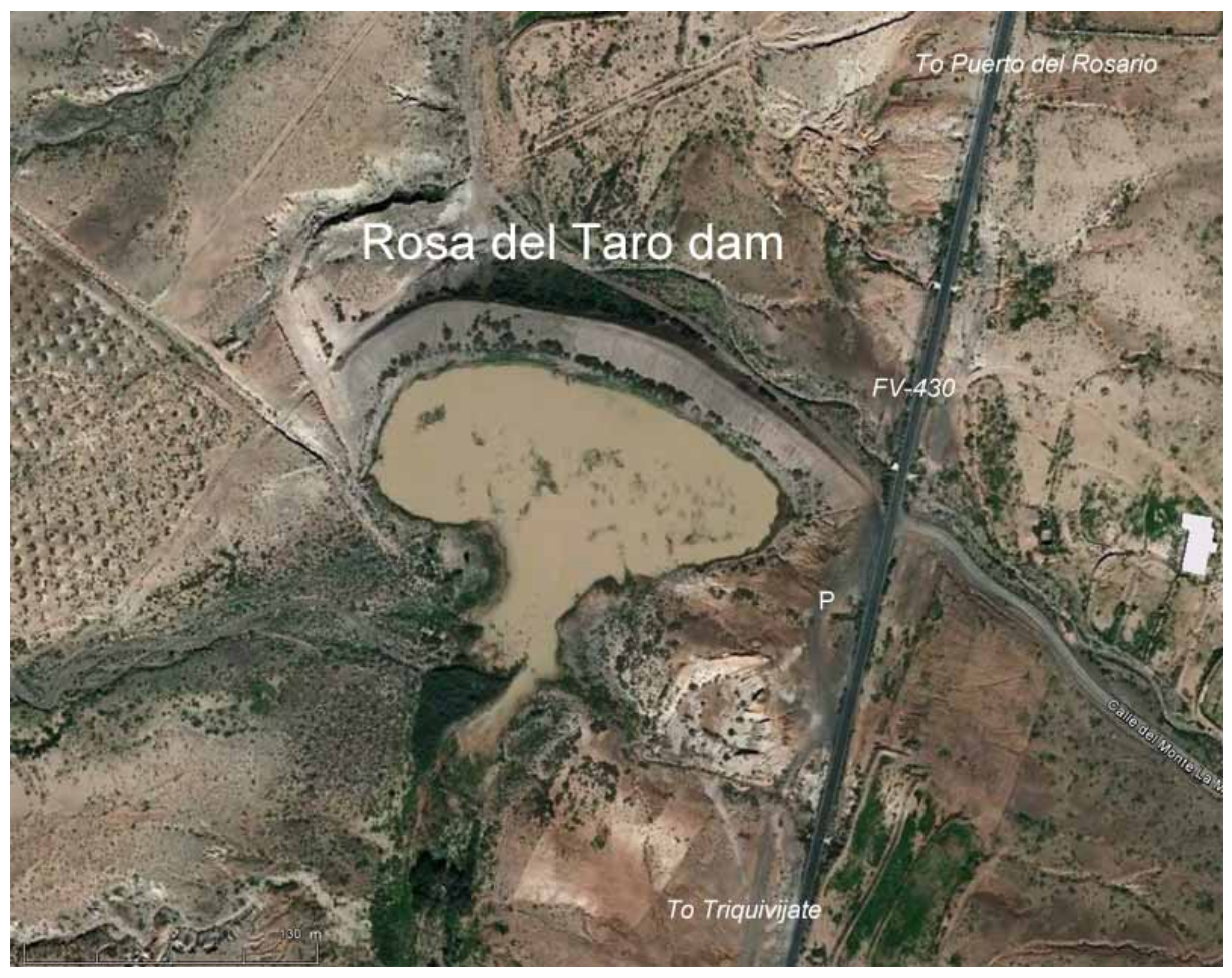
Much less water than on this picture, made it easy to walk around the dam.