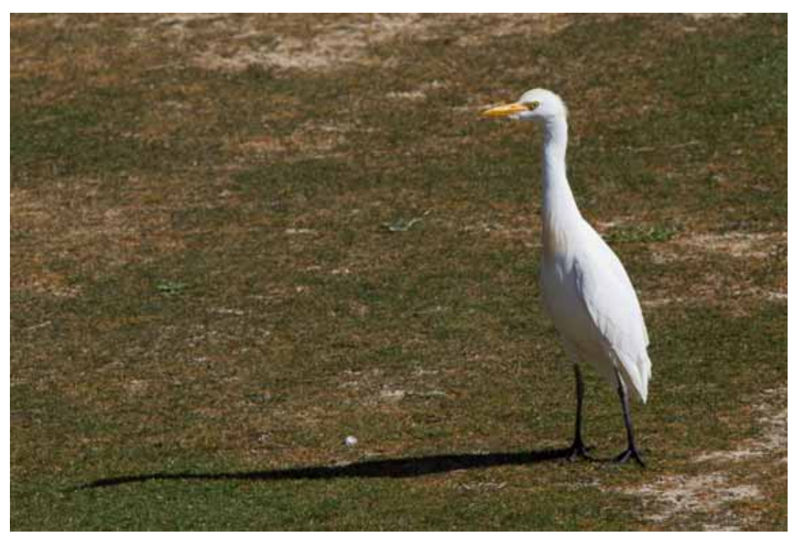
Cattle Egret Barranco de Vinamar 21-2.