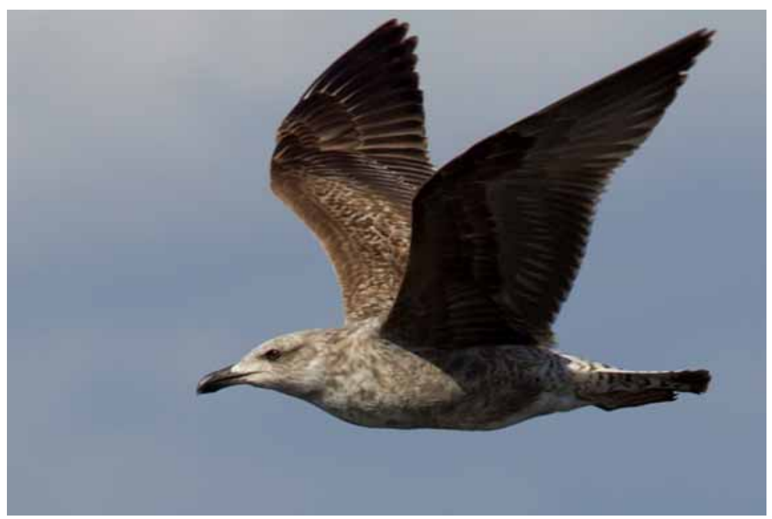
Yelleow-legged Gull 2nd cal. year, Corralejo 23-2.