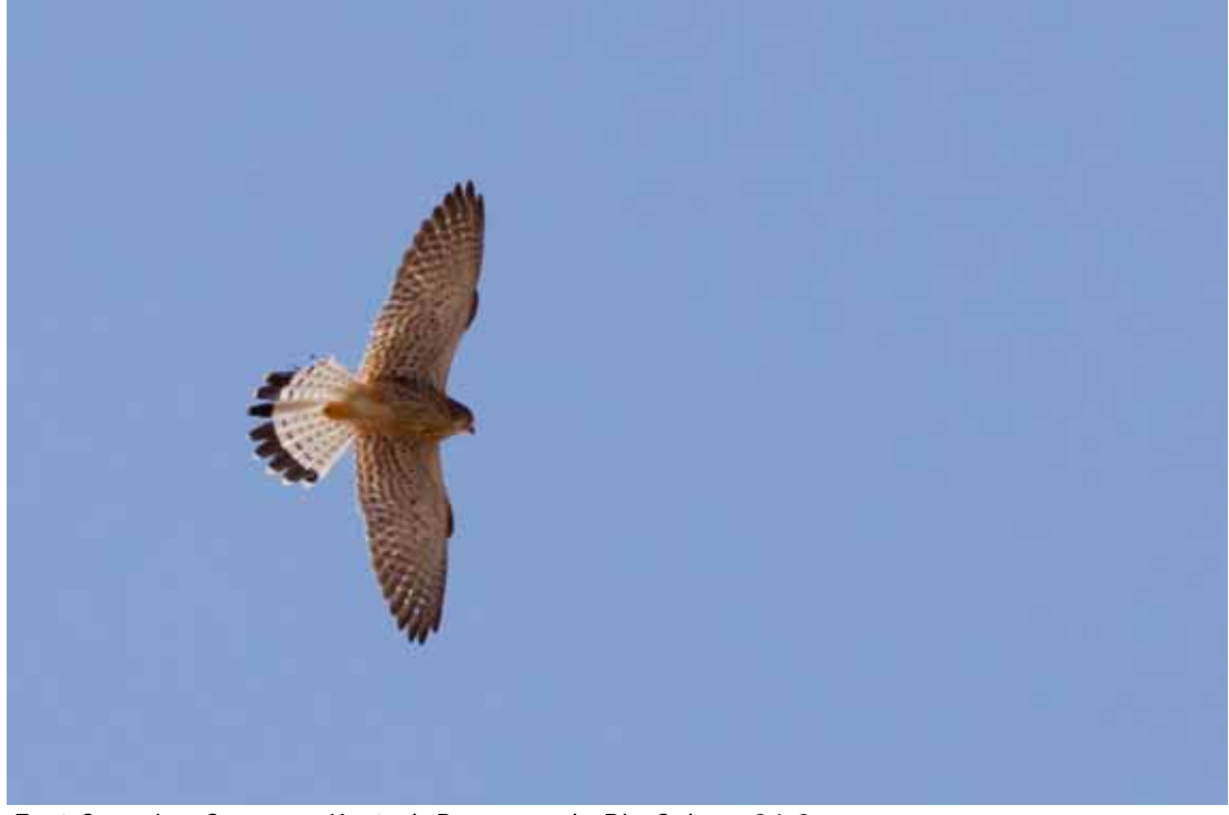
East Canarian Common Kestrel, Barranco de Rio Cabras 24-2.

Also a few more seen during transportation. Male of this ssp. is paler on the upperparts than nominate tinnunculus and the west-canarian ssp. canariensis, but intermediate in spotting. The female is the palest of the ssp. (Clarke 2006). Ssp. dacotiae should be common and nominate tinnunculus a scarce passage migrant (Clarke 2006).