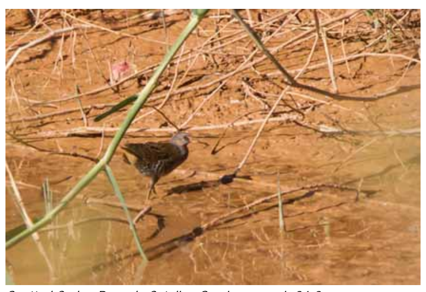
Spotted Crake, Rosa de Catalina Garcia reservoir 24-2.