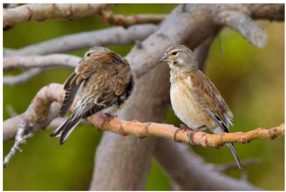
Common Linnet, Caleta de Fuste 21-2.

78. Trumpeter Finch (Bucanetes githagineus amantum) (6 rec., 81 ind.) 3 Salinas del Carmen 21-2, 30 Barranco de la Torre 21-2, 1 Singing Caleta de Fuste 22-2, 20 Los Molinos reservoir 22-2, 2 Los Molinos reservoir 23-2, 25 Barranco de Rio Cabras 24-2 Very common in the barrancos. Many birds territorial and singing. In Canaries far more common on eastern islands (Clarke 2006).