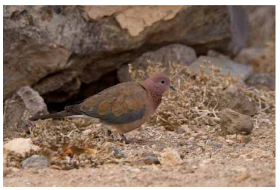
Laughing Dove, Caleta de Fuste 21-2.