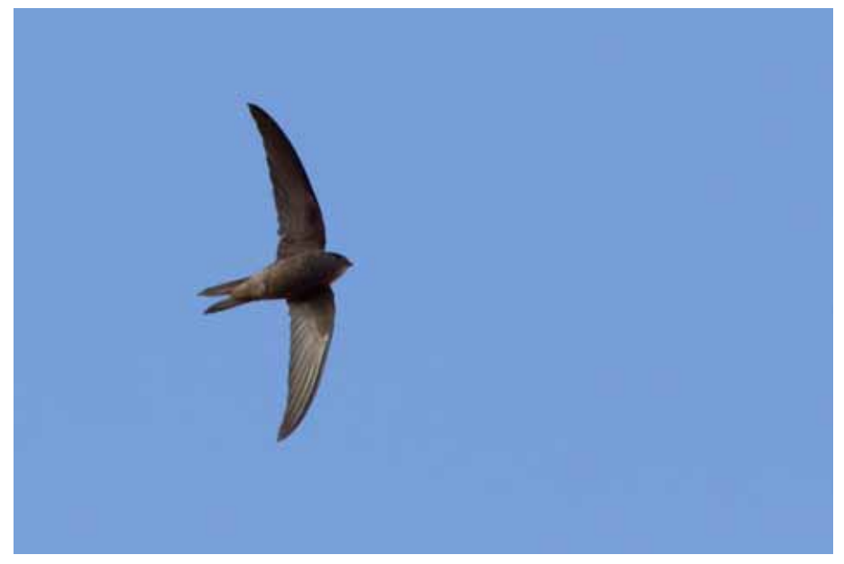
Plain Swift, Rosa de Catalina Garcia reservoir 22-2.

Seen rather well and photo-documented. No other swifts seen. A common breeder, although numbers in winter are much reduced and can be extremely hard to locate Oct-Jan (Clarke 2006).