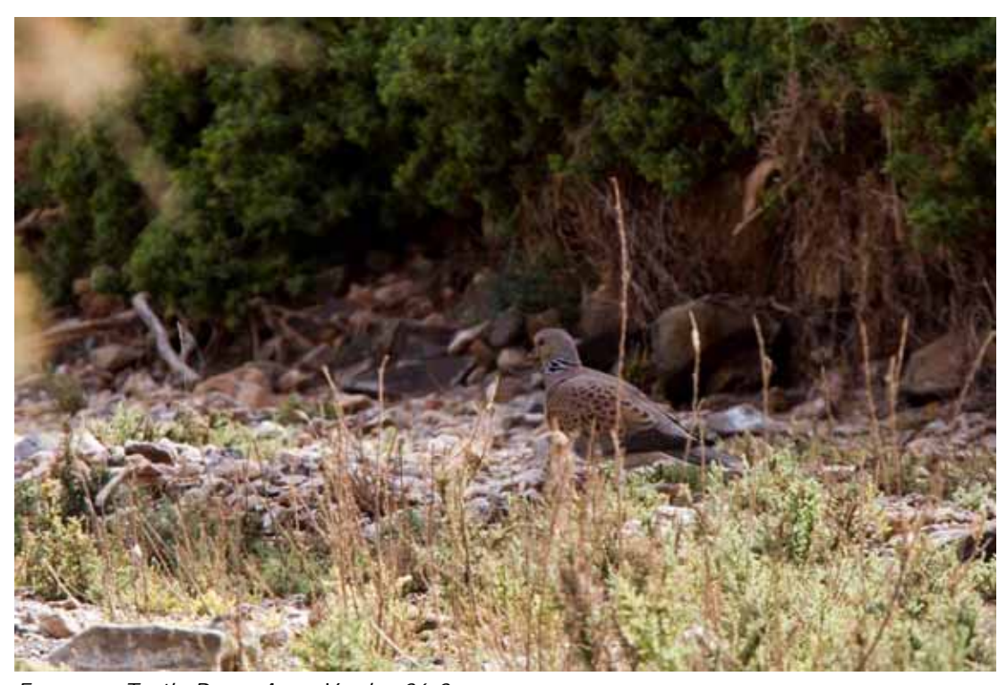
European Turtle Dove, Agua Verdes 26-2.