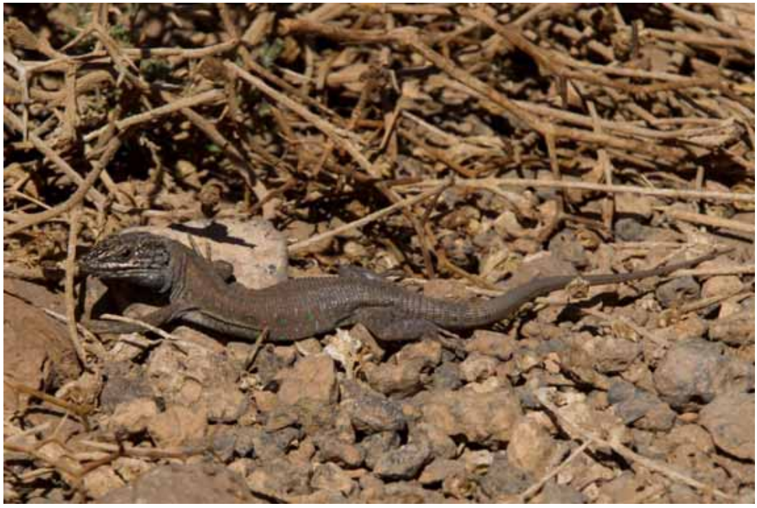
Atlantic Lizzard, Barranco de Rio Cabras 24-2.

Atlantic Lizard (Gallotia atlantica) (1 rec., 1 ind.) Barranco de Rio Cabras A few more glimpses of lizards may have been of this species.