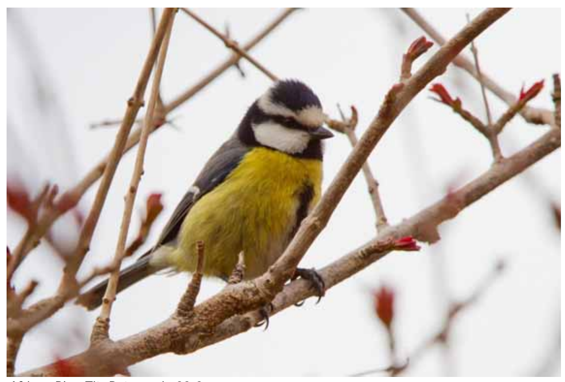
African Blue Tit, Betancuria 22-2.

The bird at Barranco de Rio Cabras must have been quite outside the normal distribution range. Rather rare and locally distributed in Fuerteventura and Lanzarote (Clarke 2006).