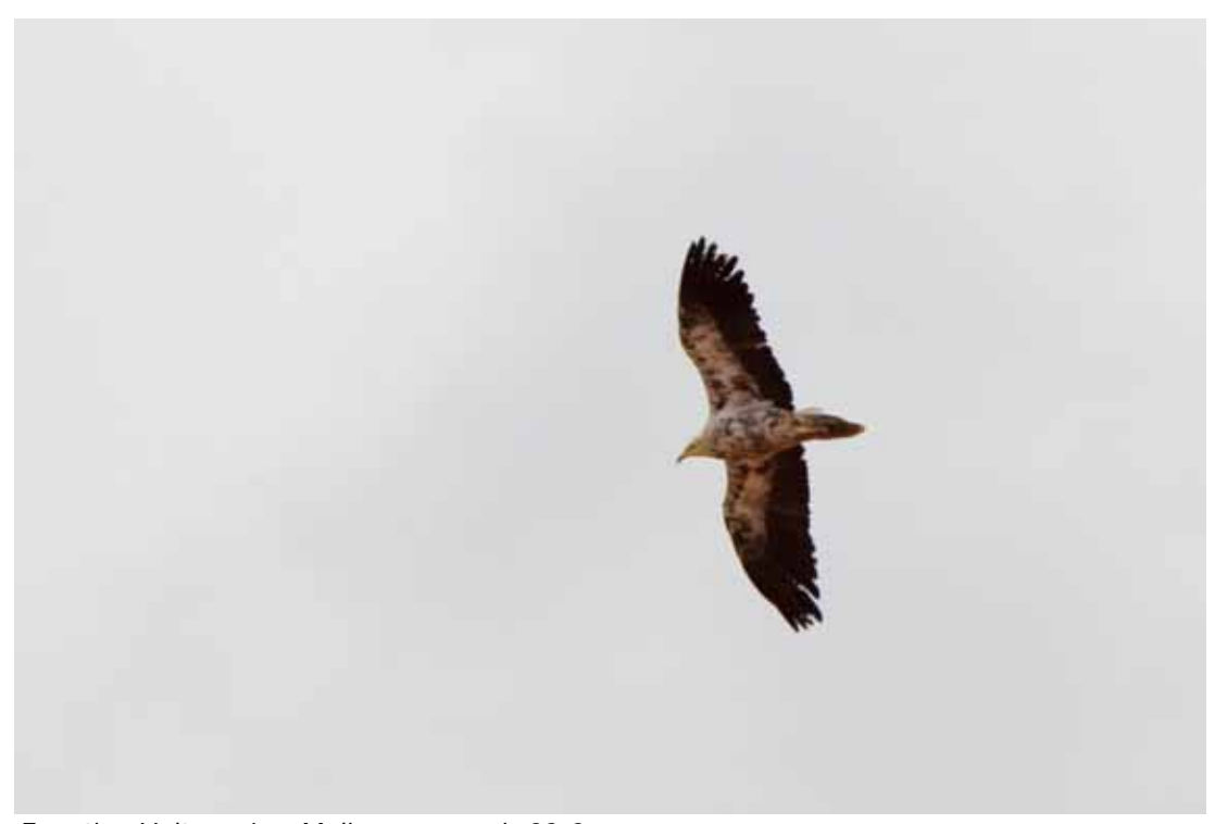
Egyptian Vulture, Los Molinos reservoir 23-2.

Fairly common, perhaps partly due to the feeding program. Fuerteventura is the last stronghold in the Canaries, but even there it is said to be declining. The birds may belong to the quite recently described ssp. majorensis (Clarke 2006).