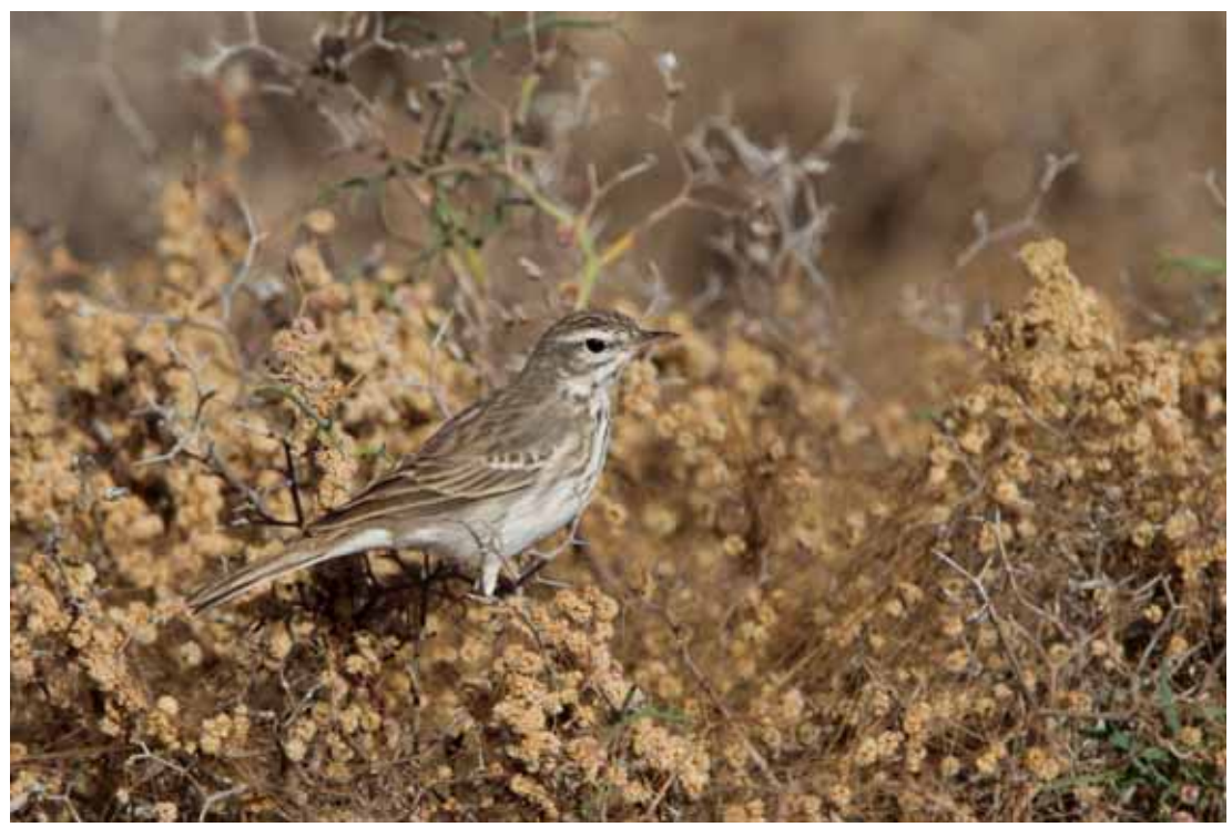
Berthelot's Pipit, Rosa de Catalina Garcia reservoir 22-2.

72. Berthelot's Pipit (Anthus berthelotii berthelotii) (20 rec., 155 ind.) 2 Airport-Caleta de Fuste 20-2, 10 Salinas del Carmen 21-2, 20 Barranco de la Torre 21-2, 5 Costa Calma-La Pared 21-2, 40 Viewpoint Las Penitas 22-2, 5 Betancuria 22-2, 20 Los Molinos reservoir 22-2, 5 Tindaya 22-2, 10 Los Molinos reservoir 23-2, 2 La Oliva 23-2, 4 Rosa de Catalina Carmen reservoir 24-2, 7 Barranco de Rio Cabras 24-2, 1 Tiscamanite vulture feeding 24-2, 6 Rosa del Taro dam 25-2, 6 Corralejo S 25-2, 2 Punta de Paso Chico 26-2, 2 Tindaya 26-2, 4 Tindaya 26-2, 1 El Cotillo 26-2, 3 Caleta de Fuste 27-2 Perhaps the most common bird. Seen everywhere. Ssp. Berthelotii in the Canaries, ssp. madeirensis on Madeira, having a little longer bill and middle toe (Clarke 2006).