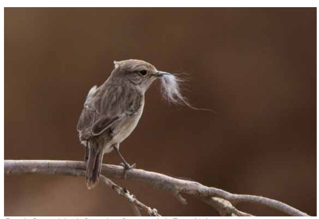
Female Canary Islands Stonechat, Barranco de la Torre 21-2.

70. Common Stonechat (Saxicola torquatus) (1 rec., 1 ind.) 1 female in the field S hotel Geranios Suites and Spa Caleta de Fuste 27-2 Scarce and irregular winter visitor, more common on eastern islands (Clarke 2006).