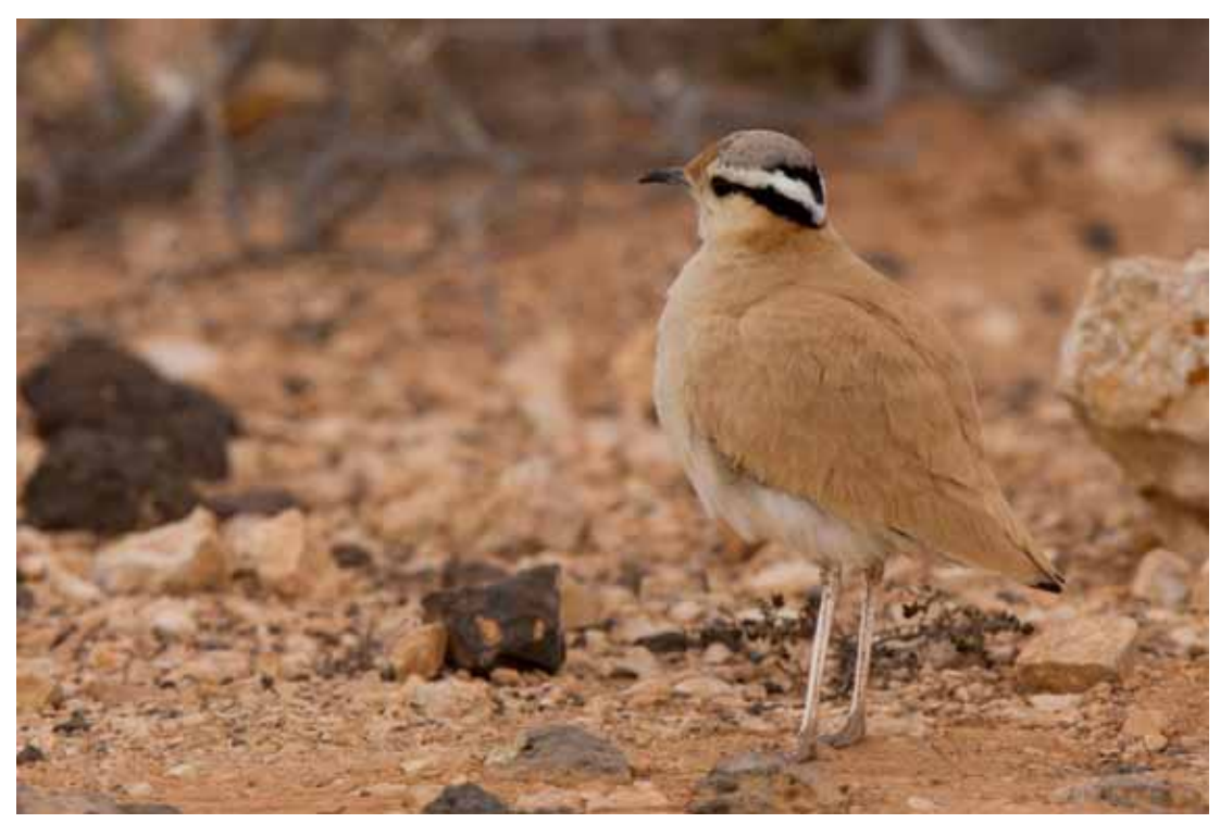
Cream-coloured Cursor, Tindaya 25-2.