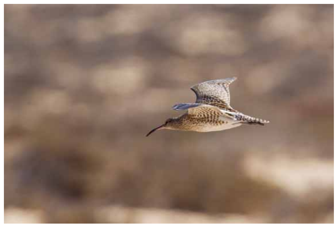
Whimbrel, Corralejo 25-2.