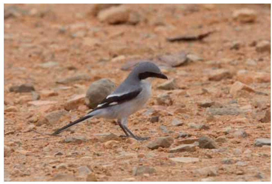
Southern Grey Shrike, Vega de Rio Palmas 22-2.

57. Southern Grey Shrike (Lanius meridionalis koenigi) (9 rec., 9 ind.) 1 Barranco de la Torre 21-2, 1 Costa Calma-La Pared 21-2, 1 Las Penitas 22-2, 1 Warning Costa Calma-La Pared 24-2, 1 Rosa de Catalina Carmen reservoir 24-2, 1 Barranco de Rio Cabras 24-2, 1 Molino de Antigua 24-2, 1 Corralejo S 25-2, 1 Tindaya 26-2 Also a few more noticed from the car during transportation. Noticeably more numerous on Fuerteventura and Lanzarote compared to western islands (Clarke 2006).