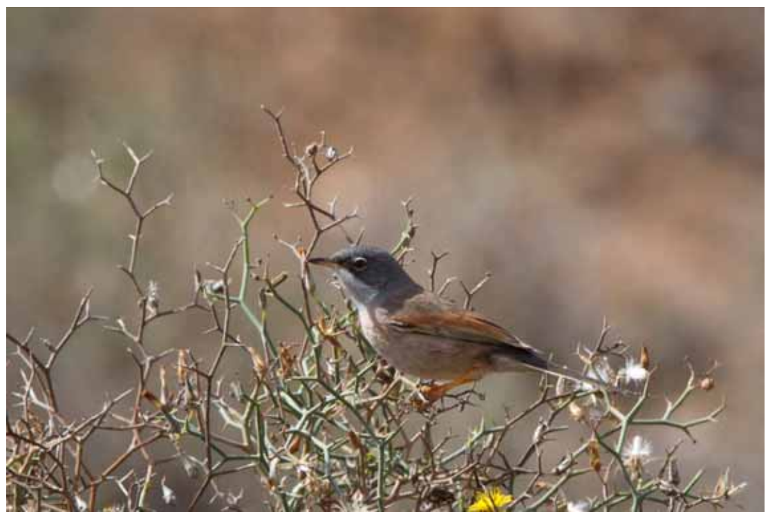
Spectacled Warbler, Barranco de la Torre 21-2.