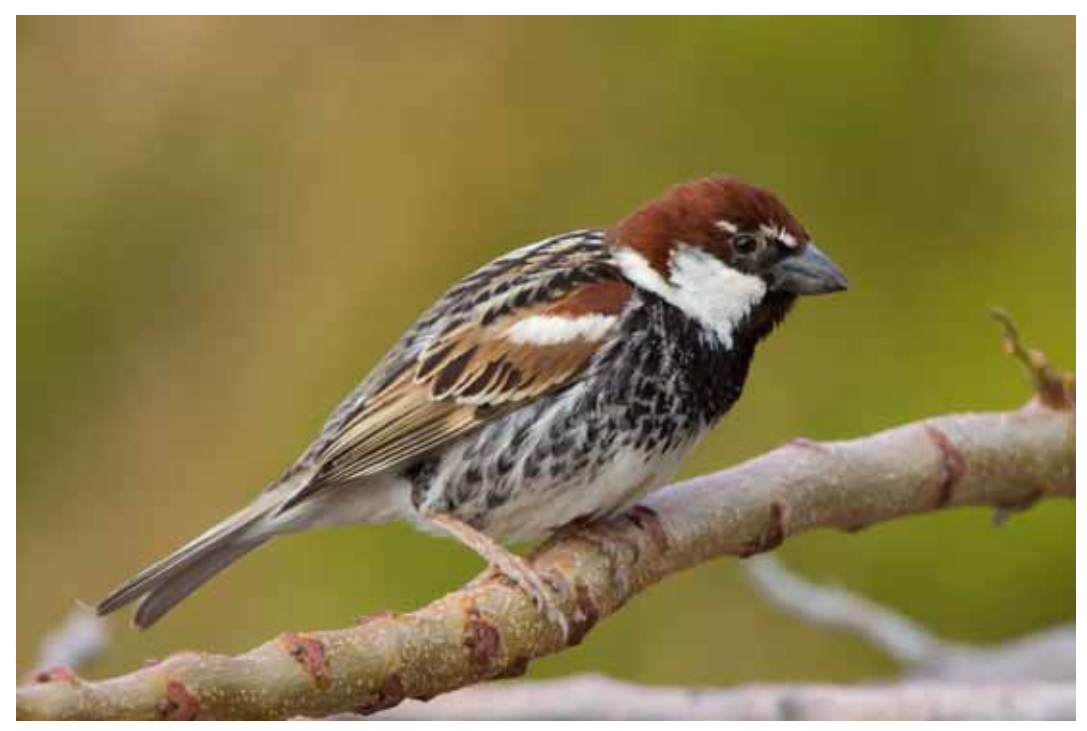
Male Spanish Sparrow, Caleta de Fuste 22-2.

79. Spanish Sparrow ( Passer hispaniolensis ) (13 rec., 140 ind.) 5 Caleta de Fuste 20-2, 4 Caleta de Fuste 21-2, 20 seem to breed in the northern slopes, Barranco de la Torre 21-2, 1 male at small sewage plant Barranco de Vinamar 21-2, 15 Caleta de Fuste 22-2, 10 Viewpoint Las Penitas 22-2, 15 Barranco de Rio Cabras 24-2, 20 Restaurante Cafe Casabel 24-2, 10 Rosa del Taro dam 25-2, 10 Corralejo S 25-2, 10 Singing Aqua Verdes 26-2, 10 Tindaya 26-2, 10 Caleta de Fuste 27-2 According to Clarke and Collins (1996) the species is abundant. Seem to fit quite well.