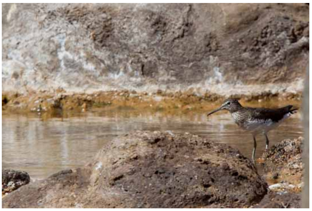
Green Sandpiper, Barranco de Rio Cabras 25-2.