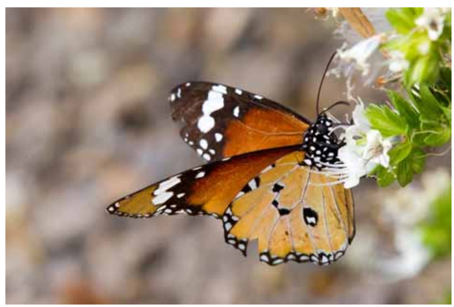
African Monarch, Betancuria 22-2.