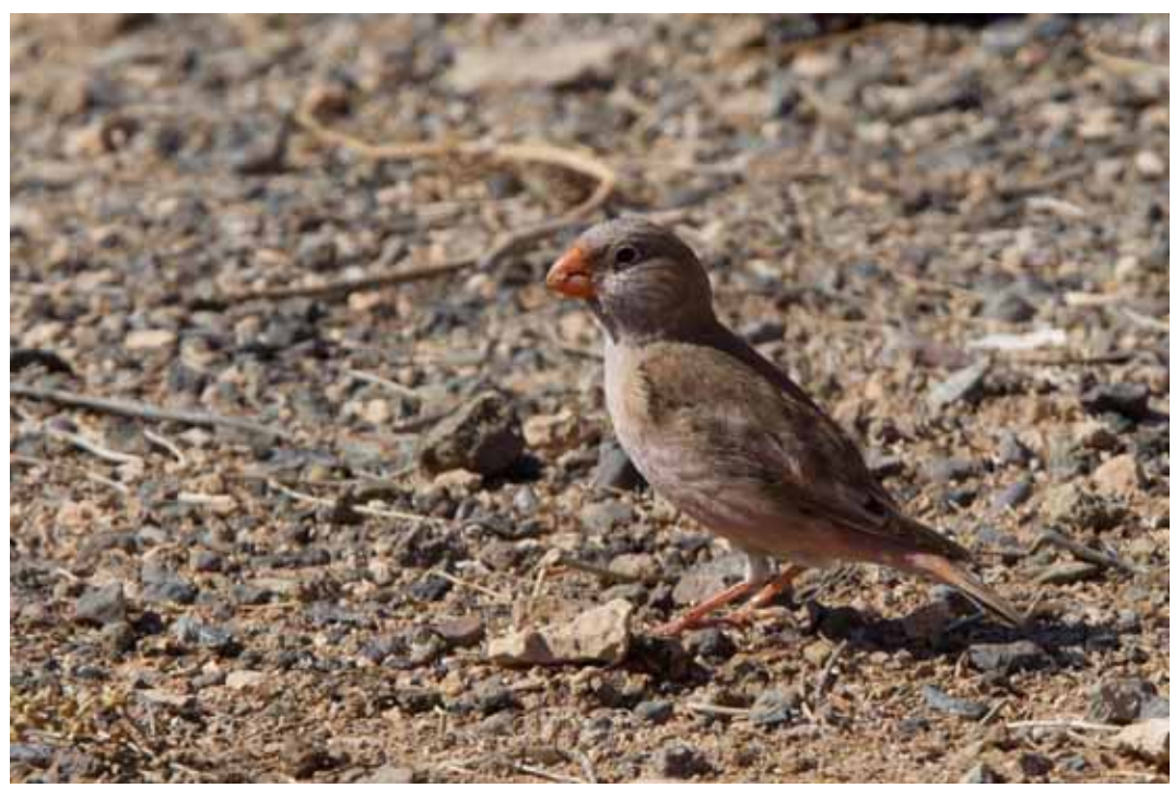
Male Trumpeter Finch, Salinas del Carmen 21-2.

79. Spanish Sparrow ( Passer hispaniolensis ) (13 rec., 140 ind.) 5 Caleta de Fuste 20-2, 4 Caleta de Fuste 21-2, 20 seem to breed in the northern slopes, Barranco de la Torre 21-2, 1 male at small sewage plant Barranco de Vinamar 21-2, 15 Caleta de Fuste 22-2, 10 Viewpoint Las Penitas 22-2, 15 Barranco de Rio Cabras 24-2, 20 Restaurante Cafe Casabel 24-2, 10 Rosa del Taro dam 25-2, 10 Corralejo S 25-2, 10 Singing Aqua Verdes 26-2, 10 Tindaya 26-2, 10 Caleta de Fuste 27-2 According to Clarke and Collins (1996) the species is abundant. Seem to fit quite well.