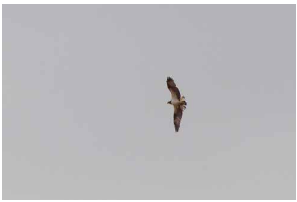
Osprey, Los Molinos reservoir 23-2.

Nearly extinct as a breeder, just 15-20 pairs in the Canaries. Not mentioned to breed on Fuerteventura (Clarke 2006).