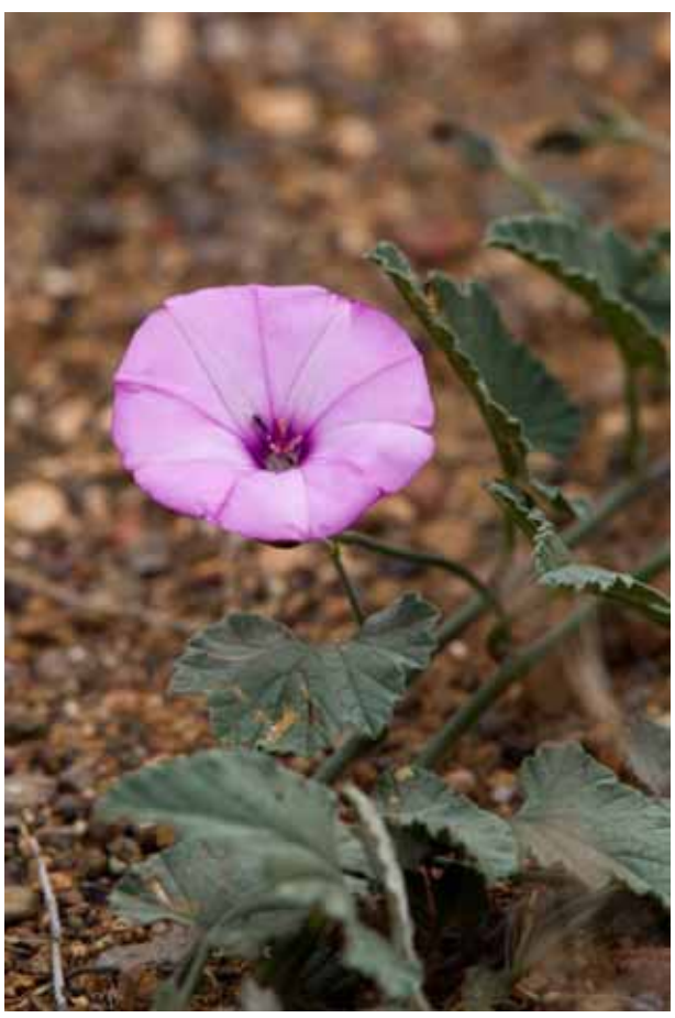
Mallow Bindweed, Betancuria 22-2.