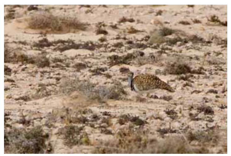
Houbara Bustard, Costa Calma-La Pared 21-2.

21. Hourbara Bustard (Chlamydotis undulata fuertaventurae) (1 rec., 3 ind.) 3 In wadi (28.190849, -14.239372) moving W foraging Costa Calma-La Pared 21-2 Just one observation despite several attempts on good localities. Maybe a result of the draught or just that we avoided early mornings. Surveys estimated c. 240 birds on Fuerteventura where the population should be fairly stable (Clarke 2006).