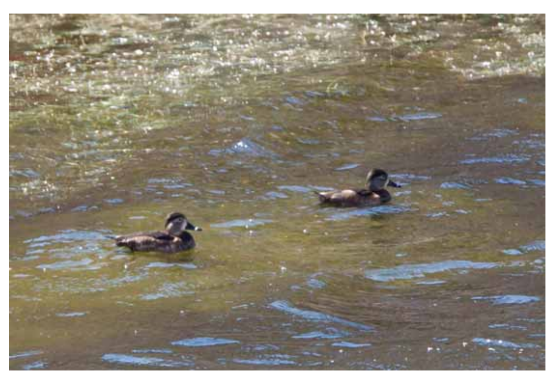
Ring-necked Ducks, Los Molinos reservoir 23-2.

5. Ring-necked Duck (Aythya collaris) (2 rec., 2 ind.) 2 female-like Los Molinos reservoir 22-2, 2 female-like Los Molinos reservoir 23-2 These two females, we got info from a German couple, have been present for a while. More than 30 records to 2004 in the Canaries, all since 1980 (Clarke 2006).