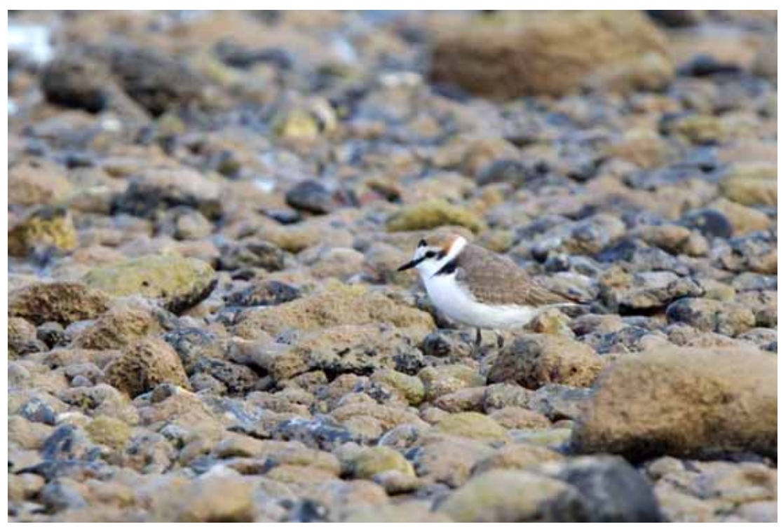
Kentish Plover, Caleta de Fuste 22-2.