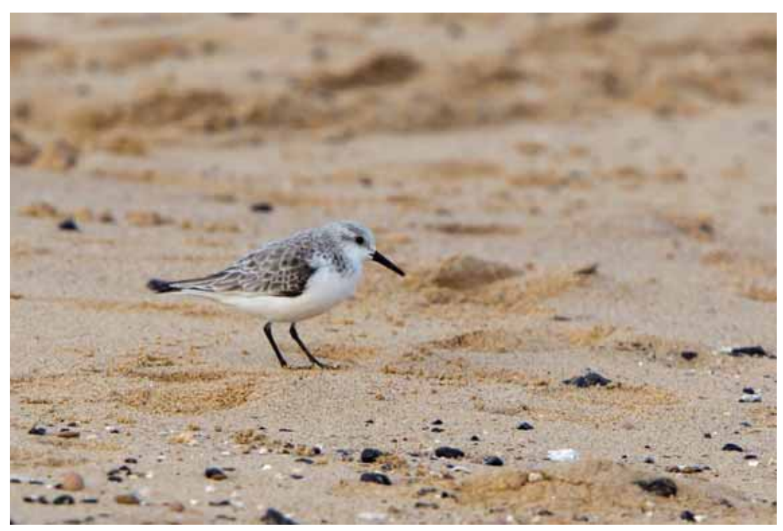
Sanderling, Caleta de Fuste 22-2.