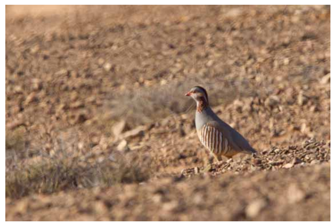
Barbary Partridge, Rosa de Catalina Garcia reservoir 24-2.