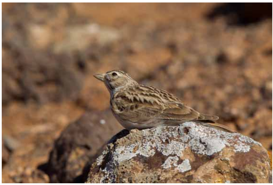
Lesser Short-toed Lark, Rosa del Taro dam 25-2.