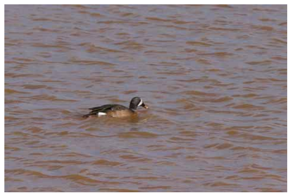
Blue-winged Teal, Rosa de Catalina Garcia reservoir 22-2.

5. Ring-necked Duck (Aythya collaris) (2 rec., 2 ind.) 2 female-like Los Molinos reservoir 22-2, 2 female-like Los Molinos reservoir 23-2 These two females, we got info from a German couple, have been present for a while. More than 30 records to 2004 in the Canaries, all since 1980 (Clarke 2006).