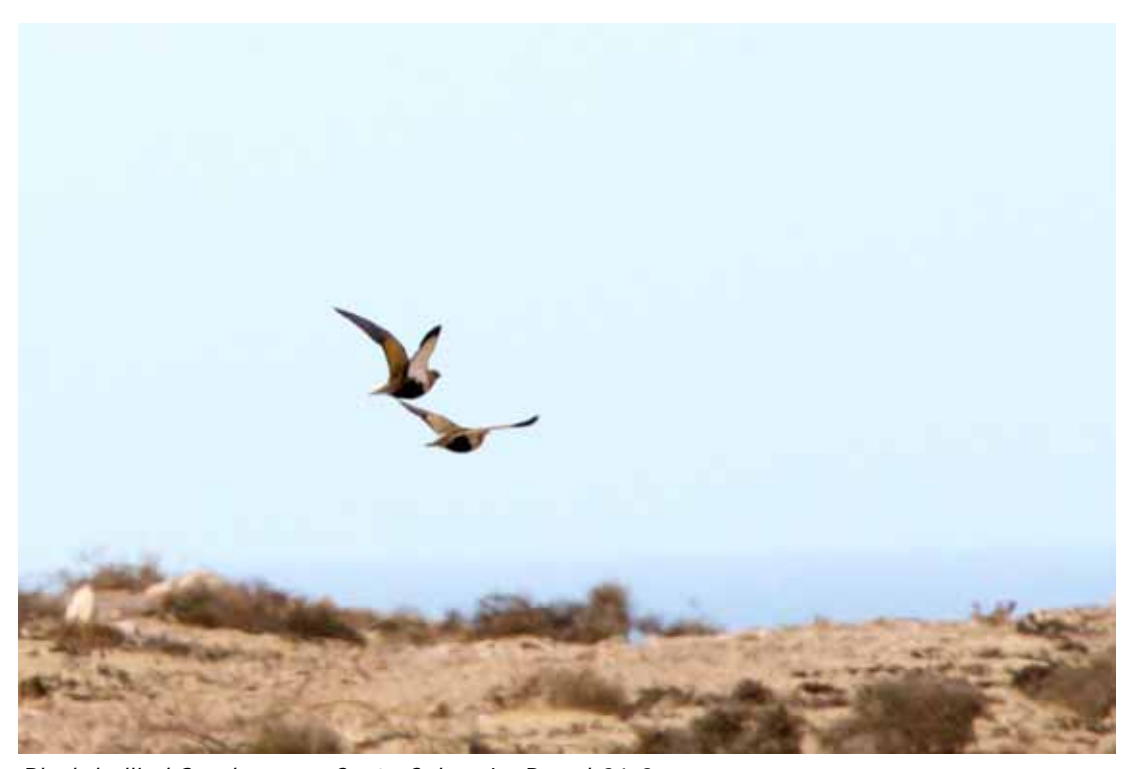
Black-bellied Sandgrouse, Costa Calma-La Pared 21-2.