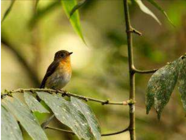
Rufous-chested Flycatcher, Ficedula dumetoria One at Gunung Gede.