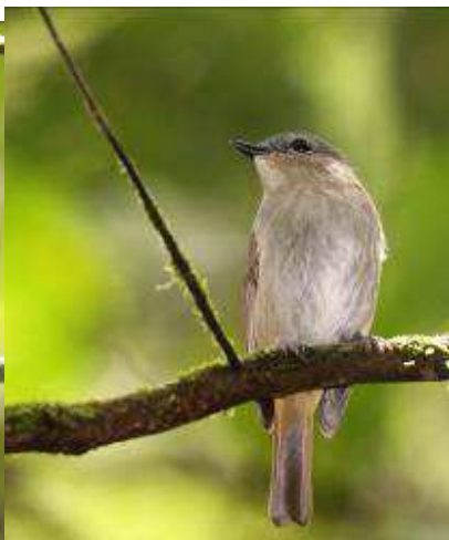
Gray-headed Canary-flycatcher, Culicicapa ceylonensis Several at Gunung Gede and many at Gunung Halimun.