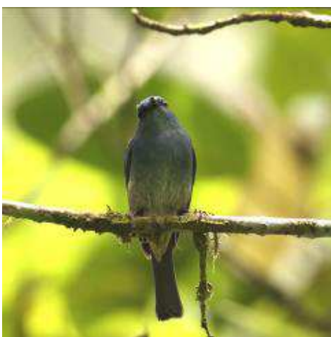
Pale Blue-Flycatcher, Cyornis unicolor A few at Gunung Halimun.