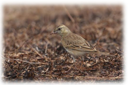
Tawny Pipit (Anthus campestris) - Goa, Jan. 2011

207. Tawny Pipit Anthus campestris Two birds at Chambal Safari Lodge and single observations in Corbett and Goa.