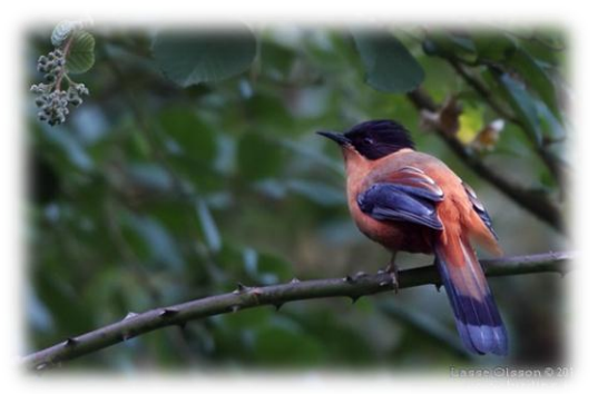
Rufous Sibia (Heterophasia capistrata) – Woodpecker point, Dec. 2011