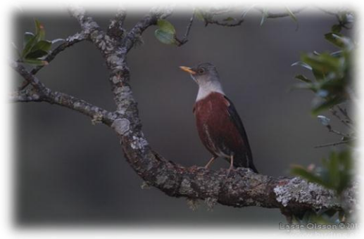
Chestnut Thrush (Turdus rubrocanus) – Woodpecker point, Dec. 2011