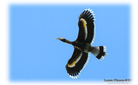
Great Hornbill (Buceros bicornis) - Corbettt National Park, Dec. 2011