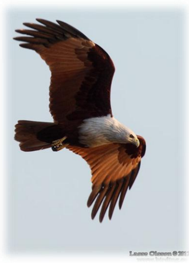
Brahminy Kite (Haliastur indus) – Goa, Jan. 2012

29. Black-shouldered Kite Elanus caeruleus Single birds seen at several places throughout.