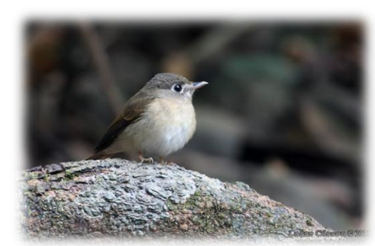
Brown-breasted Flycatcher (Muscicapa muttui) – Tambdi Surla, Dec. 2011