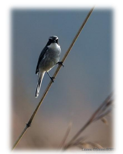
Male Grey Bushchat (Saxicola ferreus) – Corbettt N.P., Dec. 2011