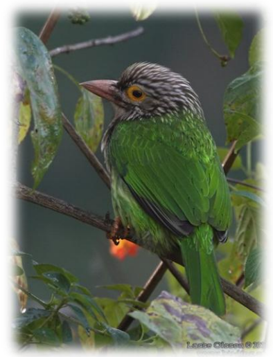
Lineated Barbet (Megalaima lineata) – Corbett National Park, Dec. 2011