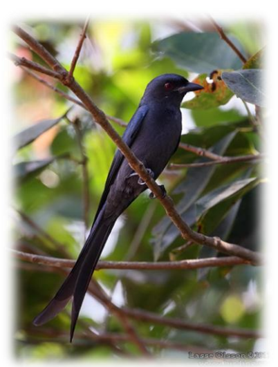
Ashy Drongo (Dicrurus leucophaeus) – Backwoods, Dec. 2011

374. Ashy Drongo Dicrurus leucophaeus Small numbers noted most days in Goa.