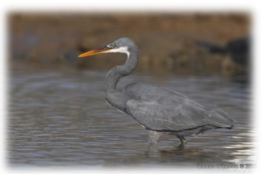
Western Reef Egret (Egretta gularis) – Goa, Jan. 2012