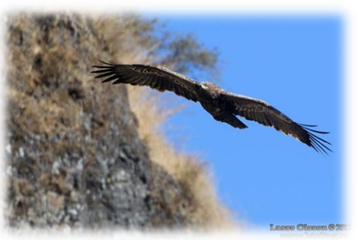
Steppe Eagle (Aquila nipalensis) – Naini Tal, Dec. 2011

52. Changeable Hawk Eagle Spizaetus cirrhatus All together four birds – all pale morphs – were seen in Corbett N.P.