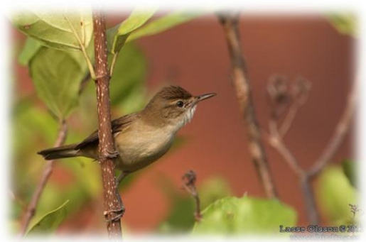
Blyth's Reed Warbler (Acrocephalus dumetorum) - Goa, Jan. 2012