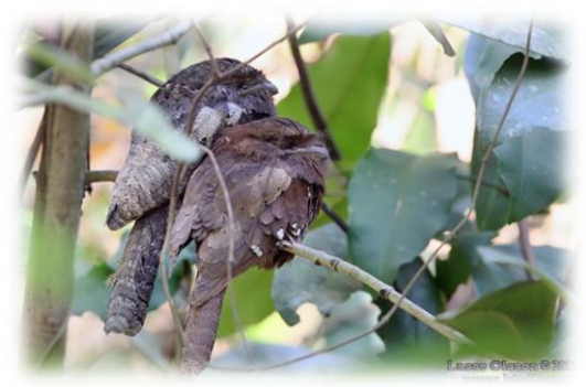
Sri Lanka Frogmouth (Batrachostomus moniliger) Backwoods Camp, Dec. 2011

137. Brown Wood Owl Strix leptogrammica One seen at the regular site Saligao Zor, Goa.