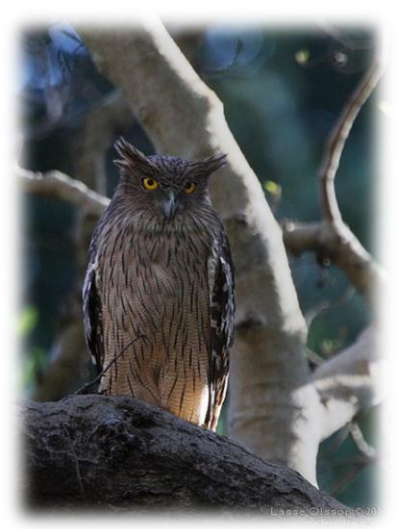
Brown Fish Owl (Ketupa zeylonensis) – Corbettt National Park, Dec. 2011

133. Brown Fish Owl Ketupa zeylonensis One bird in Corbett N.P. and one at Backwoods, Goa.