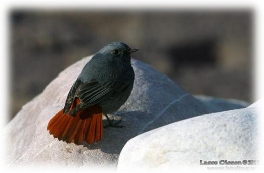
Male Plumbeous Redstart ( Ryacornis fuliginosa ) -Kosi Barrage, Ramnagar, Dec. 2011