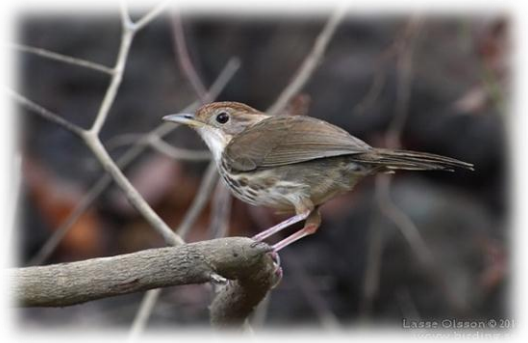
Puff-throated Babbler (Pellorneum ruficeps) – Goa, Jan. 2012