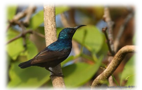
Purple Sunbird (Cinnyris asiaticus) – Goa, Dec. 2011