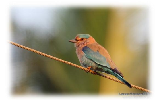
Indian Roller (Coracias benghalensis) – Goa, Jan. 2012

At least fifty birds together flying high near Backwoods, Goa.