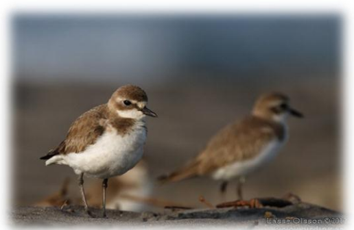
Lesser Sand Plover (Charadrius mongolus) – Morjim Beach, Jan. 2012