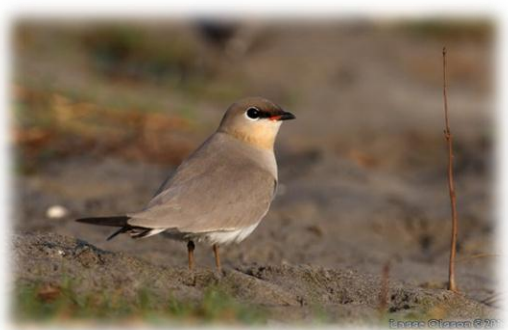
Small Pratincole (Glareola lacteal) – Morjim beach, Jan. 2012

An unsuspected surprise when one single bird flew over the road in front of our car between Katni and Bandhavgarh.