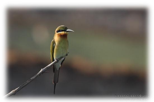
Blue-tailed Bee-eater (Merops philippinus) – Goa, Jan. 2012

159. Indian Roller Coracias benghalensis Single birds seen at Chambal River and Bandhavgarh. Common and widespread in Goa.