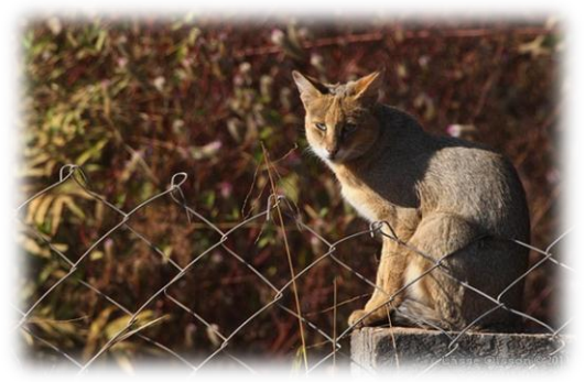
Jungle Cat (Felis chaus) - Bandhavgarh, Dec. 2011