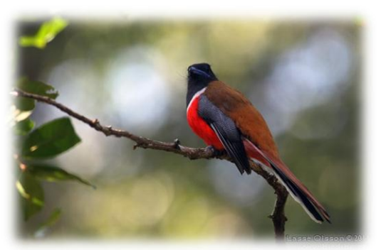
A gorgeous male Malabar Trogon (Harpactes fasciatus) -Backwoods Camp, Dec. 2011