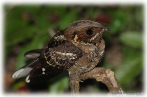
Jerdon's Nightjar (Caprimulgus atripennis) – Backwoods Camp, Dec. 2011