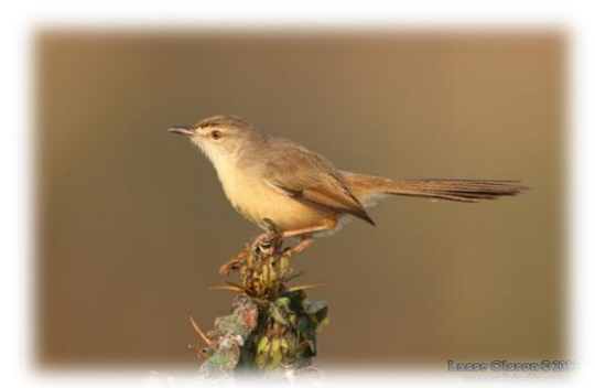
Plain Prinia (Prinia inornata) - Goa, Jan. 2012