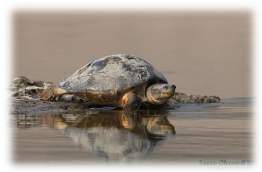
Soft-shell Turtle (Trionyx gangeticus) – Chambal River, Dec. 2011