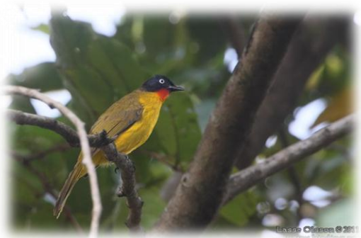
Flame-throated Bulbul (Pycnonotus gularis) – Backwoods, Dec. 2011

More easily heard than seen. Distant views of three birds in the Backwoods area. It is a South Indian endemic