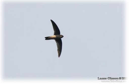
Himalayan Swiftlet (Aerodramus brevirostris) – Corbettt N.P, Dec. 2011

Seen in several places in the north, with 10+ birds at Kosi River and several birds around Pangot.