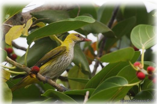
Young Indian Golden Oriole (Oriolus kundoo) – Goa, Jan. 2012

369. Indian Golden Oriole Oriolus kundoo Seen daily in Goa, with a maximum of twenty behind Hacienda de Goa. Until recently and by some still regarded as a subspecies of Eurasian Golden Oriole Oriolus oriolus .