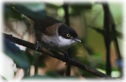
Dark-fronted Babbler (Rhopocichla atriceps) – Backwoods, Dec 2011