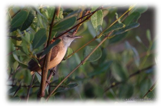
Indian Reed Warbler (Acrocephalus brunnescens) – Goa, Jan. 2012