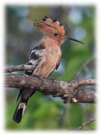
Common Hoopoe (Upopa epops) – Goa, Jan. 2012

159. Indian Roller Coracias benghalensis Single birds seen at Chambal River and Bandhavgarh. Common and widespread in Goa.