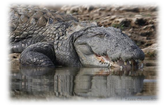
Mugger (Crocodylus palustris) - Chambal River, Dec. 2011