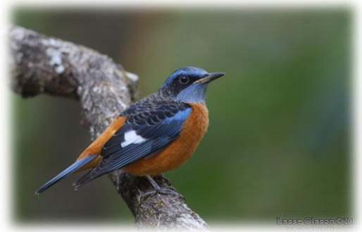
Male Blue-capped Rock Thrush (Monticola cinclorhynchus) – Tambdi Surla, Dec. 2011