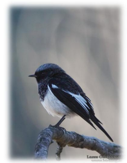
Blue-capped Redstart (Phoenicurus coeruleocephalus) – Woodpecker point, Dec. 2011