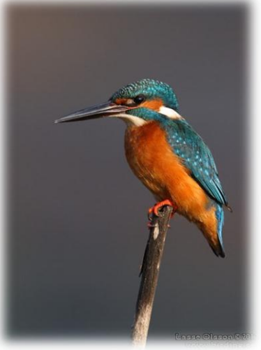
Another gem Common Kingfisher (Alcedo atthis) – Goa, Jan. 2012