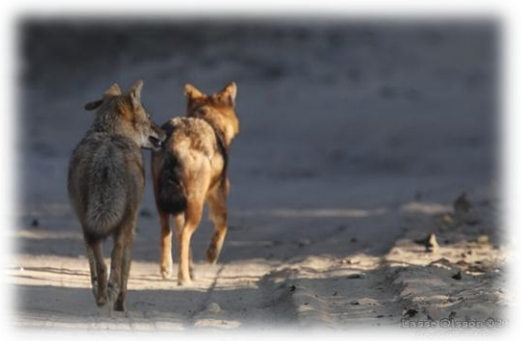
Golden Jackal (Canis aureus) – Corbett N.P, Dec. 2011

6. Indian Grey Mongoose Herpestes edwardsii Only one seen at Chambal River.