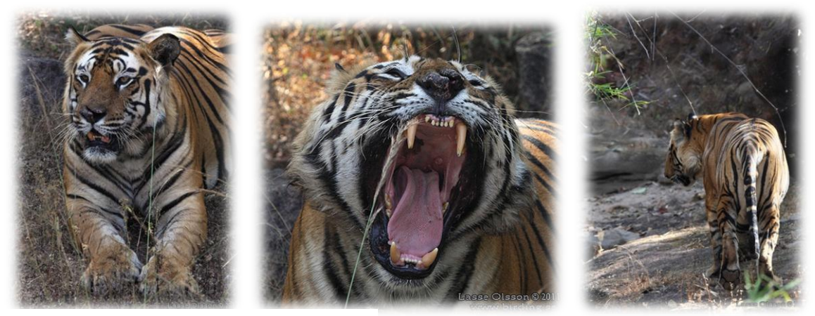
Male Tiger (Panthera tigris) - Bandhavgarh, Dec. 2011

5. Tiger Panthera tigris One of the dominant males gave superb roadside views in Bandhavgarh and a female was seen shortly when sharpening her claws at a tree in the early morning.