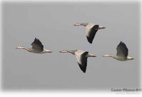
Bar-headed Goose (Anser indicus) – Chambal River, Dec 2011.