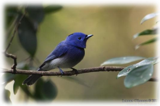
Black-naped Monarch (Hypothymis azurea) - Backwoods, Dec. 2011

Recorded in small numbers up north, with at least five birds in Corbett.