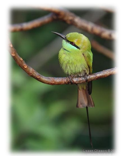
Green Bee-eater (Merops orientalis) – Goa, Jan. 2012