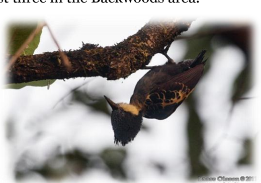
Heart-spotted Woodpecker (Hemicircus canente) - Backwoods, Dec. 2011