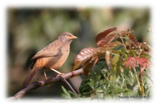
Jungle Babbler (Turdoides striatus) - Backwoods, Dec. 2011