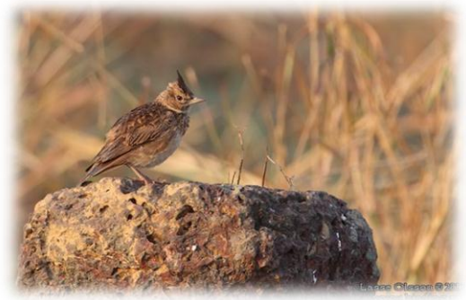
Malabar Lark (Galerida malabarica) – Goa, Jan. 2012

Two birds in Chambal and a flock of at least twenty in the fields opposite Hacienda de Goa.