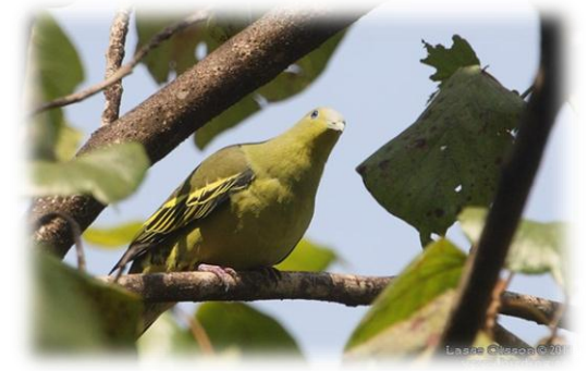
Grey-fronted Green Pigeon (Treron affinis) - Goa, Dec. 2011

116. Mountain Imperial Pigeon Ducula badia At least ten birds seen from the temple area, Tambdi Surla.