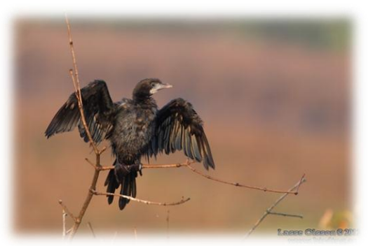
Little Cormorant (Phalacrocorax niger) – Marinha Dourada saltpans, Jan. 2012