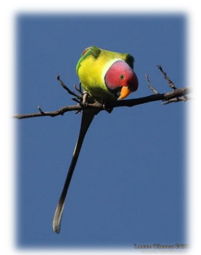
Male Plum-headed Parrot ( Psittacula cyanocephala ) – Goa, Dec. 2011