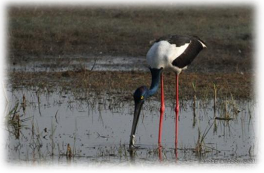
Black-necked Stork (Epihippiorhynchus asiaticus) – Delhi - Agra, Dec. 2011

Only one seen, in a flooded area between Delhi and Agra.