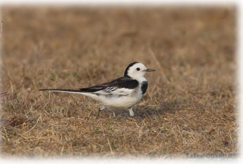
Black-backed Wagtail (Motacilla lugens leucopsis) · Bandhavgarh N.P, Dec. 2012