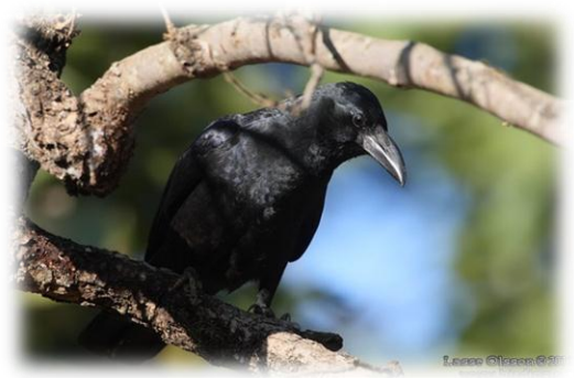
Indian Jungle Crow (Corvus culminates) - Bandhavgarh, Dec. 2011

382. Rufous Treepie Dendrocitta vagabunda Fairly common and widespread throughout.