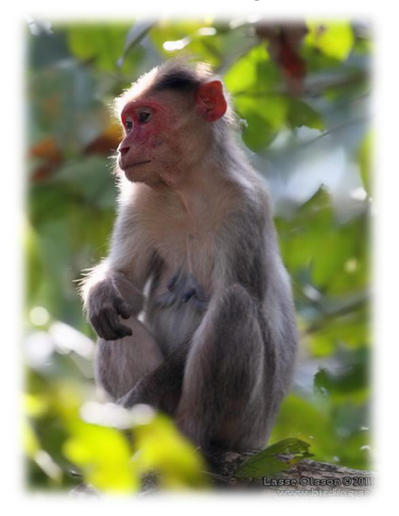
Bonnet Macaque (Macaca radiate) - Backwoods, Dec. 2011

16. Terai Grey Langur Semnopithecus hector Several seen in the mountain region.