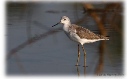
Marsh Sandpiper (Tringa stagnatilis) – Goa, Jan. 2012