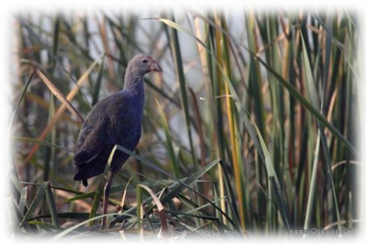
Grey-headed Swamphen (Porphyrio poliocephalus) – Delhi - Agra, Dec. 2011