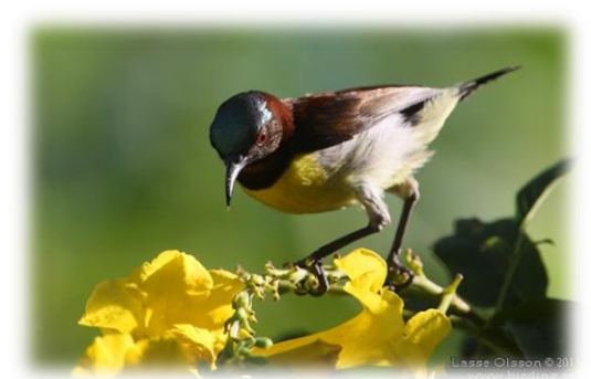
Purple-rumped Sunbird (Leptocoma zeylonica) – Goa, Dec. 2011