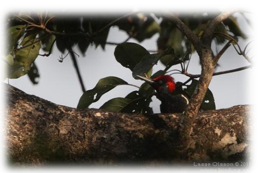
White-bellied Woodpecker (Dryocopus javensis) - Backwoods, Dec. 2011

Fairly common around Chambal and in Corbett N.P.