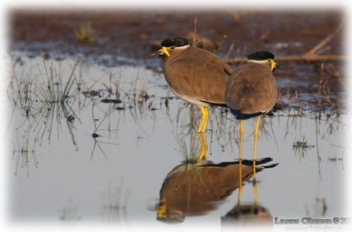
Yellow-wattled Plover (Vanellus malabaricus) - Bandhavgarh N.P, Dec. 2011