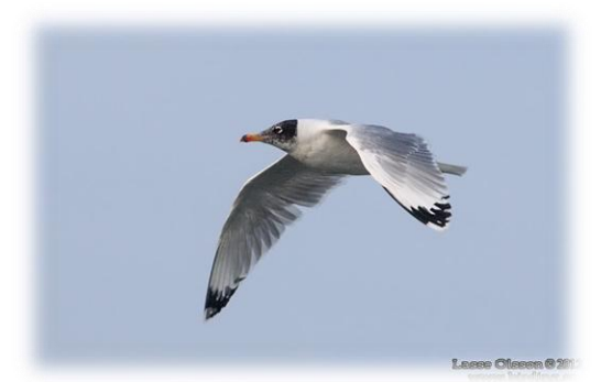
Pallas's Gull (Larus ichtyaetus) - Morjim beach, Jan. 2012

97. Heuglin's Gull Larus heuglini At least five birds at Morjim beach, Goa.