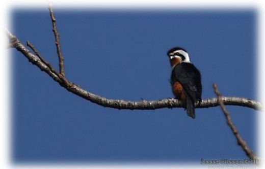
Collared Falconet (Microhierax caerulescens) – Corbettt National Park, Dec. 2011