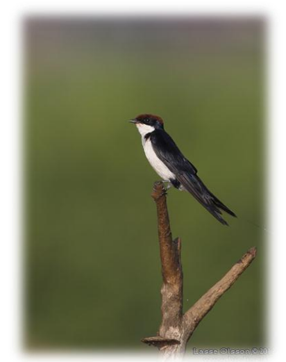
Wire-tailed Swallow (Hirundo smithii) – Goa, Jan. 2012