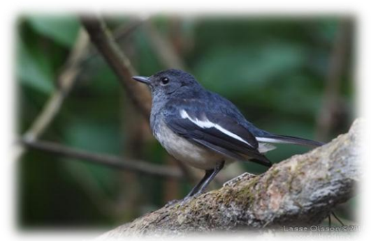
Oriental Magpie Robin (Copsychus saularis) Backwoods, Dec. 2011