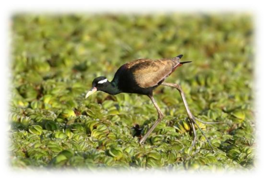
Bronze-winged Jacana (Metopidius indicus) - Goa, Jan. 2012

71. Common Moorhen Gallinula chloropus Single birds Chambal, Bandhavgarh and Corbett N.P.