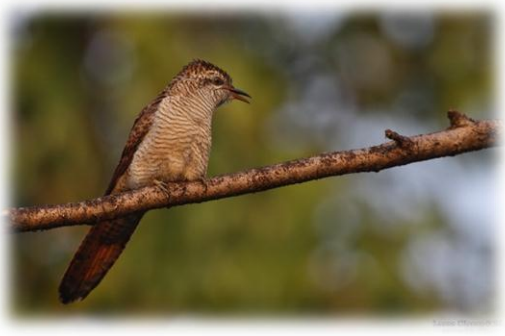
Banded Bay Cuckoo (Cacomantis sonneratii) – Tambdi Surla, Dec. 2011