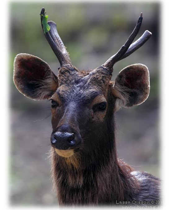
Sambar stag (Cervus unicolor) - Corbett N.P, Dec. 2011