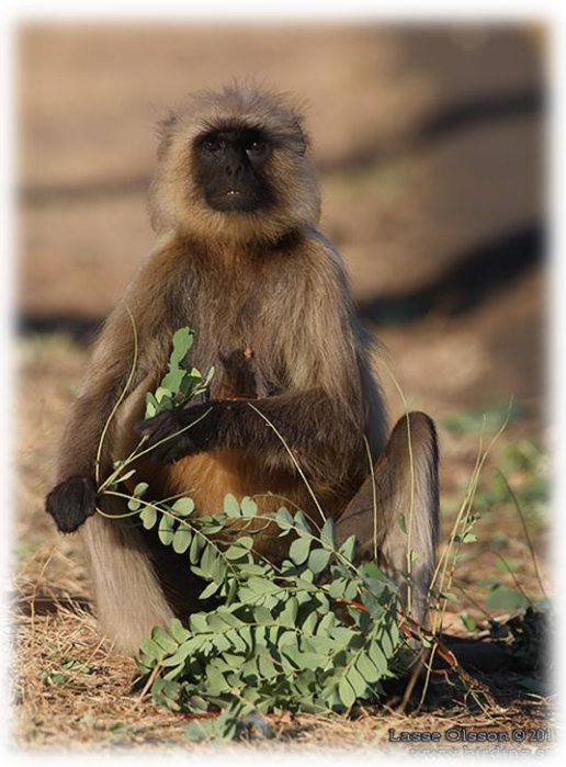
Northern Plains Grey Langur (Presbytes entellus) -Bandhavgarh, Dec. 2011