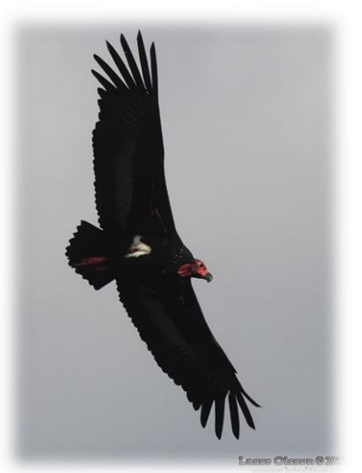
Red-headed Vulture (Sarcogyps calvus) – Corbettt National Park, Dec. 2011

43. Eurasian Sparrowhawk Accipiter nisus