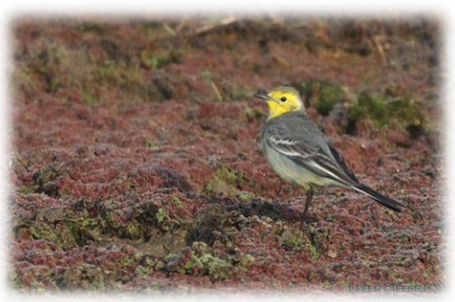
Citrine Wagtail (Motacilla citreola) – Delhi - Agra, Jan. 2011