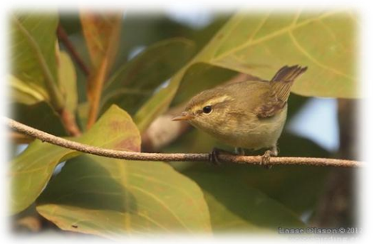
Green Warbler (Phylloscopus nitidus) - Goa, Jan. 2012