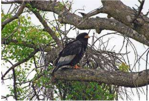
Adult male Bateleur

1 Kwa Madwala G.R 30/1, 2 Kruger Park 31/1, 1 adult male Kwa Madwala G.R 1-3/2, 1 adult male Kruger Park 3/2 and 1 adult male iMfolozi G.R 9/2.