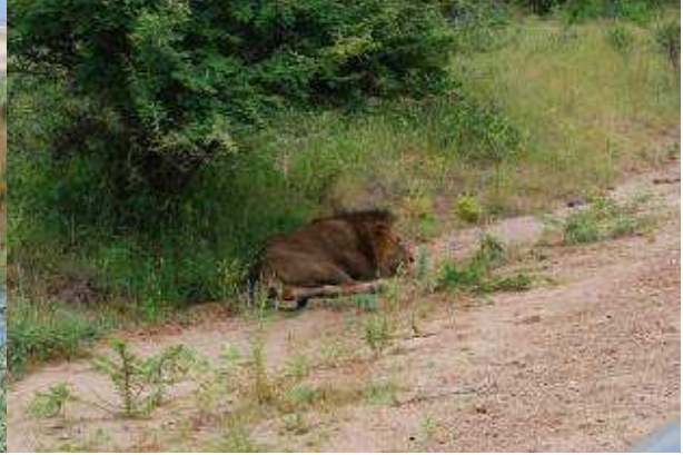
Hippos Sugarloaf camping, St Lucia Resting Lion, Kruger Park

3 Kwa Madwala G.R. 1.2 and 2 seen 3.2, 5 False Bay 6.2 and 2 Cape Vidal 7.2.