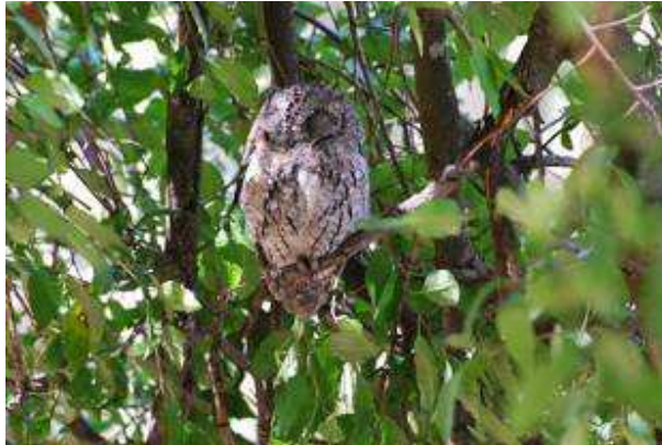
African Scops Owl

Up to 4 birds seen or heard daily in Kwa Madwala G.R. 31/1-3/2.