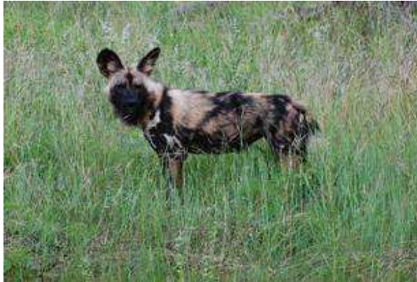
Wild dog, Kruger Park