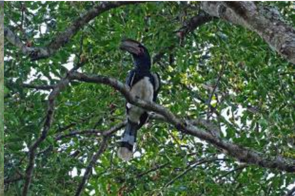
Trumpeter Hornbill, St. Lucia