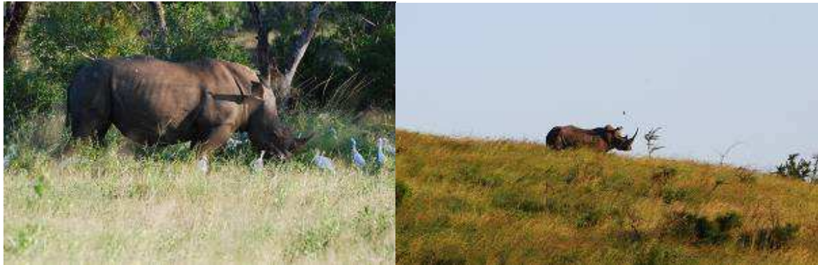
Rhinos in iMfolozi G.R.

3 Kwa Madwala G.R. 1.2 and 3.2, 5 Cape Vidal 7.2, 5 iMfolozi G.R 8.2, 6 Hluhluwe G.R 9.2 and 10 iMfolozi G.R 9.2.