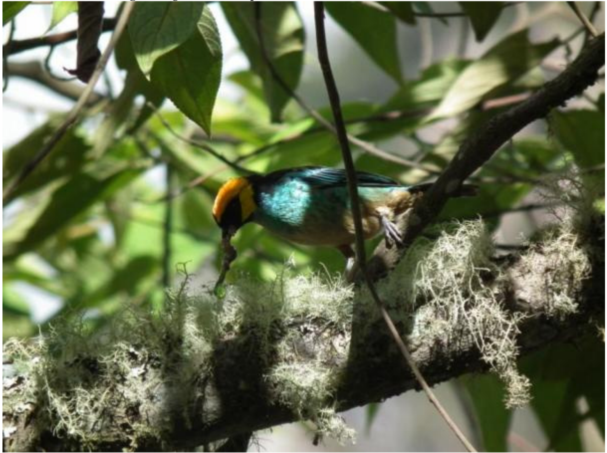
Readily seen in Aguas Calientes area. Ssp: lamprotis