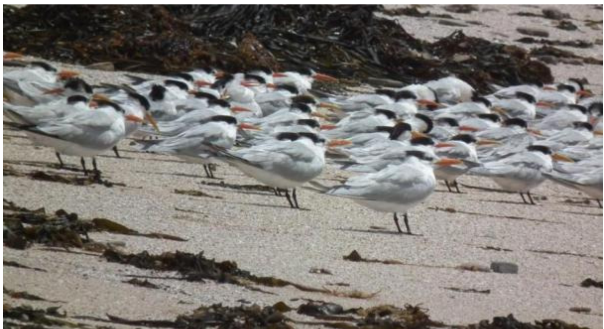
Elegant and Royal Terns at Paracas Peninsula.

Watchtower = an 18 meters high observation tower marking the border to an area of the lake being protected and therefore not visited as part of any programme; the tower is accessed via a boat ride only.