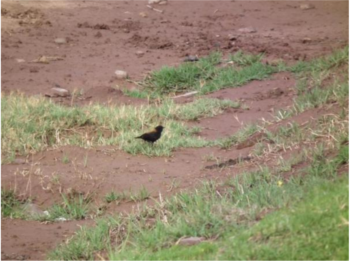
3 Huacarpay Lakes 22/12. Monotypic.