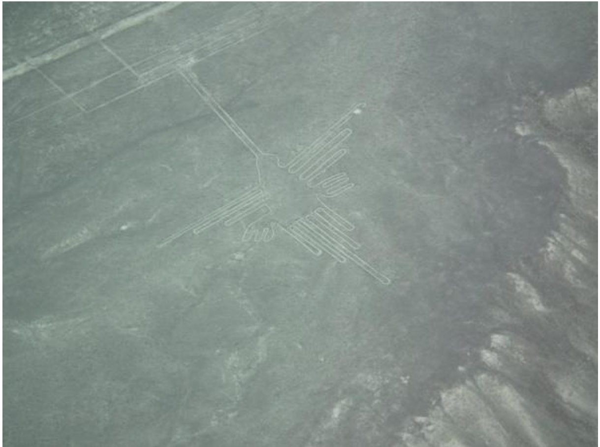
Nazca lines colibri.