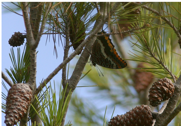
Two-tailed Pasha Charaxes jasio , Ermita de Betlen