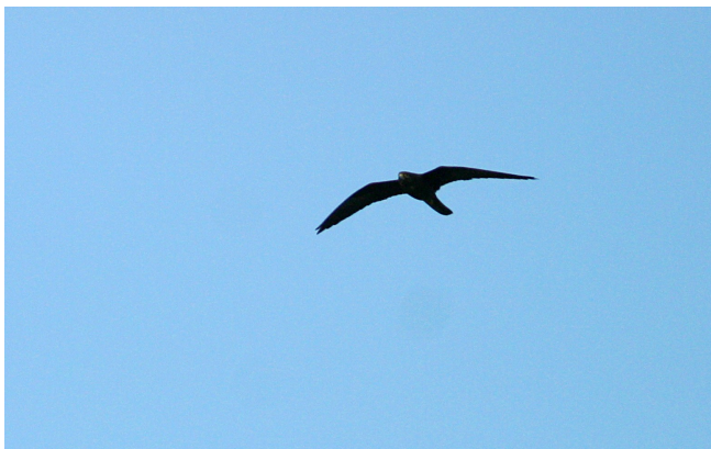
Eleonora's Falcon Falco eleonorae , black phase, Cap de Formentor