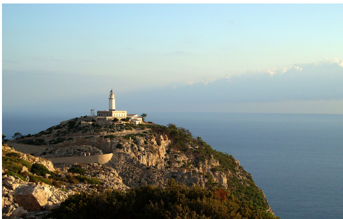
Cap de Formentor