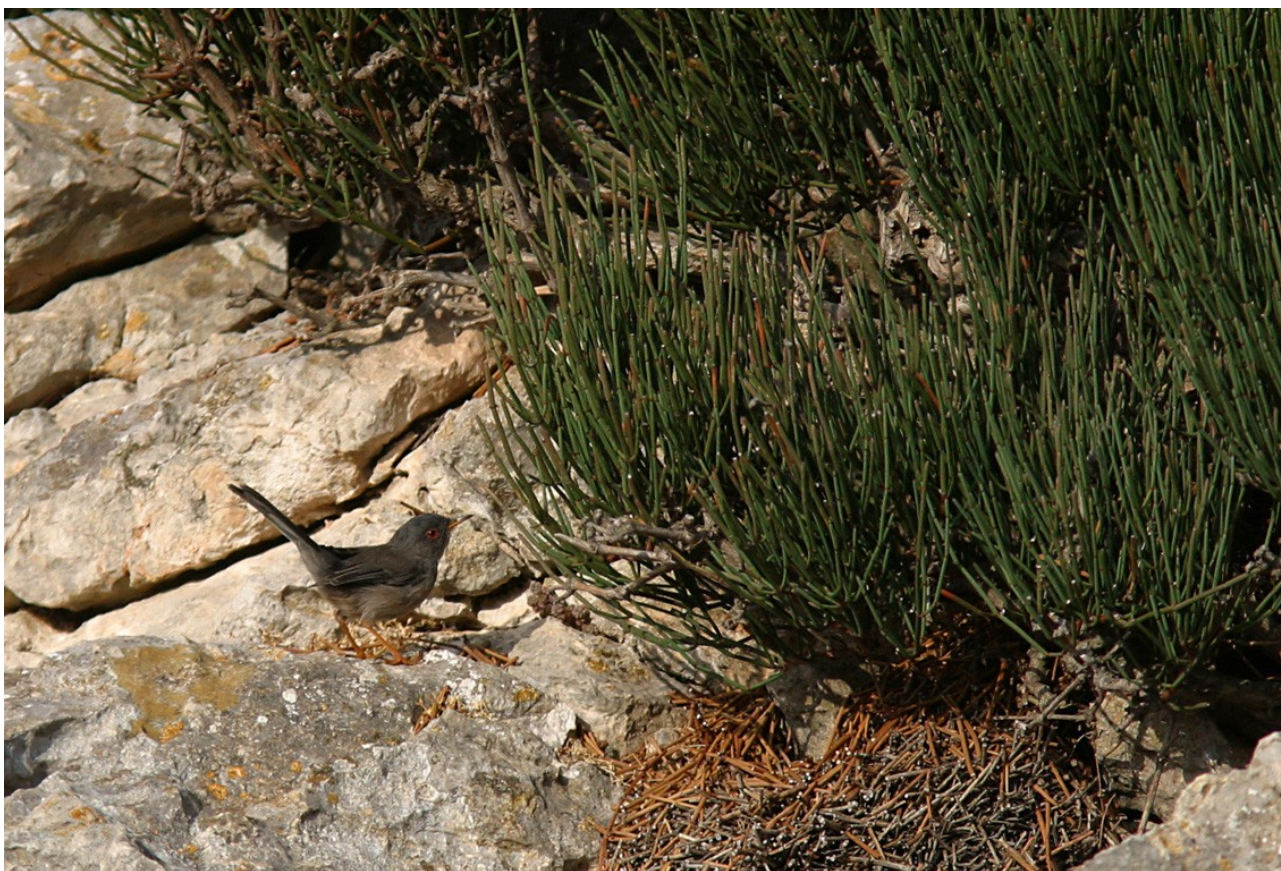
Balearic Warbler Sylvia balearica , at KM17, Cap de Formentor