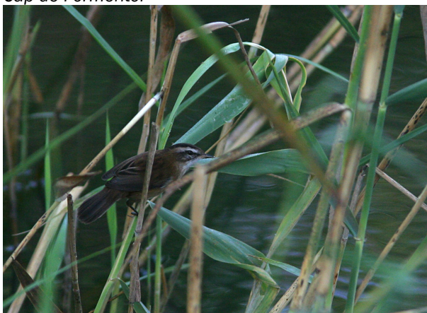
Moustached Warbler , Acrocephalus melanopogon , Albufera