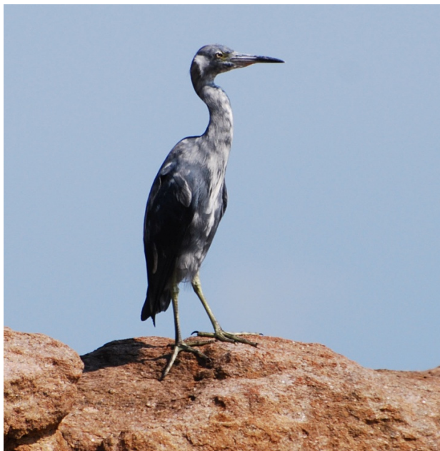
Little Blue Heron

3 Praia Lagoninha 9/3, 1 Ubatuba town 11/3 and 1 Praia do Cedro 12/3.