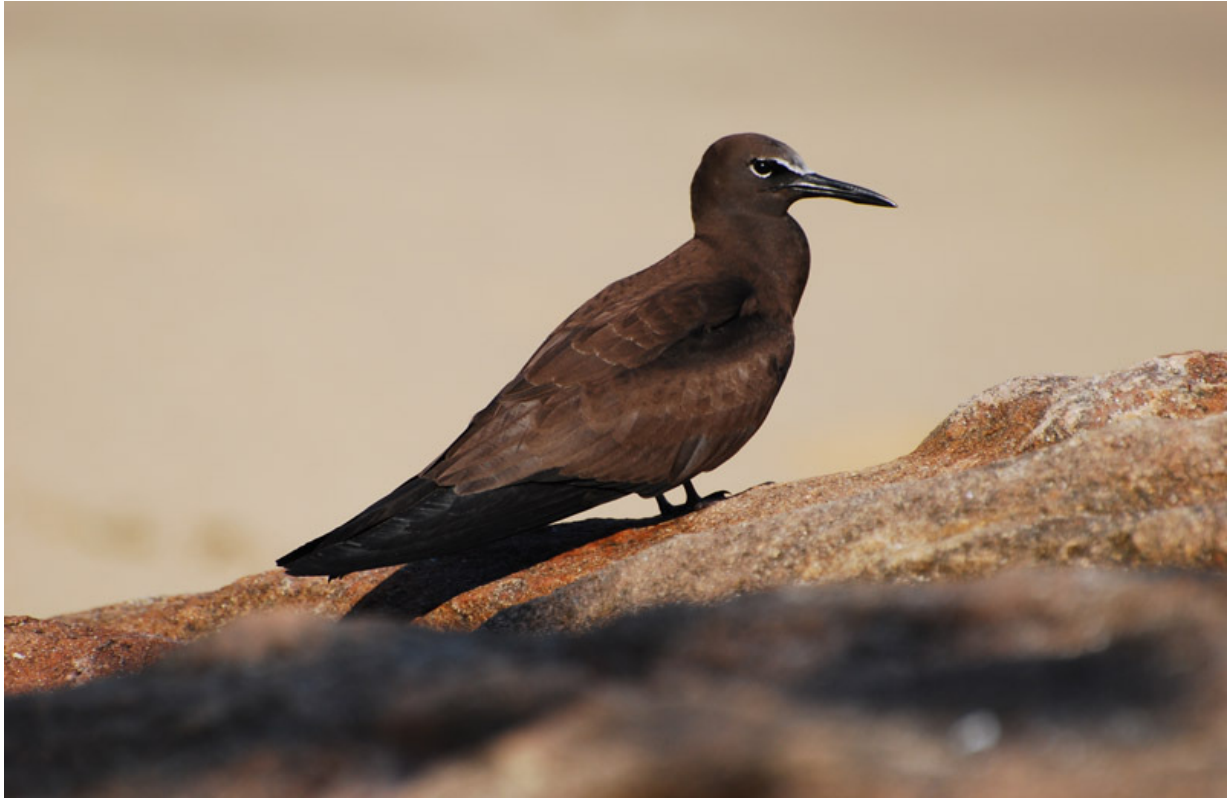
Brown Noddy a new species to Sao Paulo state