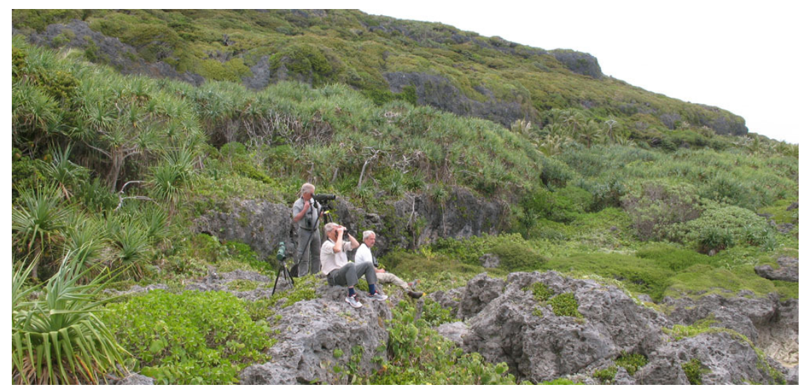
Seabird watching en route to Xodre, Lifou Island 19 Oct.