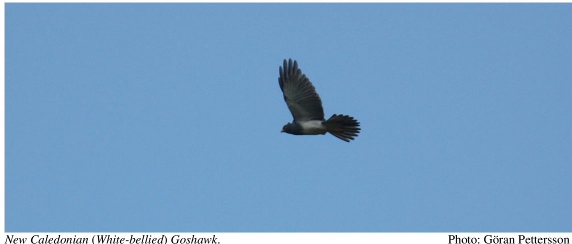
New Caledonian (White-bellied) Goshawk.