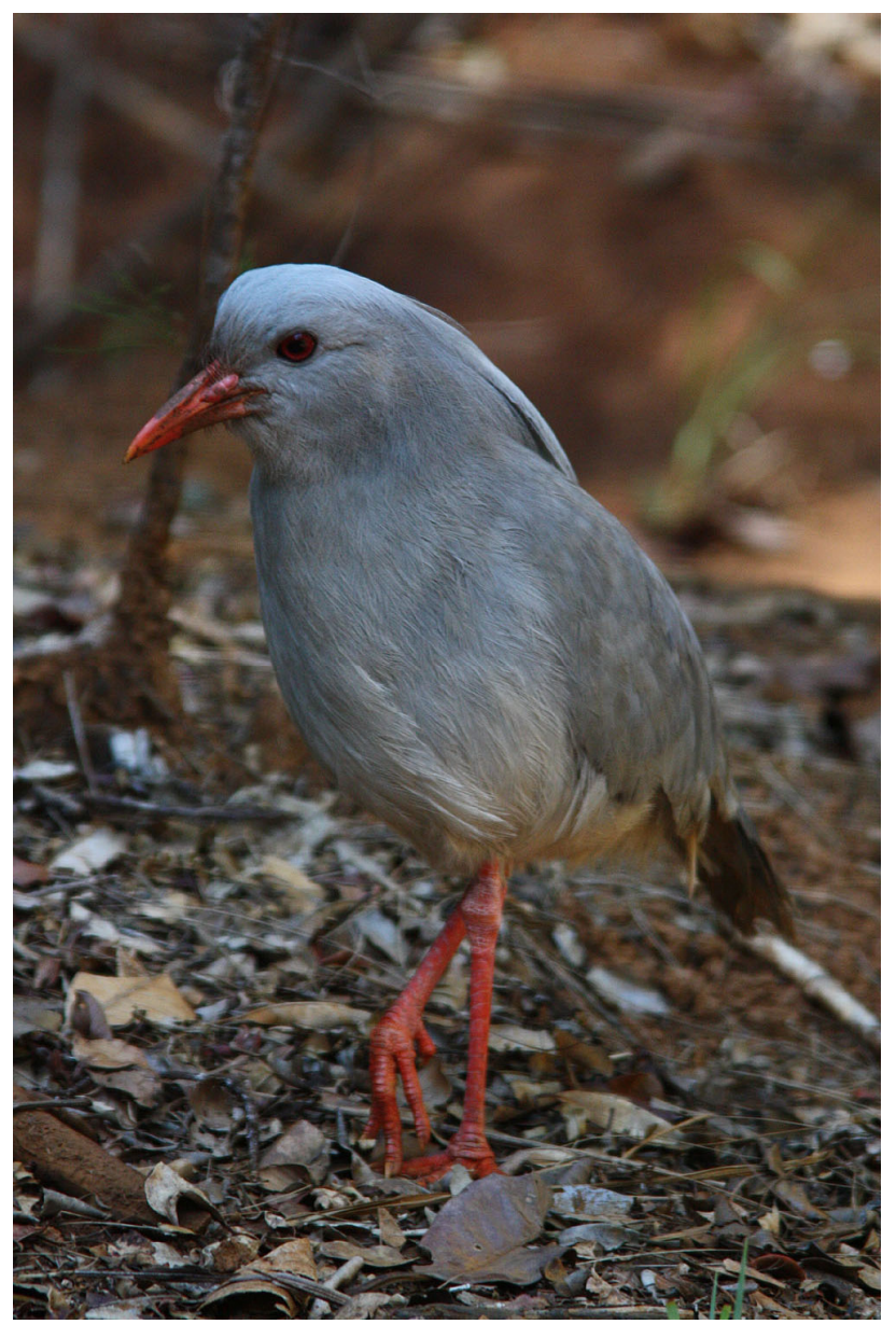
Kagu, Parc du Riviére Bleue.

Morning flight to Sydney and we arrived to Sydney before lunch time.