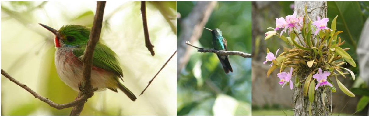
Cuban Tody, Cuban Emerald, orchid from the orchid garden in Soroa

We went to the Orchid garden situated just 200 m south of hotel Villa Soroa. It is a small but very well nursed garden. The orchids were beautiful and we also saw several new birds, e.g. West Indian Woodpecker , White-crowned Pigeon , Black-throated Blue Warbler and Red-legged Honeycreeper . In the evening we had dinner at Villa Soroa. Avoid the wines since they seem to have been stored at too hot temperature and had gone foul.