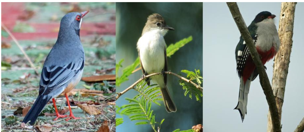
Red-legged Thrush, La Sagra's Flycatcher, Cuban Trogon

The last morning we went for pure tourism in old Havana and some last minute shopping in the Havana craft and souvenir market down Desamparado. We also went back to La Muralla in Plaza Vieja for a nice lunch before final packing. We went to the airport in very good time just in case. The airport service was however swift and after checking in and paying airport tax we spent some hours in the departure hall. The flight back was eventless.