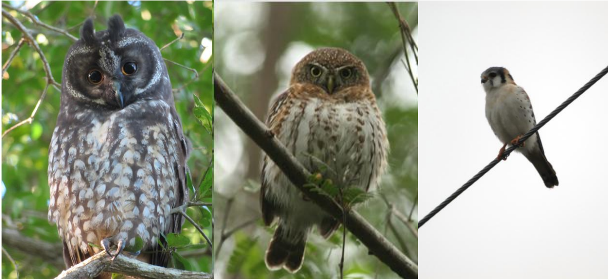
Stygian Owl, Cuban Pygmy-Owl, American kestrel