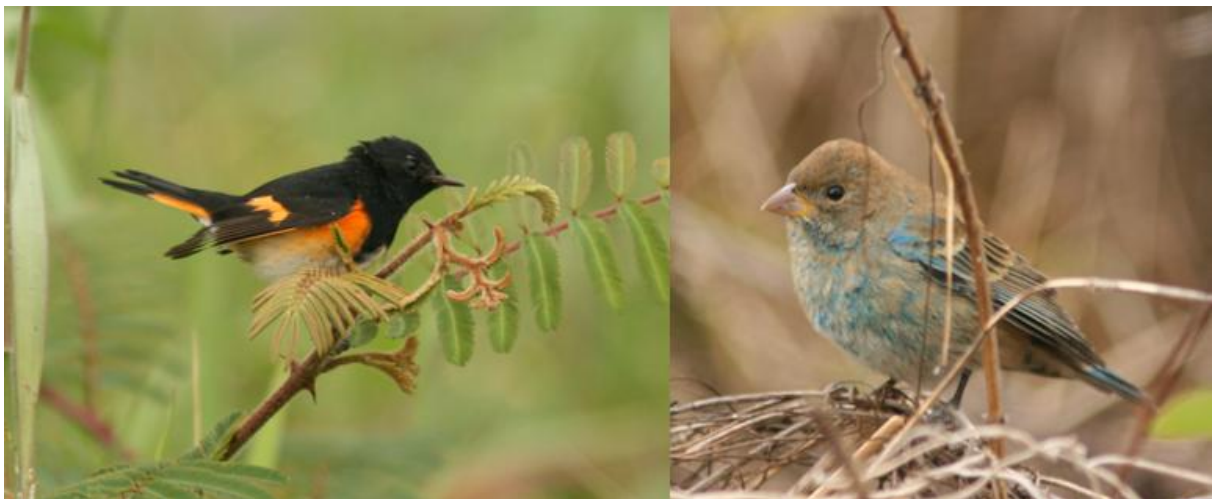
American Redstart, Indigo Bunting