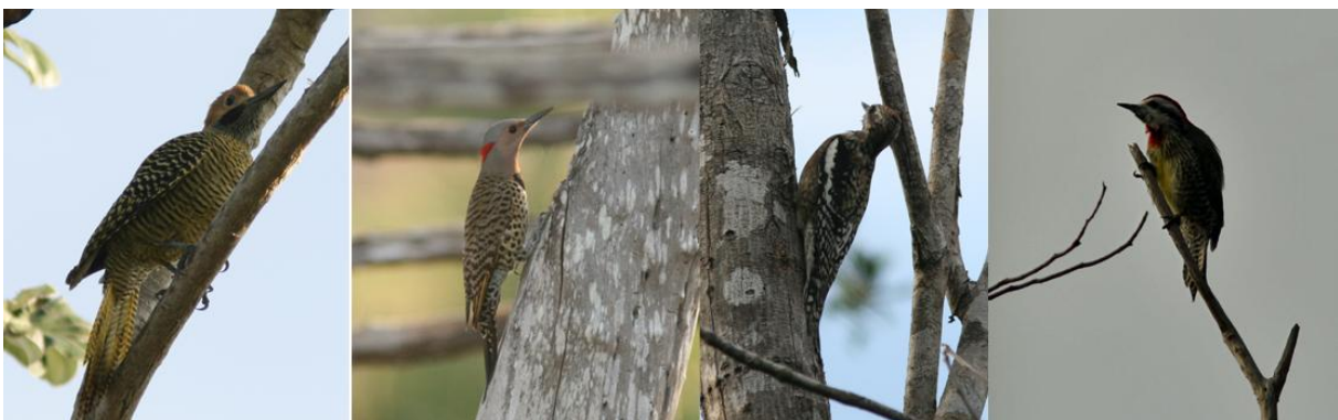
Fernandina's Flicker, Northern Flicker, Yellow-bellied Sapsucker, Cuban Green Woodpecker

Very early start (6 am) for Cuban Screech-owl , heard, and the nightjar, not heard. Hard work paid off with some Pygmy-Owls but nothing more. Even harder work finally paid off on the woodpecker account when two Fernandina's Flickers posed for us and we could enjoy excellent views. After that we spent one last hour at the Bee Hummingbird stake-out but again without luck.