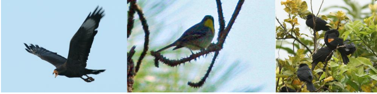
Cuban Black-hawk, Olive-capped Warbler, Tawny-shouldered Blackbirds