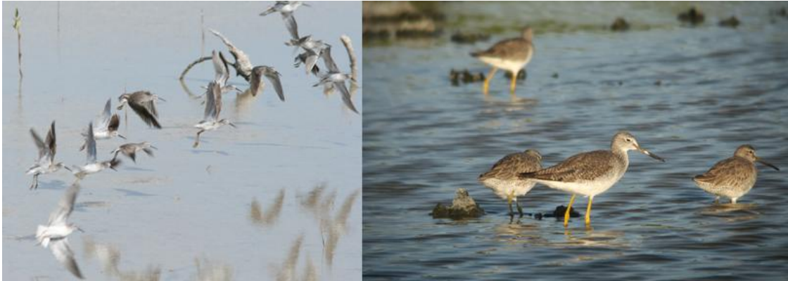
Stilt Sandpipers, Greater Yellowlegs and Short-billed Dowitcher