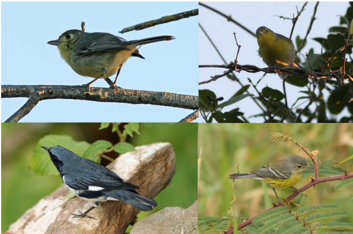
Cuban Vireo, Oriente Warbler, Black-throated Blue Warbler, Magnolia Warbler

The morning tour went to Cueva de Jabali. We spent two hours there and had some really nice birds, Key West Quail-dove, Cape May Warbler, Oriente Warbler, Painted Bunting and 3 Zapata Sparrows .