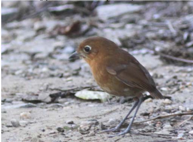
Rufous Antpitta at Santa Marta

One seen and three more heard at Chingaza (E of Bogota). This taxon was slightly more rufous than at Santa Marta, but had a strikingly different call (very well-spaced hui, hui, hui 4-6 times as well as a hui, tu-tu-tu-tu.)