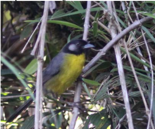
Santa Marta Brush-Finch

Many at mid and high altitudes at Santa Marta.