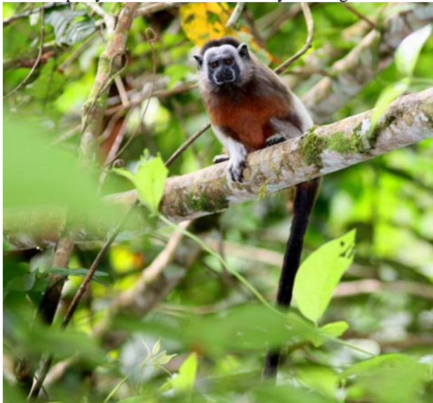
White-footed Tamarin Monkey