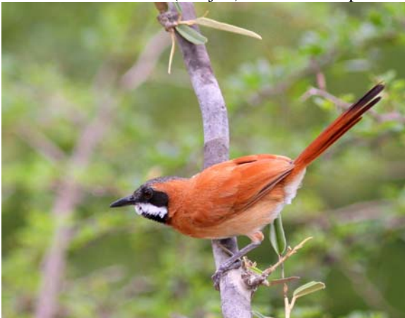
White-whiskered Spinetail – the best-looking spinetail?

Several at both Perico (Guajira) and the airstrip 10 km west of Riohacha (Guajira).