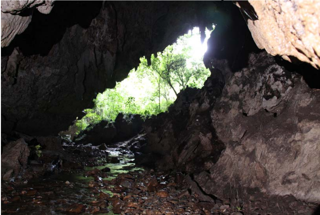
The entrance to the Oilbird cave

Gruta el Condor is a cave that holds a sizeable colony of Oilbirds. It is a 30 minute walk from the road following a stream-bed. The stream actually leads into the cave. As always with Oilbirds, it is an Indiana Jones experience to visit such a cave. We also notched up on a small group of Saffron-headed Parrots.