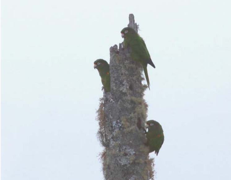
Santa Marta Parakeets

Three birds together near the radio station at El Cuchillo de San Lorenzo. The birds attended what was probably a nest at a broken palm-tree. They provided some nice scope views before flying off. This is a Santa Marta endemic that sometimes proves tricky to get.