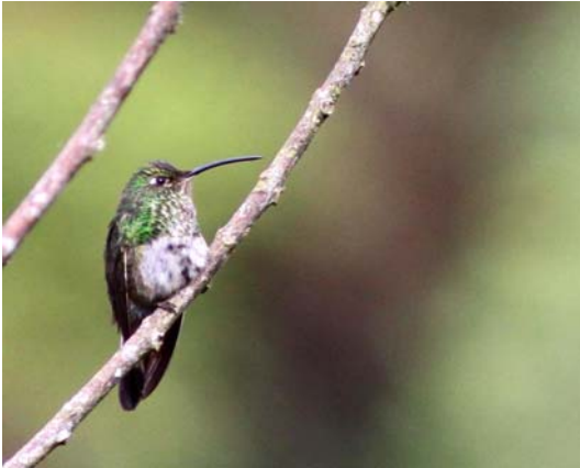
Female Mountain Velvetbreast

One male at El Cuchillo de San Lorenzo and one female at San Lorenzo Lodge.