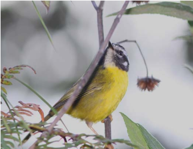
Santa Marta Warbler

Santa Marta Warbler, Basileuterus basilicus Two at El Cuchillo de San Lorenzo.