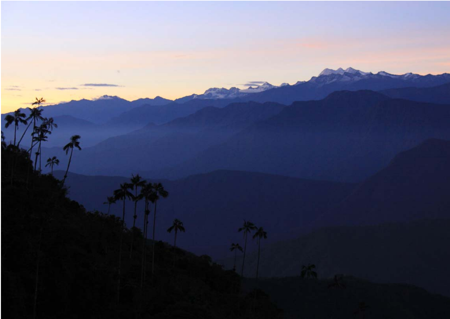
Santa Marta mountains – home to lots of endemic birds