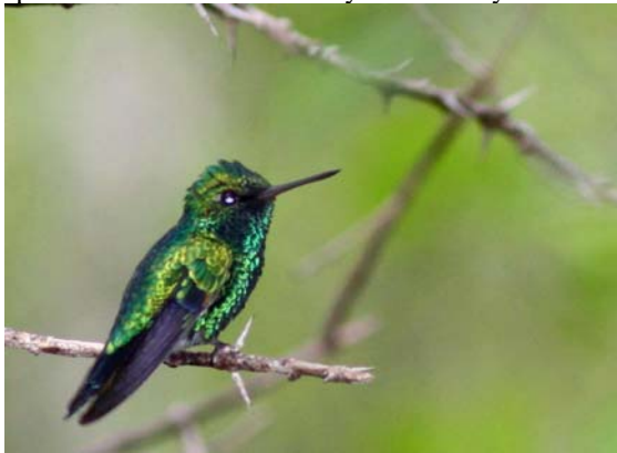
Shining-green Hummingbird – a good name for this bird