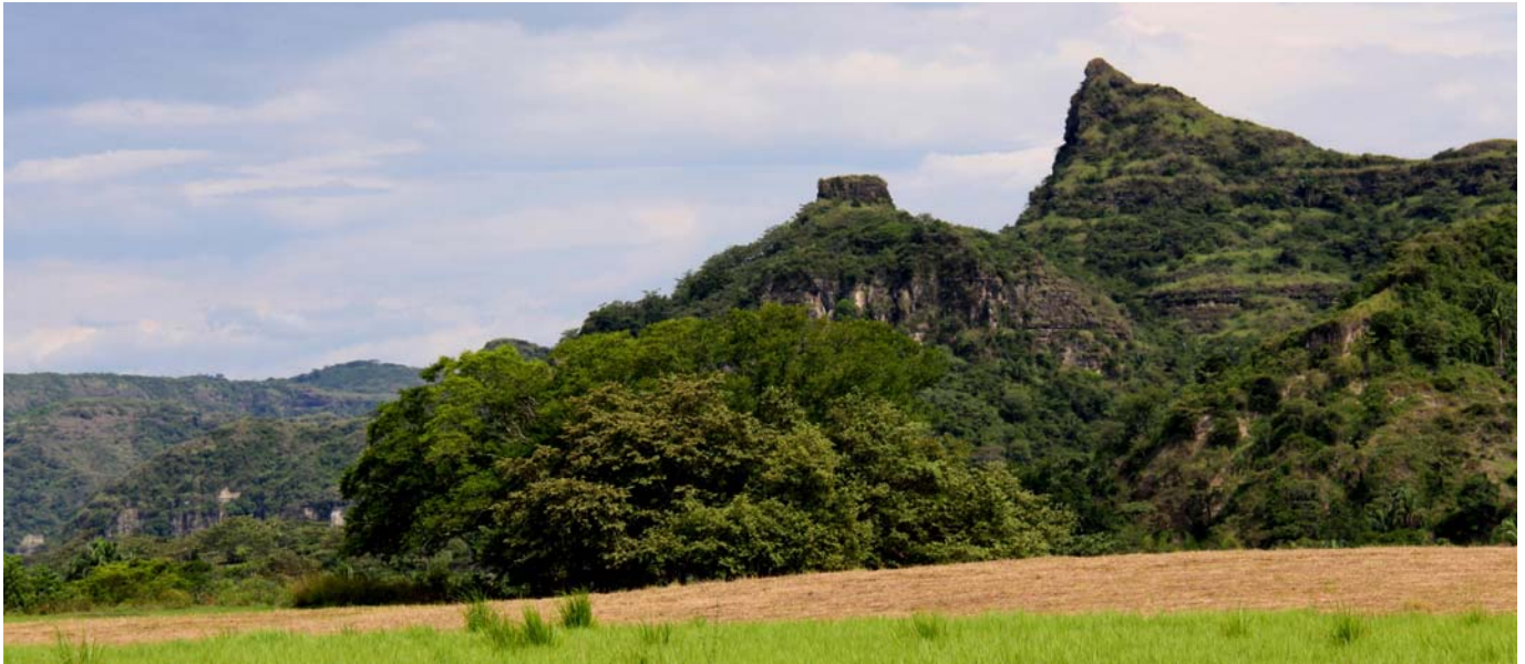
The valley bottom of the mighty Magdalena Valley has many table mountains