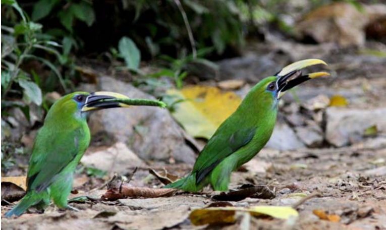
Santa Marta Toucanets

Several seen at mid and high altitudes at Santa Marta.