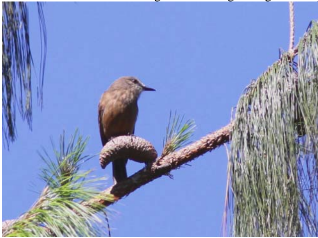
Santa Marta Bush-Tyrant

One above San Lorenzo Lodge showed in good light when perched conspicuously in a pine tree.