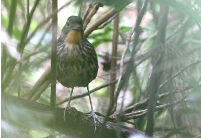
Santa Marta Antpitta

Many heard and one seen at higher altitudes at Santa Marta.