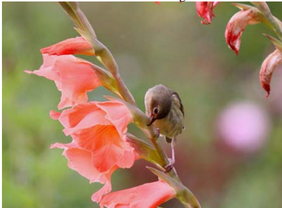
Rusty Flowerpiercer – doing what it is supposed to do