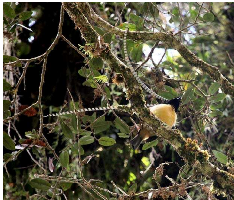
King-of-Saxony Bird of Paradise

Even though our birding was fairly relaxed and we furthermore experienced quite a few rainy days which significantly lowered the bird activity, we noted all in all 278 bird species on the trip, seventeen of which were Birds of Paradise (BOPs) and 26 of which were parrots. Birding highlights of the trip were thereby plentiful and included e.g. breathtaking observations of King-of-Saxony, Wilson's, King, Lesser, Red and Twelve-wired BOPs, Splendid and Arfak Astrapias, Vogelkop and MacGregor's Bowerbirds, Victoria Crowned Pigeon, Moluccan King-Parrot, a group of at least seventeen Pesquet's Parrots, Mountain and Feline Owlet-Nightjars as well as Papuan Frogmouths at rest, and much much more!