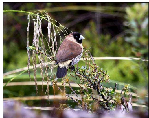
Snow Mountain Munia