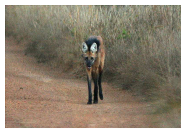
Maned Wolf through the front window.