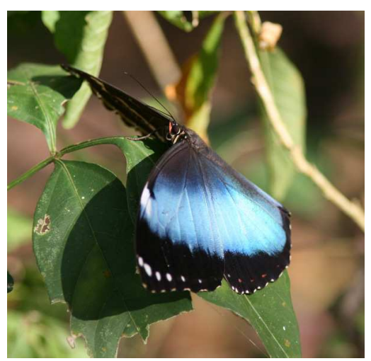
Helenor Morpho and Chestnut-eared Aracaris.