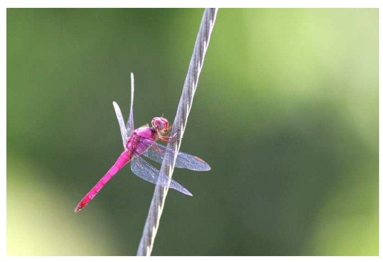
Dragonfly at Cristalino.