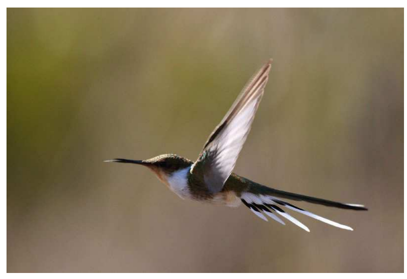
drove straight to Mineiros where Female Horned Sungem.