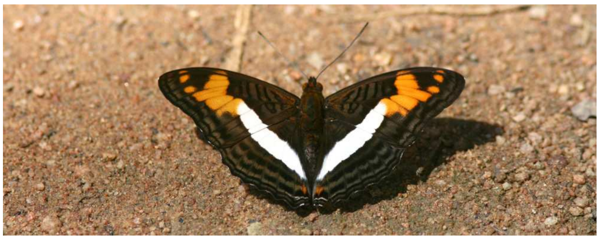
Capucinus Sister, one of Cristalino's abundant butterflies.