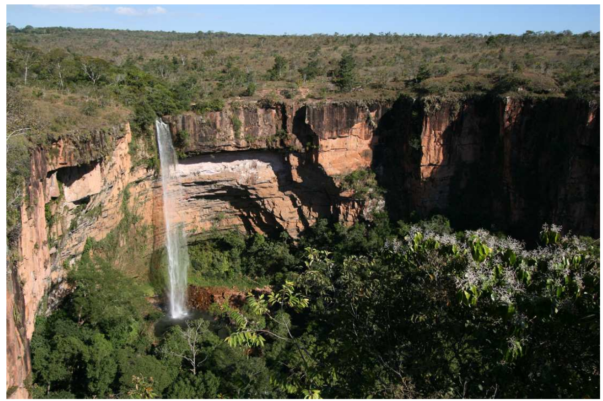
Véu de Noiva (Bridalveil Fall), Chapada dos Guimarães.