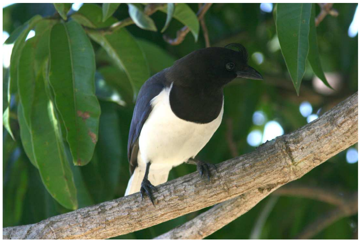
A curious Curl-crested Jay.

grounds. At 15.00 we walked towards the boardwalk that would take us into Cone-billed Tanager habitat. The Streamer-tailed Tyrants were at the exact same spot as last year! The first patch of dense riverine forest held White-striped Warbler (seen by a few) and Helmeted Manakin. On our way to the second forest patch the Cone-billed Tanager started to sing! It was a bit tumultous before everybody got to see this first class rarity, but at least I carried the scope for a good reason! The last daylight time was spent in the burnt area where we'd seen the Campo Miners earlier. Now there were two pairs of miners, and we also found Black-masked Finch, singing Lesser Nothura and singing Collared Crescentchest (badly wanted by several participants). Our last birding effort was to try for the White-winged Nightjar. Spotlighting was not permitted, so we had to rely on the old air strip. Unfortunately it was a bit too cool and we hardly saw any moths. It had been a very good start anyway, and we could anjoy a good dinner before it was time to make the list and go to bed.