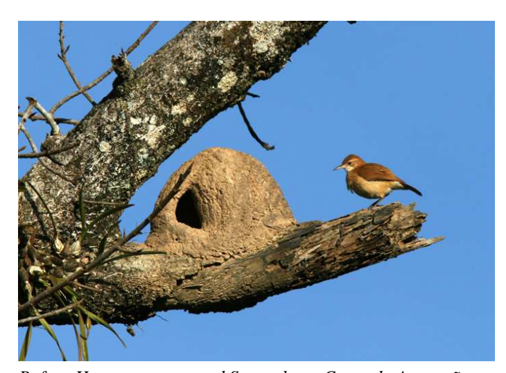
Rufous Hornero at nest and Sungrebe at Canto do Arancuã.