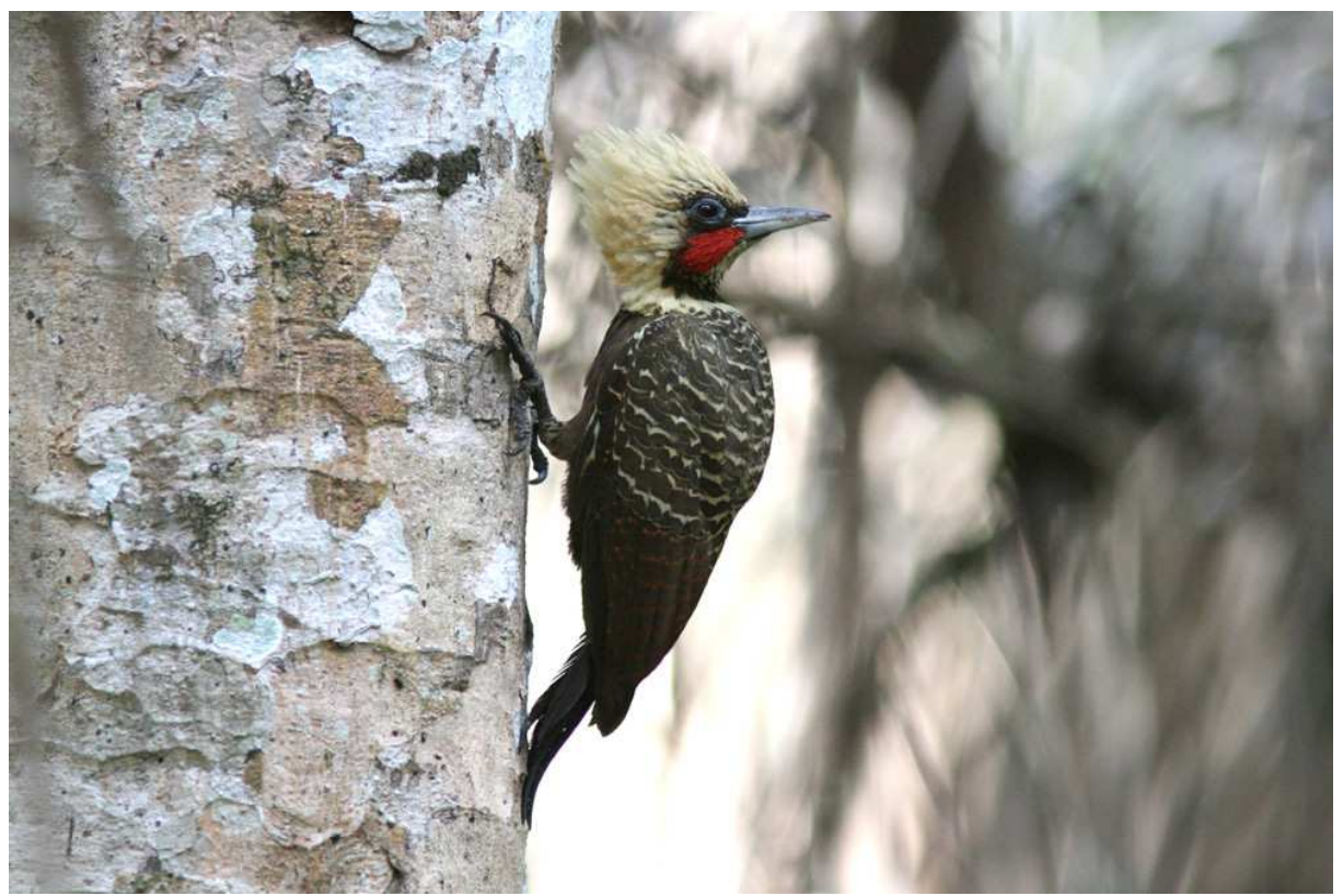
The beautiful Pale-crested Woodpecker at Canto do Arancuã.