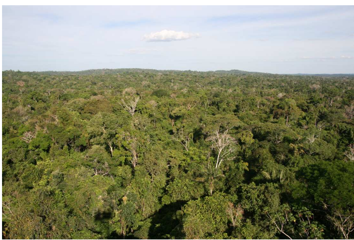
Unbroken Amazonian forest as seen from the top of Cristalino's canopy tower.

Breakfast today was scheduled at 05.15 and departure for the Castanheira Trail at 05.45. This beautiful forest trail is half an hour upstream. Along the river we recorded Capped Heron, Green Ibis, Black Caracara, Sunbittern and plenty of Blue-and-yellow Macaws. The Castanheira was a bit on the quiet side, but as usual it produced quality birds. Most of these were only heard, including Razor-billed Curassow, Barred Forest-Falcon, Pygmy Antwren, Chestnut-tailed Antbird, Chestnut-belted Gnateater, Southern Nightingale-Wren and Tooth-billed Wren. Good species seen were foremost three stunning Bare-eyed Antbirds and a Golden-crowned Spadebill. Back at the boat we had four Crimson-bellied Parakeets by the river. A visit to a nearby forest stream gave White-crowned Manakin, Thrush-like Schiffornis, Cream-colored Woodpecker, Bronzy Jacamar (heard) and a funny group of Spider Monkeys. Also the beginning of Kawall trail was on the morning's itinerary, so there we went to hear Flame-crested Manakin and Zimmer's Tody-Tyrant despite trying hard to see both of them with the help of playback. From the river we found three King Vultures and a White Hawk on the way back to the lodge. Lunch and siesta followed. At 15.00 we walked towards the Canopy Tower . At the Rocky/Caja intersection playback was attempted for the uncommon and difficult-to-see Banded