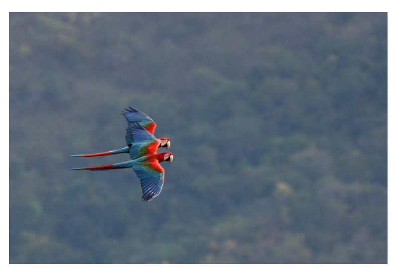
Red-and-green Macaws at Chapada.