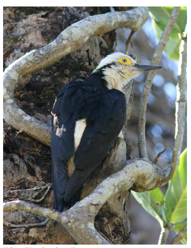
White Woodpecker, Emas.