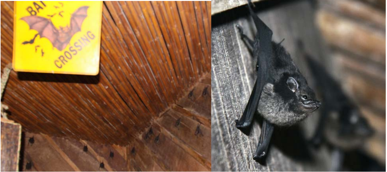
Inside the bar...

Central American Squirrel Monkey, Saimiri oerstedii Two at the Esquinas Lodge.