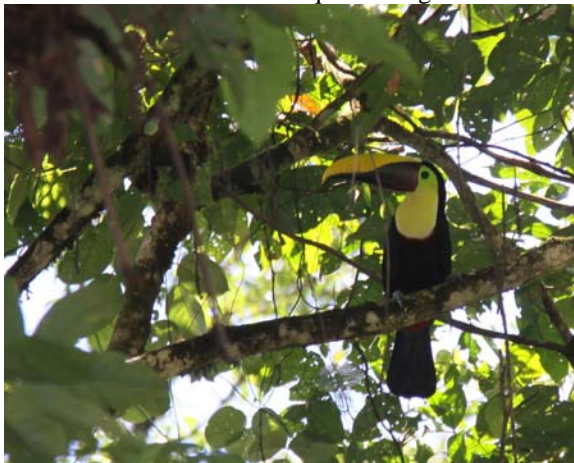
Black-mandibled Toucan, sometimes, but doubtfully, split as Chestnut-mandibled

Several heard and seen at Esquinas lodge area.