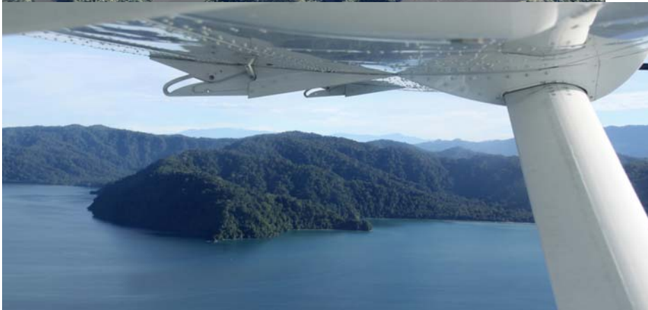
Approaching Golfito airport