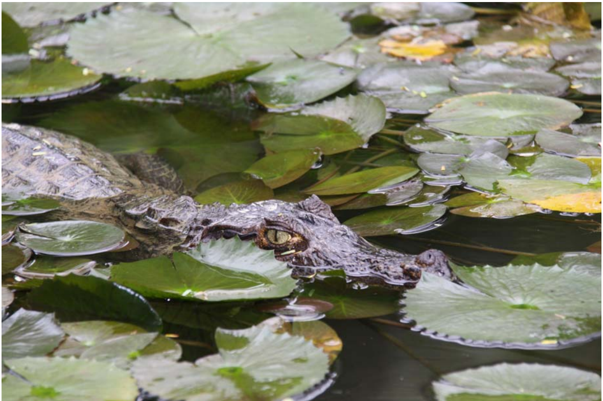
Outside the bar...