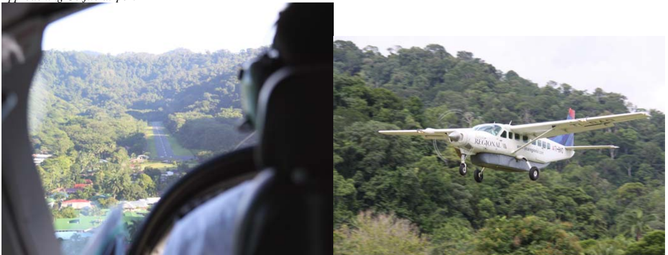
Peering over the shoulder of the pilot