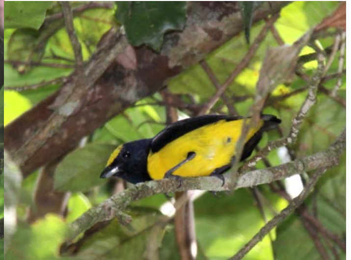
... and Spot-crowned Euphonia

Besides the birds, it was also memorable in terms of frogs, and I finally saw my first Red-eyed Tree Frog, one of the key symbols of Costa Rica.