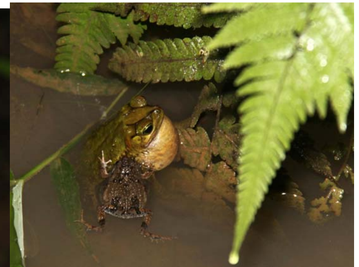
...and they are making even more...