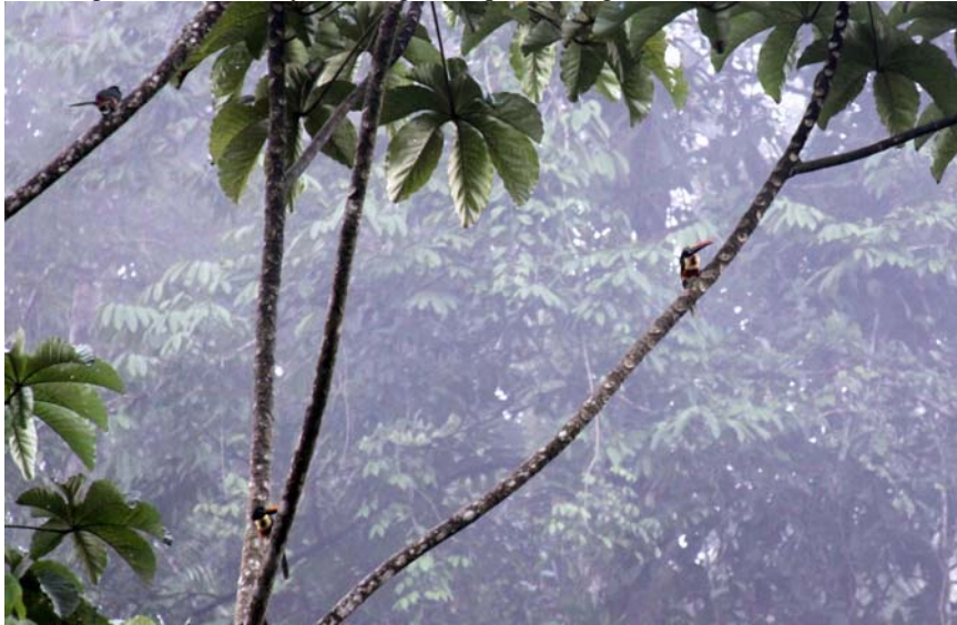
A group of Fiery-billed Aracaris

Four together in the early morning at Esquinas lodge area.