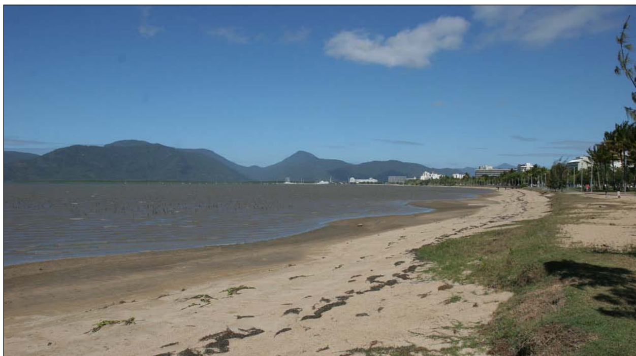
High tide at the north end of the famous Cairns Esplanade. Between here and the nearby airport (behind), the coastline still holds some mangrove forest. The Cairns city centre and harbour is seen at a distance.

Subsequently rented a car and spent three nights at the Chambers lodge near Lake Eacham/Yungaburra on the Atherton Tablelands Aug 24-27 th . The following places were visited during these days: Kuranda, Mareeba Wetlands (both en route), The Cathedral Fig, The Curtain Fig, Lake Eacham (including Chambers Lodge), Johnson's and Peterson's Creek (Yungaburra), the Bromfield Crater and Hasties Swamp. One day was spent with a local nature guide, Jonathan Munroe ( www.wildwatch.com.au ), and included additional visits to Flaggy Creek near Wondecla and the roads in the drier areas west of Ravenshoe around Innote Hot Springs and Mt Garnet + Tabo Village. The evening was spent spotlighting for marsupials at his own estate called Warrigal, near Ravenshoe.