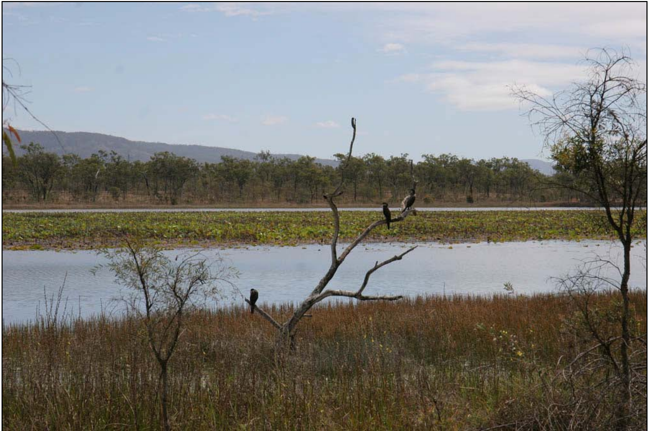
Mareeba Wetlands in Queensland

August 9-30 th I visited Australia on a combined work conference and vacation trip and stayed the first two weeks in central Sydney and did a few day trips south to e.g. Cronulla, Bundeena and Royal NP. In addition to some birding one morning in Centennial Park, the only birding worth mentioning around Sydney was a day on Aug 19 th in Royal NP (primarily Lady Carrington Rd, Wattamolla and the Curra Moors loop track) an hour's drive south of the city. The pelagic trip off Sydney out to the continental shelf and Brown's Mountain was with the Halicat on Aug 9 th . For more information about this all year round monthly event departing from Rose Bay (but also from Wollongong), see website: http://users.bigpond.net.au/palliser/pelagic/ I then took a 3 hours domestic flight north and stayed a holiday week in Queensland starting off in Cairns Aug 20-23 rd from where I also went on a boat day trip with Seastar ( www.seastarcruises.com.au ) to Michaelmas Cay on Aug 22 nd and also combined it with some Scuba diving here and around Hastings Reef. Birding in Cairns primarily around Centenary