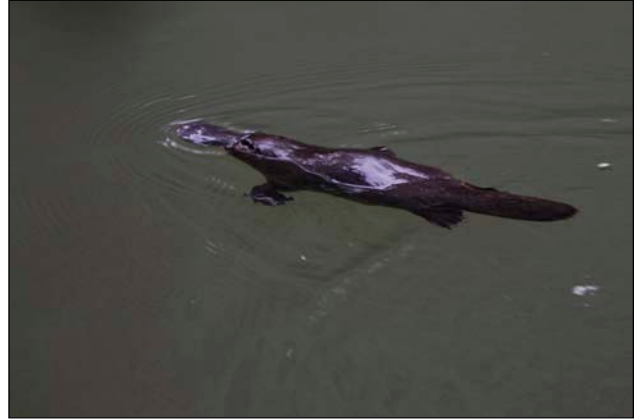
A curious Agile Wallaby ( Macropus agilis ) and the fascinating Platypus ( Ornithorhynchus anatinus ).