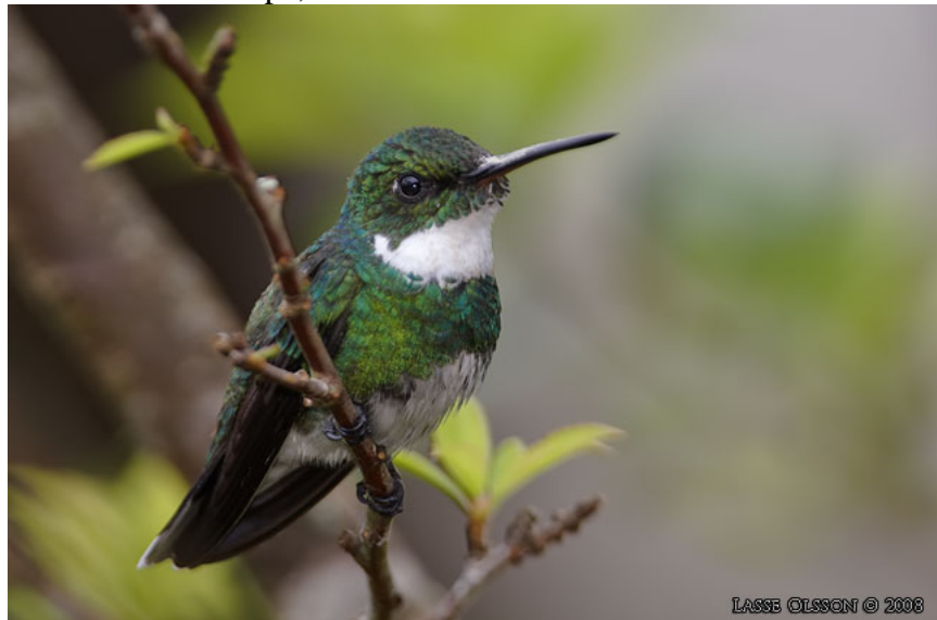
White-throated Hummingbird ( Leucochloris albicollis ) – Hotel do Ypé, PN Itatiaia 2008-12-31