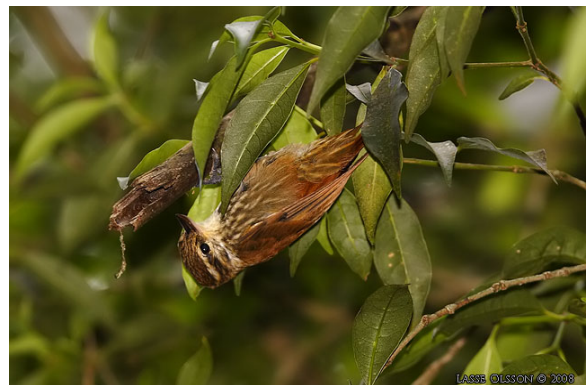
Streaked Xenops ( Xenops rutilans ) – PN Itatiaia 2009-01-01