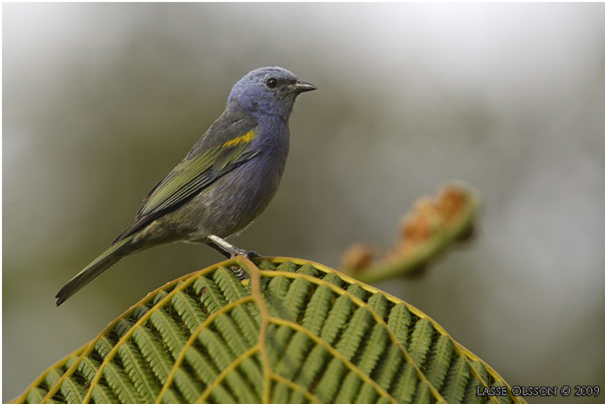
Golden-chevroned Tanager ( Thraupis ornate ) – Hotel do Ypé 2009-01-01

Seen in good numbers Serra dos Tucanos, Itatiaia and Ubatuba