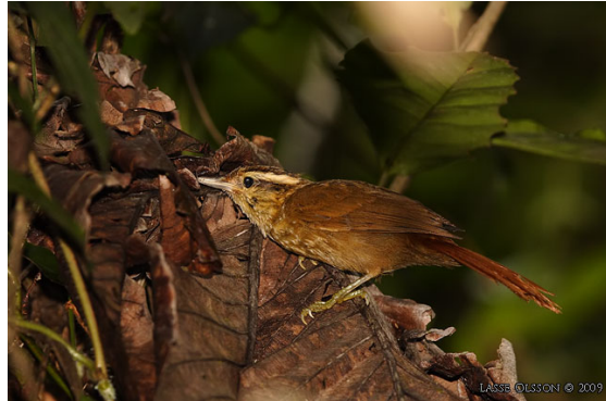
Sharp-billed Treehunter ( Heliobletus contaminatus ) Três Picos Trail, PN Itatiaia 2009-01-02

Things worth mentioning are Solitary Tinamou ( Tinamus solitarius ), Tawny-browed Owl ( Pulsatrix koeniswaldiana ) on the hotel grounds, Short-tailed Nighthawk ( Lurocalis semitorquatus ) flying over at dusk, Pileated Parrot ( Pionopsitta pileata ), Rufous-capped Motmot ( Baryphthengus ruficapillus ), Red-breasted Toucan ( Ramphastos dicolorus ), Yellow-fronted Woodpecker ( Melanerpes flavifrons ), Pallid Spinetail ( Cranioleuca pallida ), Sharp-billed Treehunter ( Heliobletus contaminatus ), White-bibbed Antbird ( Myrmeciza loricata ), Such's Antthrush ( Chamaeza meruloides ), Variiegated Antpitta ( Grallaria varia ), Black-capped Piprites ( Piprites pileata ), Drab-breasted Bamboo Tyrant ( Hemitriccus diops ), Brown Tanager ( Orchesticus abeillei ), Olive-green Tanager ( Orthogonys chloricterus ), White-lined Tanager ( Tachyphonus rufus ), Gilt-edged Tanager ( Tangara cyanoventris ), Black-throated Grosbeak ( Saltator fuliginosus ) and Thick-billed Saltator ( Saltator maxillosus ).