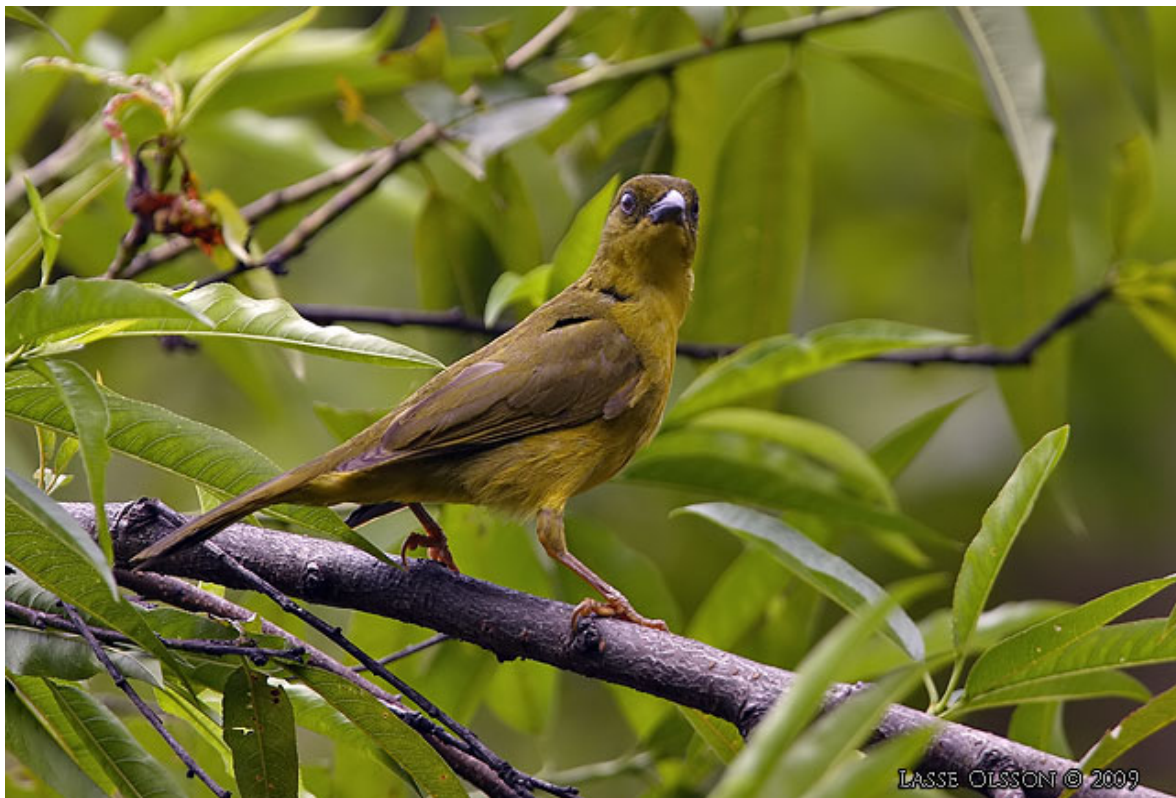
Olive-green Tanager ( Orthogonys chloricterus ) - Hotel do Ypé, PN Itatiaia 2008-12-31