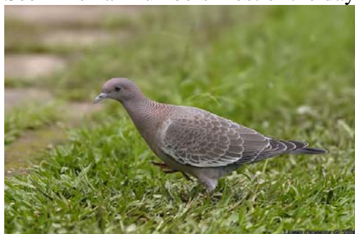
Picazuro Pigeon ( Patagioenas picazuro ) Hotel do Ypé, PN Itatiaia 2008-12-30