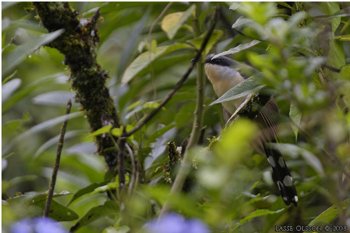
Dark-billed Cuckoo ( Coccyzus melacoryphus ) – Serra dos Tucanos 2008-12-18