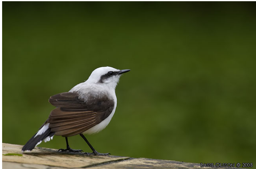
Masked Water-Tyrant ( Fluvicola nengeta ) – Serra dos Tucanos 2008-12-17