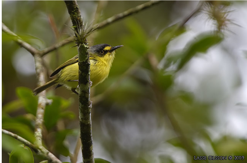
Gray-headed Tody-Flycatcher ( Todirostrum poliocephalum ) – Fazenda Capricornio 2008-01-07