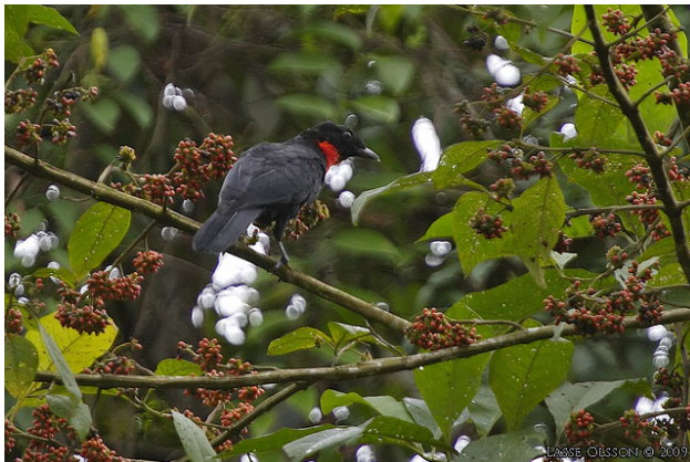
Red-ruffed Fruitcrow ( Pyroderus scutatus ) Fazenda Angelim 2009-01-05