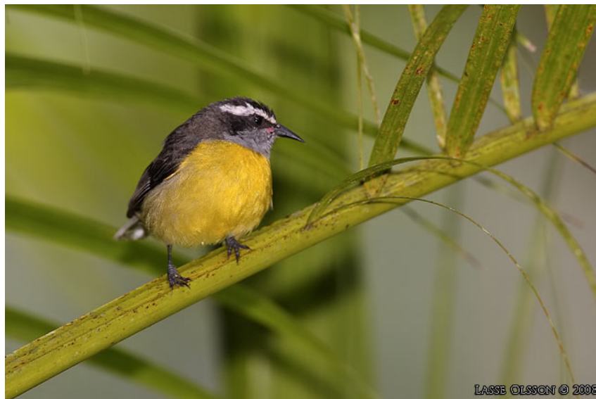
Bananaquit ( Coereba flaveola ) – Serra dos Tucanos 2008-12-17