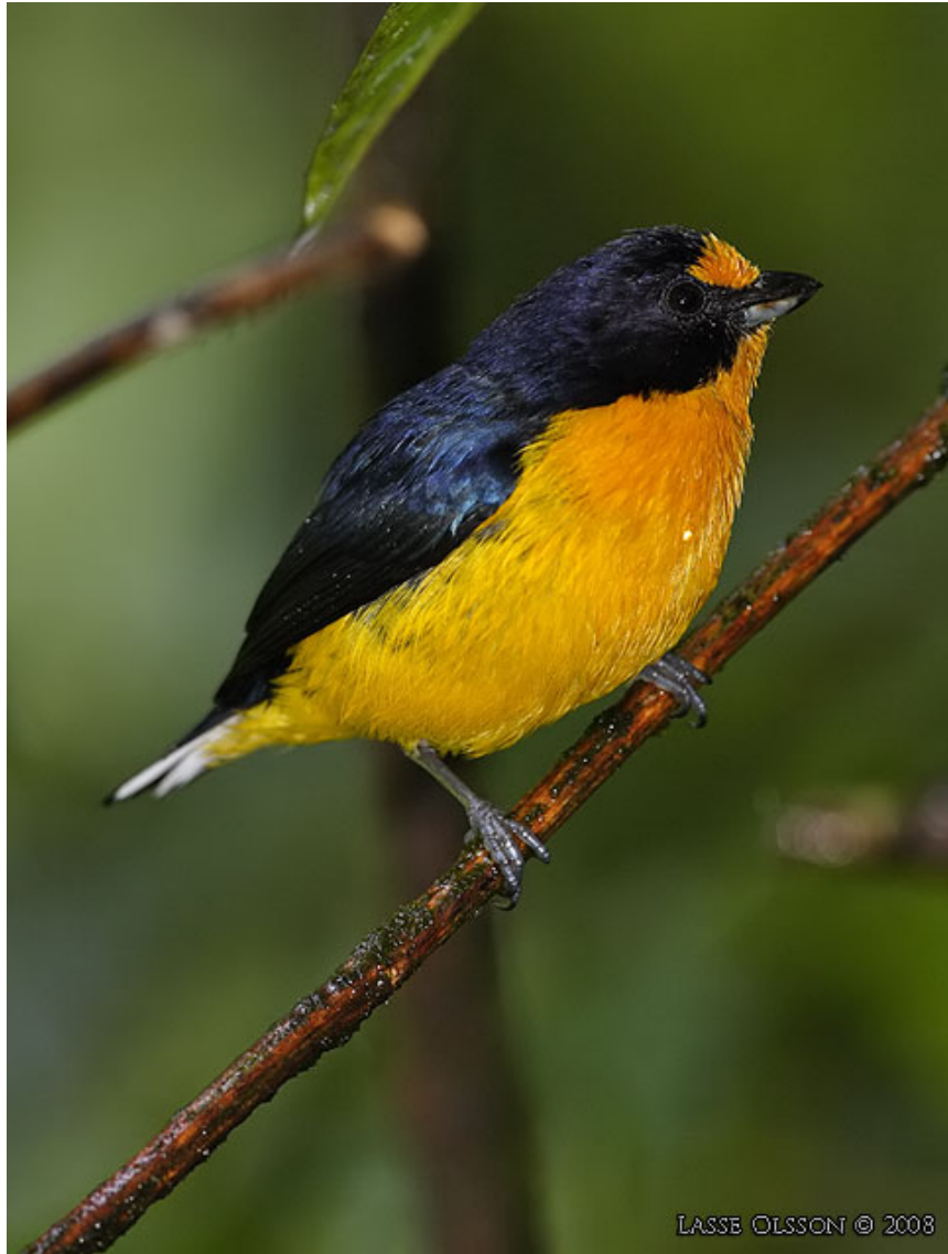
Violaceous Euphonia ( Euphonia violacea ) – Serra dos Tucanos 2008-12-17

286. Violaceous Euphonia ( Euphonia violacea ) Common Serra dos Tucanos and Ubatuba