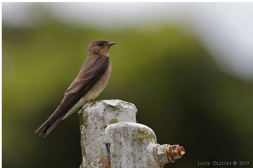
Southern Rough-winged Swallow ( Stelgidopteryx ruficollis ) – Hotel du Ypé, Itatiaia 2009-01-01