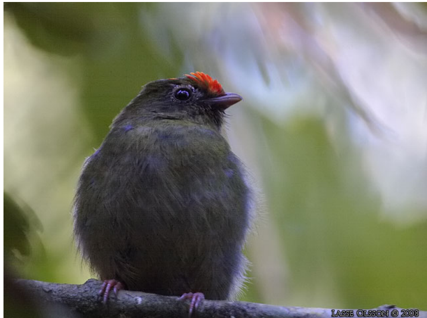
Blue Manakin ( Chiroxiphia caudate ) – Maromba trail, PN Itatiaia 2008-12-30