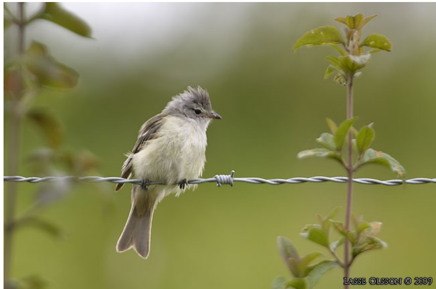
Southern Beardless Tyrannulet ( Camptostoma obsoletum ) – Salesopolis road 2009-01-08