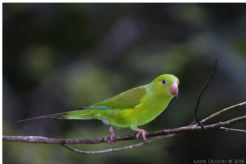
Plain Parakeet ( Brotogeris tirica ) Serra dos Tucanos 2008-12-17