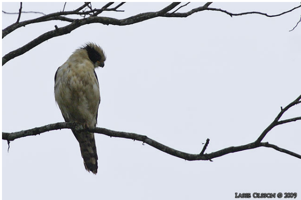
Laughing Falcon ( Herpetotheres cachinnans ) Fazenda Capricornio, Ubatuba 2009-01-06