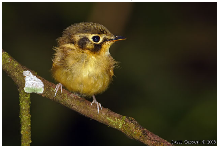
White-throated Spadebill ( Platyrinchus mystaceus ) - Três Picos trail, Itatiaia 2008-12-31