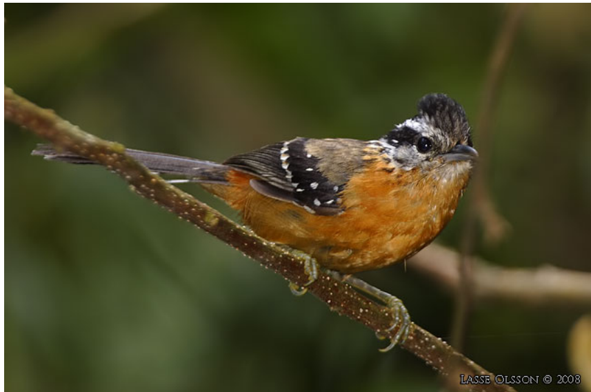
Ferruginous Antbird ( Drymophila ferruginea ) – Três Picos trail, Itatiaia 2008-12-30