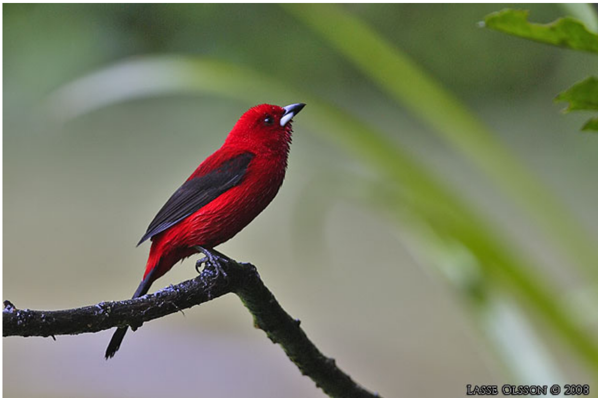
Brazilian Tanager ( Ramphocelus bresilius ) – Serra dos Tucanos 2008-12-17