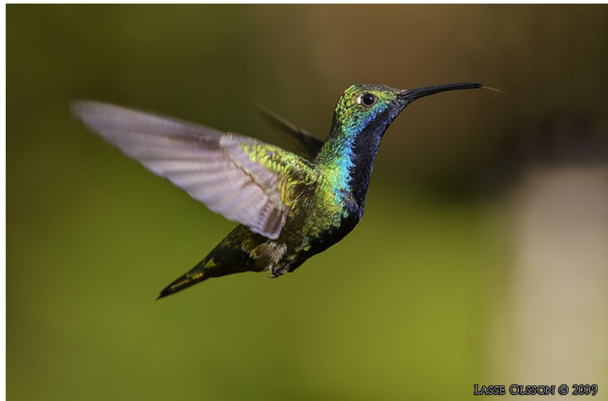
Black-throated Mango ( Anthracothorax nigricollis ) – Ilha Grande 2008-12-25