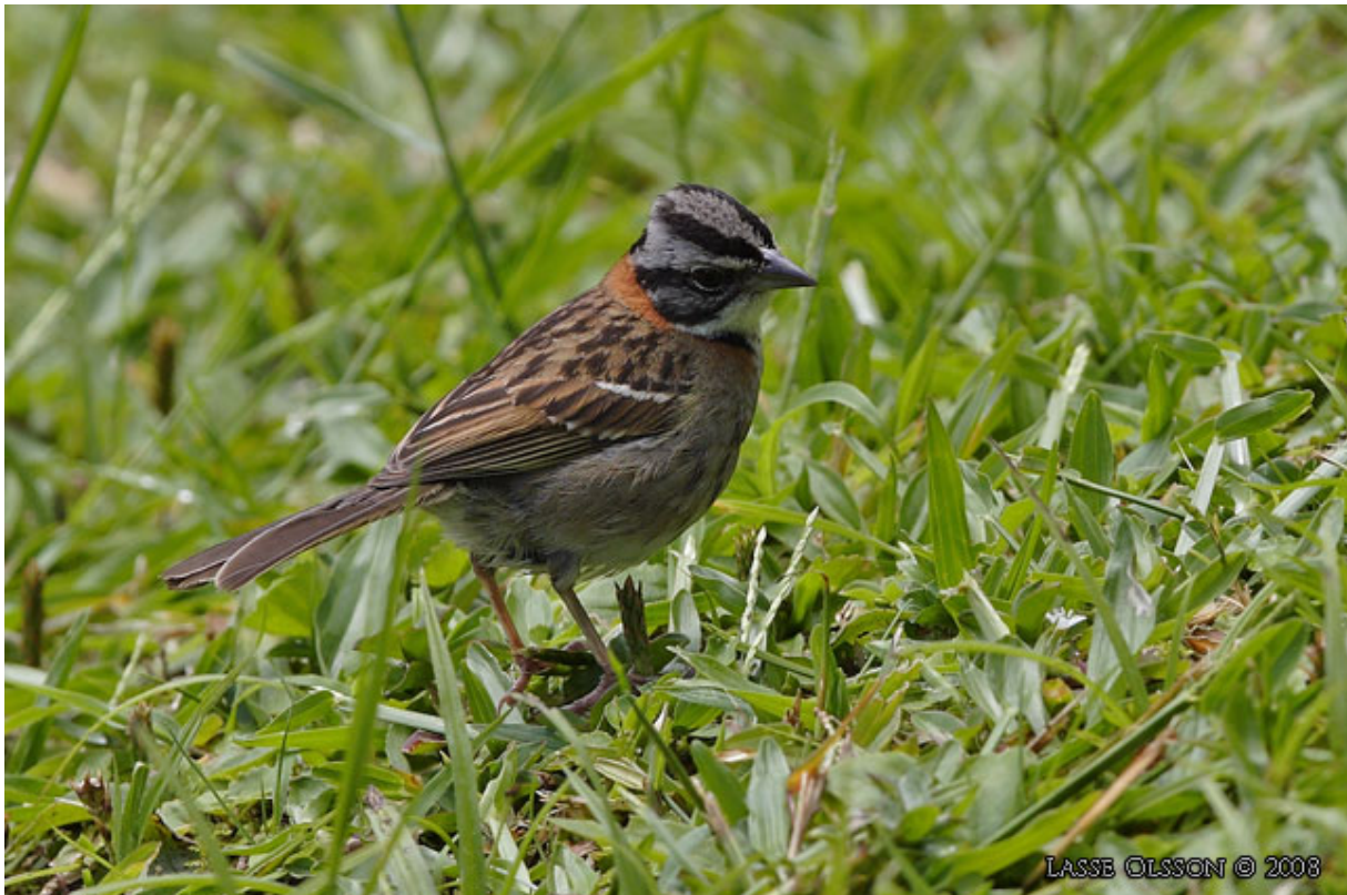
Rufous-collared Sparrow ( Zonotrichia capensis ) – Hotel do Ypé, PN Itatiaia 2008-12-30