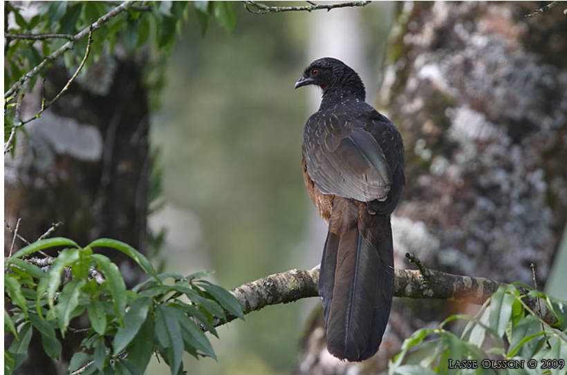
Dusky-legged Guan ( Penelope obscura ) – Hotel do Ypé, PN Itatiaia 2008-12-30