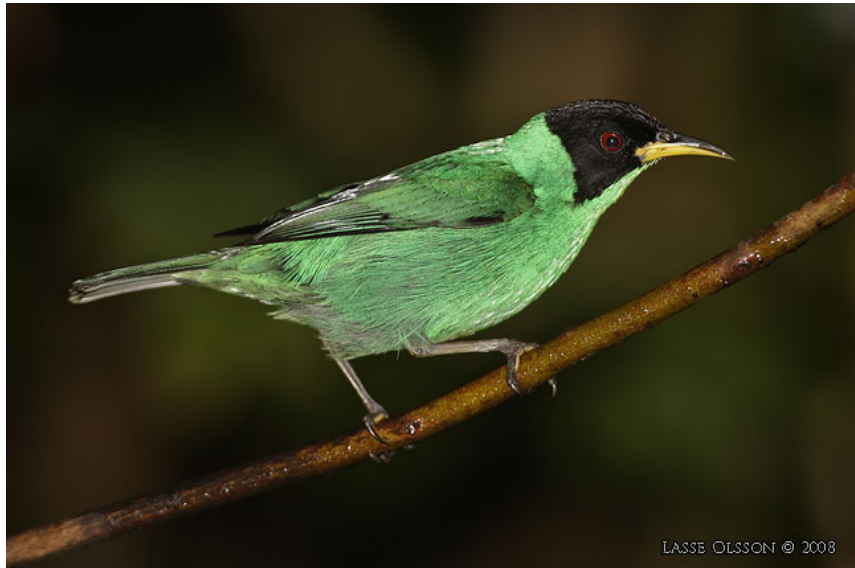
Green Honeycreeper ( Chlorophanes spiza ) – Serra dos Tucanos 2008-12-17

A pair Serra dos Tucanos and 1 female Ubatuba