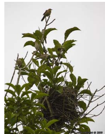
Firewood-gatherer ( Anumbius annumbi ) Salesopolis road 2009-01-08