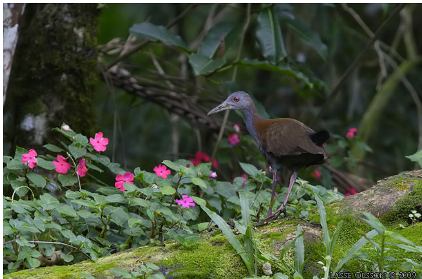
Slaty-breasted Woodrail ( Aramides saracura ) – Hotel do Ypé, PN Itatiaia 2008-12-31