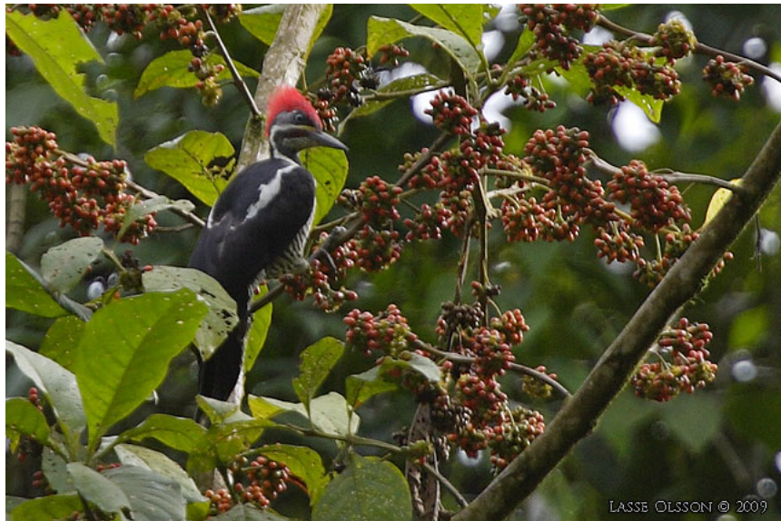
Lineated Woodpecker ( Dryocopus lineatus ) – Fazenda Angelim 2009-01-05