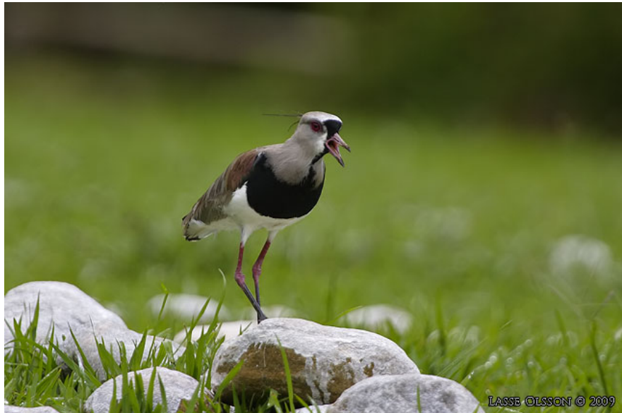
Southern Lapwing ( Vanellus chilensis ) – Pica Pau, Ubatuba 2009-01-07