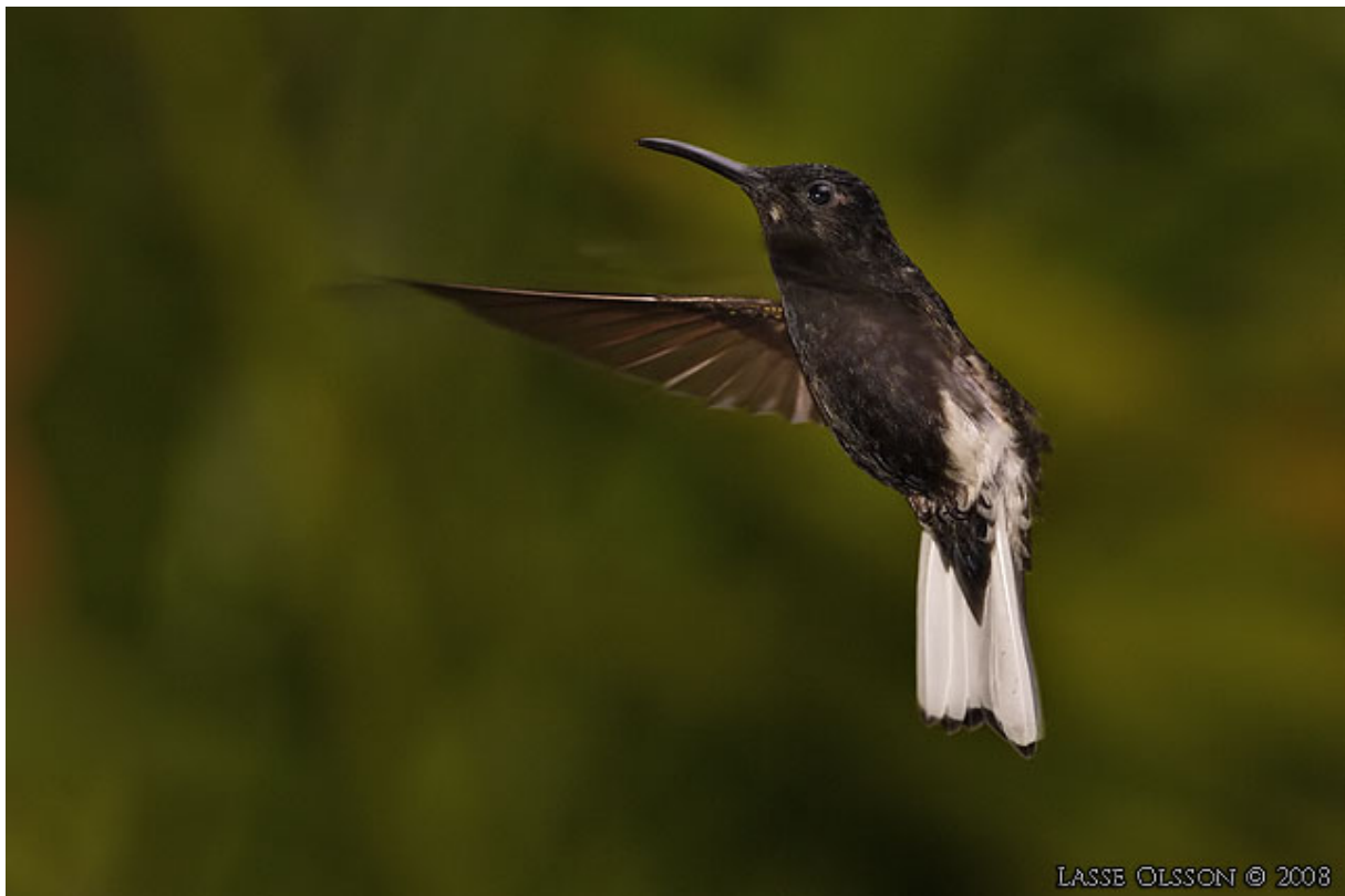
Black Jacobin ( Florisuga fuscus ) – Serra dos Tucanos 2008-12-17