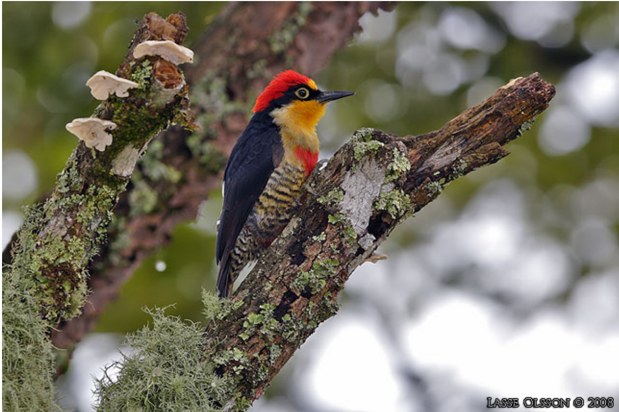
Yellow-fronted Woodpecker ( Melanerpes flavifrons ) – Hotel do Ypé 2009-01-01