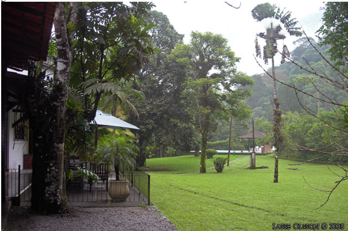
The grounds at Serra dos Tucanos

After some urban days in Rio de Janeiro our trip proceeded to the green and relaxed island of Ilha Grande. Former prison island and lepra colony it has become a tourist magnet over the last couple of years. The atmosphere is laid-back and still there are no roads on the island, only a barely drivable dirt road that leads across the island. Though, there are numerous tracks connecting the different parts of the island, but as it is rugged and temperature rise quickly after a cool morning it demands plenty of water and birding stops along the way. The mentioned dirt road between Abraão and Praia dos Rios is by far the best place I