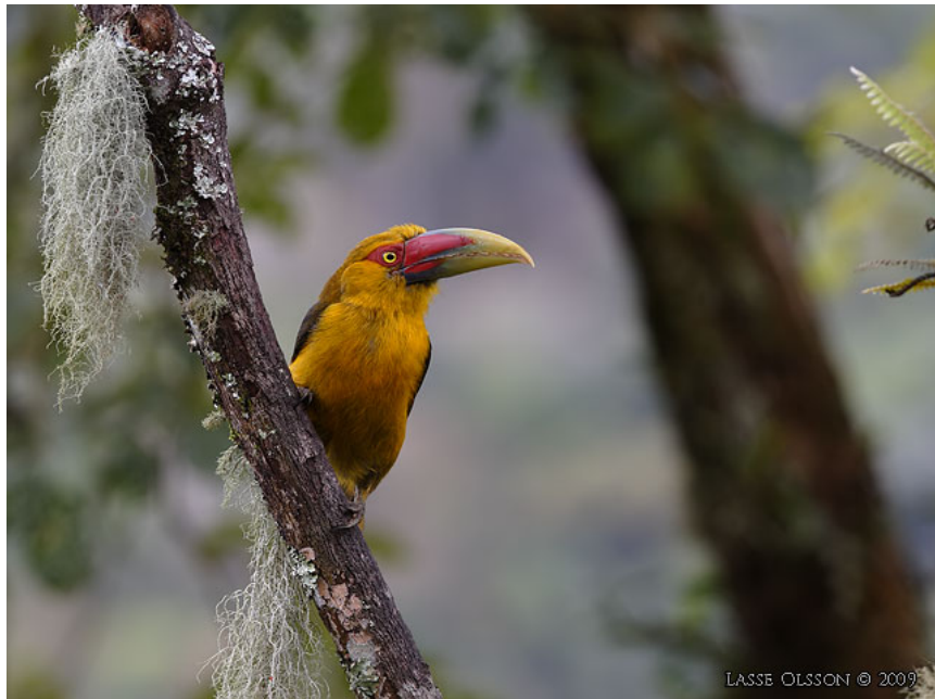
Saffron Toucanet ( Pteroglossus bailloni ) – Hotel do Ypé 2008-12-31

Seen in small groups at Serra dos Tucanos, Itatiaia and Ubatuba