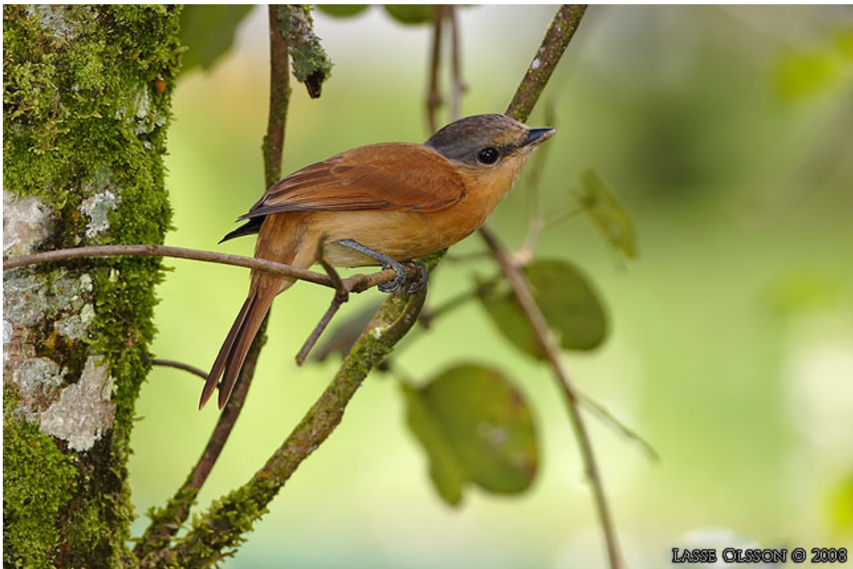
Chestnut-crowned Becard ( Pachyramphus castaneus ) - Três Picos trail, Itatiaia 2009-12-30