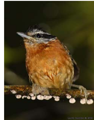
Bertoni's Antbird ( Drymophila rubricollis ) – Theodoro Trail 2008-12-18