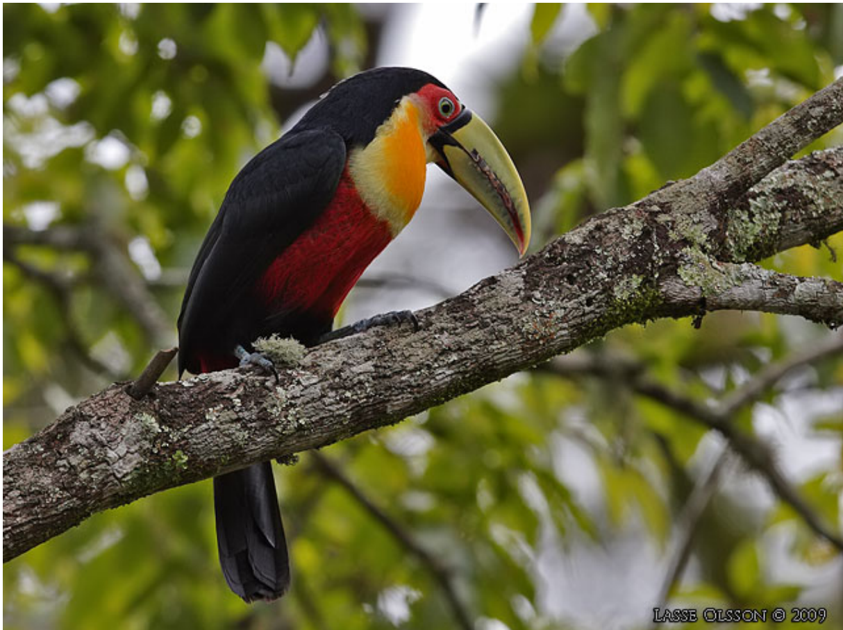
Red-breasted Toucan ( Ramphastos dicolorus ) – Hotel do Ypé 2008-12-30