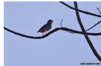
Buff-throated Purpletuft ( Iodopleura pipra )

On the other side of town is the fazendas Angelim and Capricornio, which above all is known as the best places to hunt down the Buff-throated Purpletuft ( Iodopleura pipra ), one of the specialities of Ubatuba. As it is a sun-loving bird I realized weather wasn't too co-operative and consequently there was no sight of the bird for three days before I finally caught up with a pair at Pica Pau camping site, just north of Angelim on the fourth morning.