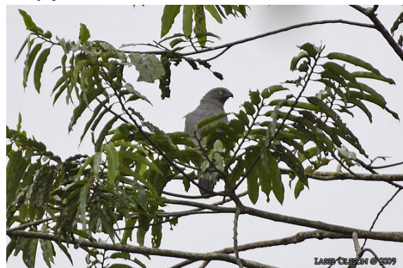
Crane Hawk ( Geranospiza caerulescens ) Folha Seca, Ubatuba 2009-01-04

New birds at Folha Seca – Brown Tinamou ( Crypturellus obsoletus ) – heard only, Tataupa Tinamou ( Crypturellus tataupa ), Crane Hawk ( Geranospiza caerulescens ), Blue-bellied Parrot ( Triclaria malachitacea ), Pale-browed Treehunter ( Cichlocolaptes leucophrus ), Rufous-capped Antthrush ( Formicarius colma ), Yellow-legged Thrush ( Platycichla flavipes ), White-necked Thrush ( Turdus albicollis ) and Azure-shouldered Tanager ( Thraupis cyanoptera ).