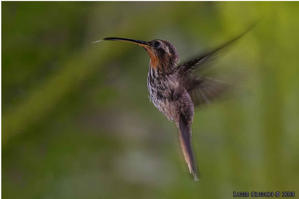
Saw-billed Hermit ( Ramphodon naevius ) – Serra dos Tucanos 2008-12-17