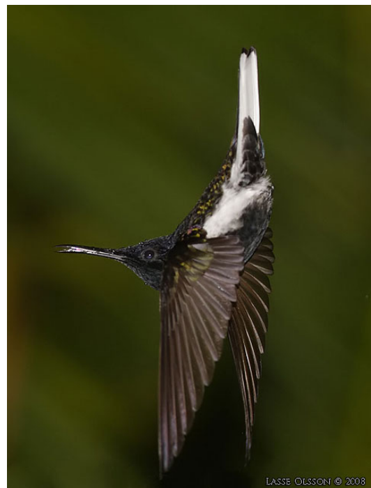
Black Jacobin ( Florisuga fuscus ) Serra dos Tucanos 2008-12-17

The commonest hummer throughout. Seen all days.