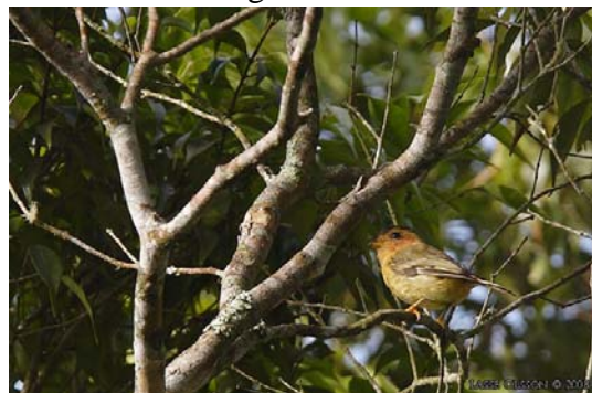
Black-capped Piprites ( Piprites pileata ) Três Picos Trail, PN Itatiaia 2008-12-31

Picked up in Angra dos Reis we had arranged transport to our next stay at Hotel do Ypé, a well-known upmarket hotel furthest up the road into Parque Nacional do Itatiaia. We got ourselves settled in one of the cabins, with absolutely magnificent views over the valley below. Weather wasn't still at its best, but there was at least some glimpses of clear sky inbetween the mist. My two sons had great times in the two different pools and I surely enjoyed myself all the way through five days at the location. The hotel grounds with connecting tracks and the feeders outside the hotel restaurant offered good birding and when walking outside I spent most time at Maromba Trail, formerly known as Jeep Track – permission can be obtained at the reception at Hotel do Ypé. The shortcut to Parque Hotel Itatiaia – previously known as Hotel Simon – which also can be described as the beginning of Três Picos Trail, was, together with the extension also good value and produced quite a few good species during the two mornings I was there.