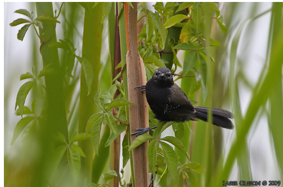
Paraná or Marsh Antwren ( Formicivora acutirostris ) – Biritiba Mirim 2009-01-08

Our last stop before São Paulo International Airport was at a small marsh not far from Biritiba Mirim and here we completed our list with species like Rufous-sided Crake ( Laterallus melanophaius ) and a group of White Woodpeckers ( Melanerpes candidus ) flying over, adding the last tic to a my Brazilian list for this time.