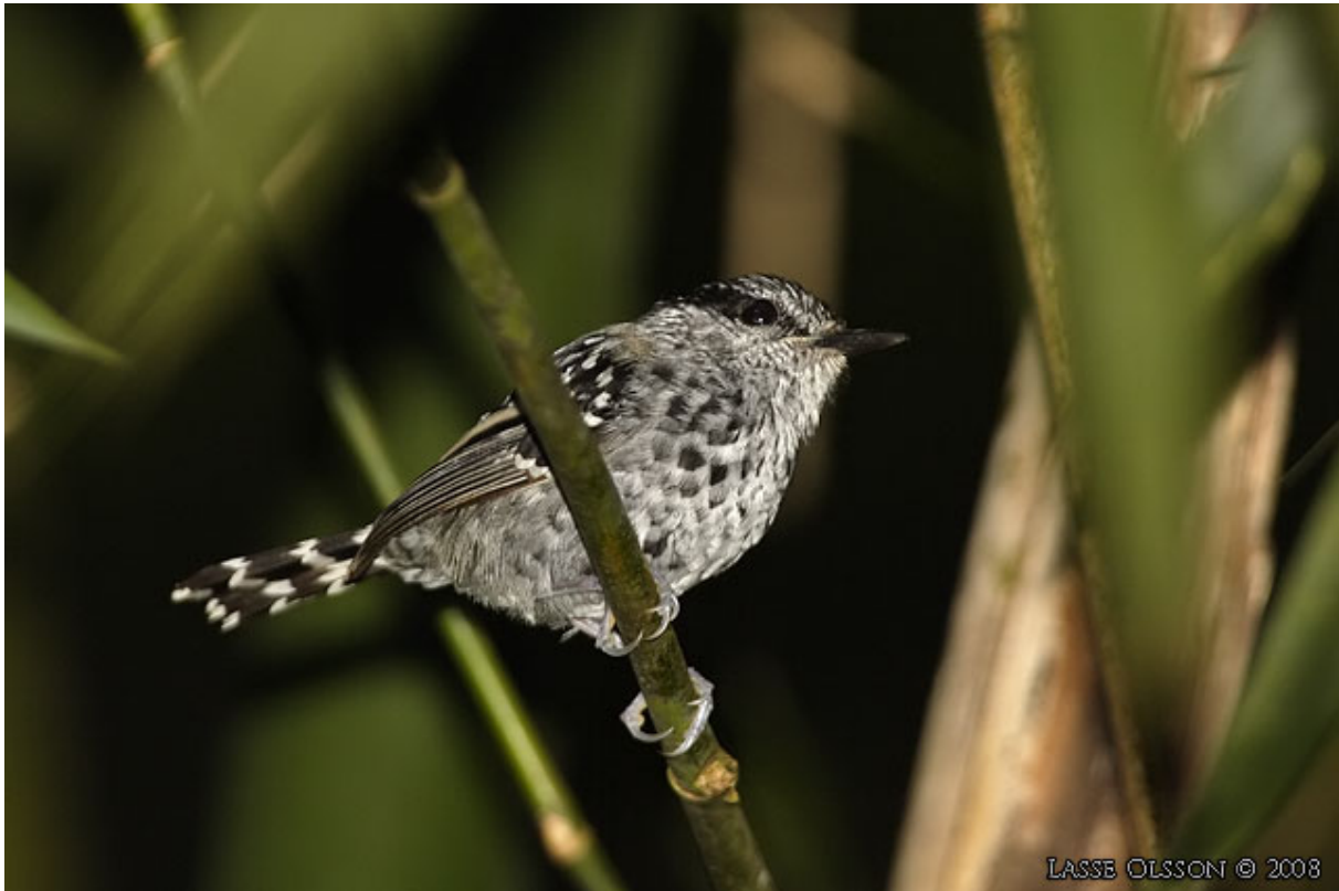
Scaled Antbird ( Drymophila squamata ) – Ilha Grande 2008-12-24

found when it comes to birding, especially around the top and before you reach the beach on the southern coast. Good sightings from seven days on the island are Mantled Hawk ( Leucopternis polionotus ), Red-browed Amazon ( Amazona rhodocorytha ), White-tailed Trogon ( Trogon viridis ), Yellow-browed Woodpecker ( Piculus aurulentus ), Ochre-collared Piculet ( Picumnus temminckii ), Red-ruffed Fruitcrow ( Pyroderus scutatus ), Scaled Antbird ( Drymophila squamata ), Unicolored Antwren ( Myrmotherula unicolor ), Southern Bristle-Tyrant ( Pogonotriccus eximius ), Greyish Mourner ( Rhytipterna simplex ), Long-billed Wren ( Thryothorus longirostris ) and Red-necked Tanager ( Tangara cyanocephala ).