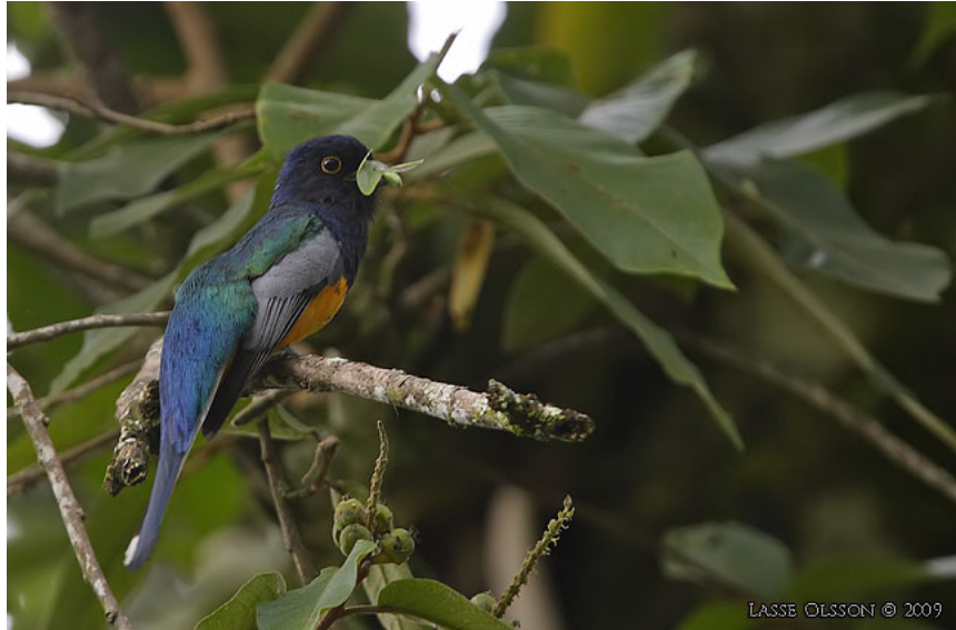
Surucua Trogon ( Trogon surrucura ) – Hotel do Ypé, PN Itatiaia 2009-01-01