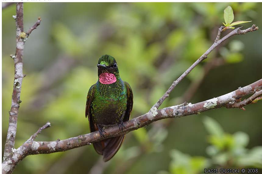
Brazilian Ruby ( Clytolaema rubricauda ) – Hotel do Ypé, PN Itatiaia 2009-01-01