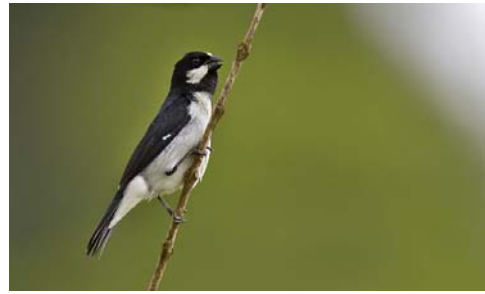
Lined Seedeater ( Sporophila lineola ) Salesopolis – Biritiba Mirim 2009-01-08