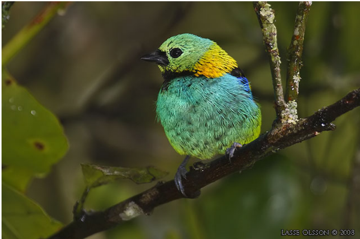
Green-headed Tanager ( Tangara seledon ) – Serra dos Tucanos 2008-12-17

Common Serra dos Tucanos, Itatiaia and Ubatuba