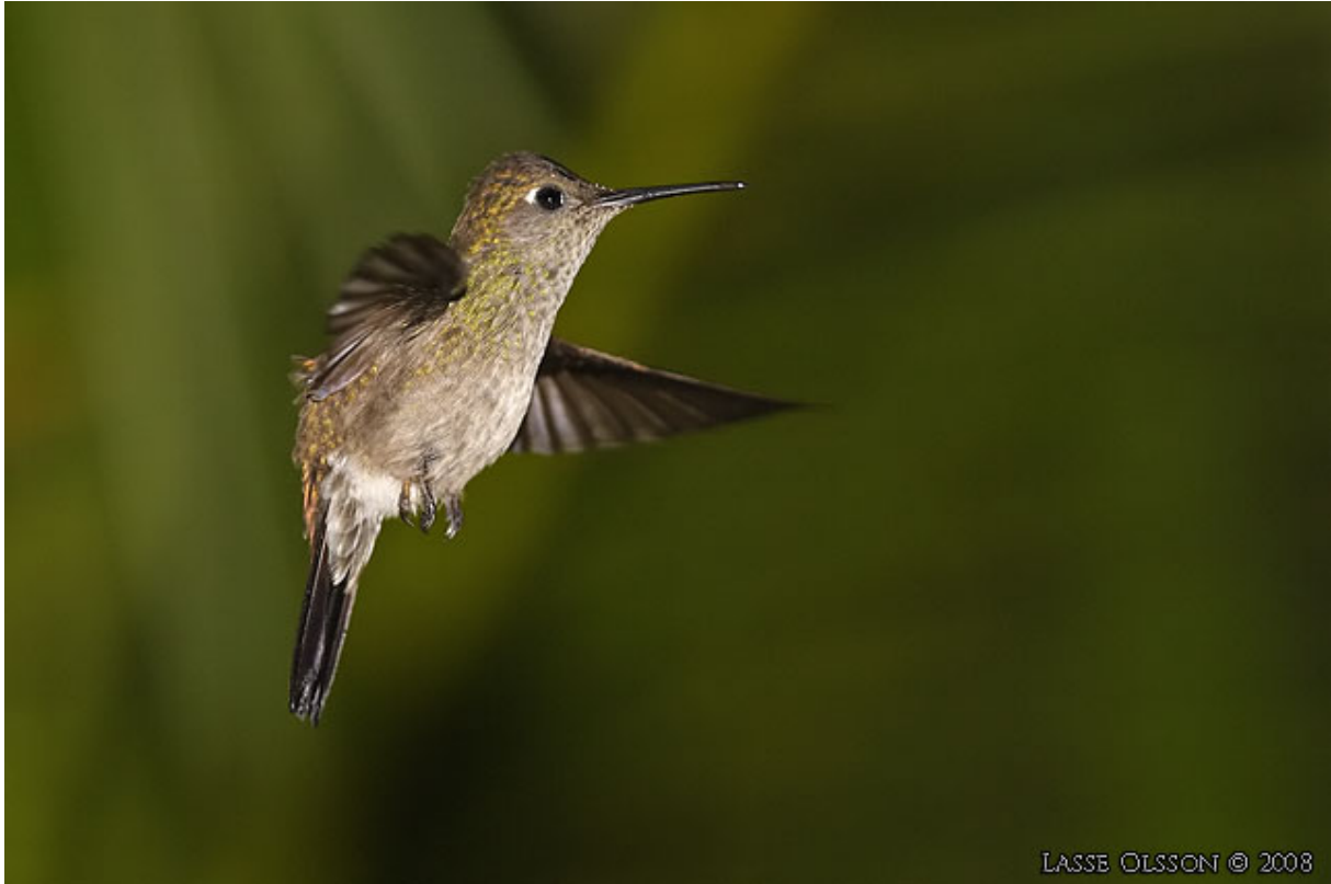
Sombre Hummingbird ( Aphantochroa cirrochloris ) – Serra dos Tucanos 2008-12-18

2 – 3 Folha Seca, Ubatuba and 1 – 2 Fazenda Angelim, Ubatuba