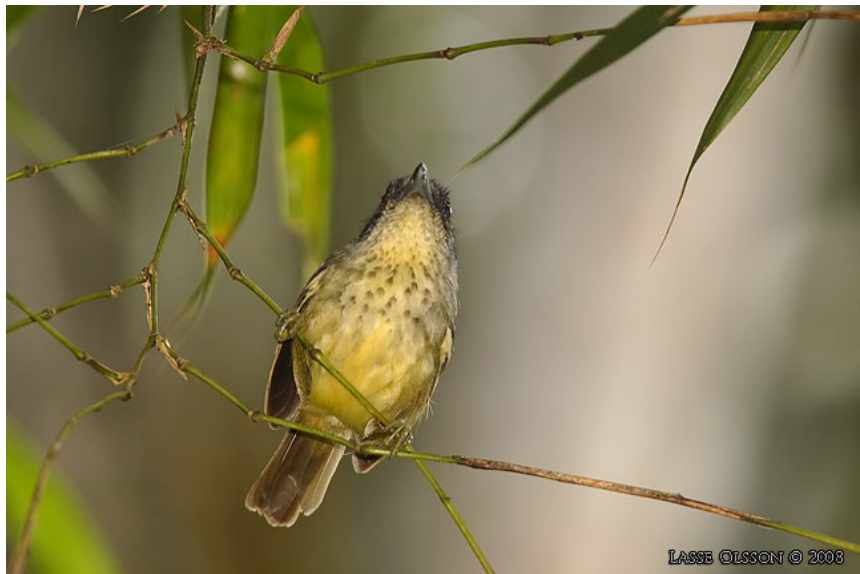
Spot-breasted Antwreio ( Dysithamnus stictothorax ) – Três Picos trail, PN Itatiaia 2008-12-30