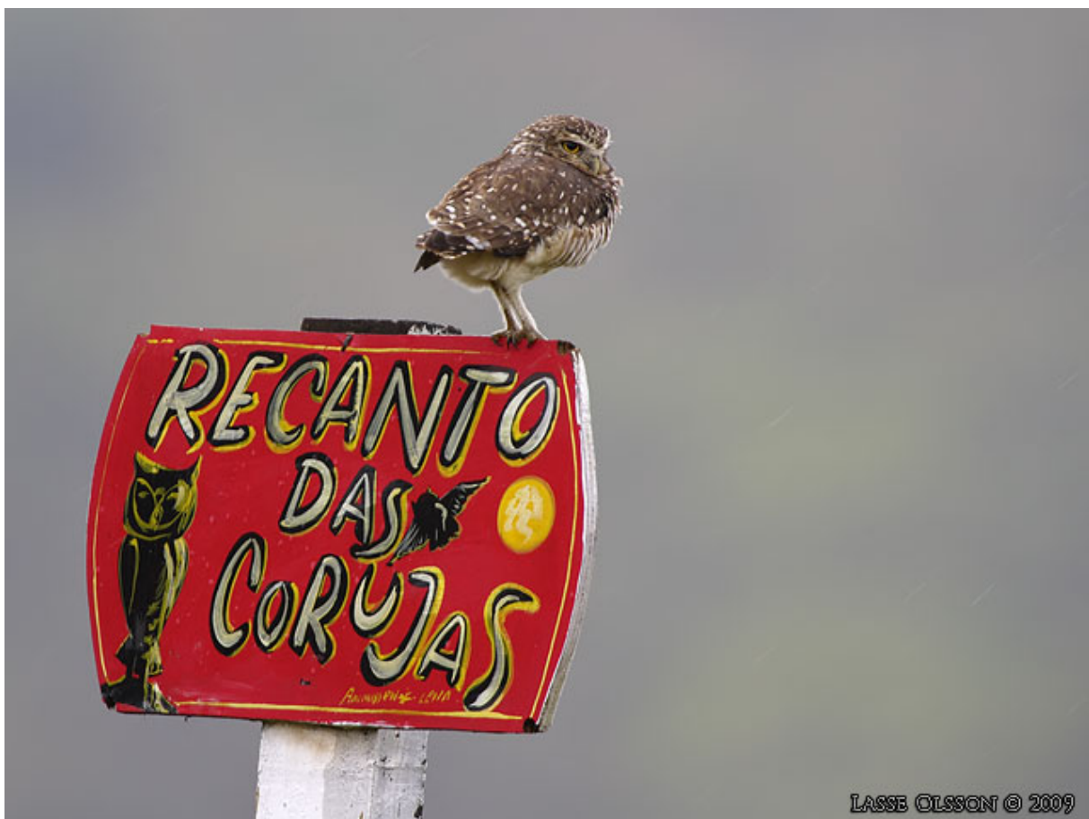
Burrowing Owl ( Athene cunicularia ) – Ubatuba 2009-01-05

The sign says “Roosting place for Owls” in Portuguese