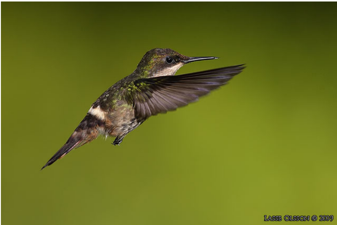
Festive Coquette ( Lophornis chalybeus ) – Folha Seca 2009-01-03

paulistus ), Fork-tailed Tody-Tyrant ( Hemitriccus furcatus ), Long-billed Gnatwren ( Ramphocaenus melanurus ) and Lemon-chested Greenlet ( Hylophilus thoracicus ) and Sooty Grassquit ( Tiaris fuliginosus ).