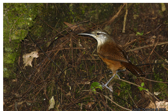
Long-billed Wren ( Thryothorus longirostris ) Ilha Grande 2008-12-25

After some urban days in Rio de Janeiro our trip proceeded to the green and relaxed island of Ilha Grande. Former prison island and lepra colony it has become a tourist magnet over the last couple of years. The atmosphere is laid-back and still there are no roads on the island, only a barely drivable dirt road that leads across the island. Though, there are numerous tracks connecting the different parts of the island, but as it is rugged and temperature rise quickly after a cool morning it demands plenty of water and birding stops along the way. The mentioned dirt road between Abraão and Praia dos Rios is by far the best place I