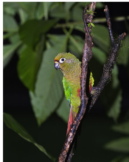
Maroon-bellied Parakeet ( Pyrrhura frontalis ) Serra dos Tucanos 2008-12-17