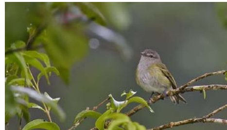
Grey-capped Tyrannulet ( Phyllomyias griseocapilla ) PN Itatiaia – 2009-01-01