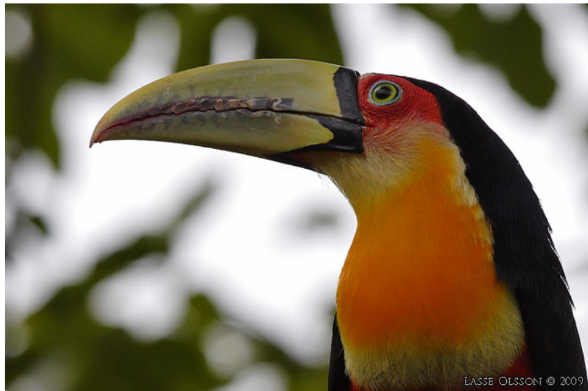
Red-breasted Toucan ( Ramphastos dicolorus ) – Hotel do Ypé 2009-01-02