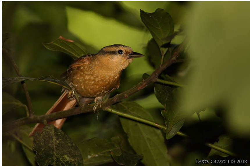
Buff-fronted Foliage-gleaner ( Philydor rufum ) – Ilha Grande 2008-12-26

1 – 3 at Serra dos Orgaos, Ilha Grande and PN Itatiaia