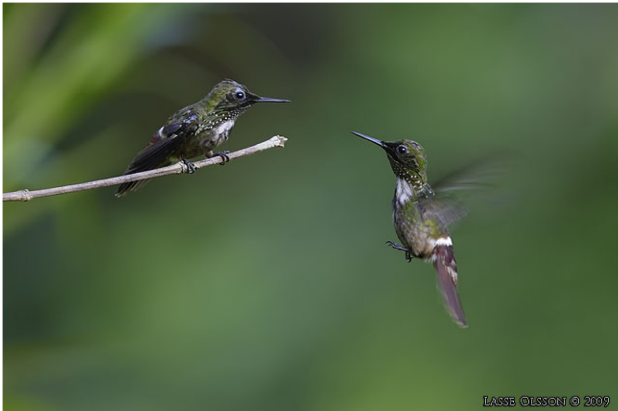
Festive Coquette ( Lophornis chalybeus ) – Folha Seca, Ubatuba 2009-01-04