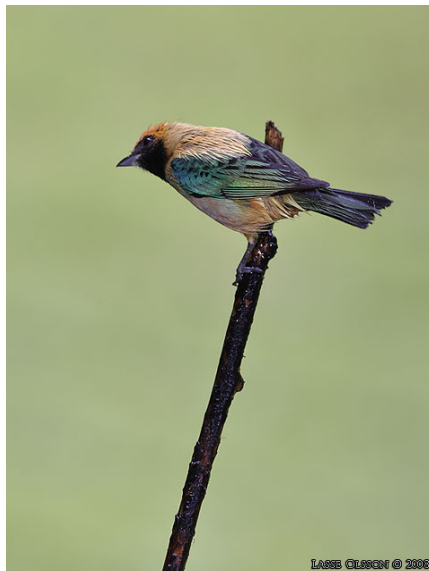
Burnished-buff Tanager ( Tangara cayana ) Serra dos Tucanos 2008-12-17

5 – 10 Serra dos Tucanos and 1 Hotel do Ypé, PN Itatiaia