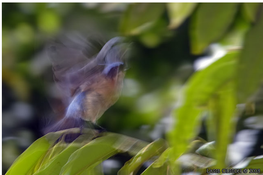
Fawn-breasted Tanager ( Pipraeidea melanonota ) - Três Picos trail, PN Itatiaia 2008-12-31