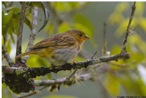
Saffron Finch ( Sicalis flaveola ) Serra dos Tucanos 2008-12-18

Not uncommon Serra dos Tucanos and Ubatuba