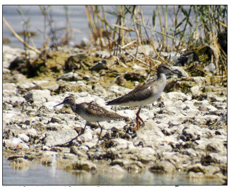
Wood Sandpiper and Common Redshank Vransko lake 11th July.