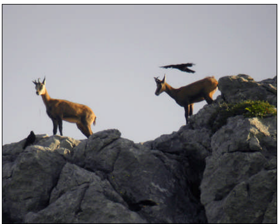
Chamois Biokovo nature park 7<sup>th</sup> July.