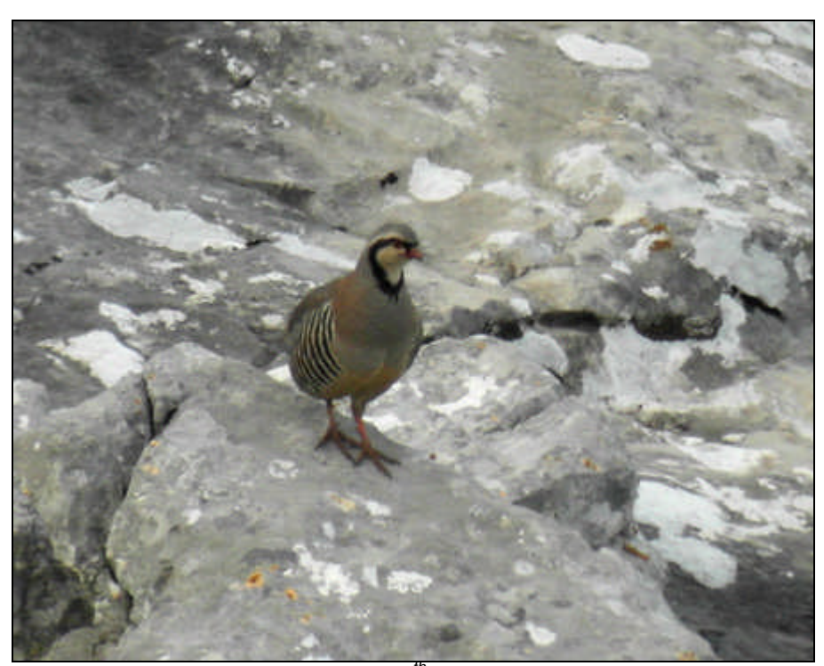
Rock Partridge, Biokovo nature park 7<sup>th</sup> July.