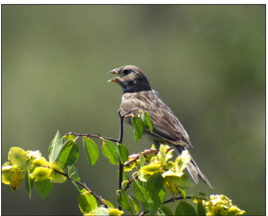
Corn Bunting Vransko lake 11th July.