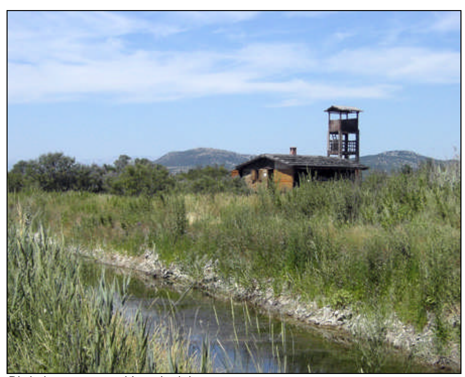
Bird observatory at Vransko lake.