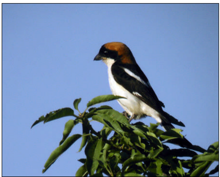
Male Woodchat Shrike Vrsine 9<sup>th</sup> July.