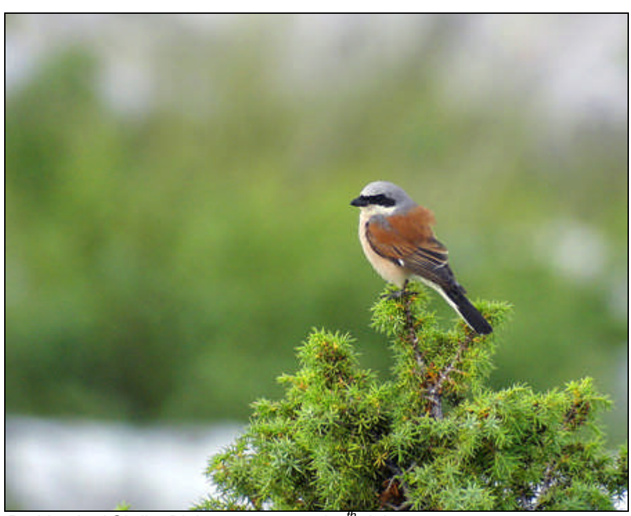
Red-backed Shrike Biokovo nature park 7<sup>th</sup> July.

66. Woodchat Shrike Rödhuvad törnskata Lanius senator 3 ad + 2 juv Vrsine 9<sup>th</sup>, and 1 ad male Labin (Dalmatia) 9<sup>th</sup>.