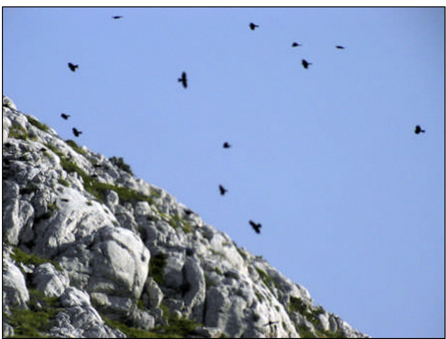
Alpine Choughs Biokovo nature park 7<sup>th</sup> July.