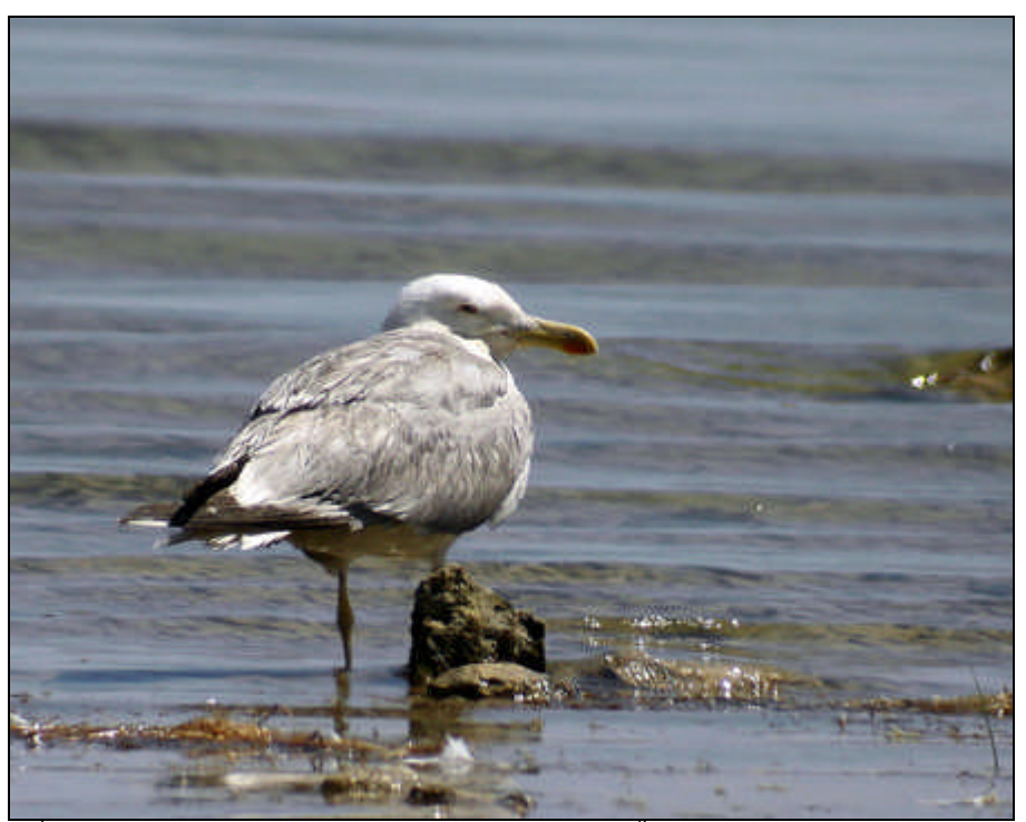
3<sup>rd</sup> summer Yellow-legged Gull Vransko lake 11<sup>th</sup> July.