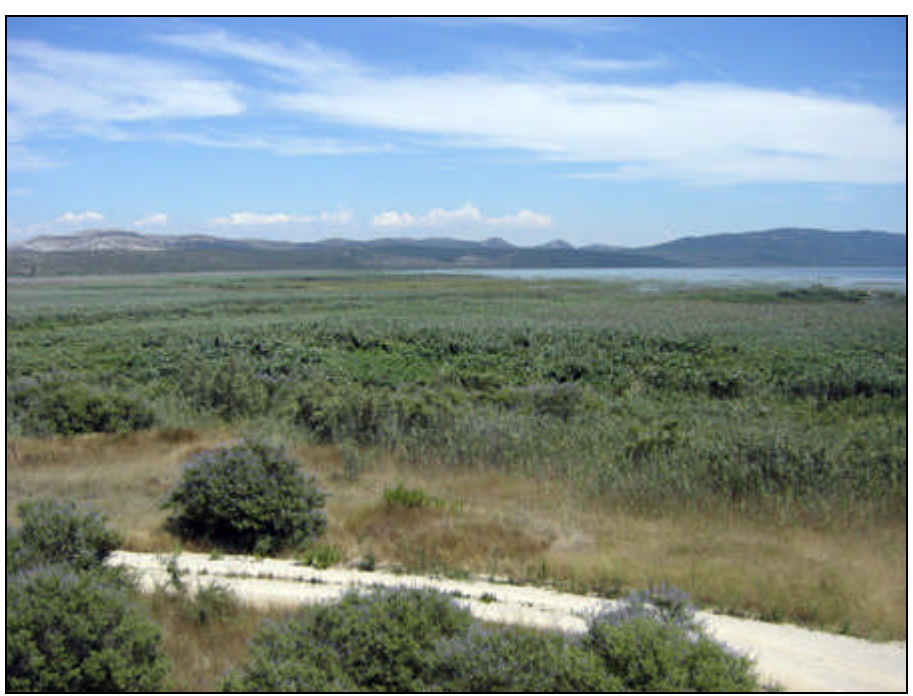
View of NE corner of Vransko lake.