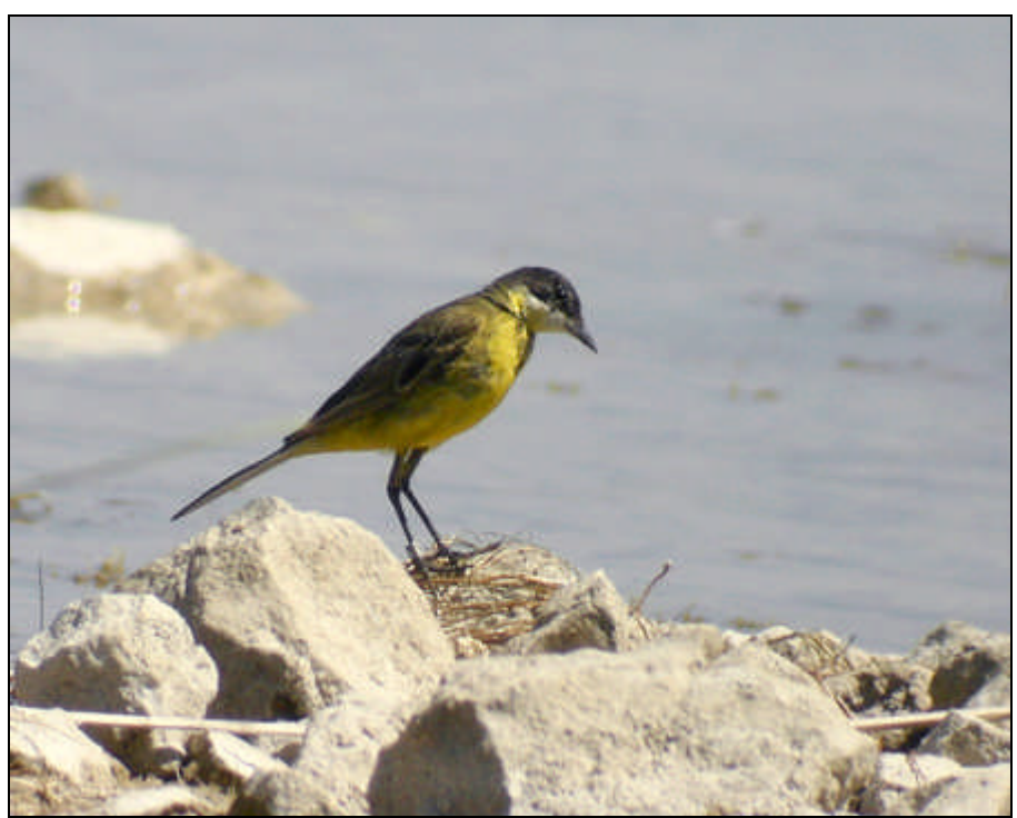
Male Yellow Wagtail subsp. feldegg Vransko lake 11th July.