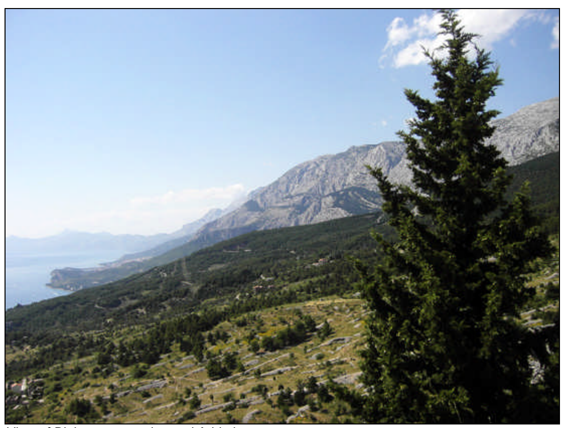
View of Biokovo mountains and Adriatic sea.

5<sup>th</sup> - 12<sup>th</sup> July 2008