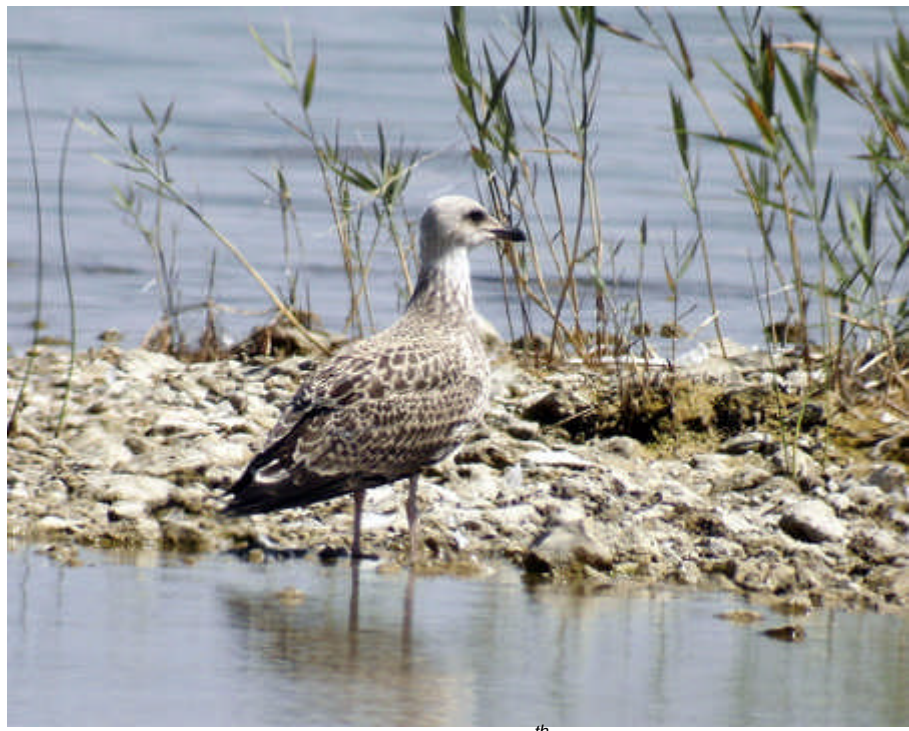
Juvenile Yellow-legged Gull Vransko lake 11th July.