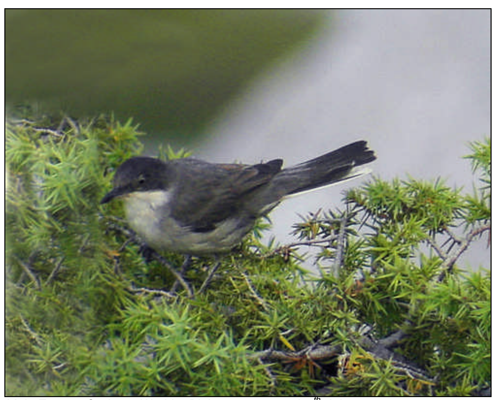
Male Eastern Orphean Warbler Biokovo nature park 7<sup>th</sup> July.