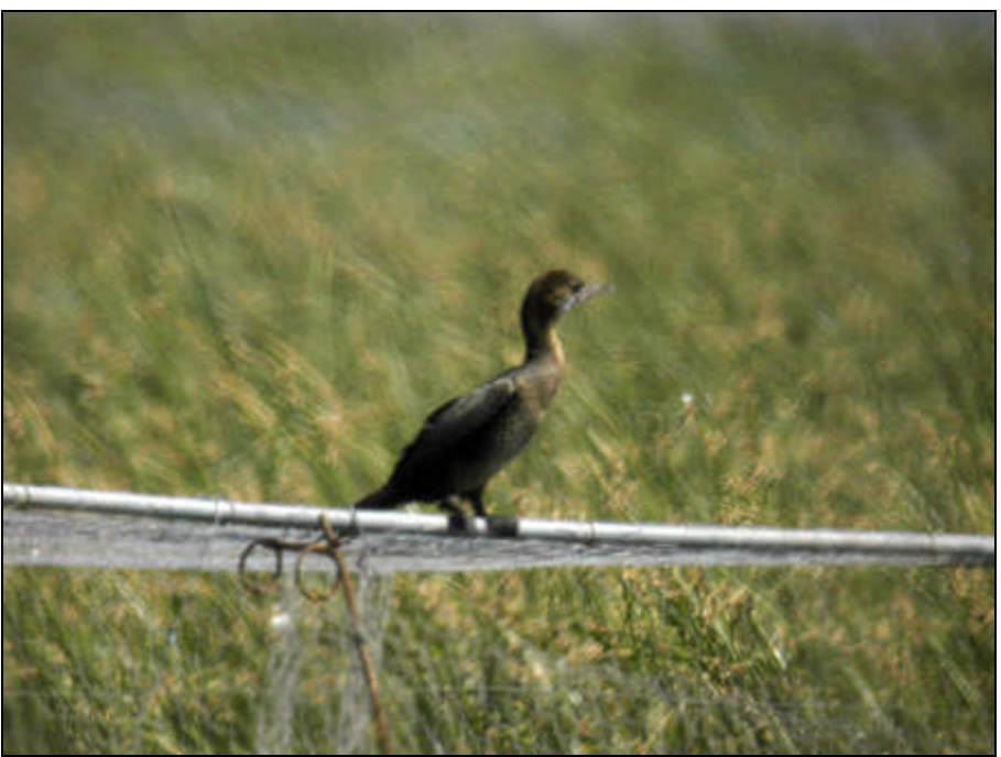
Little Cormorant at Vransko lake 11th July.