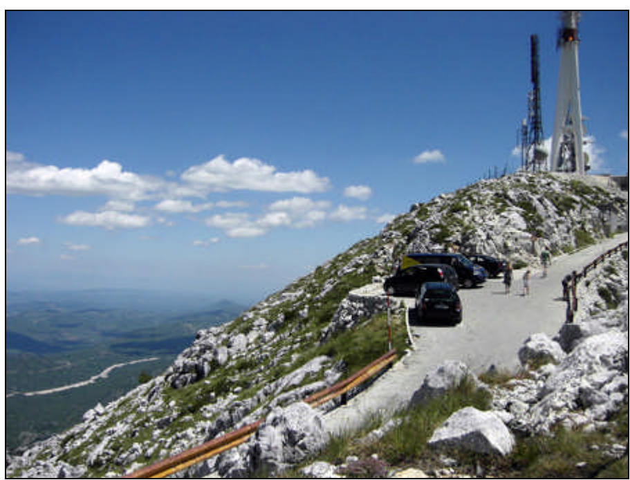
Sveti Jure, highest peak of Biokovo mountains, 1762 m asl.