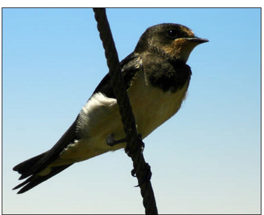
Juvenile Barn Swallow Vransko lake 11th July.