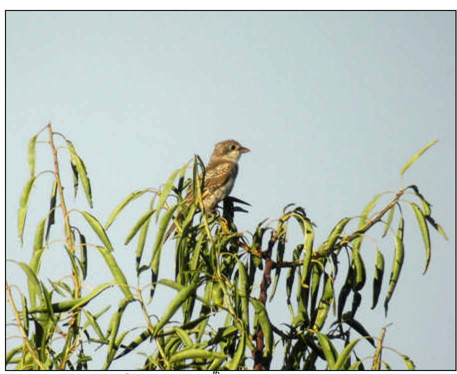
Juvenile Woodchat Shrike Vrsine 9<sup>th</sup> July.