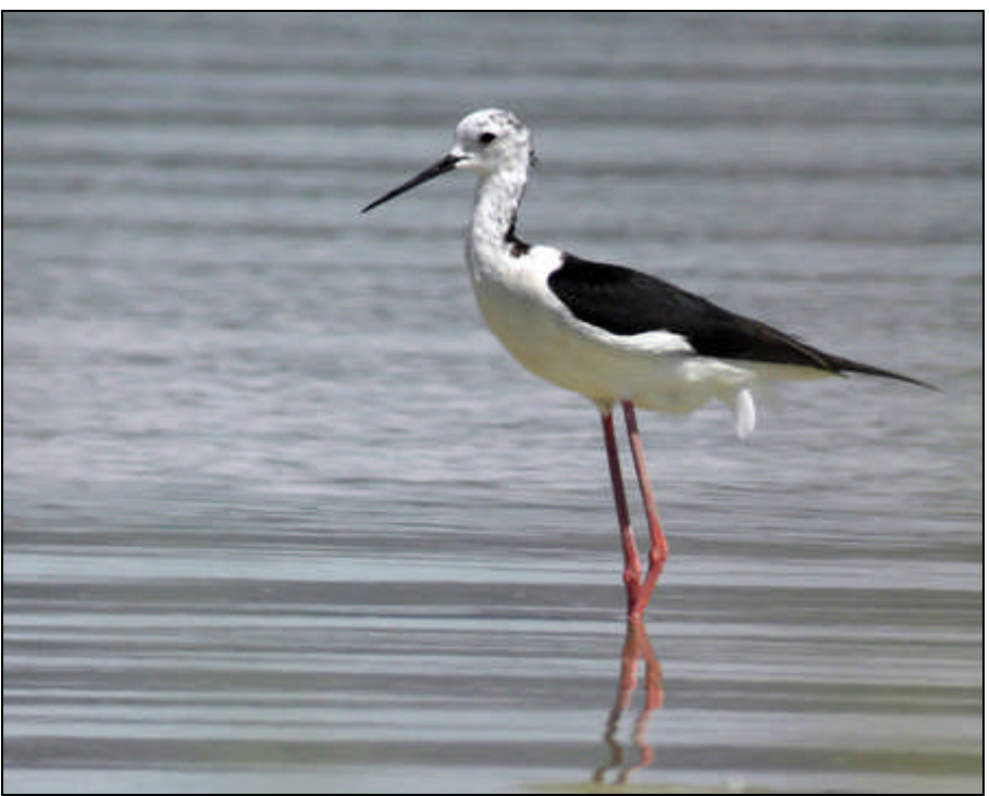
Black-winged Stilt Vransko lake 11th July.