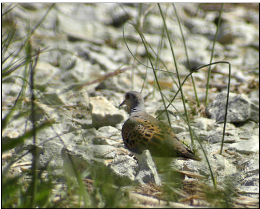
Eurasian Turtle Dove Vransko lake 11th July.