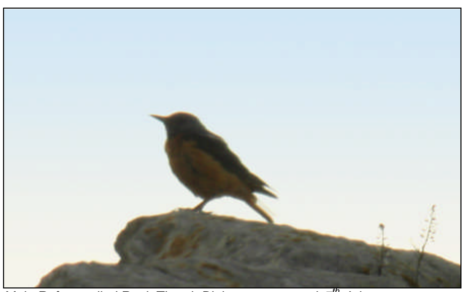
Male Rufous-tailed Rock Thrush Biokovo nature park 7<sup>th</sup> July.