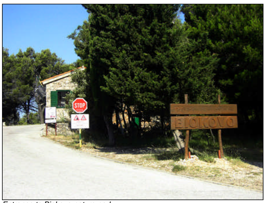
Entrance to Biokovo nature park.

Black-eared Wheatear 1 male Blackcap 2 singing Coal Tit 5 Common Chaffinch 2