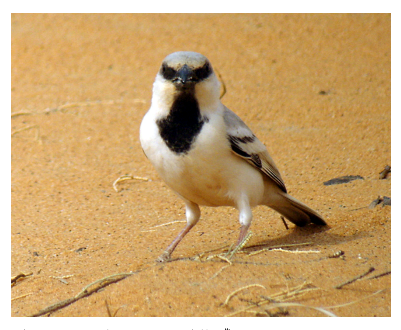
Male Desert Sparrow Auberge Yasmina, Erg Chebbi 11<sup>th</sup> April.

6<sup>th</sup> - 13<sup>th</sup> April 2006