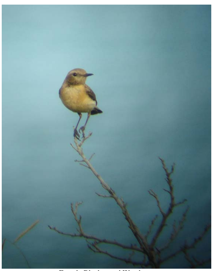
Female Black-eared Weathear.