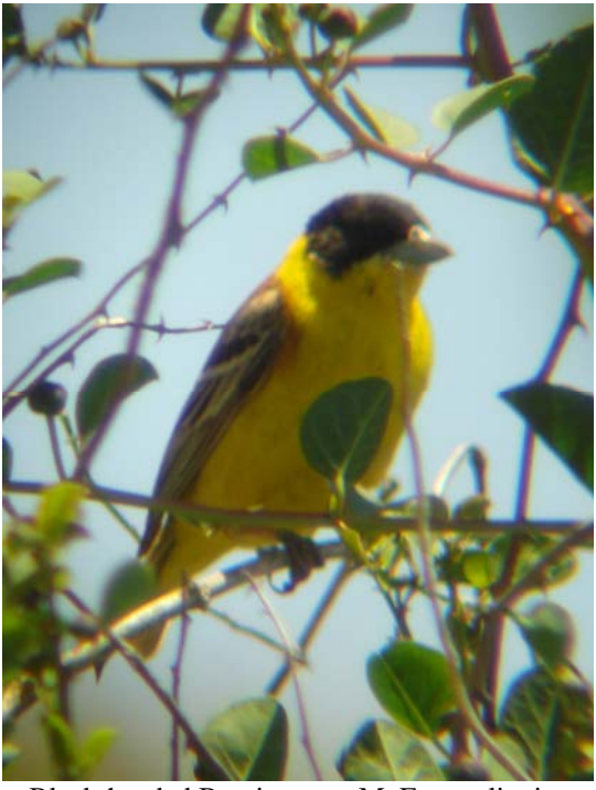
Black-headed Bunting near M. Evangelistrias along the road between Pagondas and Spatherei.

Ireo did not provide any interesting bird observations. From Ireo we headed towards Pagondas and then up into the mountains towards Spatharei. I strongly recommend this route. Along it we saw the first Alpine Swifts (Alpseglare) of the trip, maybe 15 of them. We also saw one Cretzschmar's Buntings (Rostsparv), one Black-eared Wheatear (Medelhavsstenskvätta) and one Blue Rock Thrush (Blåtrast). One Long-legged Buzzard (Örnvråk) was hanging in the wind in a beautiful valley where we also saw 2 Ortolan Buntings (Ortolanspary). Close to M. Evangelistrias just after the view opens up towards the coast and the little islet Samiopula we stopped after seeing something very yellow flying over the road in front of us. It turned out to be a Black-headed Bunting (Svarthuvad spary). At this spot there were several of them singing. They were seen very well, sometimes even from just a couple of meters distance. It was such a nice experience! It may be worth a stop here even another year, since in seemed to be a breeding site. The view from here is magnificent. While admiring the landscape we spotted something flying among the shrubs and boulder further down in the slope. It turned out to be a pair of Rüppell's Warblers (Svarthakad sångare), one of the target species for the trip! They had there nest in the slope just 30 meters below us and especially the male was seen very well.