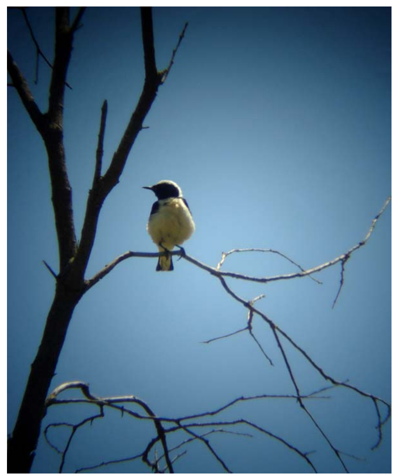
Black-eared Wheatear of the race melanoleuca. This one of the black-throated morph.

As the day before, and all other days for that matter, several Fan-tailed Warblers (Grässångare) and many Crested Larks (Tofslärka) were heard and seen, but other than that not much more worth mentioning. Fan-tailed Warblers are common all over the island and are heard wherever there is a suitable habitat; often open dry grassy areas. Also the Crested Larks are very common, maybe one of the most common birds. At the time of our visit they were singing intensely and their song is actually quite beautiful compared to their otherwise slightly sad and lonely call.