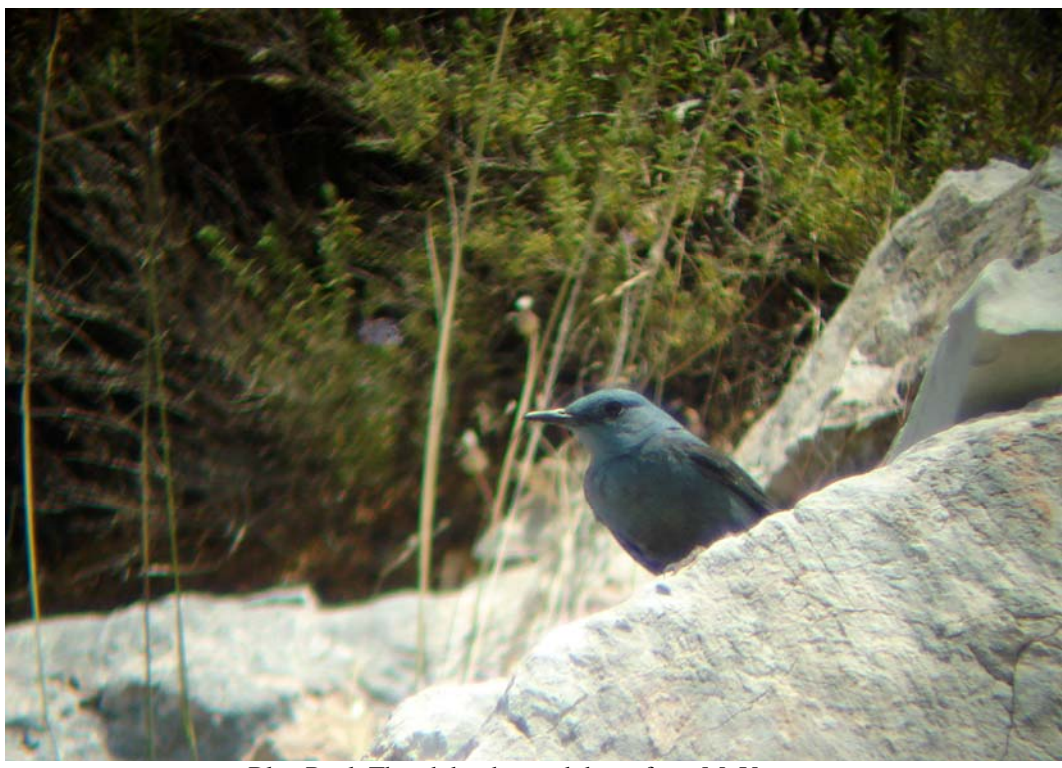
Blue Rock Thrush by the road down from M. Vronta.

the road we spotted an adult Eleonora's Falcon (Eleonorafalk). We stopped and could watch the bird at close distance when it flew past us. The bird was a light phase, actually the first of that phase for us ever. Fantastic! We past Kokkari and then took the mountain road up towards the monastery Vronta. The road up there was very beautiful. We saw a couple of Turtle Doves (Turturduva) on the way and from the parking by the monastery we saw one female Blue Rock Thrush (Blåtrast) briefly. At these higher elevations it is worth paying some extra attention to these birds since it is possible to find Rock Thrushes (Stentrast) on this island, although they are not common. We walked around the monastery and the atmosphere around it was special. The landscape and the calmness were very soothing. Behind the monastery a couple of Cretzschmar's Buntings (Rostsparv) were singing their delicate song. On the roof of the Monastery a pair of Black-eared Wheatears (melanoleuca, black-throated) was jumping around. We took a short stroll around the monastery and saw one male Black-eared Wheatear of the light-throated morph and higher up in the mountain a Long-legged Buzzard (Örnvråk) landed. On the way down from M. Vronta we found one male Blue Rock Thrush that we could study at close range and even take some photos of (see below).