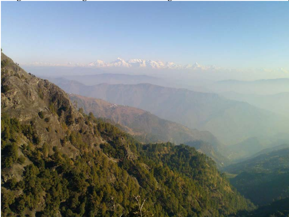
View towards Nepal from Vainik near Naini Tal

Naini Tal is situated in the Himalayan foothills, not far away from Corbett. It is frequently visited by birders and gives access to higher altitudes where e.g. Cheer Pheasant can be seen by those being lucky.