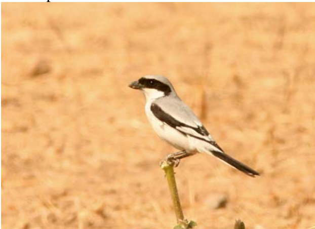
Southern Grey Shrike

One between Agra and Bharatpur, rather common around Ranthambore and between Ranthambore and Jaipur.