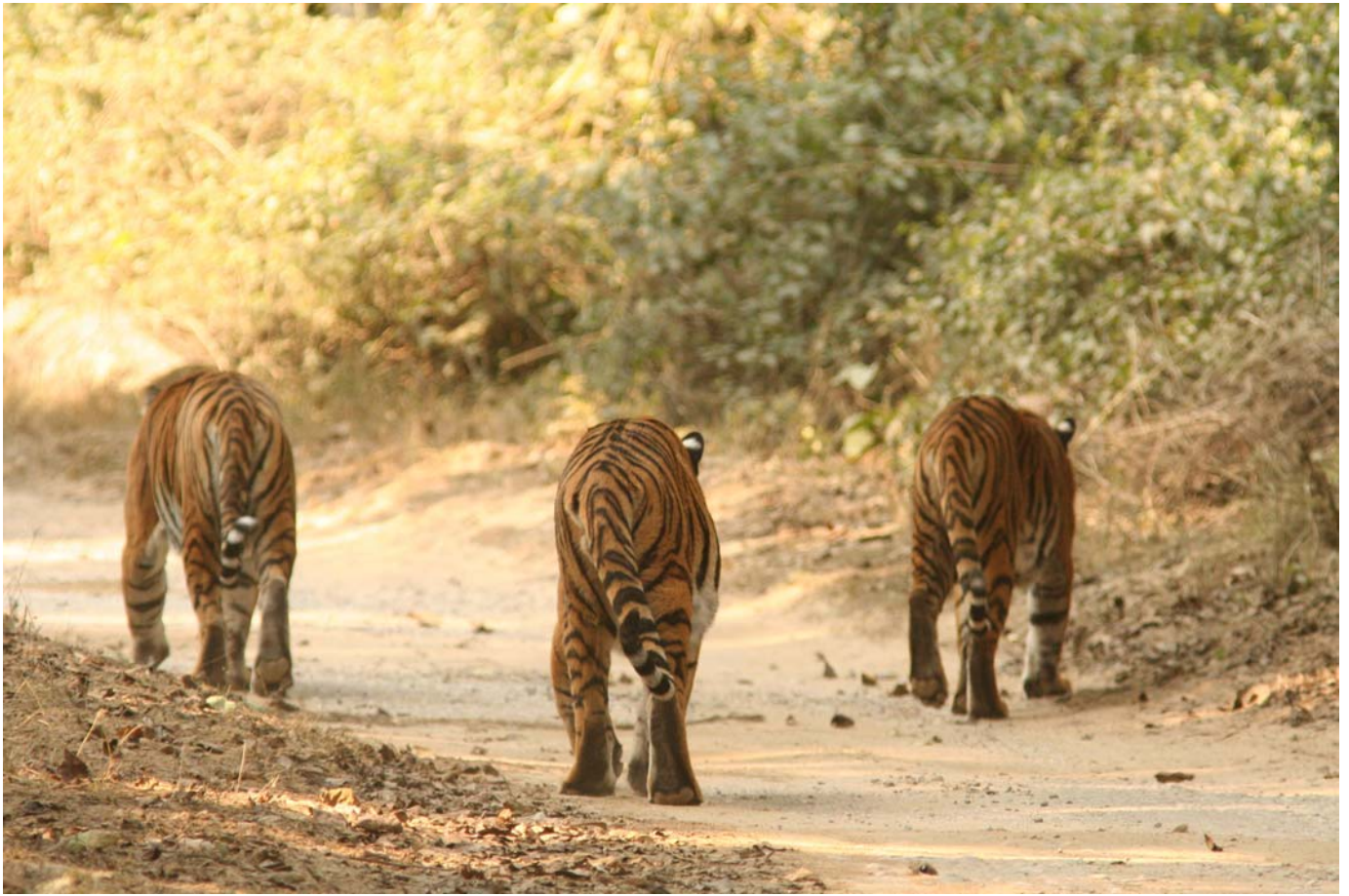
The proud Tigers at Corbett