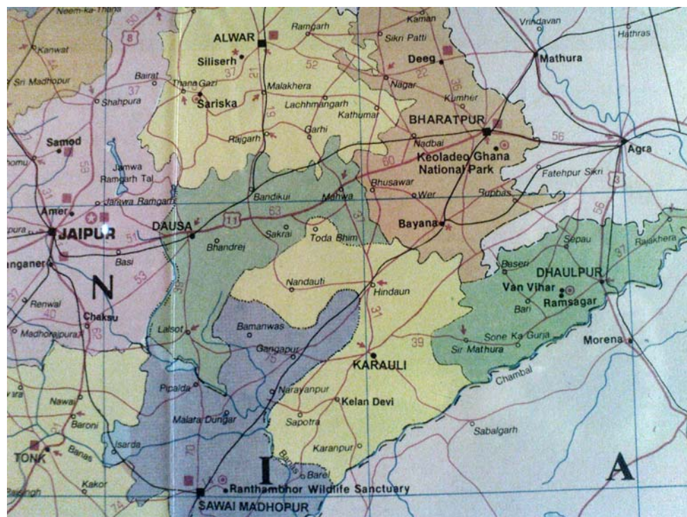
Map of some areas visited, e.g. Agra, Fatehpur Sikri, Keoladeo Ghana, Ranthambore and Jaipur.