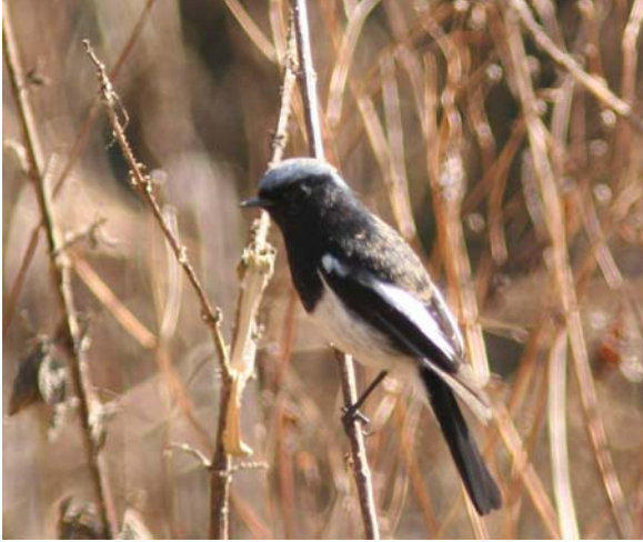
Blue-capped Redstart, try spotting the red ;-)

10-15 at Naini Tal and three at Vinaik near Naini Tal.