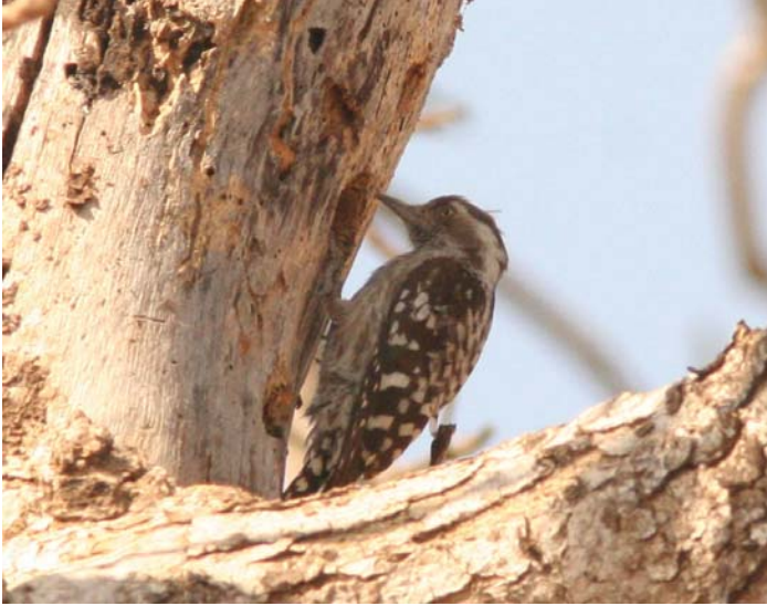
Indian Pygmy Woodpecker

One pair near Tiger Moon Resort at Ranthambore. Split from Brown-capped/moluccensis.