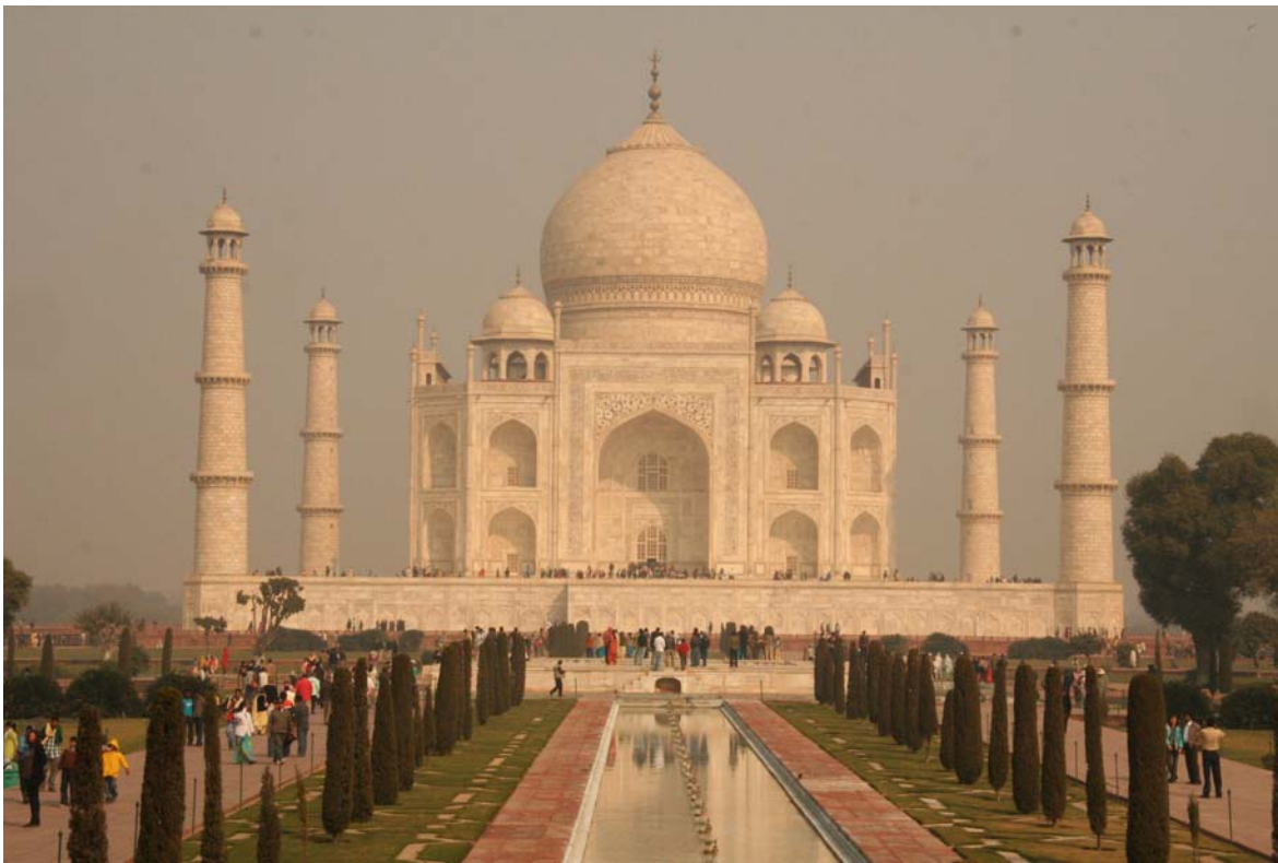
Taj Mahal, really a must see