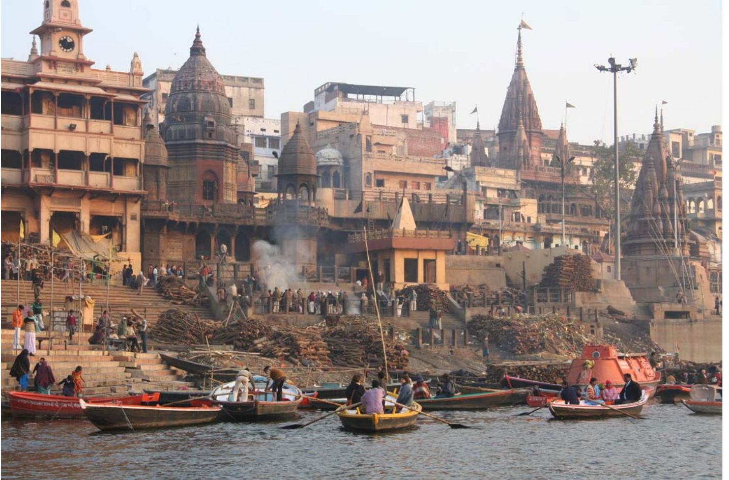
The largest cremation site in Varanasi