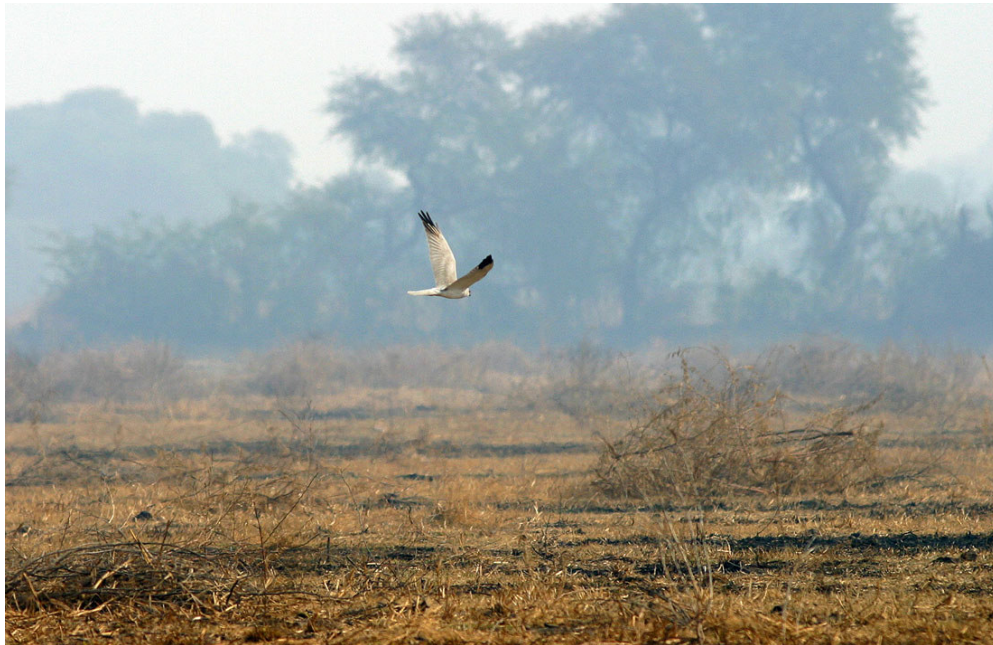
Pallid Harrier, Bharatpur, February 2008.

Little Stint Calidris minuta Temminck's Stint Calidris temminckii Ruff Philomachus pugnax Bronze-winged Jacana Metopidius indicus 10 N Chambal 1.2. Great Thick-knee Esacus recurvirostris 5 Chambal 1.2. Black-winged Stilt Himantopus himantopus Little Ringed Plover Charadrius dubius Kentish Plover Charadrius alexandrinus Yellow-wattled Lapwing Vanellus malabaricus River Lapwing Vanellus duvaucelii Red-wattled Lapwing Vanellus indicus White-tailed Lapwing Vanellus leucurus 5 N Chambal 1.2, 4 Bharatpur 4.2, 1 Okhla 7.2. Indian Courser Cursorius coromandelicus 15 Bharatpur 4.2. Indian Skimmer Rynchops albigollis 15 Chambal 1.2. Caspian/Steppe Gull Larus cachinnans/barabensis 15 Okhla 7.2.