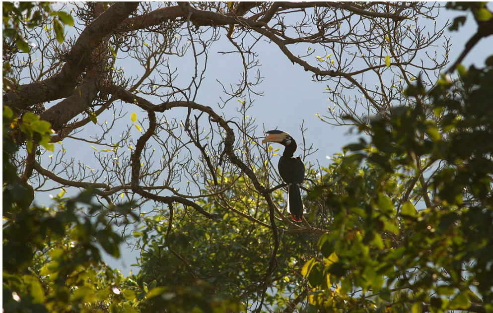
Malabar Pied Hornbill, Bandhavgarh, January 2008.

Indian Grey Hornbill Ocyrceros birostris