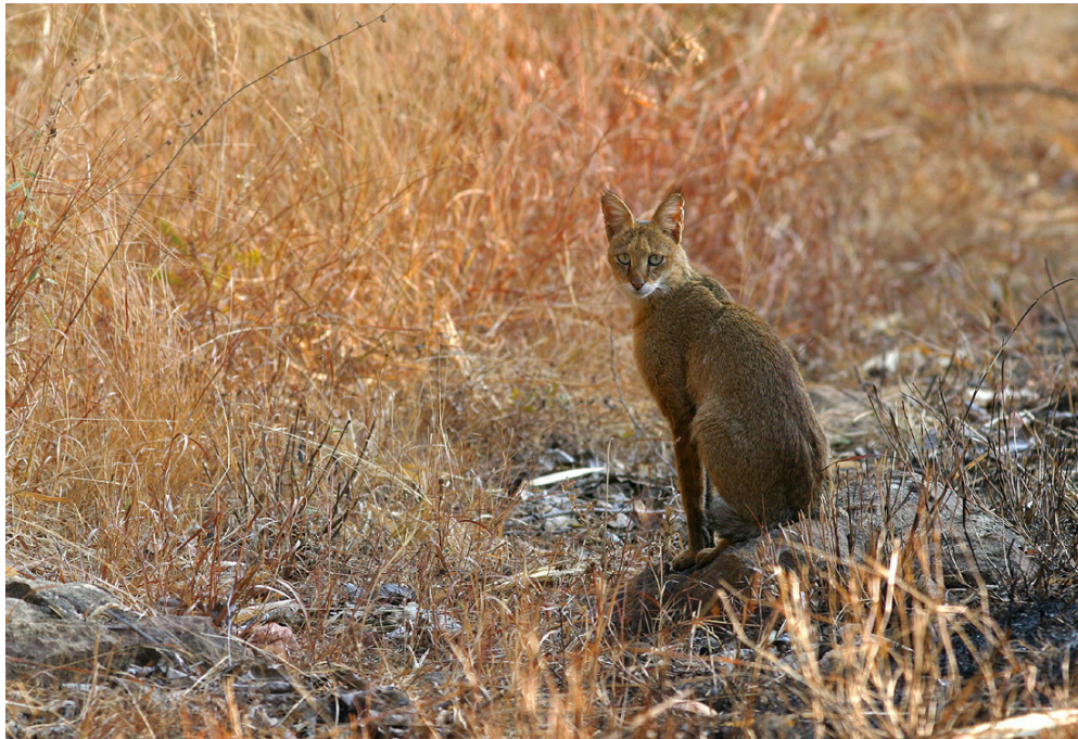
Jungle Cat, Bandhavgarh, January 2008. Copyright: Måns Grundsten.