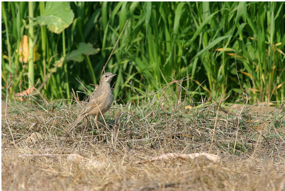
Long-billed Pipit, North of Chambal, February 2008.

Woolly-necked Stork Ciconia episcopus 10 e.r. Katni 27.1, 3 N Chambal 1.2, 1 Okhla 7.2. Black-necked Stork Ephippiorhynchus asiaticus 1f N Chambal 1.2, 1 Chambal River 1.2, 2 Bharatpur 3.2. Lesser Adjutant Leptoptilos javanicus 1 Bandhavgarh 29.1. Isabelline Shrike Larus isabellinus isabellinus 1 N Chambal 1.2, 1 Chambal 2.2, 2 Bharatpur 4.2, 1 Okhla 7.2. Brown Shrike Lanius cristatus 1 2y Tala 28-30.1, 1 ad Bandhavgarh 29.1. Bay-backed Shrike Lanius vittatus Long-tailed Shrike Lanius schach caniceps Southern Grey Shrike Lanius meridionalis lathora 1 ad Chambal 1.2, 2 ad Bharatpur 4.2. Rufous Treepie Dendrocitta vagabunda House Crow Corvus splendens Large-billed Crow Corvus macrorhynchos Black-hooded Oriole Oriolus xanthornus 2m Bandhavgarh 28.1. Large Cuckoo-shrike Coracina macei Small Minivet Pericrocotus cinnamomeus White-browed Fantail Rhipidura aureola