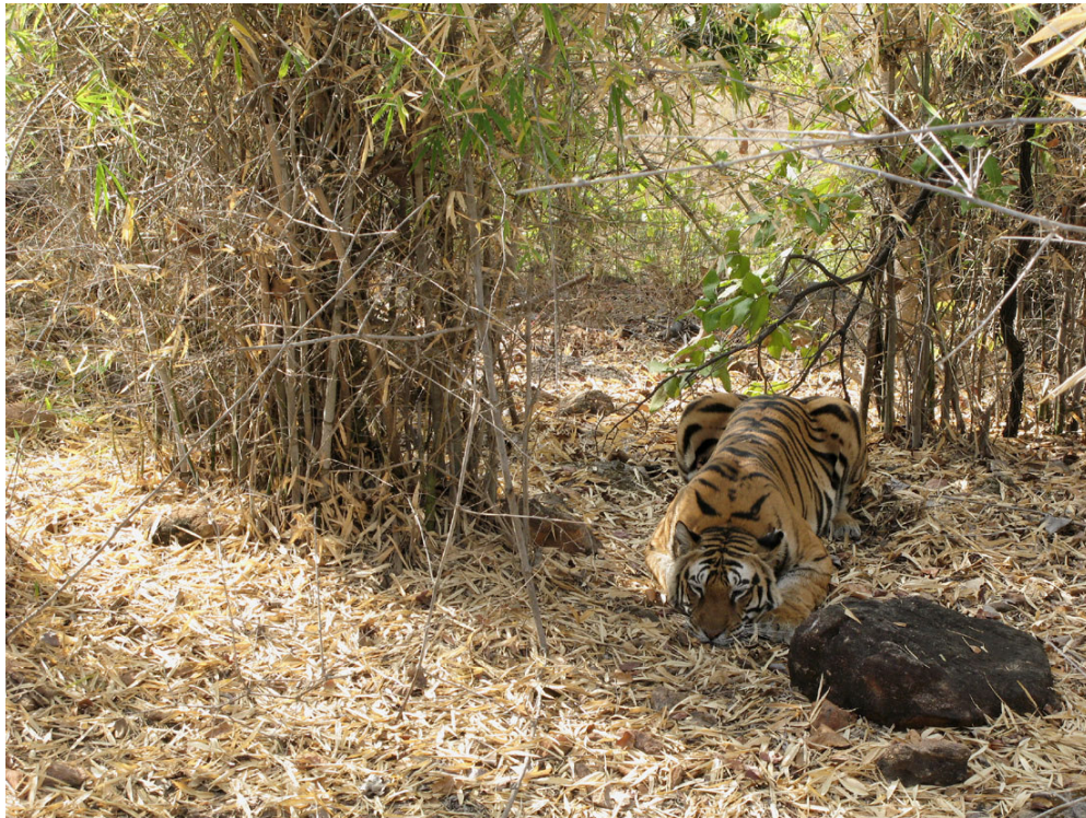
Tigress at rest, Bandhavgarh, January 2008.

Among other animals seen we had a fantastic sighting of a roadside Jungle Cat, also many Spotted Deers, Wild Boars, a few Sambar Deers and a single Indian Hare (the guide was thrilled when I found the hare, he had been a guide in Bandhavgarh for 13 years and this was his second sighting of Indian Hare, I thought just a hare...) Each safari costs 2850 r/2 persons (including entrance fee, vehicle with driver and guide).