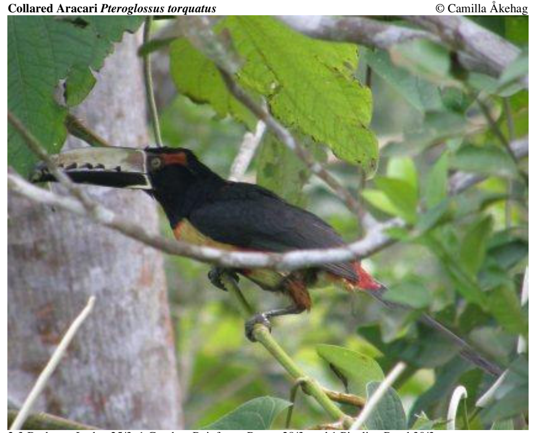
2-3 Burbayar Lodge 25/3, 1 Gamboa Rainforest Resort 28/3, and 1 Pipeline Road 30/3. Ssp: torquatus

Ssp: caeruleogularis. It has been suggested present species could be split into several new species, but this is not widely accepted. Chiriquí birds, if split, would become Blue-throated (Emerald) Toucanet.