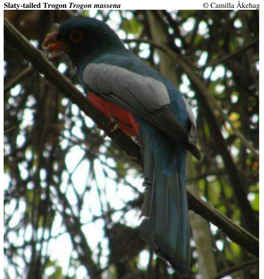
1 Pipeline Road 30/3, 2 Summit Ponds 30/3, 1 Parque Nacional Metropolitano 1/4, and 1 Plantation Road 7/4. Ssp: hoffmanni

Breeds from Mexico to Panamá, Colombia and western Ecuador.