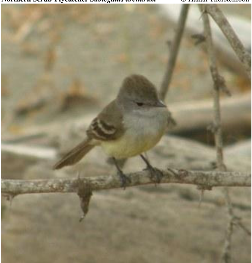
1 Isla Culebra 1/4, and 1 Diablo mangroves 6/4. Ssp: arenarum . Split from S.modestus .