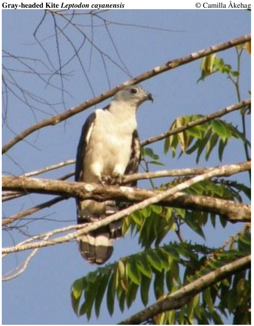
1 Gamboa Rainforest Resort 28/3.