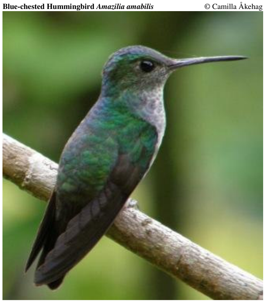
4-5 daily at Burbayar Lodge 24-26/3 Monotypic.

1 Altos de Cerro Azul entrance 27/3, 2-3Pipeline Road 30/3 and 3-4 Mi Jardin es su Jardin, Boquete 3/4. Ssp: tzacatl