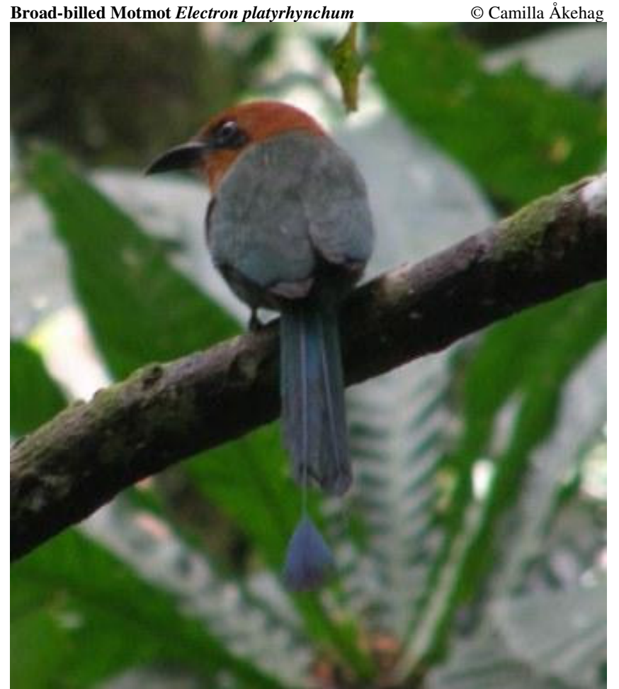
1 Burbayar Lodge 24-25/3, 1 Pipeline Road 30/3, and 2 Plantation Road 7/4. Ssp: minus