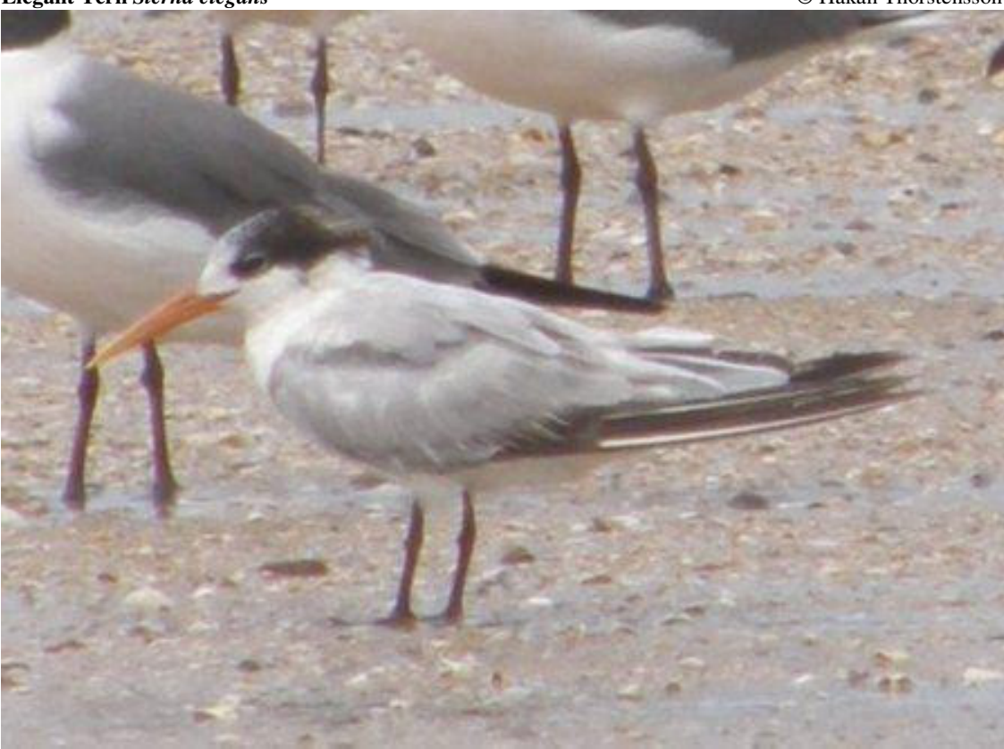
1 Playa Veracruz 10/4. Monotypic. Rare visitor.