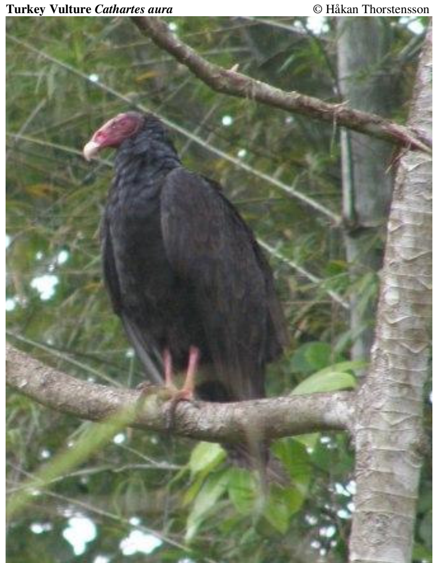
Observed every day, though not nearly as common as preceding species. Ssp: probably ruficollis .