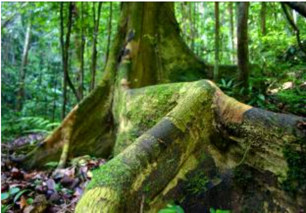
Buttress root on Mt. Kanlaon, Negros

Back in Bacolod in the evening, we went out for a nice meal at a restaurant.