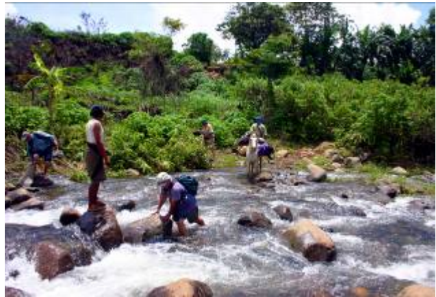
The hike has started