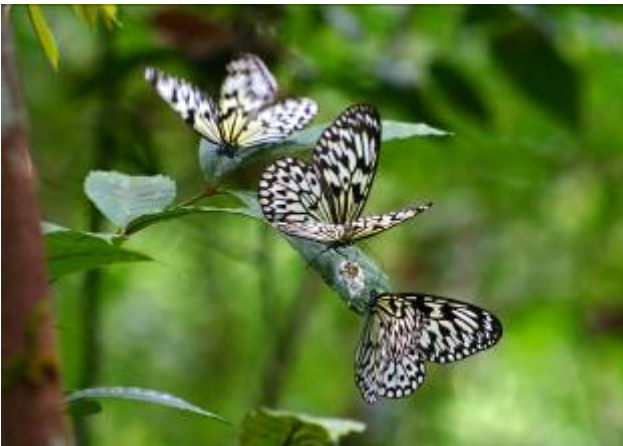
Butterflies in the lowland jungle of Mindanao

A harsh scream from a flying parrot through the canopy woke our interest. It landed, and turned out to be the now very rare and difficult Blue-backed Parrot . A female, with the diagnostic, pale bill. Full house in PICOP, with the three star birds on the last day: The monarch, the broadbill and the parrot.