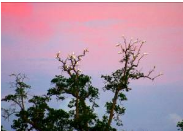
Philippine Cockatoos at night roost on Rasa Island

After dark, we landed on the south side of the island, and managed to tape in and see a fine Mantanani Scops-Owl. 3-4 other birds were heard calling.