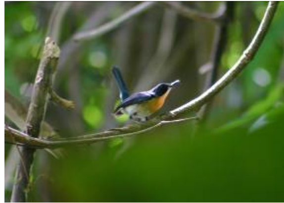
Palawan Blue Flycatcher

On the way back we saw a single Hill Myna , an increasingly rare bird, unfortunately, due to the pet trade.