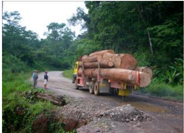
One of the many logging trucks in PICOP

We were accommodated in Bislig, and went around to different parts of the large forest area in a jeepney for the next three days. We were rewarded by an incredible luck, and managed to get virtually every single bird species of the area we had hoped for.