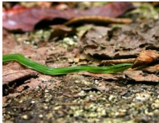
Snake in PICOP, Mindanao