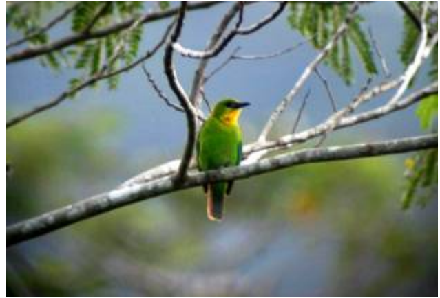
The Palawan endemic Yellow-throated Leafbird