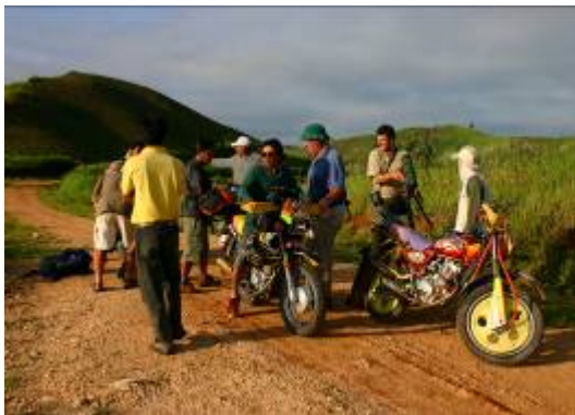
Motorcycle ride to Mt. Sinaka