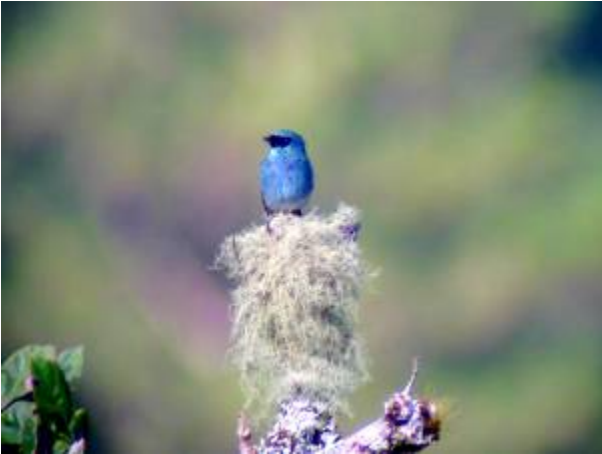
Mountain Verditer Flycatcher