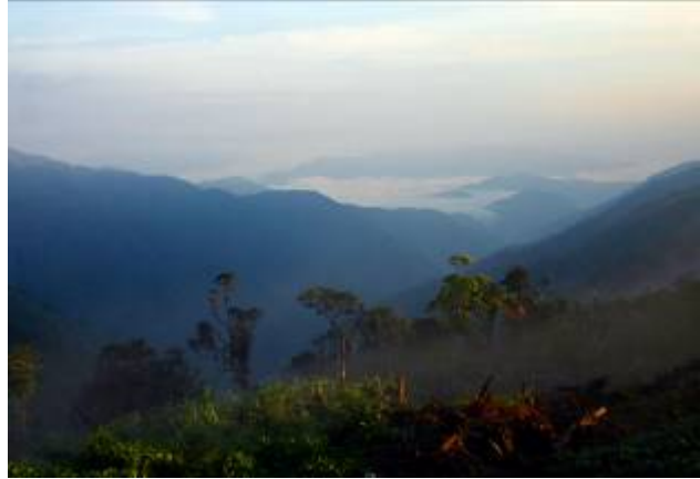
Mt. Polis scenery

Later in the morning, we continued birding along the asphalt road leading down along the north side of the mountain. Bird life was rich here, and the road gave good opportunities to see them at eye level or from above. Good mountain birds were, among others, Green-backed Whistler , Mountain White-eye , Chestnut-faced Babbler , White-cheeked Bullfinch , Metallic-winged Sunbird , Island Thrush , Citrine Canary-Flycatcher , Mountain Verditer-Flycatcher and Blue-headed Fantail . We heard the enigmatic Whiskered Pitta calling from a distant valley, and in the river deep below at the village of Bay-yo we scoped four Luzon Water Redstarts sitting on rocks in the rushing rapids. Over the mountain top a Mountain Racquettail was racing by, and we saw a local breeding pair of European Buzzards (Japanese subspecies), and a Philippine Serpent-Eagle . We spent some time listening to singing Benguet Bush-Warblers in open pine-forest grassland, but never managed to see any birds.