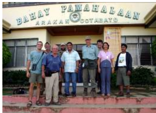
Meeting with the mayor