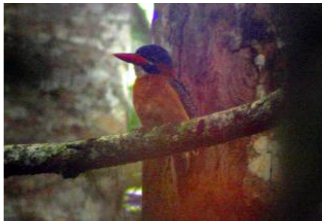
Bluecapped Wood-kingfisher at nest-site

A bit further up, a fine male Apo Sunbird showed up. And Tim’s trained ears heard the call of a most wanted bird: the incredible Apo Myna , endemic to a few mountain tops of Mindanao. Adam soon discovered the flock of five birds sitting in the top of a dead tree in the valley below. One of Asia’s most spectacular mynas, with its long tail, large crown and big yellow eyering, was admired through the scope.