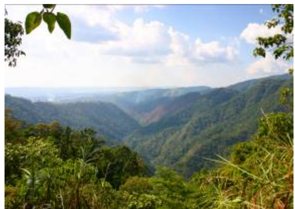
Scenery from Hamut Camp