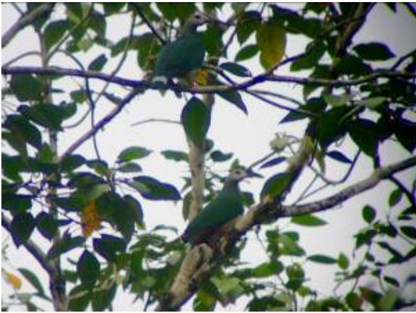
Pink-bellied Imperial Pigeon

After we had missed the bird on Mt. Kitanglad, we had no other choice. Our only chance was a visit to Mt. Sinaka in central Mindanao on the very last birding day of the trip!