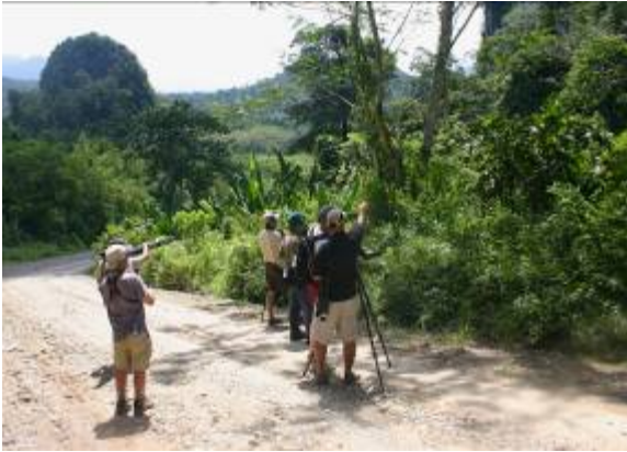
Birding along the road in Palawan forest