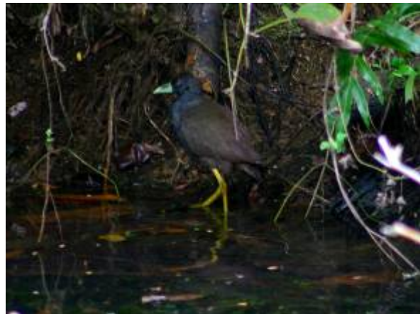
Plain Bush Hen

At Bislig airport a huge, approaching storm system (with thunder, rain and strong winds) threatened, but never hit us. Hunting Australasian Grass-Owl was finally spotted, well done Tim,