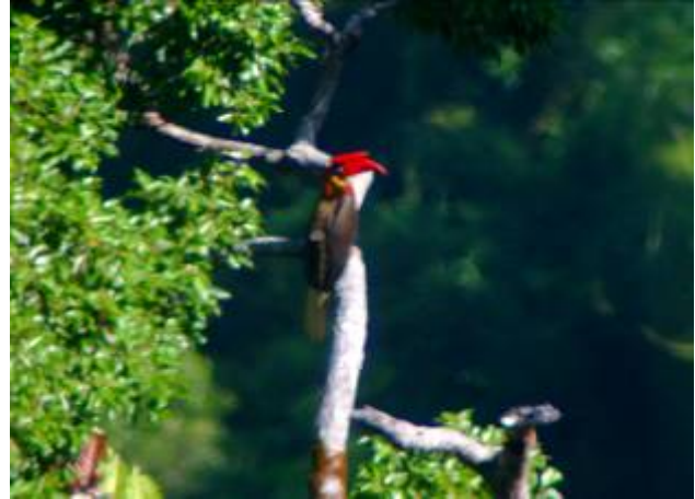
The stately Rufous Hornbill in Northern Sierra Madres Mts.