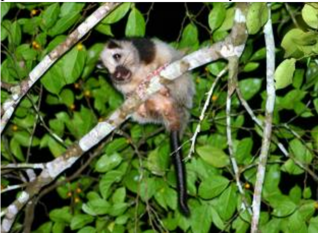
Northern Luzon Slender-tailed Cloud Rat

During the walk we saw a beautiful pair of Pied Harriers close by in the glowing afternoon sun, possibly a breeding pair. Other grassland birds were Tawny Grassbird , Striated Grassbird , Spotted Buttonquail , Buff-banded Rail , Golden-headed and Zitting Cisticolas and Oriental Skylark . At the village near Camp 1 Shack, Adam and Hoddinott were lucky to see a flock of the rare, endemic Green-faced Parrotfinch . This species had an irruption year in 2004 that we probably did benefit a bit from. Best observation in Camp 1 was after dark at bedtime, when a Northern Luzon Slender-tailed Cloud Rat was found climbing in a tree right above our tents. This Luzon endemic, red-listed mammal is very rarely seen, being strictly nocturnal. Fine digital pictures and video were obtained by Shack and Adam. Unfortunately, Tim was already fast asleep.