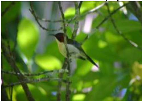
Lovely Sunbird – endemic to Palawan

We left Puerto Princesa at ten to six in the morning, and drove towards Sabang straight across the narrow island to the coast on the north side. During our drive to Sabang we passed through good primary and secondary forest, and made a number of rewarding stops. Good views of no less than eight Palawan endemics Palawan Flowerpecker , Lovely Sunbird , Yellow-throated Leafbird , the lovely Palawan Tit , Sulphur-bellied Bulbul , 5 Palawan Hornbills , the magnificent Blue Paradise-Flycatcher and a pair of Palawan Blue-Flycatchers . A pair of Oriental Hobby plus a third chased each other in display over the forest road.