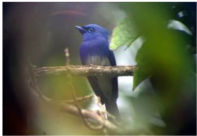
Short-crested Monarch, male. In Picop. One the fine, endemic birds of the Philippines

Another surprise was a calling Mindanao Bleeding-heart close by road, but we never managed to see the bird. The day also gave good views of Pompadour Green-Pigeon on the nest, feeding young, Pink-bellied Imperial Pigeons , Blue-naped Parrots , Black-faced Coucal , Steere's Pitta heard, Yellow-wattled Bulbul , Black-headed Tailorbird , Blue Fantail , two Short-crested Monarchs , Brown Tit-Babbler , Metallic-winged Sunbird , Handsome Sunbird , an aberrant local subspecies of Pygmy Flowerpecker , Everett's White-eye , Philippine Oriole , Coletto – and a group of Long-tailed Macaques .