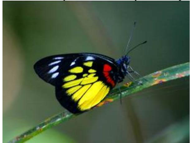
Butterfly in Luzon