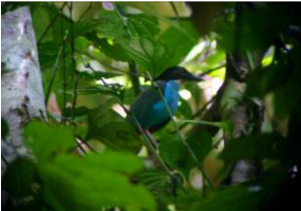
Steere's Pitta, Bohol

We returned to our hotel, after a great day.