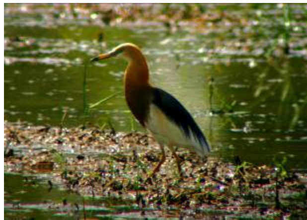
Javan Pond Heron in breeding plumage, Mindanao