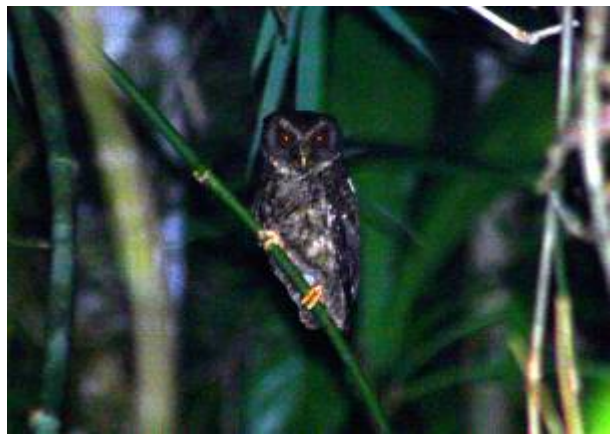
The Palawan endemic Palawan Scops Owl