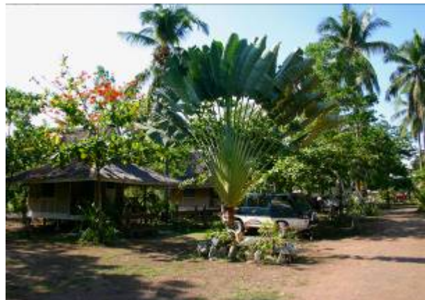
Palawan Hotel in Narra

Wednesday May 25 th : Palawan, early morning drive from Narra to Puerto Princesa, with stops along the “Zig-zag Road” and Napson Road. Flight 10.40 am. from Palawan to Negros, via Manila.