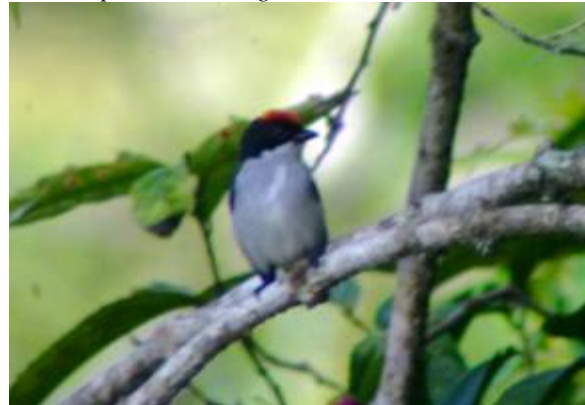
Flame-crowned Flowerpecker at the campsite