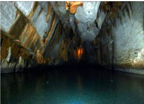
River Tunnel in Underground River N.P.