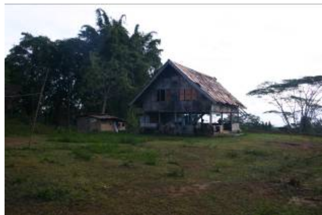
Our camp on Mt. Kitanglad