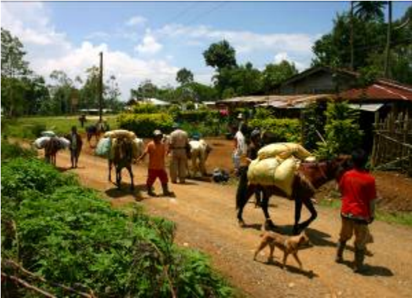
Getting ready for the hike to Mt. Kitanglad