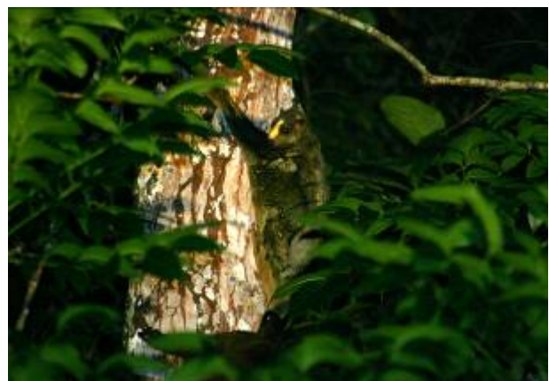
The flying Lemur of the Philippines, the Colugo. At Rajah Sikatuna N.P., Bohol