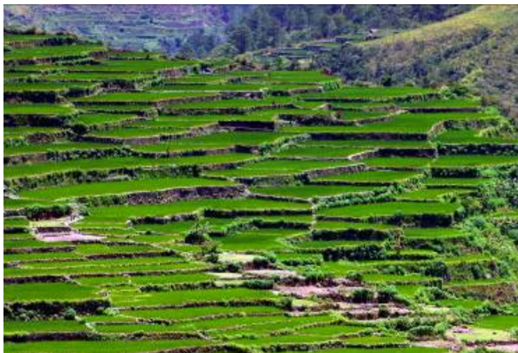
Terraces at Mt. Polis

The day was very productive. Our last target bird was the rare Flame-crowned Flowerpecker , and after waiting some time at a roadside fruiting tree our patience was rewarded by a brief visit to the tree by fine male. At 17.45 we drove down the mountain, and spent the night at the hotel in Banaue, after an excellent birding day.