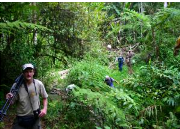
Mt. Kitanglad hike