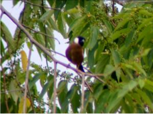
White-cheeked Bullfinch on Mt. Kitanglad