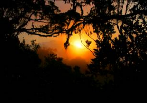
Sunrise at Mt. Polis

them. We walked back through some cabbage fields, and encountered a family group of the endemic Mountain Shrike , and a Pechora Pipit walking on the ground.