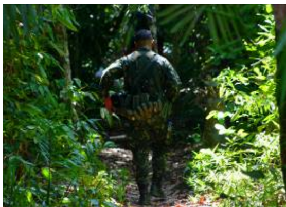
Military patrol on Mt. Sinaka