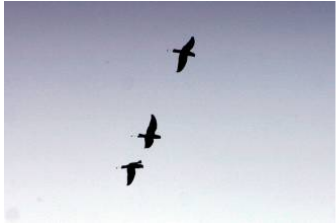
Mindanao Montane Racquet-tail