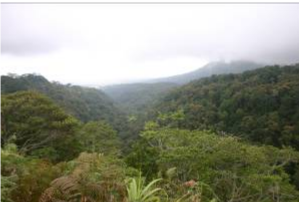
Forest of Mt. Kitanglad