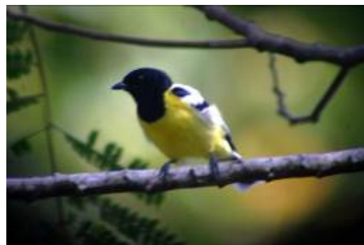
The endemic Palawan Tit