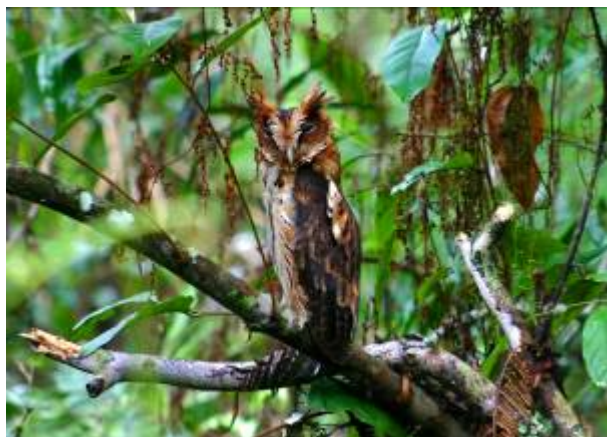
The incredible Giant Scops Owl on Mt. Kitanglad

Walking through the mossy forest, Hoddinott suddenly hushed us carefully, and whispered: “Everybody quiet! There is a beautiful owl sitting in the open on a low branch just next to us”! And so there was. An amazing Giant Scops-Owl , looking at these strange intruders through its half-closed eyes.