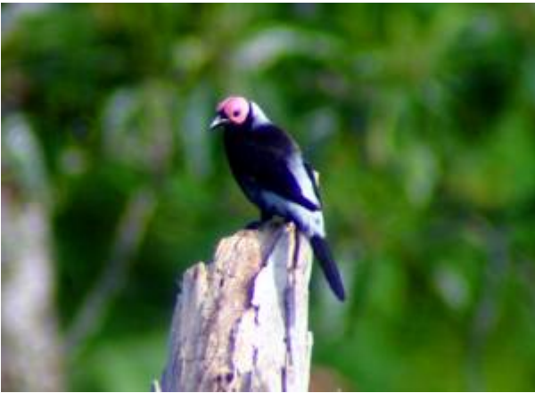
The strange-looking starling Coletto

It became a very hot and quiet day. Birding was a little slow. Along Road 4.2 we saw the best bird of the day, a fine male of the endemic Little Slaty Flycatcher on its territory.