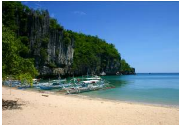
Scenic beach at Underground River N.P.