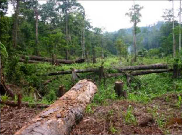
Deforestation in PICOP