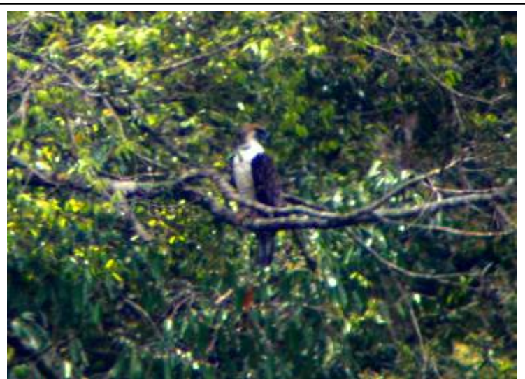
Great Philippine Eagle