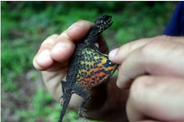
Flying Lizard in Mindanao lowland jungle, Bislig