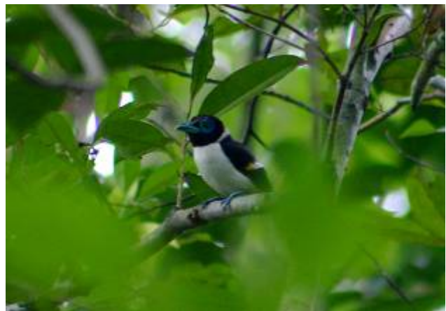
The stunning Mindanao Wattled Broadbill in PICOP, Bislig

Other nice birds of the morning was a stunning Rufous-ored Kingfisher , Green Imperial-Pigeon , Blue-crowned Racquettail , Philippine Trogon , Bar-bellied Cuckoo-shrike , Yellowish Bulbul , Short-crested Monarch heard, Philippine Fairy-Bluebird and Coletto .