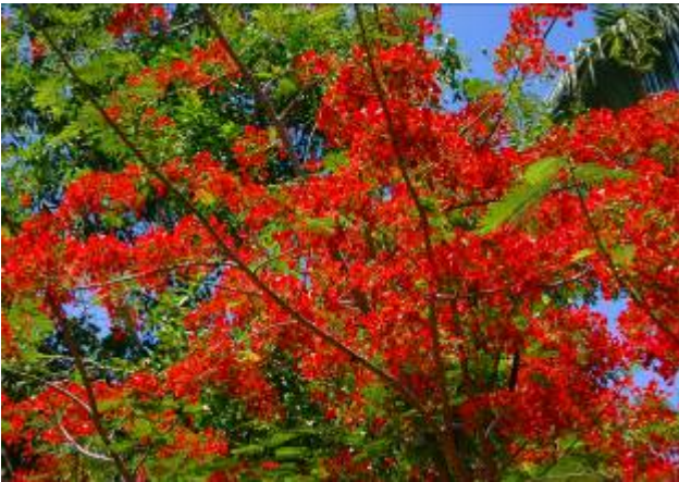
Flame of the forest tree on our way to Bislig, Mindanao

We checked in at a small, pleasant hotel in Bislig.