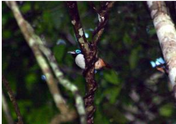
Visayan Wattled Broadbill, Bohol