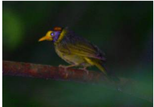
The magnificent Flame-templed Babbler, Negros

Friday May 27 th : Bohol. Flight from Negros to Cebu and ferry to Bohol. Late afternoon visit to Rajah Sikatuna National Park.