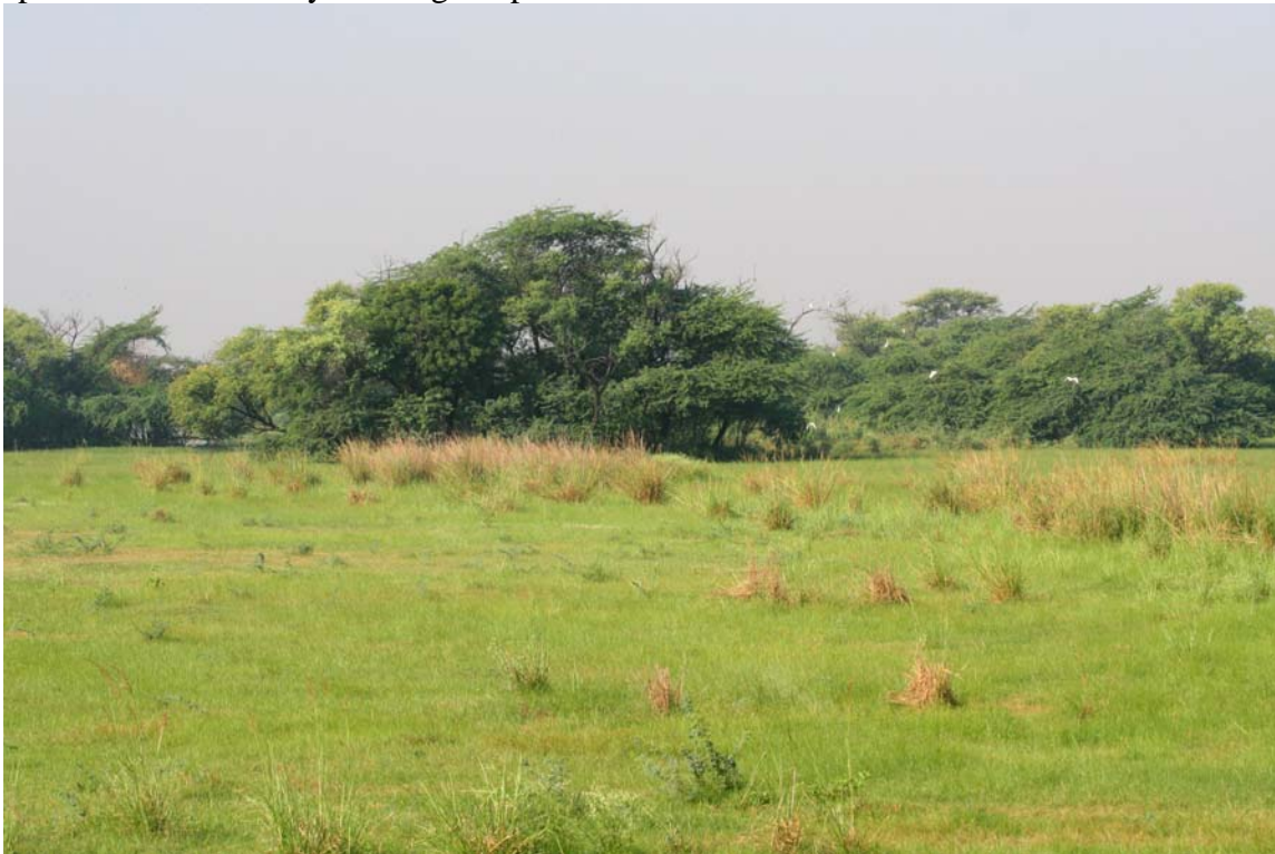
View over Sultanpur

Sultanpur is a wetland to the west of Delhi. Driving time from Gurgaon is at least one hour, but as everywhere in Delhi it is entirely dependant on the traffic (which is virtually always very bad!). I spent 3.5 hours slowly walking the perimeter of the wetland.