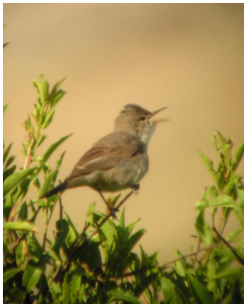
Upcher's warbler, Durnalik valley

We saw all target species here including Kurdish wheatear in the so called lunar landscape. It is possible to drive all the way up here by following a road that passes the valley entrance. Go further up and take the first road to the right. You will now have the valley to your right and a small hill to the left. Walking along the road on the far side of the hill produced the wheatear. Birds worth mentioning here were two Desert finches in the upper end of the valley, both Rock nuthatches, many Pale rock sparrows and Cinereous buntings.