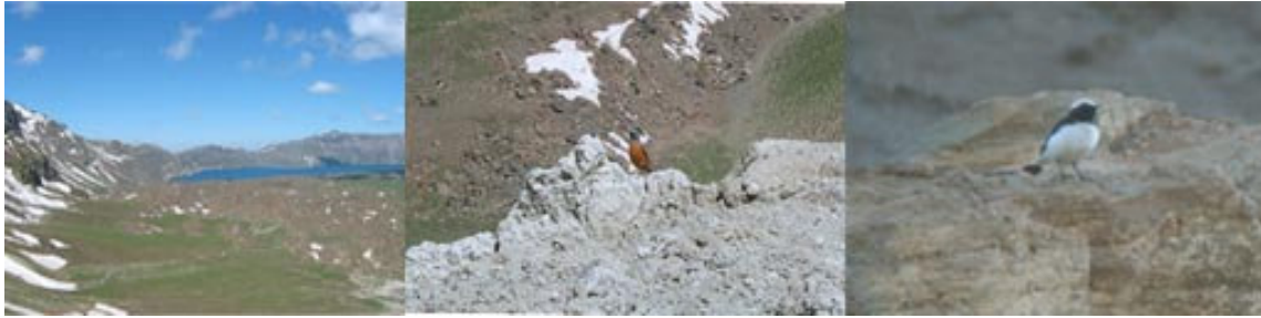
Nemrut Dagi crater, Rufous-tailed rock thrush, Finsch's wheatear

good species e.g. Red-fronted serin (close to the big crater lake), Finsch's wheatear and Radde's accentor. In the crater we were stopped by the military but they only wanted to show us the greatness of the Nemrut Dagi including a guided tour (free of charge) to the volcano chimneys.