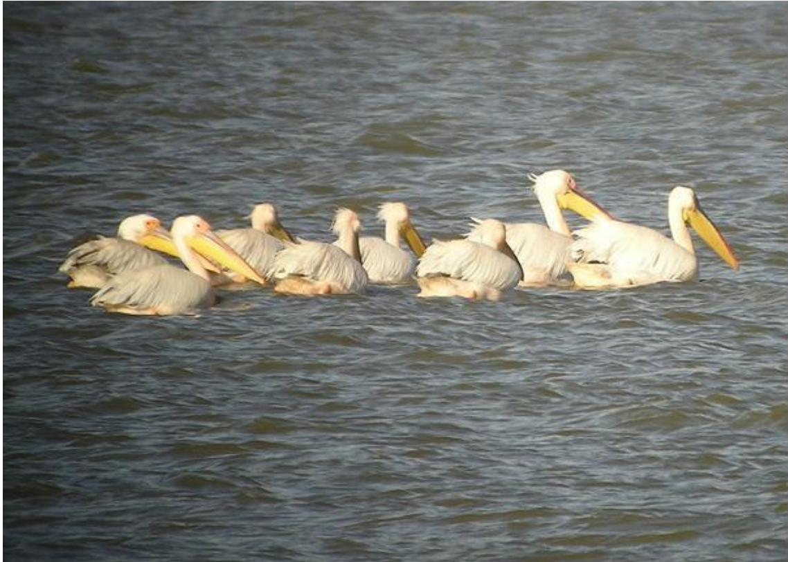
Great White Pelicans Aktas Gölü 26 th May 2006