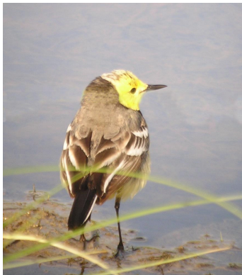
Citrine wagtail between Oltu and Erzurum

We left Oltu at 5 am heading for Erzurum, Gelinkaya and finally Sivrikaya. A quick stop in the morning sun just south of Oltu gave Quail and Rose-coloured starling. We drove over a mountain area and at the pass Kirecli Gecidi we stopped and immediately had a Radde's accentor and also an Alpine accentor. Along the road in some pools we saw Citrine wagtails and also closer to Erzurum we had two roadside Lesser grey shrikes, the only we saw during the trip.