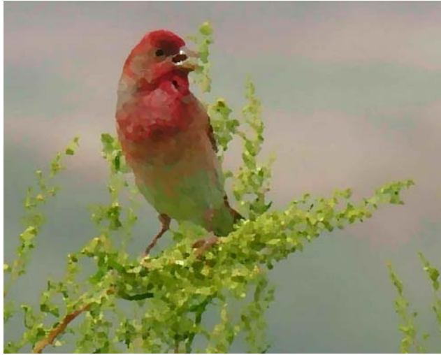
Carpodacus rubicilla (rubicilla) - Great Rosefinch – Stor Karmindompap 14/7 3 May Saz.