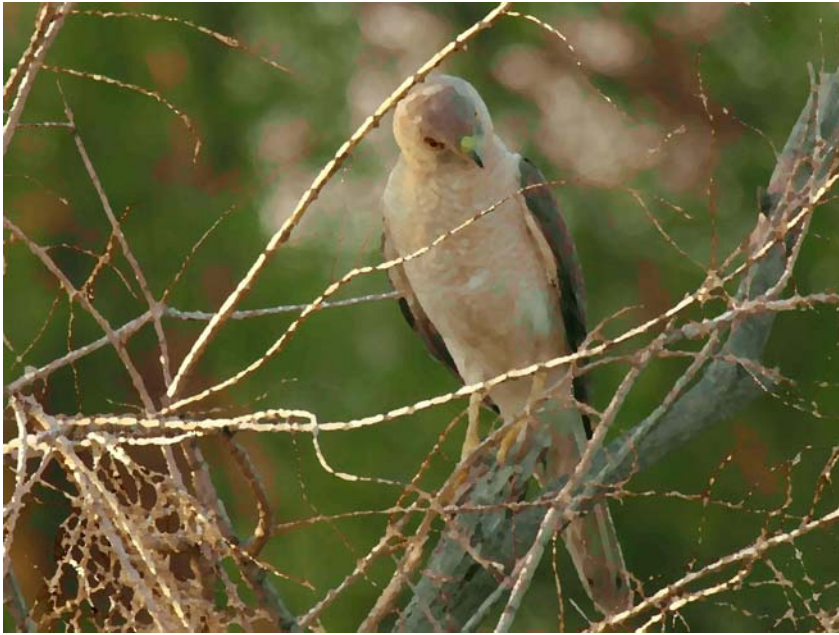
Accipiter badius cenchroides [includes chorassanicus ] – Shikra - Shikra 6/7 3 Konchangel - Turenga Forest, 7/7 8 Turenga Forest - Ili River - Karaoi, 8/7 5 Karaoi (Qaraoy) and 9/7 6 Karaoi (Qaraoy) - Kapshagai (Qapshaghay).