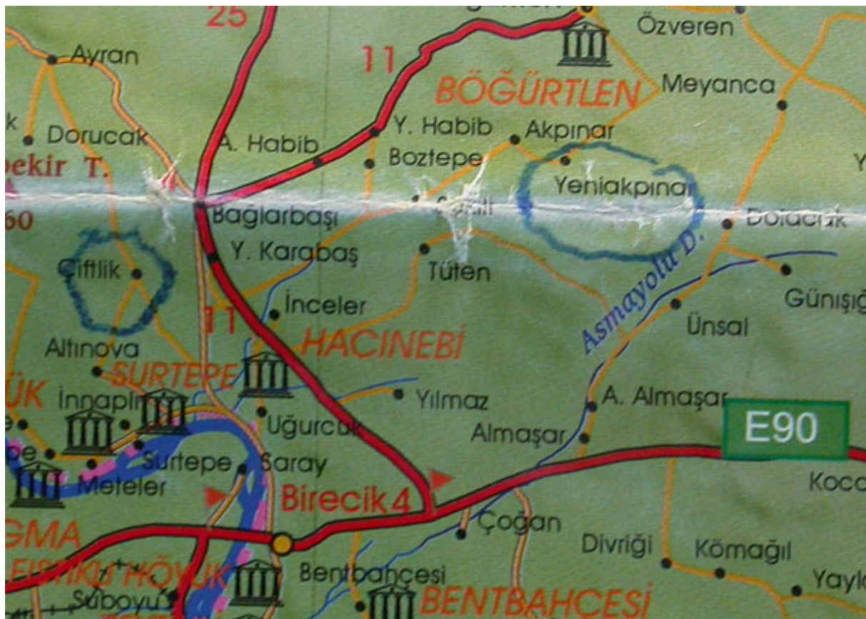
Map of Birecik and surroundings. The roads marked with red are larger tarmac, orange with black borders are smaller tarmac and the roads marked with plain orange are dirt roads.