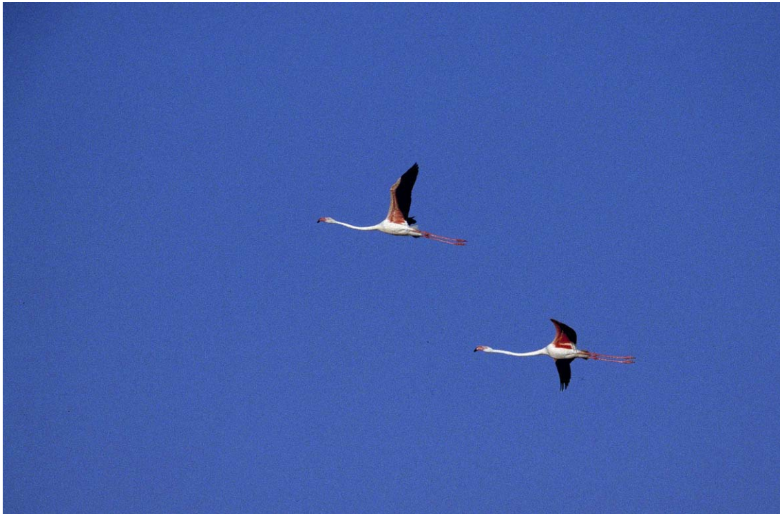
Greater Flamingos, Kulu Gölü, June 2005.

26 at Sultan Marshes northern parts 14.6, 3 at Col Gölü 14.6, 540 at Lake Nigde 15.6, 3000 at Kulu Gölü 16.6, 1 at Köpek Gölü 16.6