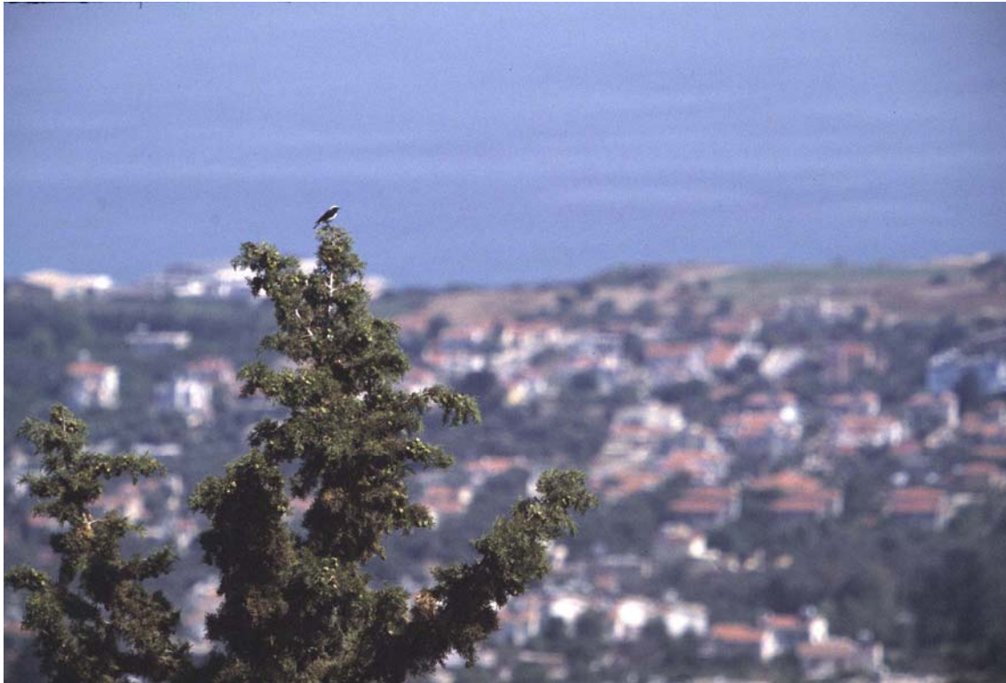
Cyprus Pied Wheatear, Bellapais Monastery, June 2005.

The cost for the two-way ferry was 90 TL per person. At Girne you'll have to pay taxes (two different). In total there is something like 16,5 + 3,5 TL per person.