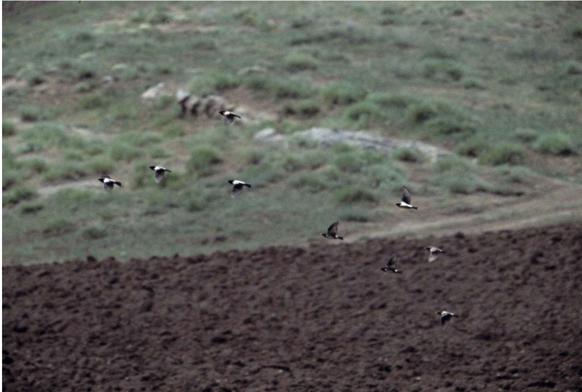
Rose-coloured Starlings, SW of Sivas, June 2005.