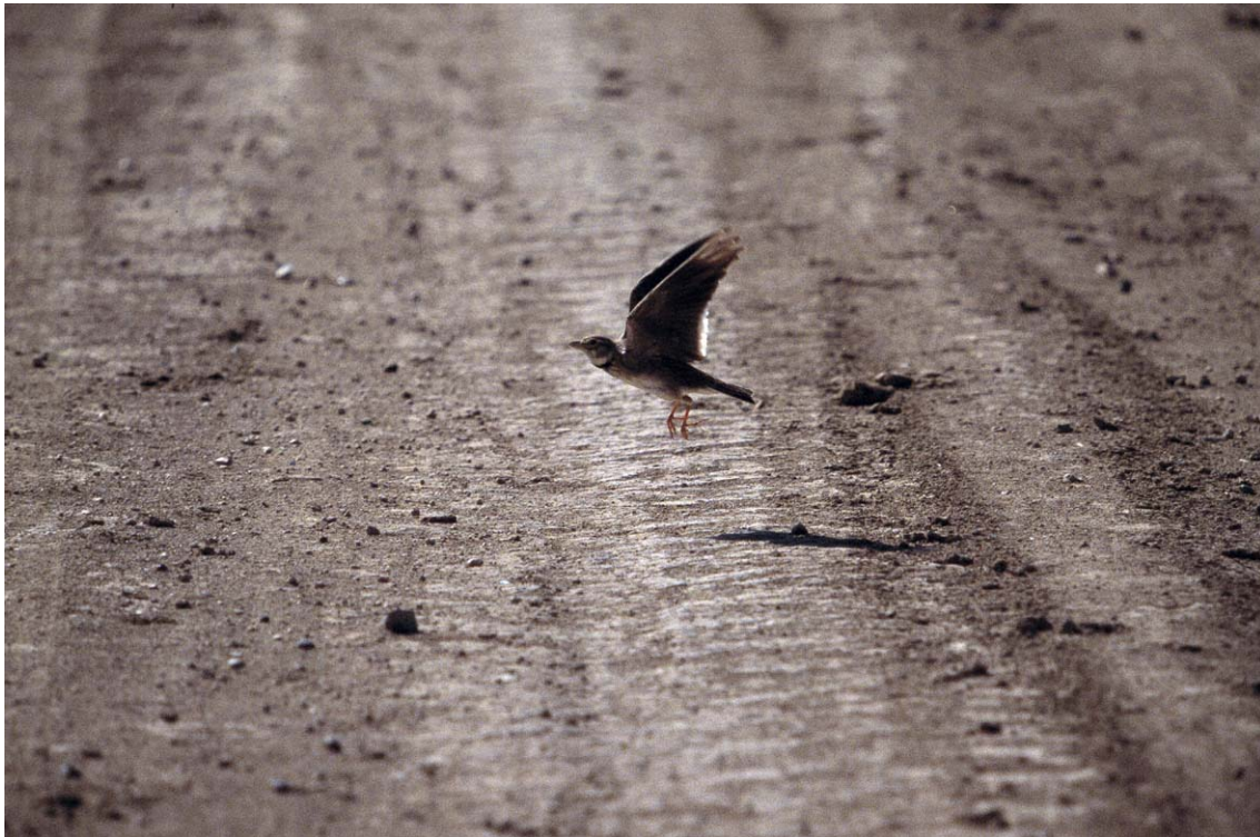
Calandra Lark, Kulu Gölü, June 2005.

1 pair + 4 pull Scops Owl Café, Birecik 9.6