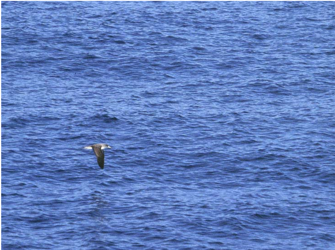
Scopoli's Shearwater, S of Tasucu, June 2005.

Between Akeski town and old site, you're passing a rubbish dump on you right hand side. Around here we found a few Cretzschmar's Buntings (A species that was surprisingly hard to find throughout the trip). Here also Rüppell's Warbler and Western Rock Nuthatch.