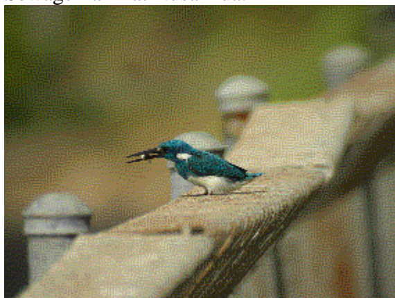
Small Blue Kingfisher

One at Mimpri Resort near Bali Barat, one near Labuhan Lalang and about 20 at Celu Sewage Farm at Nusa Dua.