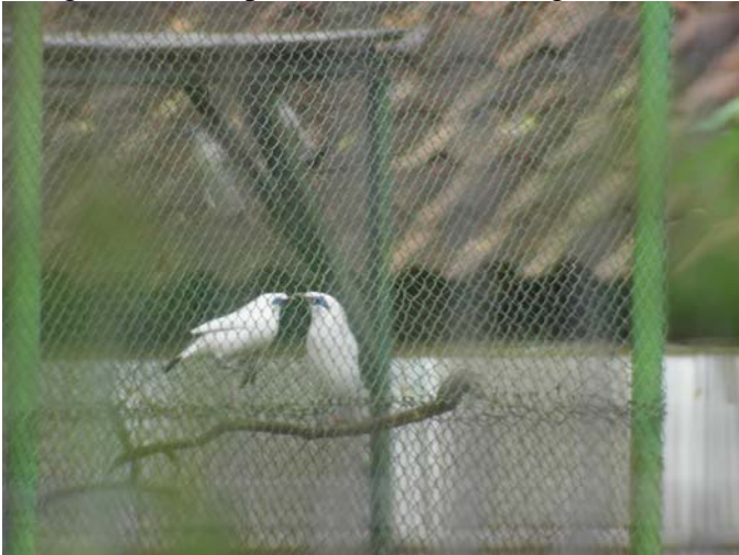
Captive Bali Mynas at the breeding centre

It is probably only a matter of months or possible a couple of years before this species faces the same destiny as the Spix's Macaw, i.e being classified as "Extinct in the wild". To see the species at the breeding centre and realize what a beauty it is and at the same time think about the world being an inferior place when it is soon gone extinct was a more than sad experience.