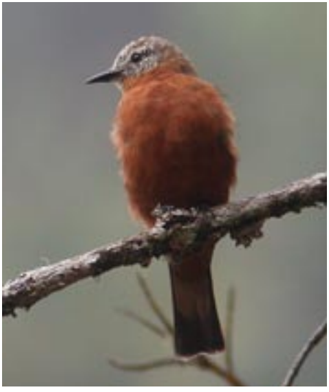
Cliff Flycatcher at Yurimaguas road.

Alder FlycatcherEmpidonax alnorum1 seen at Morro de CalzadaEmpidonaxes are notoriously dificult to identify but this is the only one recorded in Peru.