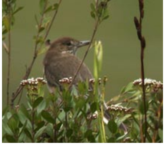
White-tailed Shrike-tyrant near Cruz Conga