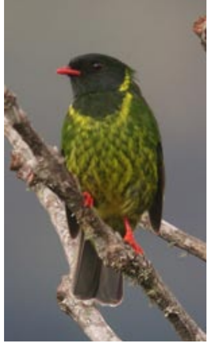
Green-and-black Fruiteater at Abra Patricia

Slaty-capped FlycatcherLeptopogon superciliarisSingles seen daily at Abra Patricia/Afluentes and 1 at Yurimaguas road