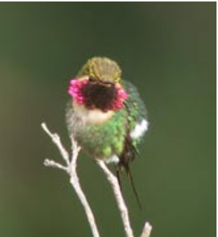
Little Woodstar at el Limon

Scarlet-backed WoodpeckerVeniliornis callonotus2 seen at Rafan, 2 seen at Quebrada Limon and 1 at the Guan-centre