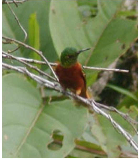
Chestnut-breasted Coronet at Abra Patricia