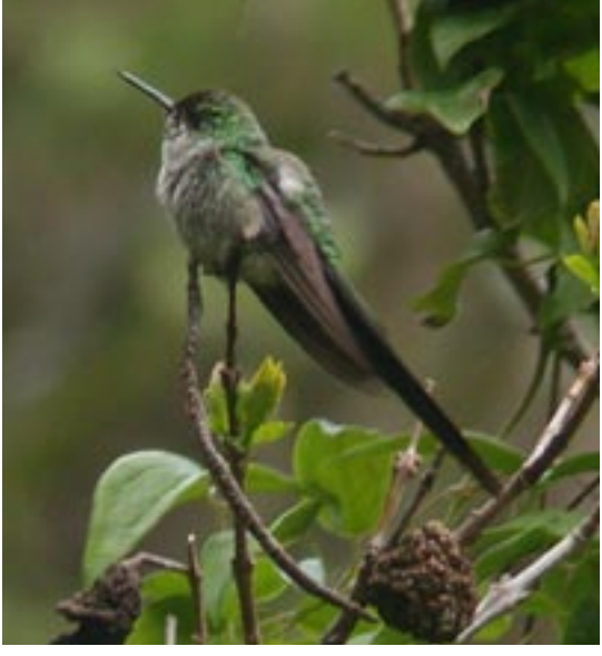
Male Gray-bellied Comet. A rare and rangerestricted Peruvian endemic.