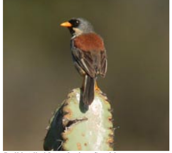
Buff-bridled Inca-finch at San Marcos

Saffron FinchSicalis flaveolaCommon in the Tumbesian and Maranon parts and 1 seen at Juan Guerra and 1 in Tarapoto