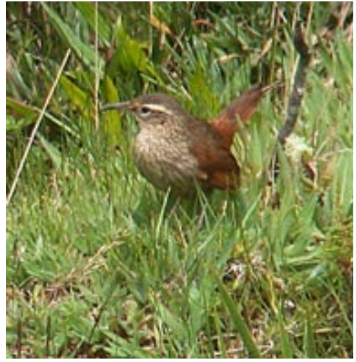
Striated Earthcreeper near Cruz Conga

Dark-breasted SpinetailSynallaxis albigularis3 seen at the LSU trail at Abra Patricia, singles heard at Yacumama and Morro de Clazada.Unusually high for this species at Abra Patricia